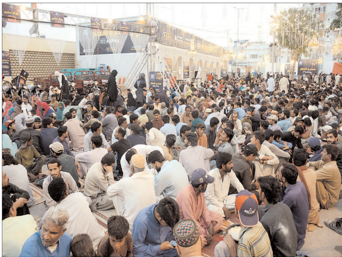
KARACHI: People are waiting to break their fast during holy month of Ramazan at Numaish Chowrangi.

"We believe that the regional and extra-regional capacities of the ancient Nowruz Eid have not yet been fully realized, and this issue doubles the need for the relevant institutions to play a role in the countries that organize this beautiful tradition. In this framework, the 'Islamic Culture and Communication Organization' as the guardian of the cultural diplomacy of the Islamic Republic of Iran, considers it necessary to identify and strengthen the current capacities in the Nowruz tradition as a tool for the civilizational and religious solidarity of the countries," he said.