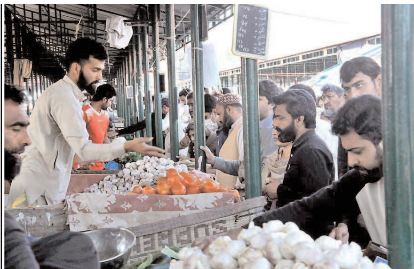
ISLAMABAD: People purchasing vegetable during holy fasting month of Ramadan at sasta bazar in Federal Capital.

integration between the countries of the region. The minister said that Kazakhstan had recently completed constitutional and political reforms and within ten months the process of reforms and elections was completed. He said that after these constitutional reforms in Kazakhstan, the atmosphere for economic and investment would be smooth, from which a new face of Kazakhstan would be seen. Free and fair elections in Kazakhstan will start a new democratic era in the country and it will have a positive impact on investment and economic inclusion in the country, he added.