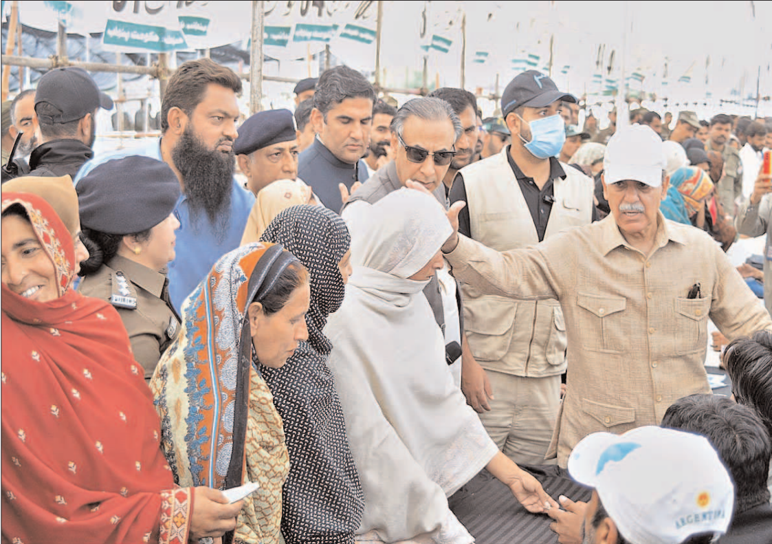
MULTAN: Prime Minister Muhammad Shehbaz Sharif visits free flour distribution center at Sports Ground as part of Prime Minister Ramazan Relief Package for deserving families.

They said that 20000 Atta bags of 10 kilograms would be distributed among the poor and over 6500 bags had already been distributed by mid-day, today. They said that sheds were set up for the people and adequate arrangements for drinking water were in place. The officials also briefed the prime minister on Ramazan Package and arrangements made for its implementation. Earlier, the prime minister had also visited wheat flour centres at Bahawalpur where he reviewed arrangements for free Atta distribution and witnessed the process. The prime minister while appreciating the arrangements made at flour distribution points in Multan and Bahawalpur said that similar good arrangements should be made in other districts of the Punjab province.