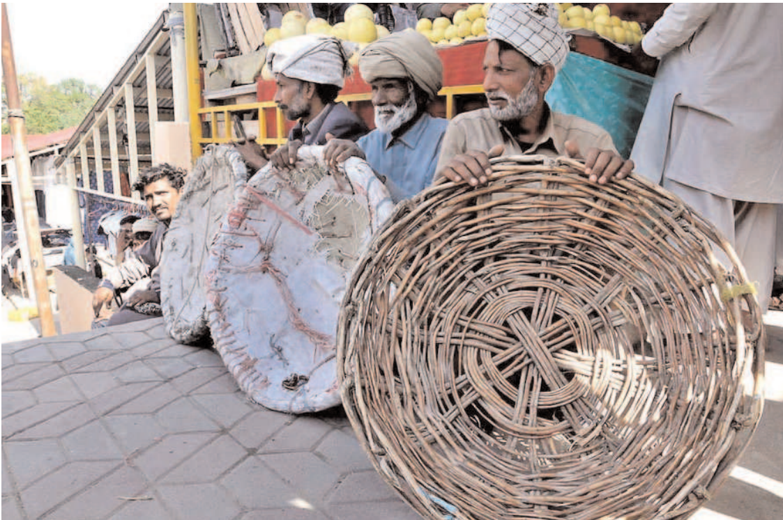
ISLAMABAD: Labourers waiting for customers at sasta bazar during holy fasting month of Ramadan in the Federal Capital.