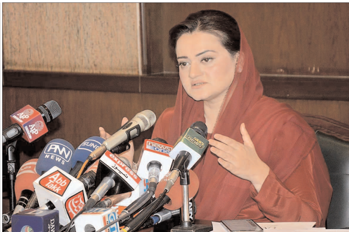
LAHORE: Federal Minister for Information and Broadcasting, Marriyum Aurangzeb addressing a press conference at Model Town.

Earlier, Muttahida Qaumi Movement-Pakistan decided against attending all parties conference (APC), summoned by Pakistan People's Party (PPP) on March 18 to discuss reservations over digital census. MQM-P did not attend the APC – summoned to discuss reservations over digital census – due to its 'power show', scheduled for March 18 at Karachi's Bagh-e-Jinnah.