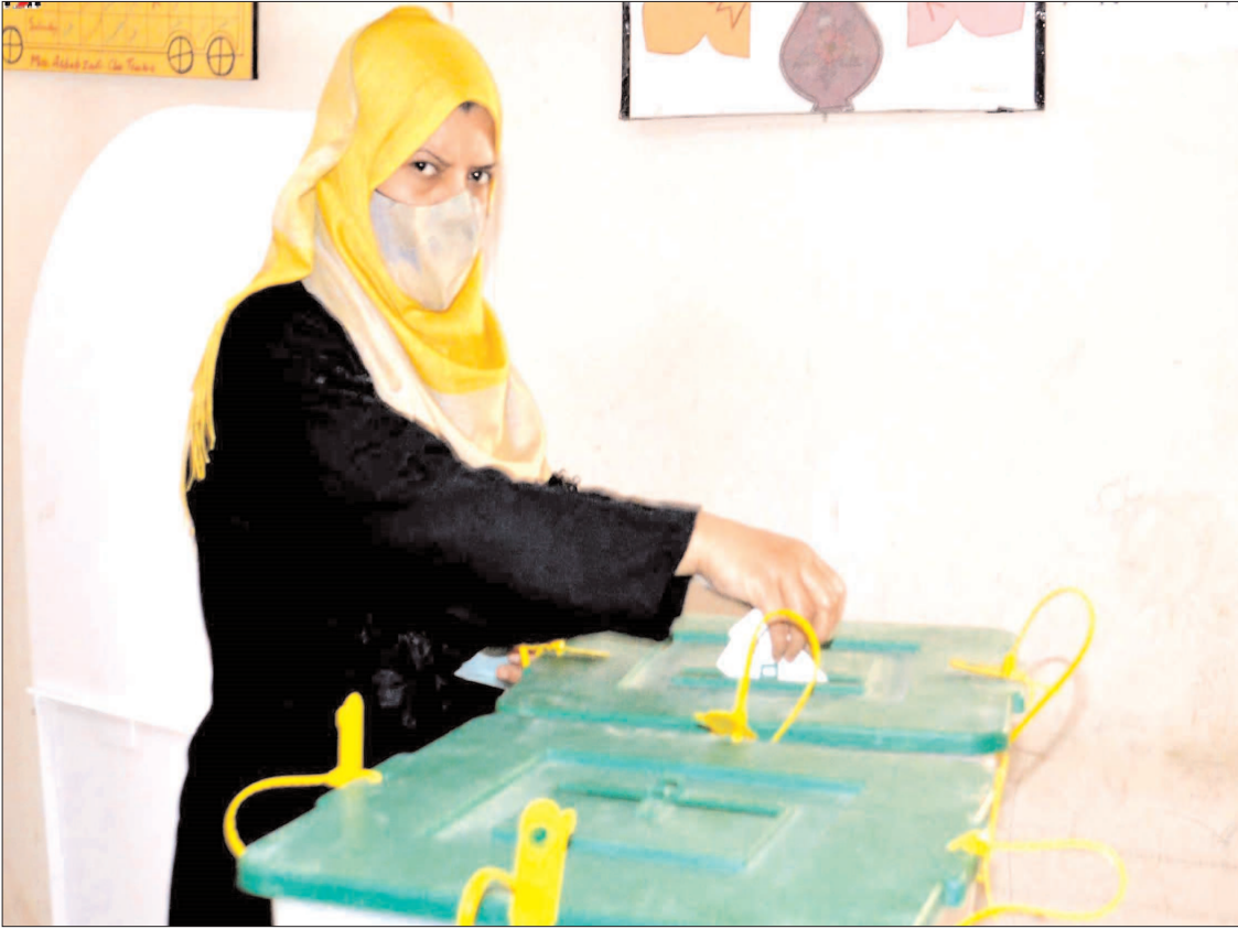
HYDERABAD: A women cast her vote during the by-election in union council 28 in Hyderabad.