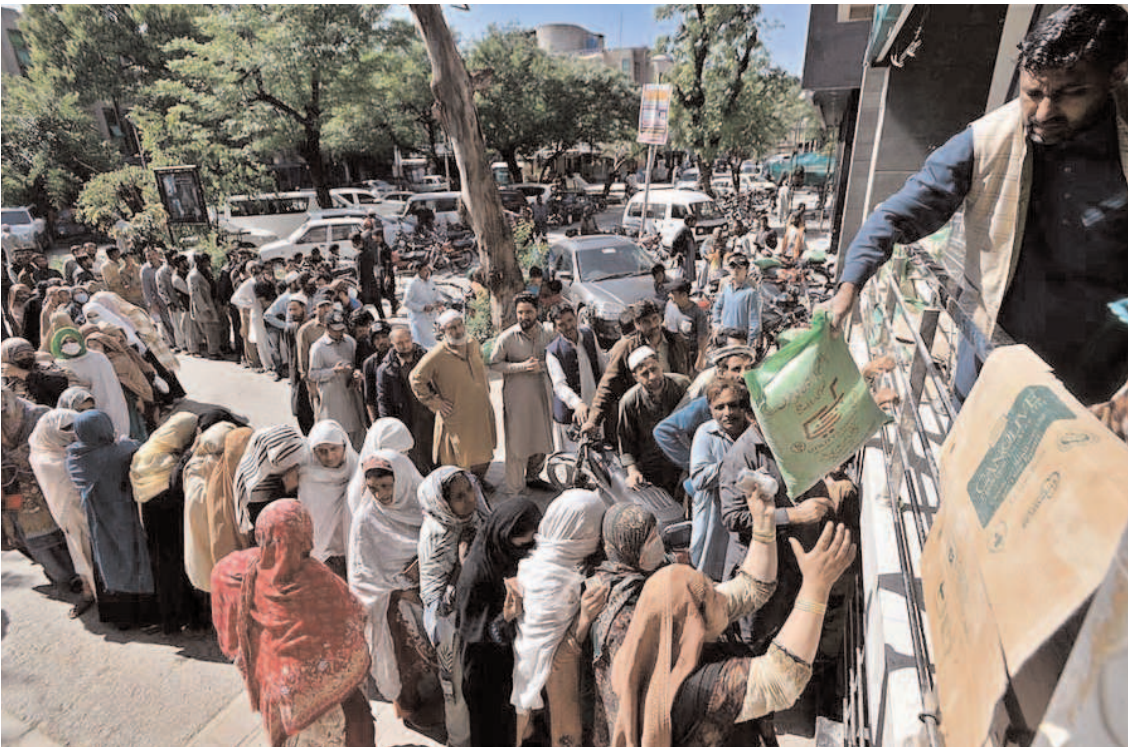
ISLAMABAD: People standing in a queue for purchasing 10kg flour bags outside utility store at Sitara Market.

We cordially invite the media and the audience to join in on an evening full of adventure stories, Pakistani culture and the candid look into the phenomenal story of Flying Between Giants.