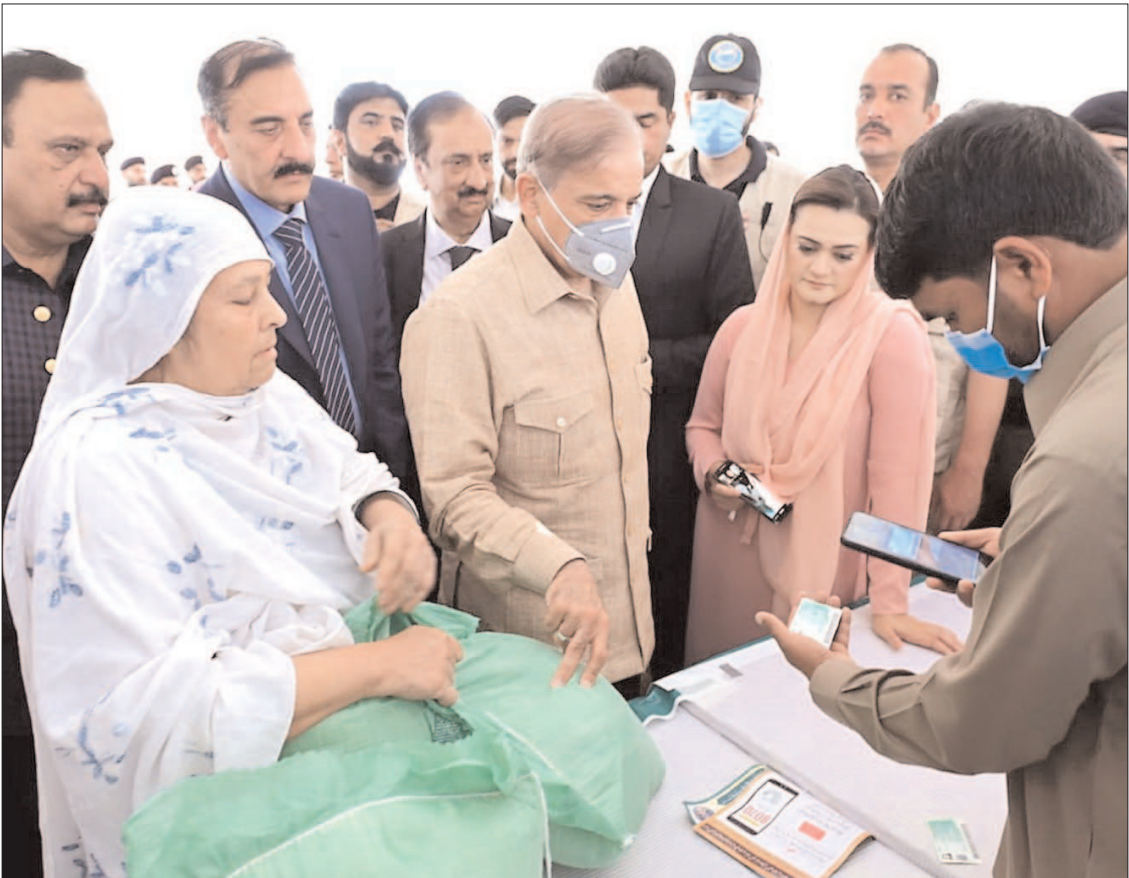
RAWALPINDI: Prime Minister Shehbaz Sharif visits free Atta distribution points established under PM's Ramadan Package for deserving families.

Imran's graft to be exposed with full force, says Maryam