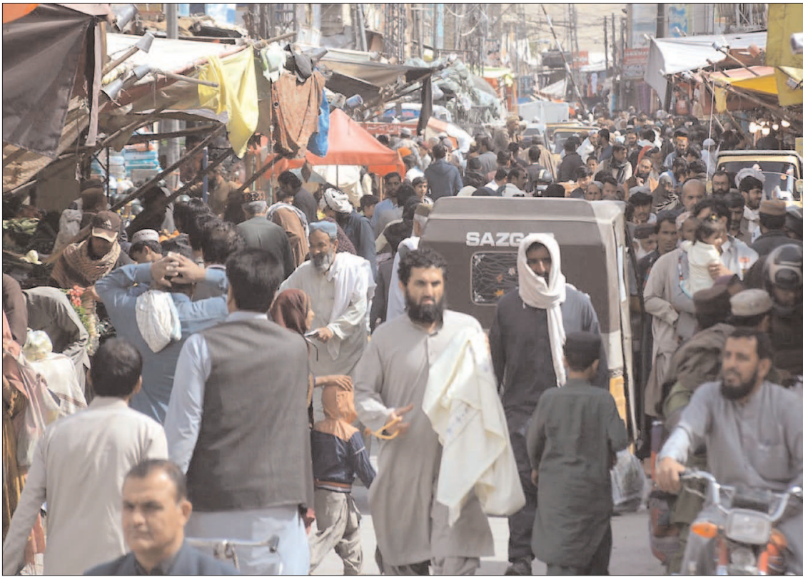
QUETTA: A large number of people a local market before Ifar time to buy various items.