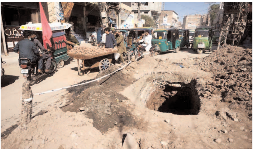
PESHAWAR: An under construction work, which was stopped due to unknown reason at Gulbahar area, creating hurdles for commuters, needs attention of authorities concerned.