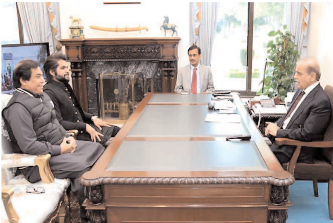
ISLAMABAD: Former Member National Assembly, Hanif Abbasi calls on Prime Minister Muhammad Shehbaz Sharif.