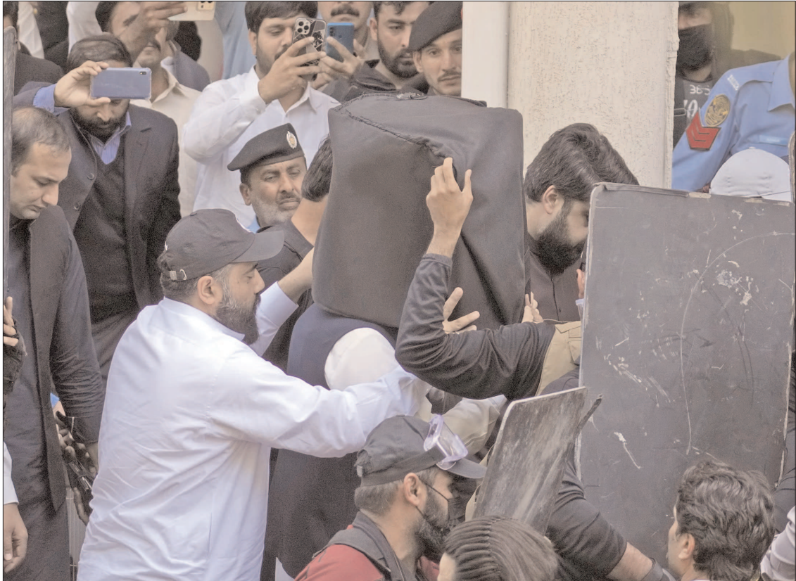
ISLAMABAD: Security personnel using bullet proof shields to protect PTI chief Imran Khan during his hearing at High Court.