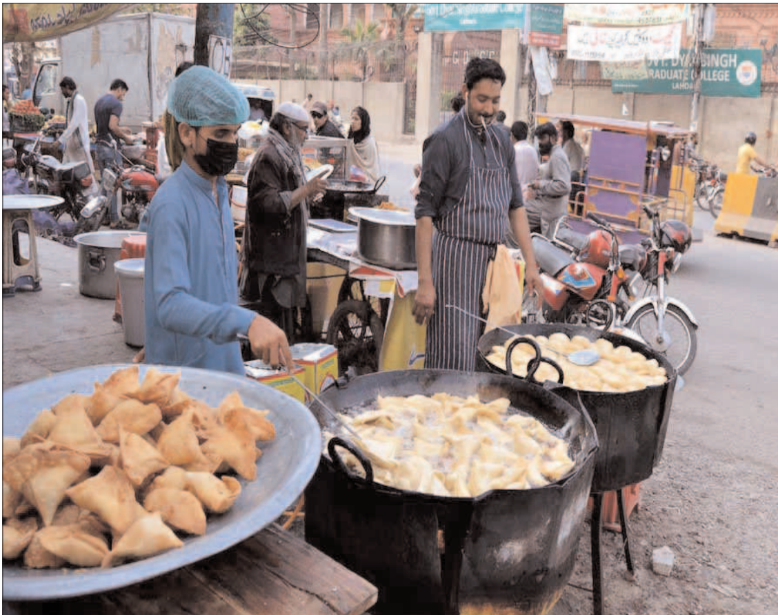
LAHORE: Workers are busy frying samosas for Iftar at Lakshmi Chowk during the holy month of Ramadan.

The CCPO Lahore further said that all units of Lahore Police should make further improvements in emergency response, traffic management, counter surveillance, crime control and service delivery through electronic evidence through CCTV cameras of PSCA. He said that the Punjab Safe Cities Authority's CCTV cameras had greatly helped police in the arrest of thieves, dacoits and dangerous offenders and court absconders with the use of face recognition and vehicle owner tracing technology.