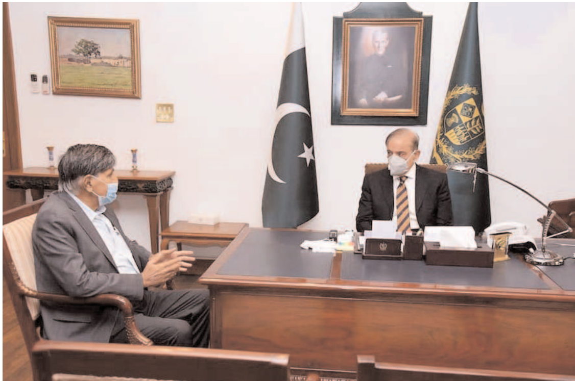
ISLAMABAD: Member National Assembly Aslam Bhootani calls on Prime Minister Muhammad Shehbaz Sharif.