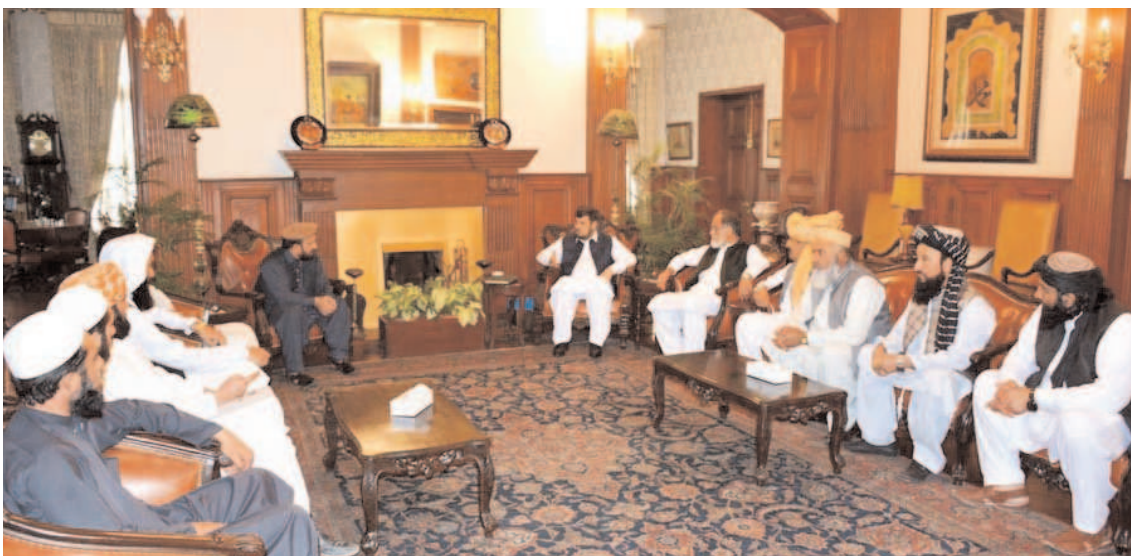
PESHAWAR: Governor Khyber Pakhtunkhwa Haji Ghulam Ali in a meeting with Mayors elected from tribal districts of province.