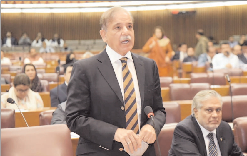
ISLAMABAD: Prime Minister Shehbaz Sharif addressing the National Assembly session.

The bill also grants the party the to appoint counsel of its choice for filing a review application under Article 188 of the Constitution. It should be noted that the counsel, for this purpose, shall mean an advocate of the Supreme Court. “An application pleading urgency or seeking interim relief, filed in a cause, appeal or matter, shall be fixed for hearing within fourteen days from the date of its filing,” the bill read.