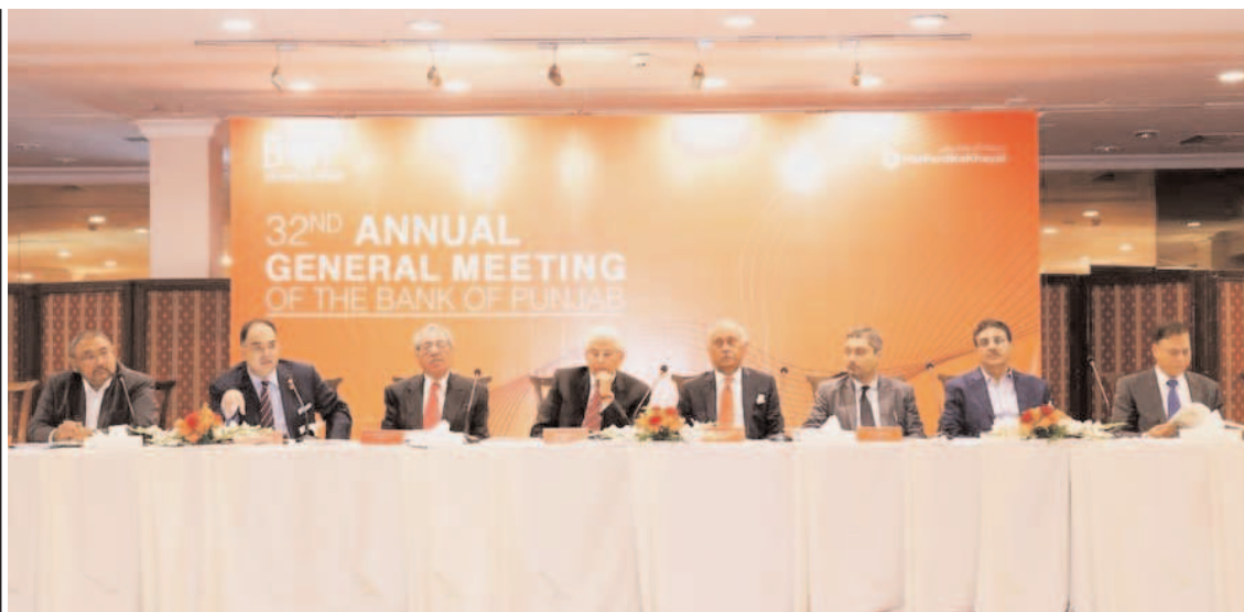
LAHORE: Members of Board of Directors of Bank of Punjab and Senior Management officials during 32nd Annual General Meeting.

In the end, the shareholders approved financial statements of the Bank for the year 2022 along with a Stock Dividend of 10.00% for shareholders. Further, appointment of M/s A.F. Ferguson, Chartered Accountants, as Bank's Statutory Auditors for the year 2023 was also approved by the shareholders along with other agenda items.