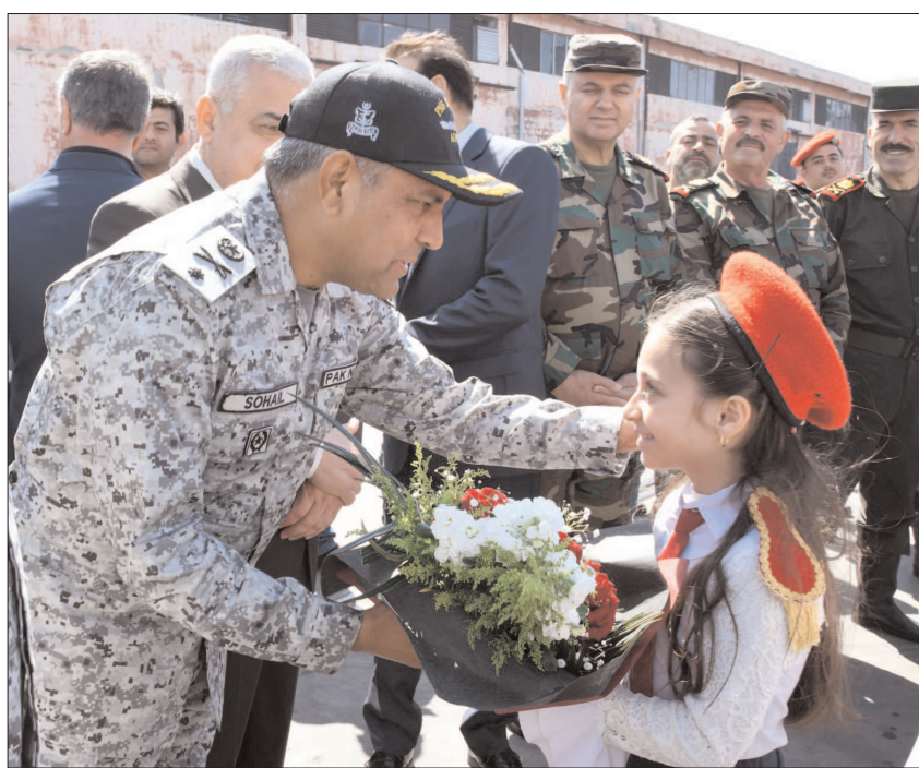
ISLAMABAD: Pakistan Navy mission Commander being warmly welcome at Port Lattakia Syria during Pakistan Navy Ship HADR mission.