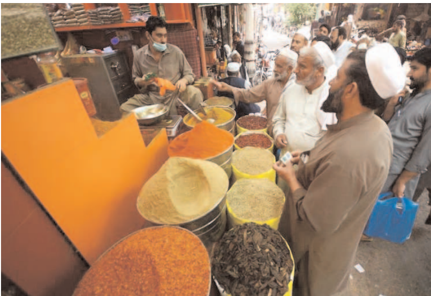
PESHAWAR: People buying chilies from a shop in Peepal Mandi.

According to a UoP official, more than 50 personnel of a private security company, the university's own security guards and police were responsible for security at UoP and now the security of University of Peshawar would be handed over to the police.