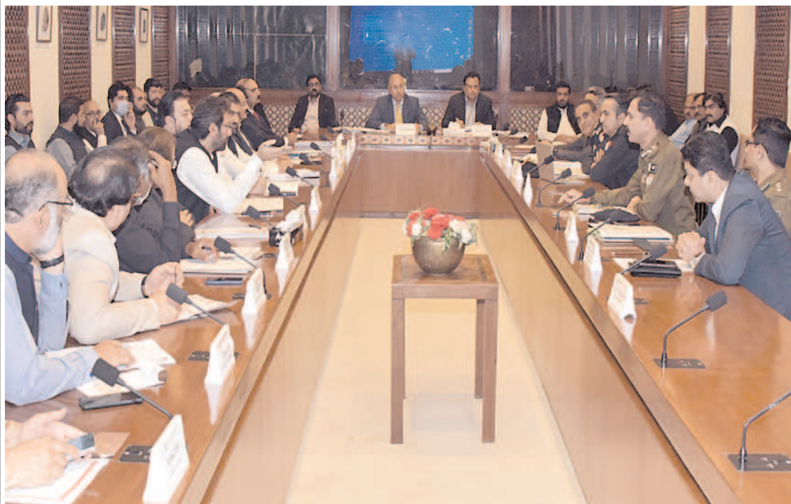
ISLAMABAD: Senator Mohsin Aziz, Chairman Senate Standing Committee on Interior presiding over a meeting of the committee at Parliament House.

The IGP's visit aimed to ensure the smooth distribution of free flour to citizens during the ongoing pandemic. The Islamabad Capital Police remain committed to maintaining the highest level of security and public service.