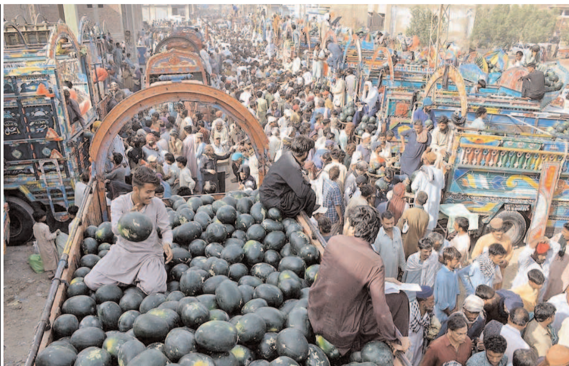
HYDERABAD: Brokers auctioning watermelons at a whole sale market from delivery truck at fruits market.

The price of gold in the international market increased by US$ 4 to $1971 against its sale at $1967, the association reported.