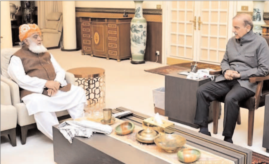
ISLAMABAD: JUI-F Chief Maulana Fazlur Rehman called on Prime Minister Shehbaz Sharif.

"May this new chapter be filled with success and prosperity for the UAE and its people," he said in a tweet. The prime minister also congratulated Sheikh Khaled Bin Mohamed Bin Zayed Al-Nahyan on his appointment as the Crown Prince of Abu Dhabi. "As a brotherly country, we look forward to continuing our strong partnership and working together towards a brighter future for our people and the region," he wrote on Twitter.