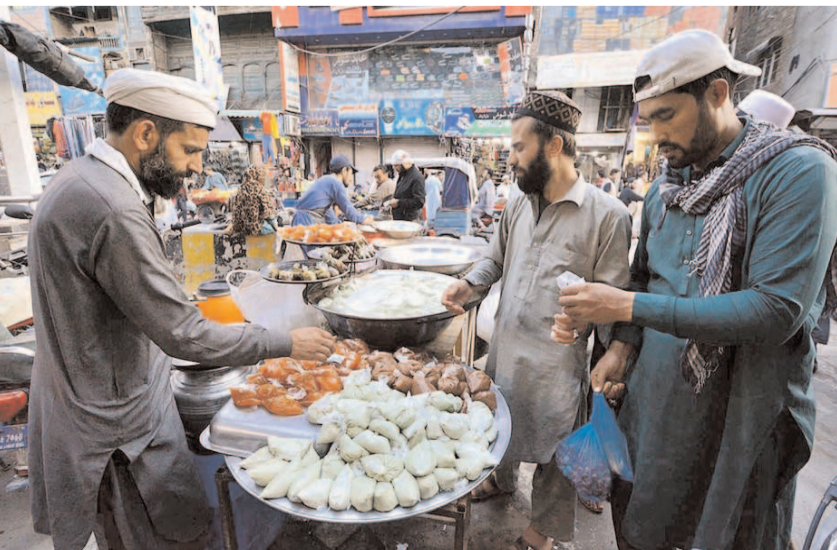
PESHAWAR: Vendor displaying and selling different types of sweet and sour sauce during holy fasting month of Ramzan.

Charsadda Road, Dalazak Road, Kohat Road, Warsak Road and other areas. He said that 15 confectionery sellers were arrested from Old Bara Road, Canal Road and other areas and most of the bakers who were selling low weight bread, vegetable and fruit sellers, butchers, grocery store owners and other shopkeepers were arrested. He said legal action will be taken against the arrested shopkeeper.