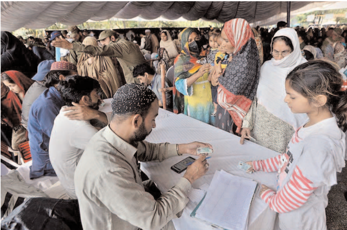
RAWALPINDI: A large number of people standing in queue to be registered for getting free flour bags under Ramadan package at Liaquat Bagh.