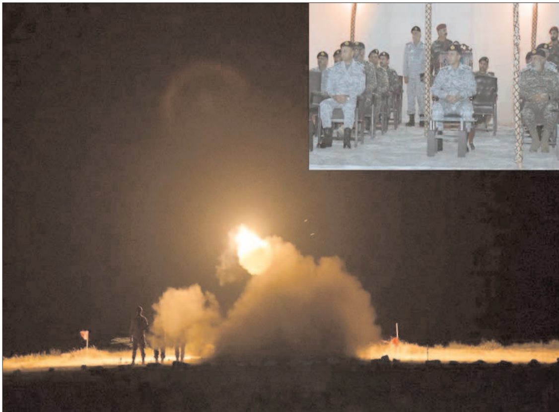
KARACHI: Chief of the Naval Staff Admiral Muhammad Amjad Khan Niazi along with senior Naval officers witnessing Surface to Air Missile firing by Pakistan Navy.

MBZ's ascension to the presidency last year prompted speculation over who would succeed him as Abu Dhabi crown prince, with Sheikh Khaled and Tahnoun both tipped for the honour. The UAE, one of the world's biggest oil producers and an ally of the United States, Russia and China alike, has become a major power in the Middle East as traditional heavyweights such as Egypt and Iraq fell back in recent years. Sheikh Khaled's appointment was welcomed by other Gulf rulers including fellow energy giants Saudi Arabia and Qatar, as well as leaders of the UAE's six other emirates.