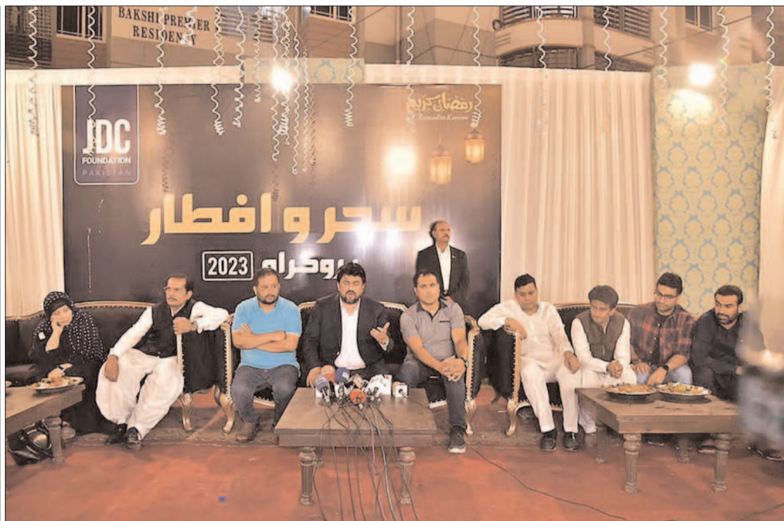
KARACHI: Governor of Sindh Kamran Khan Tessori addressing a press conference after 8th sehri of Ramzan ul Mubarak at Numaish Chowrangi.