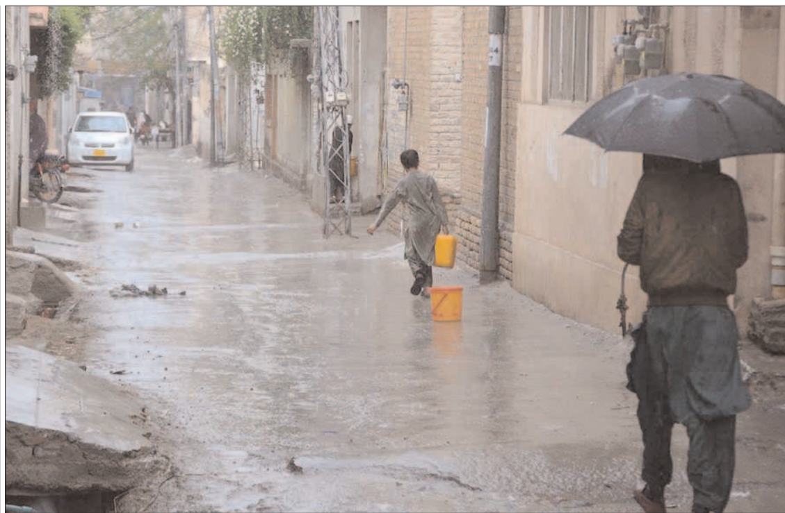
QUETTA: A view of rain in provincial capital.

According to sources, more than six terrorists opened fire and also used rocket launchers in the attack on the check post. However, police officials present at the check post remained safe.