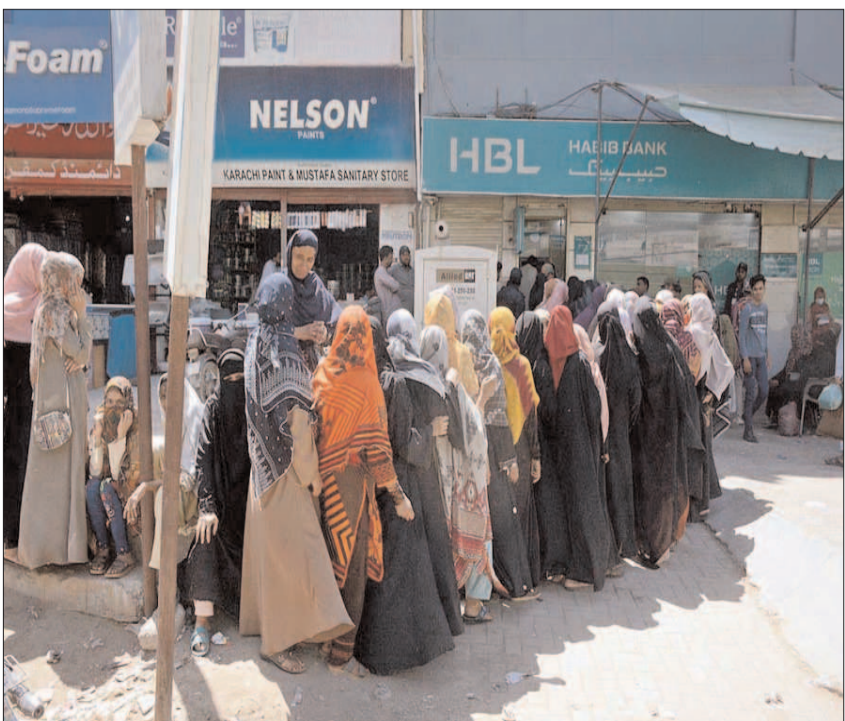
KARACHI: Benazir Income Support Programme (BISP) beneficiaries standing in a queue to draw money from ATM at Korangi.

The speakers emphasized the need for experts to pay attention to climate change at the global level, particularly in Pakistan, to protect against its adverse effects in the future. The conference concluded with a question and answer session.