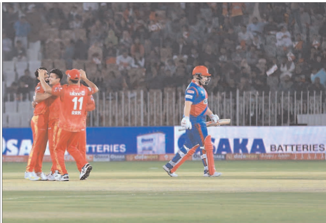
RAWALPINDI: A view of cricket match between Islamabad United and Karachi Kings teams during PSL 8 T20 cricket match at Rawalpindi Cricket Stadium.