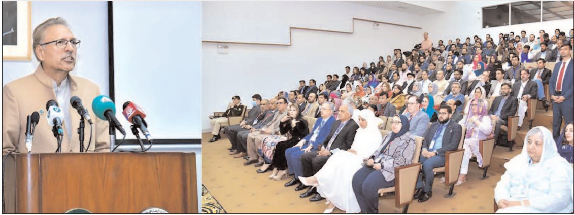
ISLAMABAD: President Dr. Arif Alvi addressing the 5th Cerebral Palsy Conference.