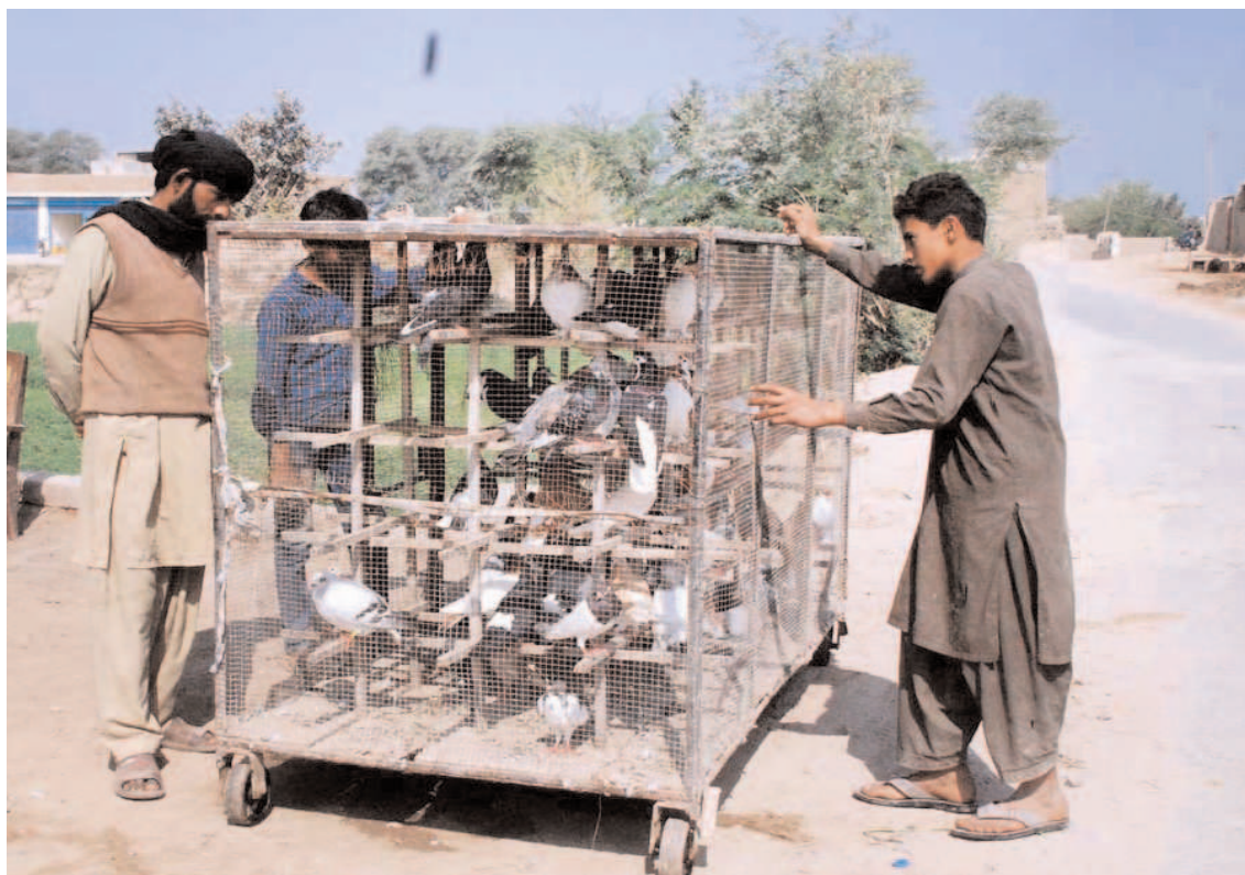
BAHAWALPUR: Pet lovers are buying different species pigeons from a vendors on roadside pigeon stalls.

The data did not prompt a strong market reaction. Among major shares, Uniqlo operator Fast Retailing was up 3.87 percent at 28,200 yen, Sony Group was up 0.66 percent at 11,455 yen, and construction machine maker Komatsu was up 0.86 percent at 3,394 yen. Nippon Steel was up 0.90 percent at 3,144 yen after a report said it is considering a major investment in a green steel project powered by hydrogen outside Japan, which may cost an estimated 100 billion yen ($733 million) or more.