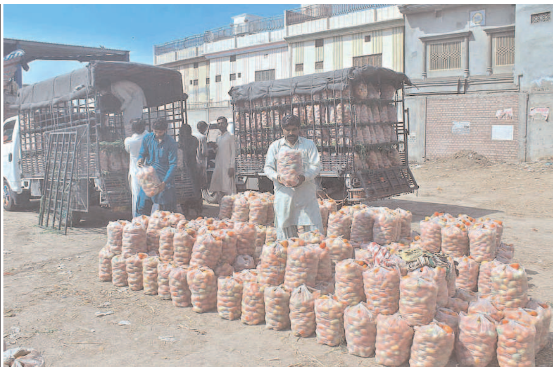
MULTAN: Traders busy in unloading Tomatos bags from delivery van at vegetable for selling at market.

Meanwhile, on a year-on-year basis, the pharmaceutical goods' export increased by 77.19 percent during the month of January 2023 as compared to the same month of last year. The pharmaceutical exports in January 2023 were recorded at US $30.114 million against the export of US$ 16.996 million in January 2022, the PBS data revealed. On a month-on-month basis, the exports of pharmaceutical goods however decreased by 3.41 percent in January 2023 as compared to US$ 31.176 million in December 2022.