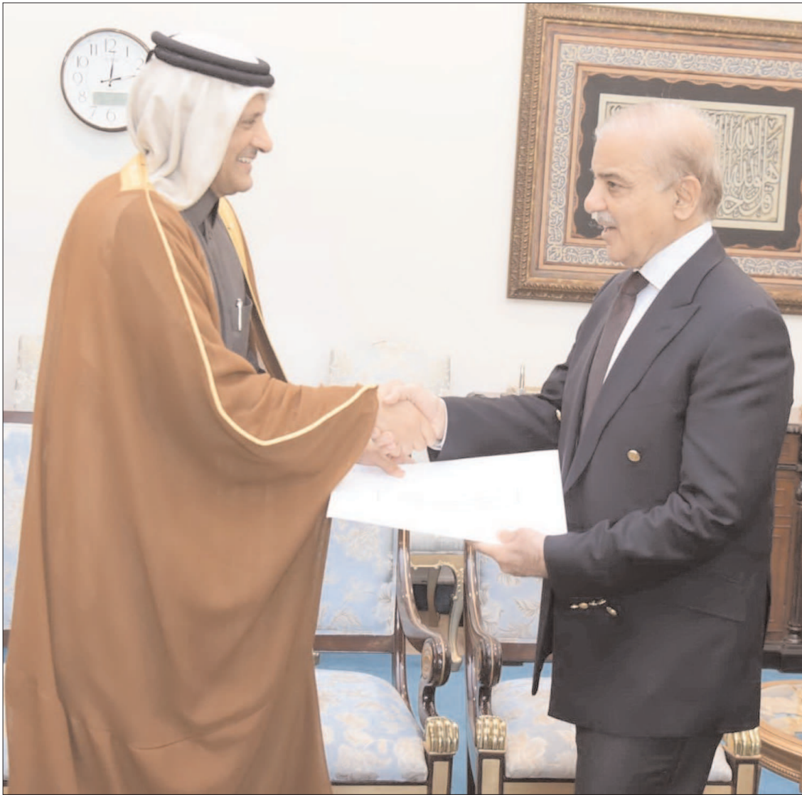
ISLAMABAD: Ambassador of Qatar, Sheikh Saoud Bin Abdulrahman bin Faisal Al Thani called on Prime Minister Shehbaz Sharif.

Vol. XXXIX No. 47 Regd. No. 241 SHABAAN 11 1444 -- SATURDAY, MARCH 04 2023 PESHAWAR EDITION 12 PAGES Price. 20