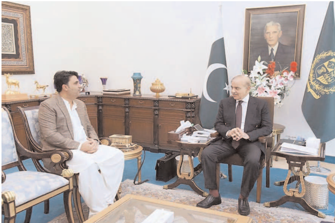
ISLAMABAD: Federal Minister for Privatisation Abid Hussain Bhayo calls on Prime Minister Muhammad Shehbaz Sharif.