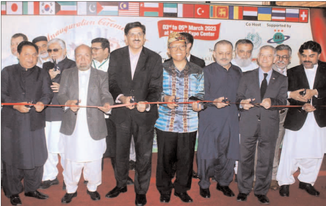
KARACHI: Chief Minister Sindh Syed Murad Ali Shah along with others cutting ribbon to inaugurate 18th "My Karachi-Oasis of Harmony" exhibition organized by Karachi Chamber of Commerce & Industry at Expo Center.