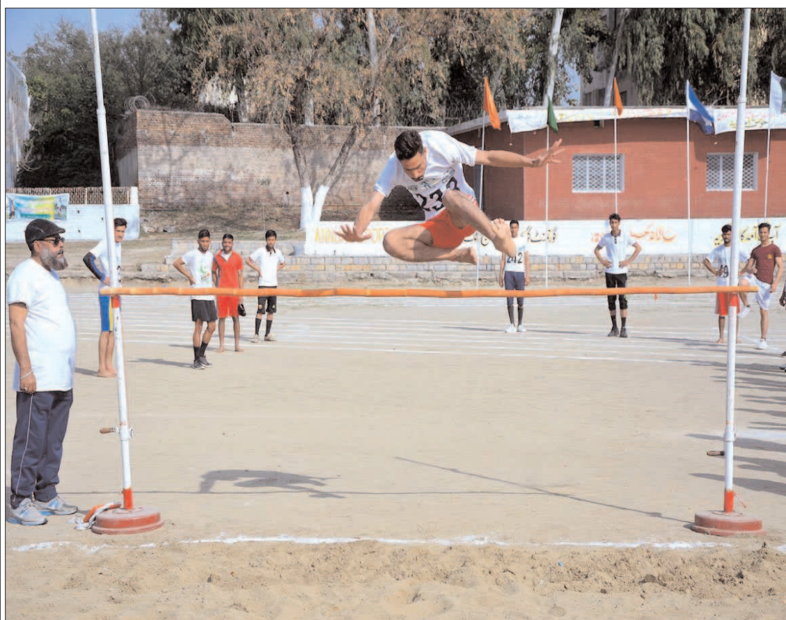
ATTOCK: Students are participating in high jump competition during the annual competitions of Government Graduate College Attock.

It is only the third time that India -- who have won their last 15 home series -- have lost a game at home in the last decade.