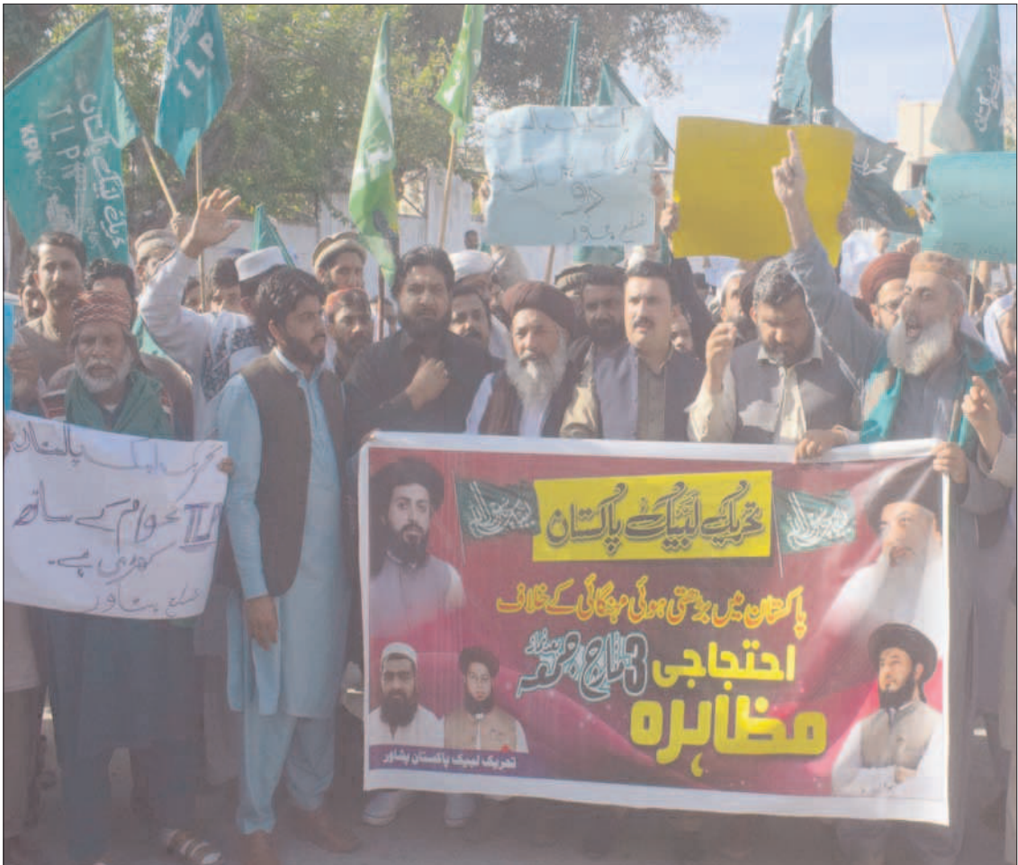
PESHAWAR: Activists of Tehreek-e-Labaik Pakistan holding a protest rally against inflation and price hike.