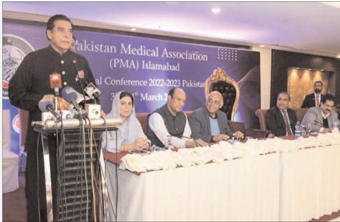
ISLAMABAD: Speaker National Assembly Raja Pervez Ashraf addressing the participants of Annual Conference of Pakistan Medical Association.