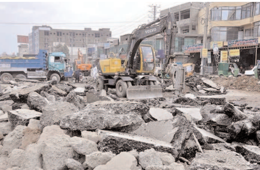
ISLAMABAD: Heavy machinery is being used during construction work of IJP Road as development work in the city.

The APSUP member universities remain committed to extending all possible assistance to the earthquake-affected people of Turkiye.