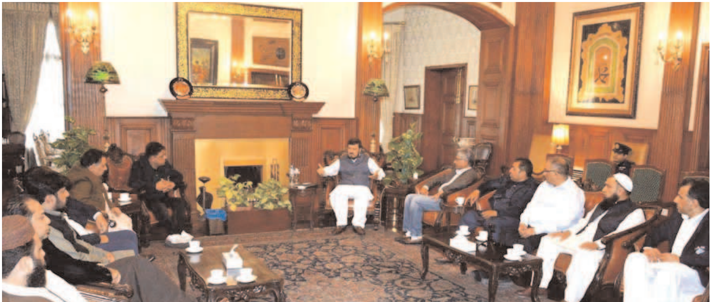
PESHAWAR: Delegation of Pakistani journalists living abroad meeting with Governor Khyber Pakhtunkhwa Haji Ghulam Ali.