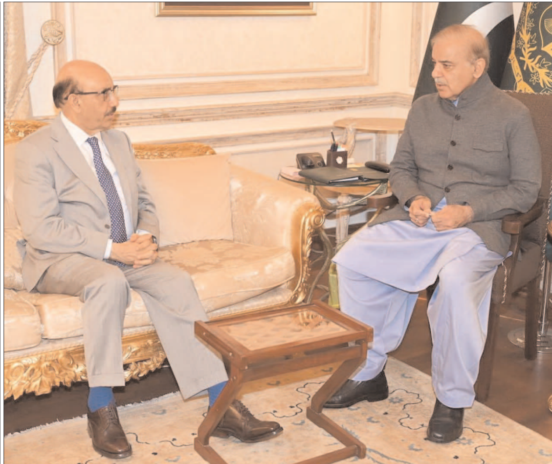
LAHORE: Pakistan Ambassador to US Sardar Masood Khan called on Prime Minister Shehbaz Sharif.

"Debt is usually rolled over but the debt stock does not reduce. We are reducing debt stock," he said. "Formalities with ICBC were completed last night. We returned $1.3 billion to it and this facility has been renewed and we will receive the amount back in three tranches." "We paid back $1.3 billion in three tranches — $500 million, $500 million and $300 million. We will receive it back the same way. Pakistan will get $500 million in two-three days. We might receive it on Monday. Then we will get an additional $500 million in 10 days."