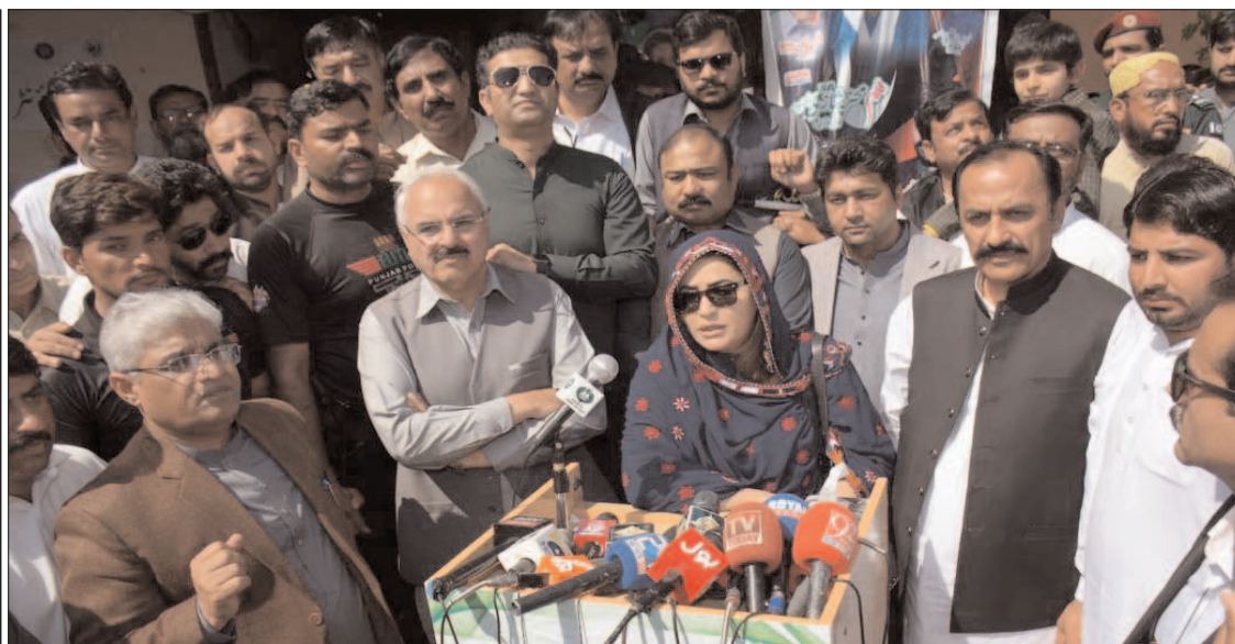
MUZAFFARGARH: Federal Minister PA&SS and chairperson BISP, Ms. Shazia Marri talking to the media after inauguration of Dynamic Registry at BISP Tehsil office, Khangarh.

He demanded of the ECP to take notice of the situation and decide the matter on the basis of form 11 and 12 that provide bases for an undisputed solution for the controversy.