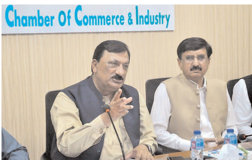
SARGODHA: Federal Minister for Industries and Commerce Tasneem Ahmed Qureshi addressing to Chamber of Commerce.

Then we might be able to export potatoes to other countries. We have a huge potential for countries that have smaller land areas or don't produce much of their own potatoes."