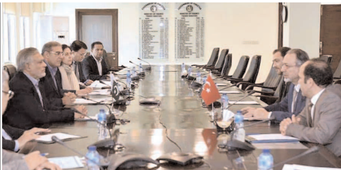
ISLAMABAD: Ambassador of Republic of Turkiye Dr. Mehmet Pacaci meeting with Federal Minister for Finance and Revenue Senator Mohammad Ishaq Dar at Finance Division.