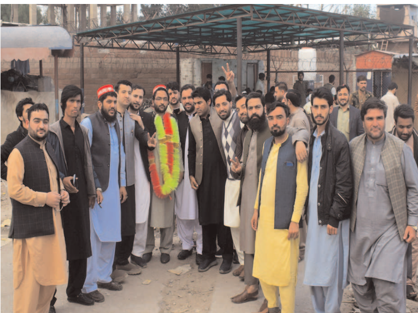
PESHAWAR: PTI's local leader with party workers after release from jail.