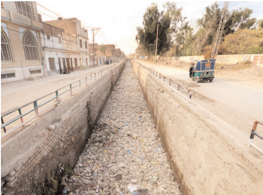
PESHAWAR: A view of garbage cover Walibad canal needs attention of concern authorities.