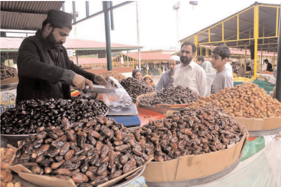
ISLAMABAD: A vendor selling dates during holy fasting month at sasta Ramzan Bazaar.