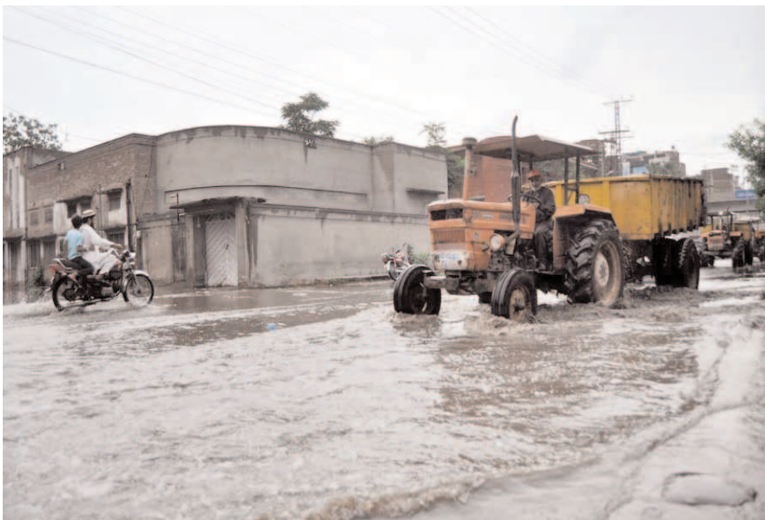
PESHAWAR: Vehicle passing through accumulated rain water after heavy rain in city.

He said the number of people who died due to Coronavirus in Peshawar is 3153 and 5 new cases have been reported in Peshawar, making the total number of 85443. He disclosed that 41 Corona tests were conducted in Khyber Pakhtunkhwa during the last 24 hours and the number of active cases in the province is 146.