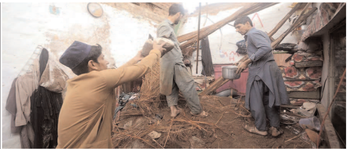
PESHAWAR: A view of collapsed roof at Bhanwari Chongi due to rain.

Due to the rains, the temperature dropped significantly and the temperature of Peshawar is a record 13 degrees Celsius, the official said.