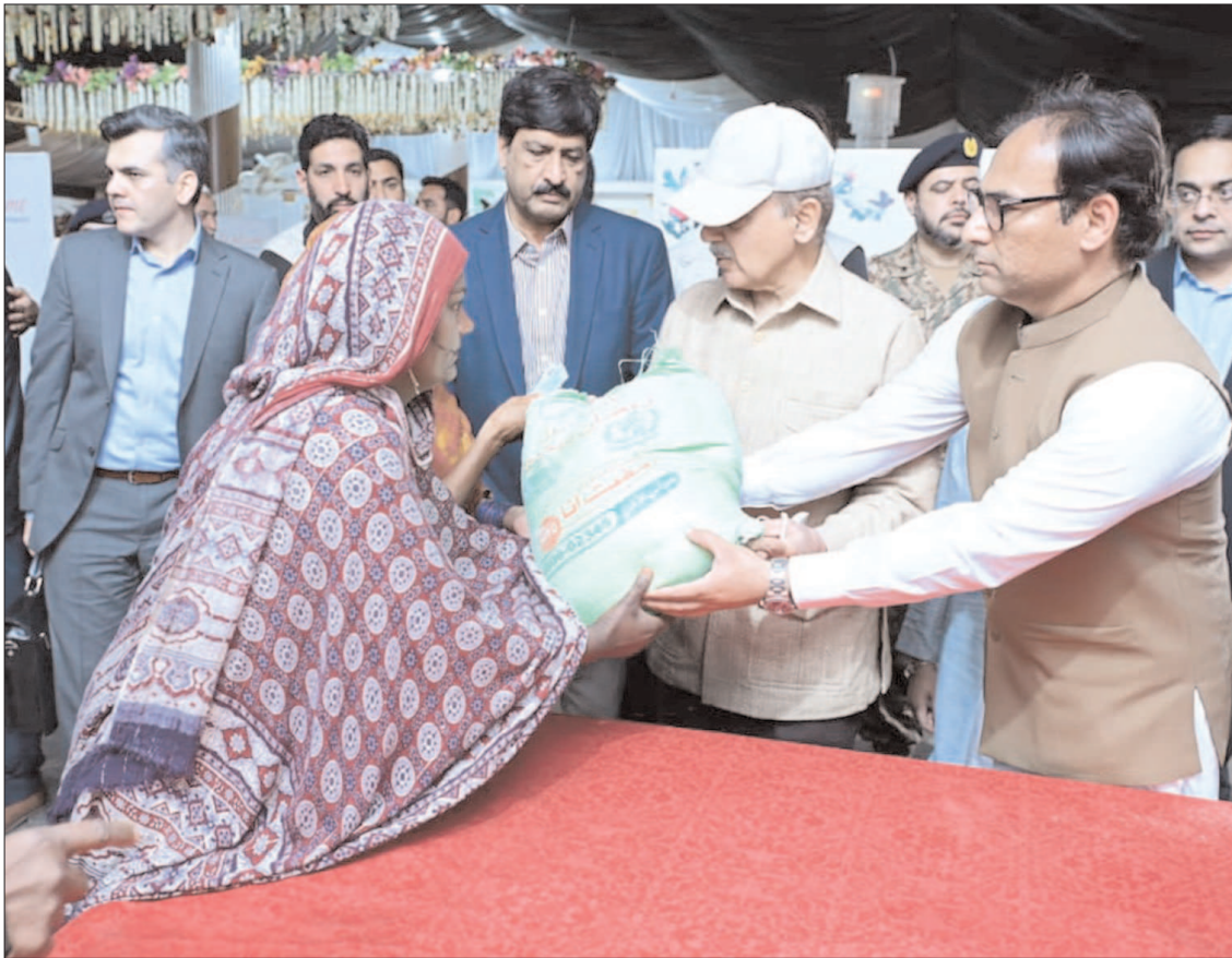
SARGODHA: Prime Minister Shehbaz Sharif visits free flour distribution points, established as part of Prime Minister's Ramazan relief package for deserving families.