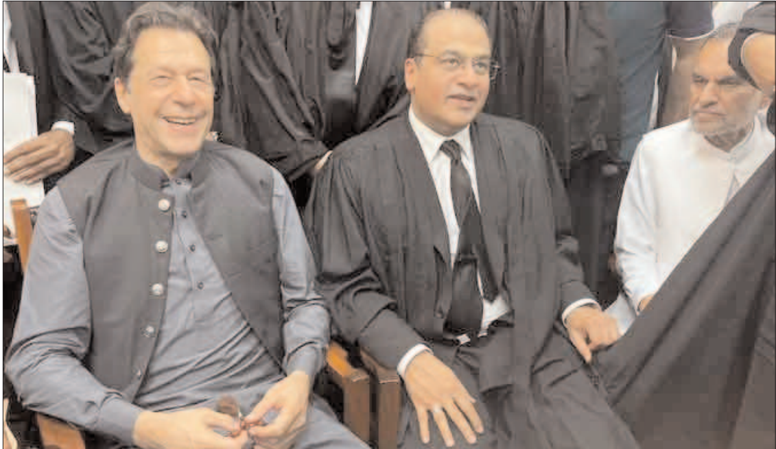
LAHORE: Pakistan Tehreek-e-Insaf Chairman Imran Khan at anti-terrorism court during hearing.