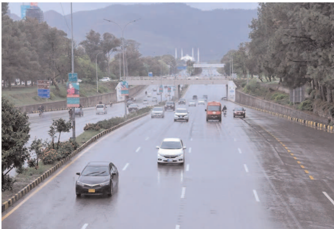
ISLAMABAD: Traffic on the way during rain at Faisal Avenue in the Federal Capital.