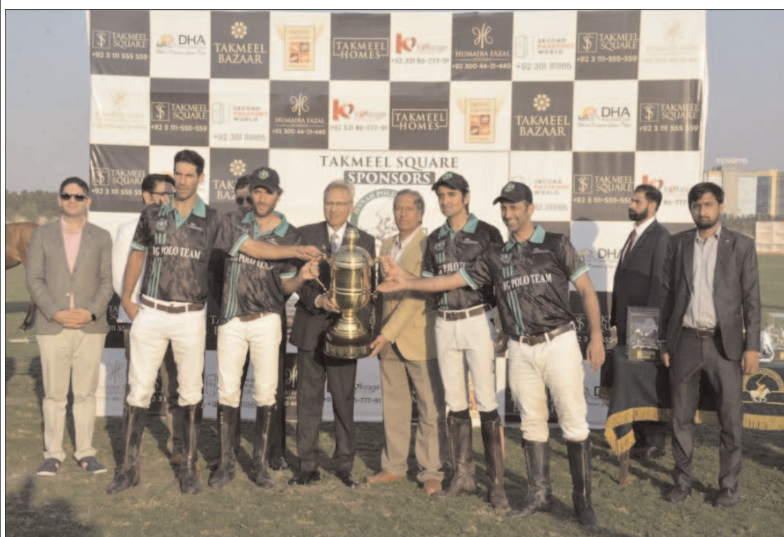
LAHORE: President Dr Arif Alvi giving away trophy to winners of FG Polo team in Final of 2nd President of Pakistan Polo Cup 2023.