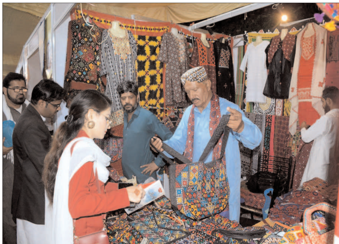
KARACHI: A girl visiting a stall established in 6th Sindh Literature Festival (SLF) at Arts Council of Pakistan.

The Competitive Research Grants will be provided for the Creation of new knowledge through patents, technology transfer and publications, development of new processes, products, prototypes or applications through indigenous skills, and value addition in the existing products/prototypes/ processes according to the needs of the economy and Pilot Plant Studies. The concept proposals must be submitted online and can be accessed via the PSF website. The foundation only accepts Concept Paper submissions through the RGMS online web portal ( https://psf.gov.pk/rgms/ ) The applicants can get details about the submission of the concept proposals through https://psf.gov.pk/CRP.aspx .