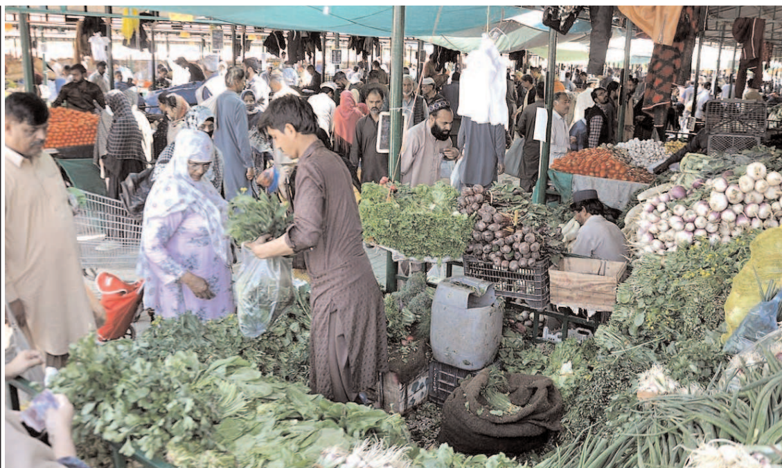
ISLAMABAD: People purchasing vegetables from vendors at Sunday Bazaar.

Naveed Qamar further said that the revival of the dialogue would significantly boost confidence of the business community and would help in providing them with a conducive environment marked by stability and predictability.