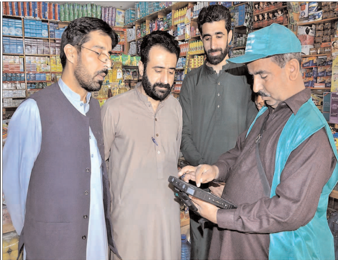
ISLAMABAD: An official collecting data from a citizen during the first-ever digital population and housing census at Ghouri Town.

The camps, overcrowded and squalid, are vulnerable to fires. Between January 2021 and December 2022, there were 222 fire incidents in the Rohingya camps including 60 cases of arson, according to a Bangladesh defence ministry report released last month.