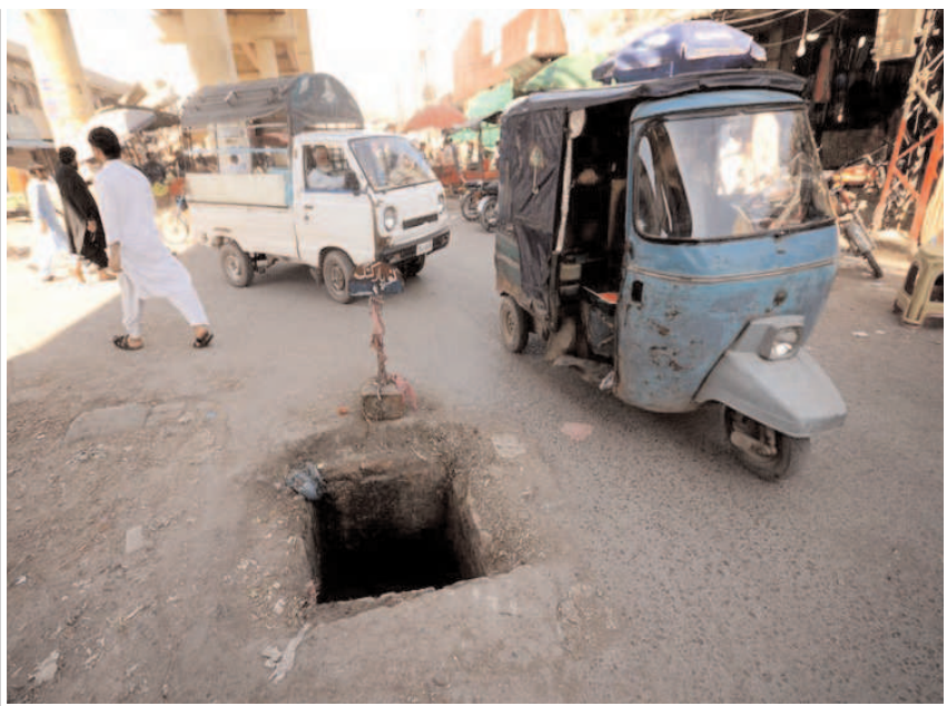
PESHAWAR: An open manhole at Fakirabad may cause any mishap and needs attention of concerned authorities.