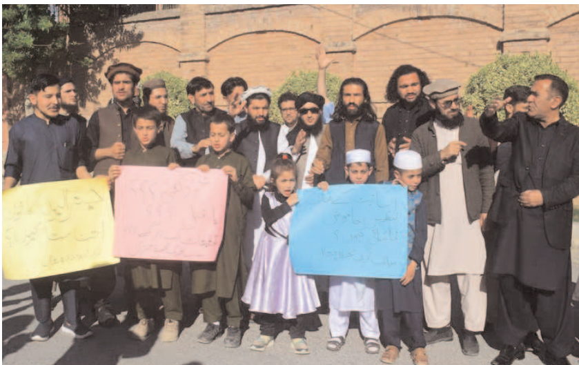
PESHAWAR: Activists of Tehreek Hoqok-e-Tahafoz Chitral holds placards during a protest in favour of their rights.