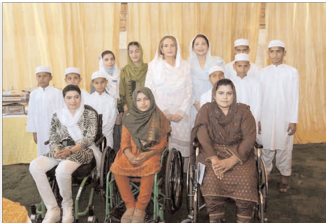
LAHORE: First Lady Begum Samina Arif Alvi in a group photo at Soliton Welfare Foundation.

It may be noted that the CM had said that the remaining Rs 4.17 billion balance with BISP would be disbursed in phase II wherein farmers holding land up to 25 Acres and the left-out farmers of the first category will be covered.