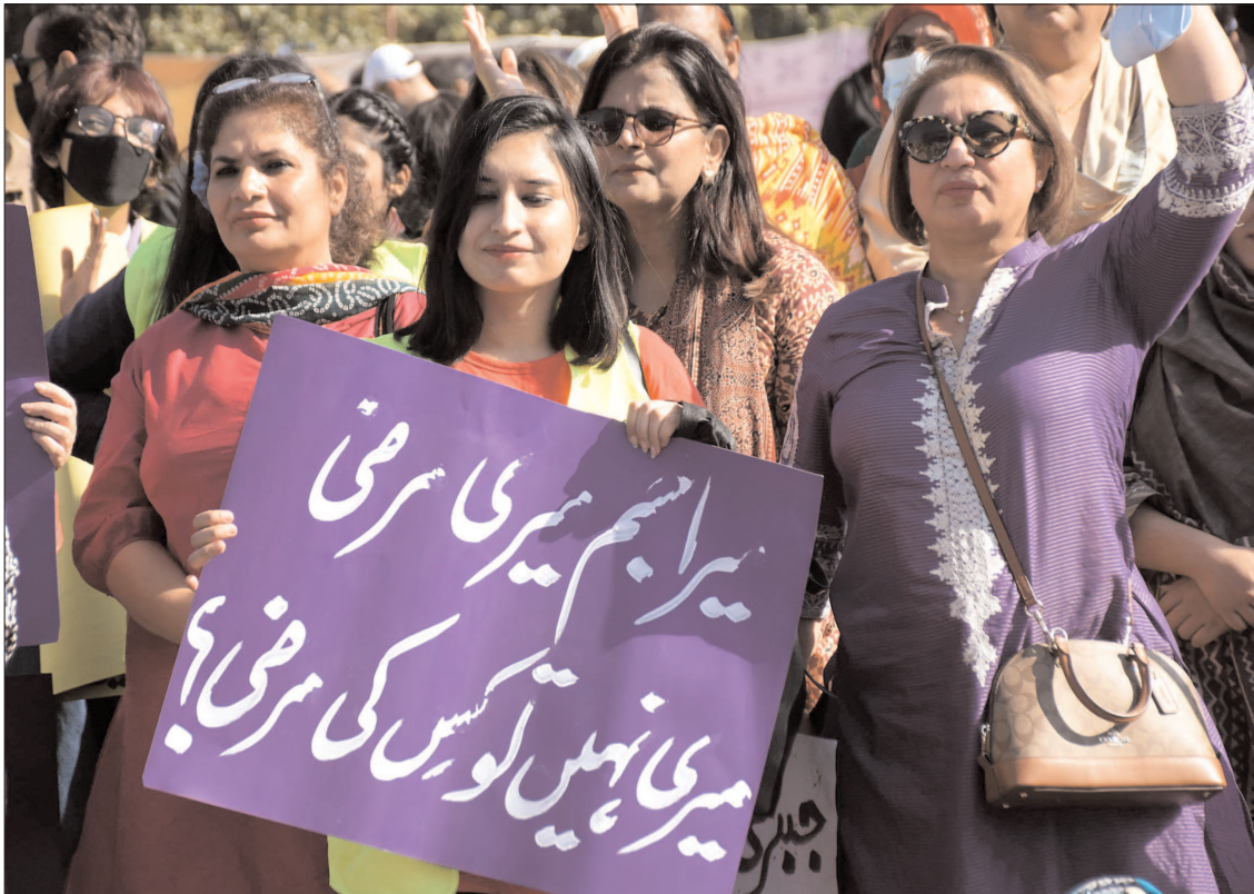
ISLAMABAD: Activists of Aurat March holding placards during a rally to mark International Women's Day.