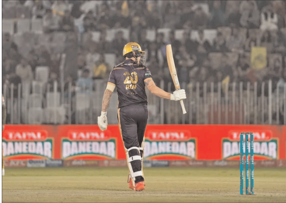
Jason Roy acknowledges the crowd after reaching three figures.

By the 10th over, the 100-partnership had been reached, and both players had scored half-centuries. But on the day, Babar wasn't simply accumulating, he was matching Ayub's strike rate toe-to-toe. They