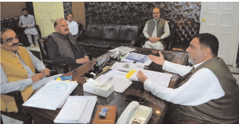
PESHAWAR: KP Caretaker Minister for Communication Muhammad Ali Shah meeting with Caretaker Minister for Information Barrister Feroz Jamal Kakakhel. Secretary Information Arshad Khan also present on occasion.

PESHAWAR (APP): Two labourers died in an alleged chemical triggered explosion in a match factory here in Industrial Estate on Wednesday. On receiving information, medical teams of the Rescue 1122 rushed to the venue of the incident and after provision of first-aid, shifted the injured to the hospital where they succumbed to their injuries. The factory was closed for the last ten years and the explosion occurred during its cleaning, which resulted in the partial collapse of its roof.