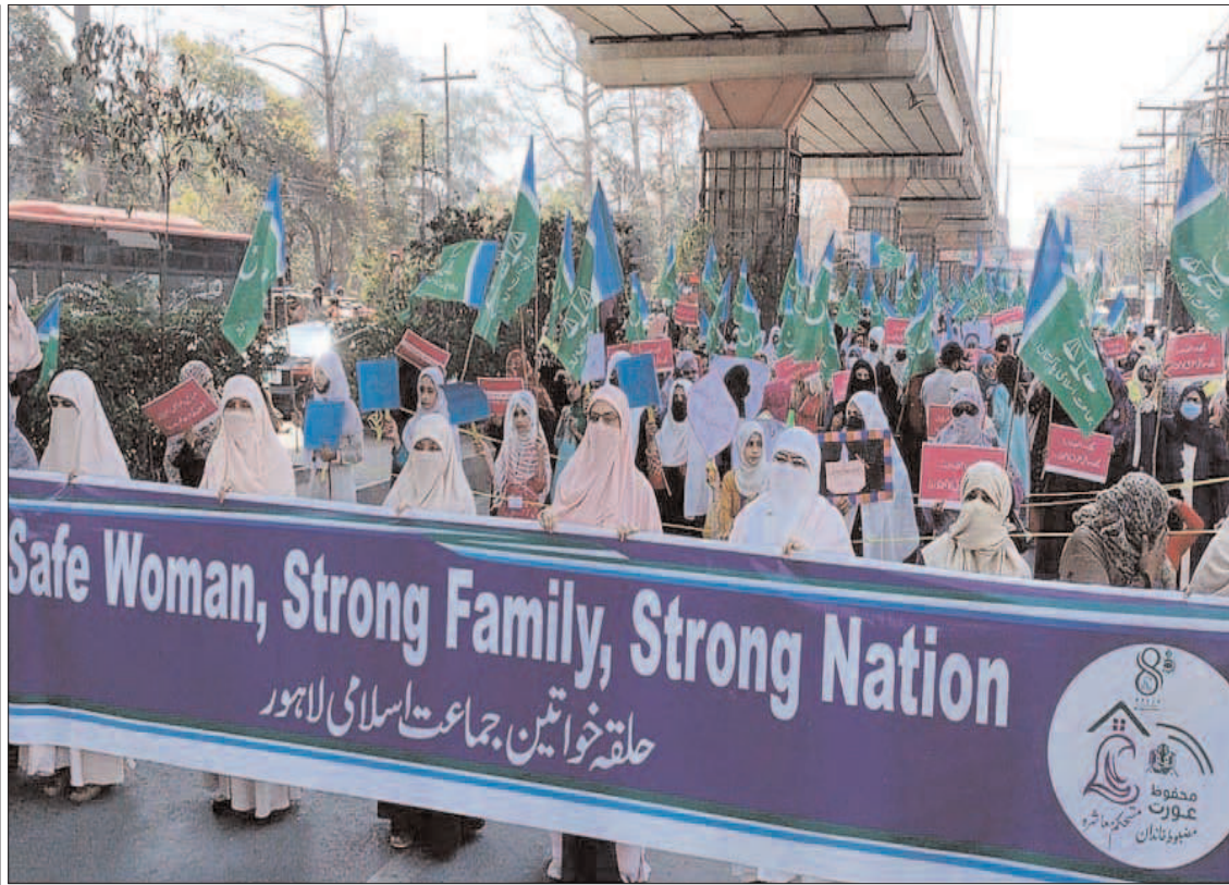
LAHORE: Haya March on the occasion of Women's day organized by Jamaat e Islamai women wing.

The Law Minister said complete and sector wise data should be provided. A comprehensive plan was under consideration to bring the places under suitable use through public-private partnership, which would help reduce the burden on the government. The meeting was attended by Secretary for Housing, Secretary for Law and Justice, Joint Secretary Civil Aviation, Additional Secretary Communications, Additional Secretary Railways, Deputy Secretary Cabinet Division, DG Pak PWD and representatives of the Ministry of Interior.