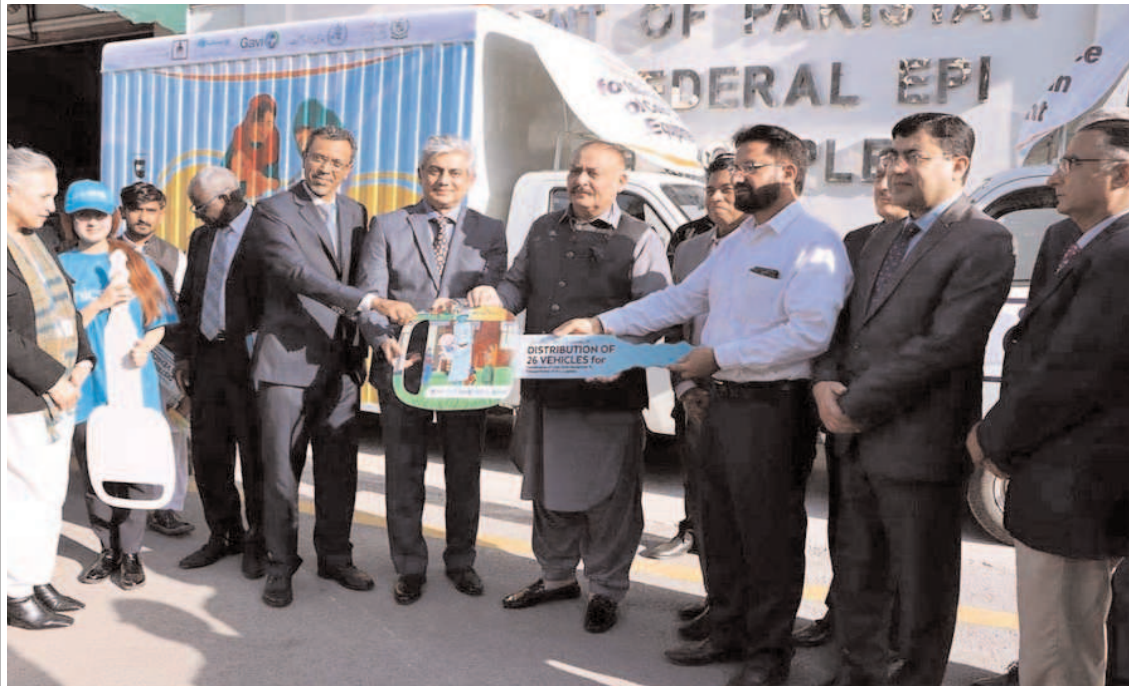
ISLAMABAD: Federal Minister for National Health Services, Regulations and Coordination, Abdul Qadir Patel handing over the ceremonial keys of the technical immunization Vehicles to the provincial team leads from all provinces and federating units.

Talking about the Single mother policy, he said NADRA has also issued many computerized national identity Card (CNIC) to a woman who does not know where her father is and was raised by a single parent, adding he said we have introduced a policy earlier this year to allow single mothers to get their children registered without asking them to submit documents of the other parent.