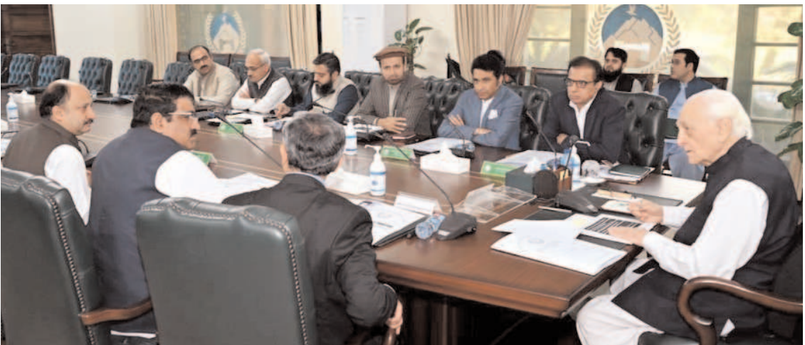
8-3-2023 ---R Caretaker Chief Minister Khyber Pakhtunkhwa Muhammad Azam Khan chairing a meeting of Health Department. 8.3.23