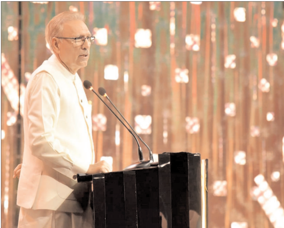
ISLAMABAD: President Dr. Arif Alvi addressing the Women Leaders Awards ceremony in connection with International Women's Day.