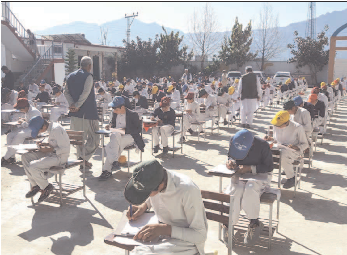
LOWER DIR: Students busy to solve their papers as annual examination from grade 5th to 8th began in Dir gov't schools.

GUJRANWALA (INP): At least 300 shops were gutted when fire broke out in Lunda Bazaar near Sheranwala Bagh in Gujranwala. The reason behind the eruption of the fire is yet to be ascertained. Eight fire tenders of Rescue 1122 managed to extinguish the fire after two hours hectic efforts. The cloth and other commodities were reduced to ashes in the intense blaze. However, Rescue officials said the fire at Landa Bazar has been brought under control, and the cooling process was underway. The cloth and other commodities were reduced to ashes in the intense blaze.