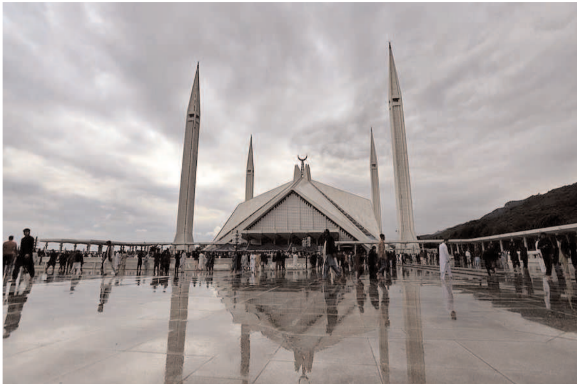
ISLAMABAD: An attractive view of clouds hovering over the Faisal Masjid as large number of faithful coming out after offering Namaz-e-Jumma (Friday Prayer) during Holy fasting month of Ramzan.