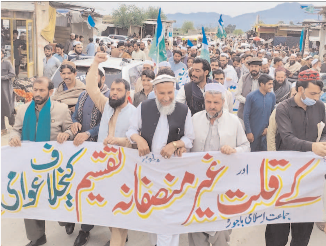
KHAR: Activists of Jamat-e-Islami holding a banner during a protest against unfair distribution of flour in Ramadan.