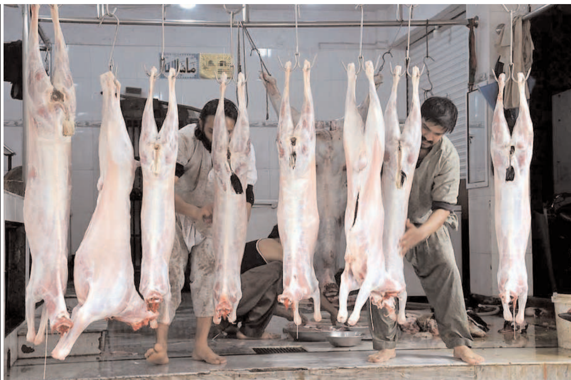
ISLAMABAD: Butchers busy in washing after slaughter goats at Ghouri Town VIP in Federal Capital.

Huawei has established OpenLabs worldwide which serve as open innovation platforms where the Chinese company joins forces with local partners to develop industry solutions for the region.