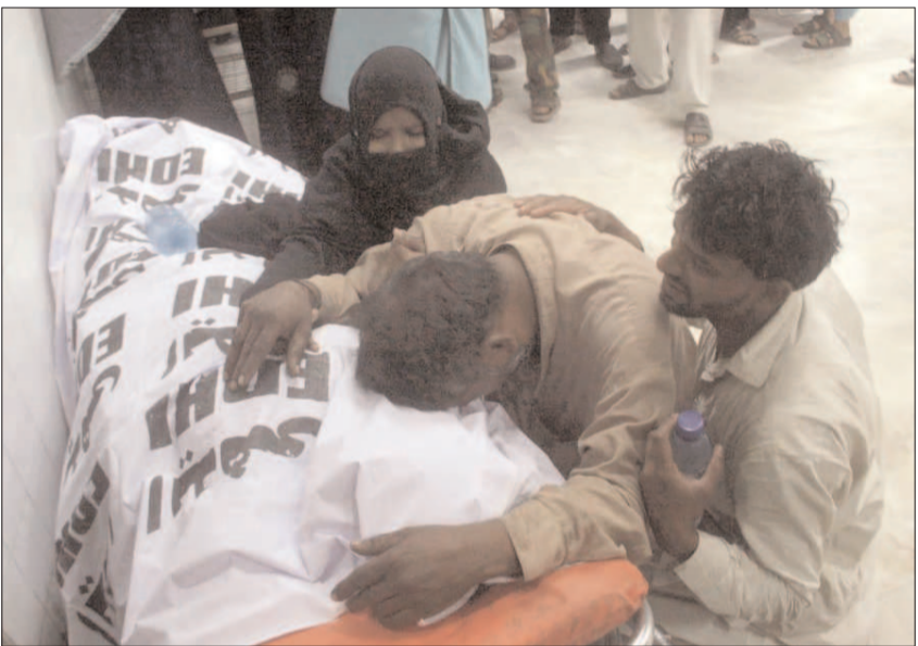
KARACHI: Relatives mourning on the dead body after factory incident.