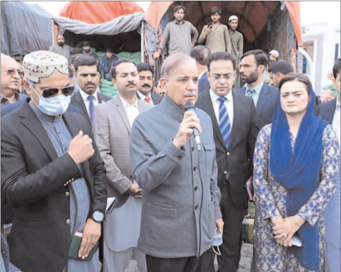
ISLAMABAD: Prime Minister Shehbaz Sharif visits free flour distribution points established as part of PM's relief package for deserving families.