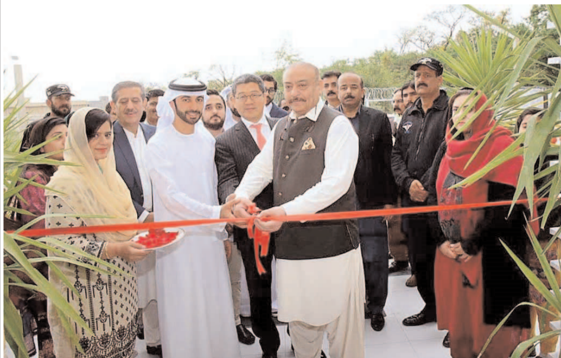
ISLAMABAD: Federal Minister for National Health Services Abdul Qadir Patel cutting ribbon to inaugurate Regional blood center Islamabad with a High level delegation of UAE in federal Capital.

The official said the CDA advertisement also included details about the flexible completion period for commercial plots included 3 years: 1,000 yards, 4 years: 1,000 to 3,000 yards and 5 years above 3,000 yards.