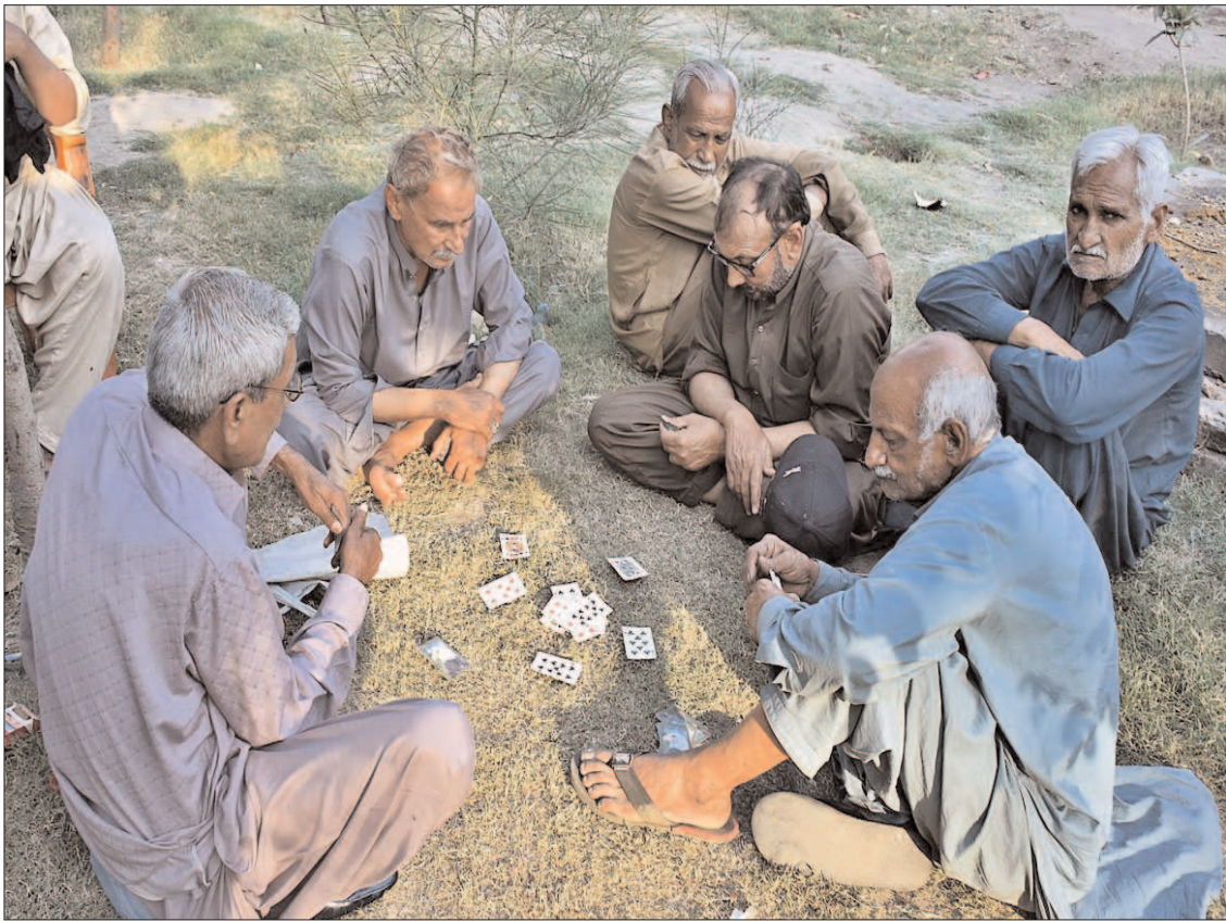
LAHORE: Elderly men playing cards to pass their time while sitting along roadside at Canal road.

He said that his role is nothing, today the one who is suffering from crises wants to create a big crisis. After raising a slogan, Imran starts playing a new song four days later. We are not for power, Pakistan is deep, to save him from falling into the ditch, Imran attacked the Election Commission and Pakistan Army, he wanted to bring officers and people of his choice. If his intention was successful, then Pakistan would have defaulted.