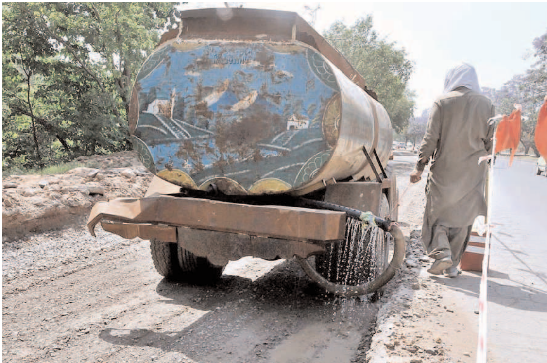
ISLAMABAD: A worker watering on under construction Club Road during development work in Federal Capital.