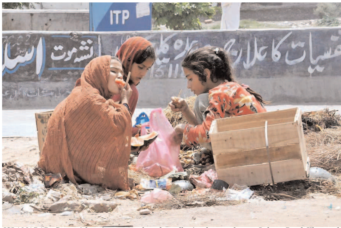
ISLAMABAD: Gypsy girls eating watermelon after collecting from garbage at Lehtrar Road, Khanapul.

"When the gates are broken by armored vehicles, the votes will also go into the oven."