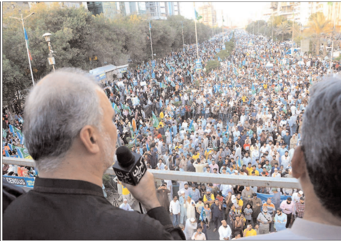
KARACHI: Ameer Jamaat-e-Islami (JI) Karachi Hafiz Naeem-ur-Rehman addressing the protest gathering against the census at Shahr-e-Faisal Road.

The price of sugar includes Sales Tax at Rs14.58 per kg, a profit margin of Rs5.30, and a distributor's margin of 25 paisa per kg. The transport cost is calculated at Rs2 per kg, and the retailer's profit is Re1 per kg. A government notification said after reviewing the data provided by the provinces and information reported by other government agencies, the Controller General of Prices has set the maximum retail price of locally produced "white crystalline sugar at Rs98.82/kg, at which it shall be made available to the general public".