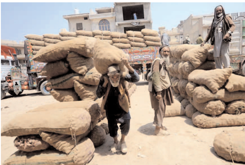
PESHAWAR: Old age labours working at a vegetable market on eve of International Labour Day.

PESHAWAR (APP): The Kaghan-Naran road is closed for all types of traffic following the melting of a huge glacier, an official of the National Highway Authority (NHA) told here Sunday. The NHA official also told that work on removing glaciers and cleaning the road is going on rapidly at Chitta Katha on Naran Road. He said that the route was also blocked from another big glacier at Guriya Chinch Naran. The work will be started after the cleaning of this glacier on Guriya Chinch, he informed. The spokesman of Tourism Authority Muhammad Saad advised the tourists to take good care during the tour to Kaghan and Naran valleys. Tourists should avoid traveling to Naran, he said and added, to ensure the safety of tourists, the district administration, NHA, Khyber Pakhtun- khwa Tourism Department, Tourism Authority and Kaghan Development Authority are jointly working on a priority basis to clear the road from the melted glacier blocked the road. He said the tourists can contact Tourism Helpline 1422 for any information or emergency. Tourism awareness information is being published regularly on social media platforms, the spokesman of Tourism Authority added.