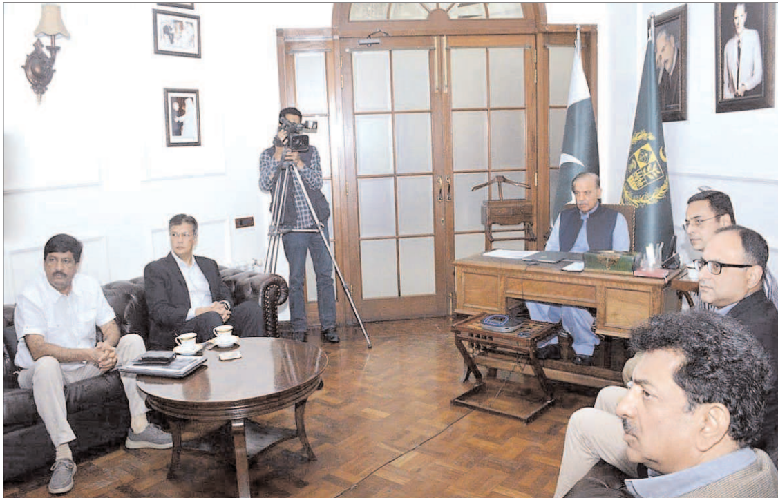
LAHORE: Prime Minister Muhammad Shehbaz Sharif chairs a meeting to review country wide wheat procurement drive.

He also directed for provision of required resources through banks to get a specified quantity of wheat.