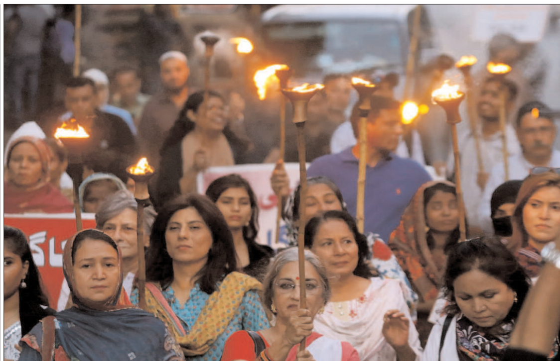
KARACHI: Pakistan Food Workers Federation organizes torch-bearing rally with solidarity to laborers from Press Club to Arts Council on the Labour Day.

This Ministry has, therefore, in compliance of the Cabinet decision, has issued formal notifications for appointment of members accordingly.