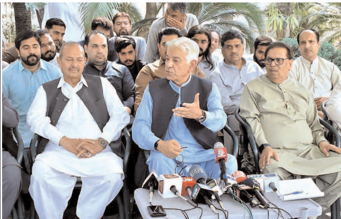
SIALKOT: Federal Defence Minister Khawaja Muhammad Asif addressing a press conference.

The police have registered a case against the suspect under Anti-Narcotics Act and launched an investigation into the case.