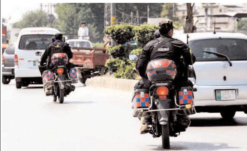
PESHAWAR: Abdali Squad Policemen patrolling on Ring Road.