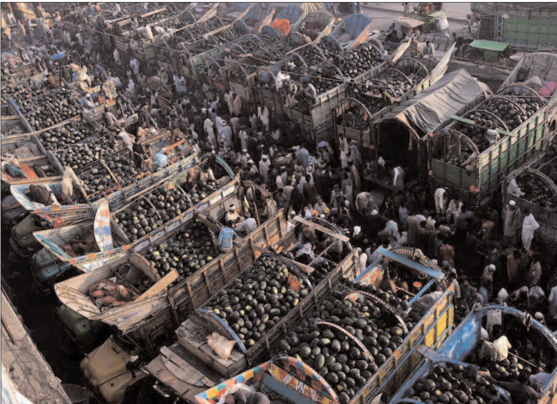
LAHORE: Farmers and traders gather around the trucks of watermelons during auction as shopkeepers participating in bidding of fruit (Watermelon) at fruit market in the Provincial Capital.