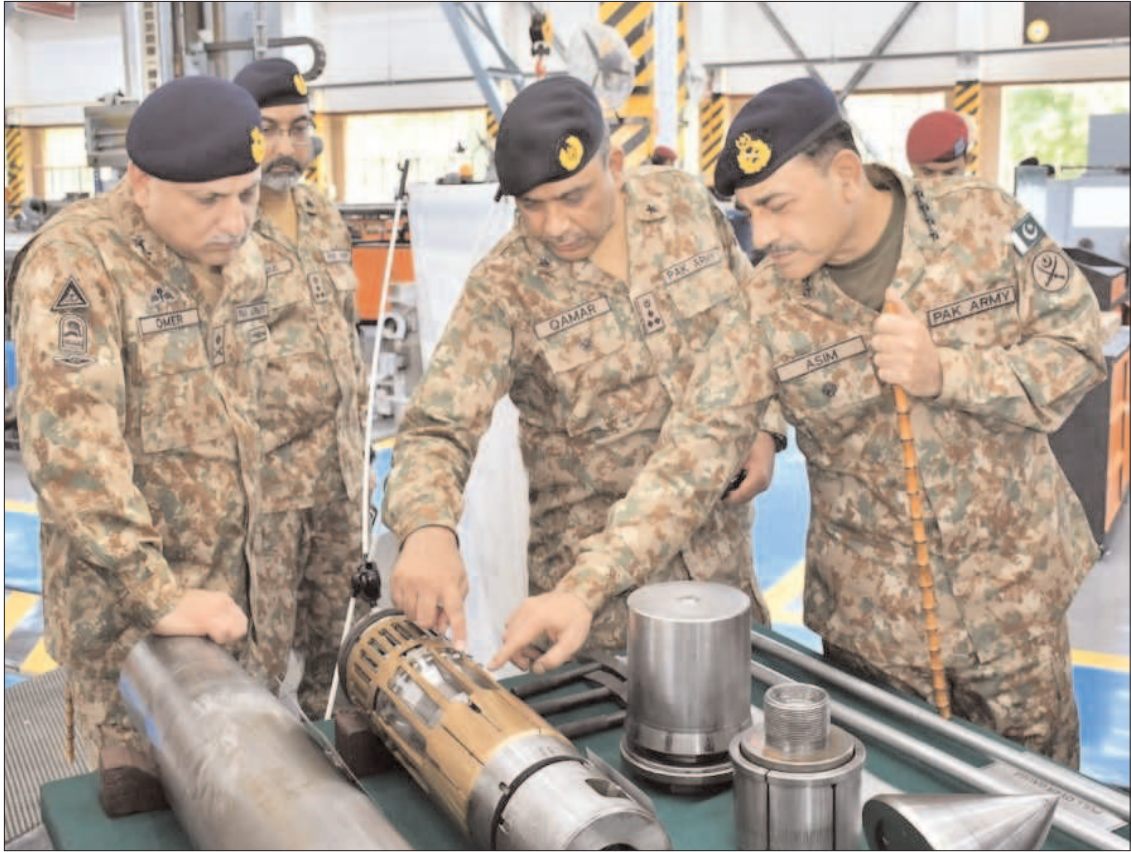
RAWALPINDI: Chief of Army Staff General Syed Asim Munir inspecting various projects during his visit to Heavy Industries Taxila.