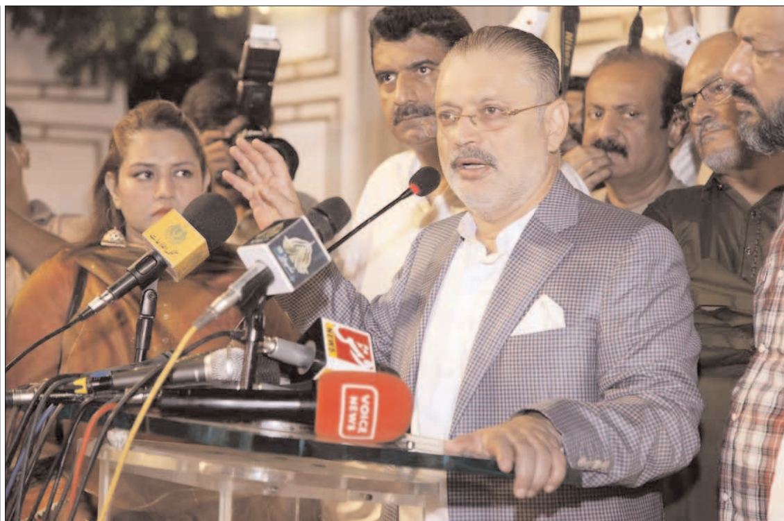
KARACHI: Sindh Information Minister Sharjeel Inam Memon speaking on Iftar-dinner at the Karachi Press Club.

The performance of SDPOs, SHOs and in charge investigations would be evaluated by their performance in recovery of drugs and illegal weapons, implementation on National Action Plan, local and special laws, security of vulnerable Establishment Act and rapid investigation of pending cases. The CCPO directed the officers not to arrest the innocent persons in nominated cases if found not guilty and send the actual culprit to jail.