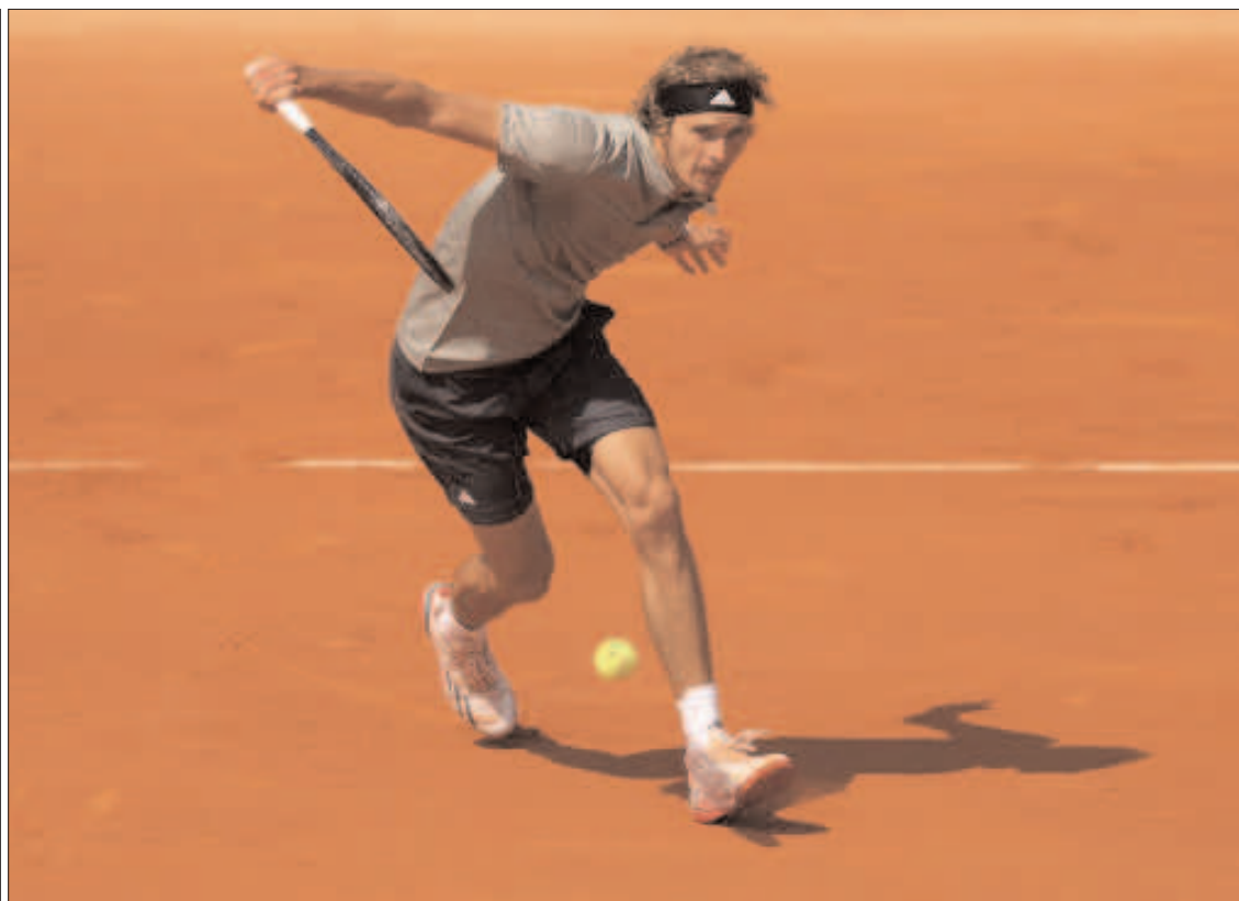
MONTE-CARLO: Alexander Zverev of Germany plays a backhand volley against Alexander Bublik of Kazakhstan in their first round match during day three of the Rolex Monte-Carlo Masters.

Moreover, the board gave the nod to establish CDA Pension Fund and Endowment Fund, recommending that 5% of the income should be kept in these funds.