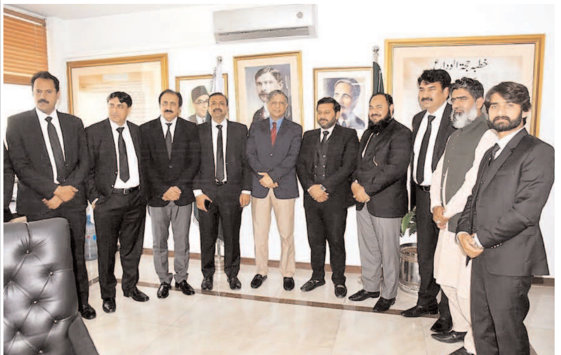
ISLAMABAD: Lawyers of Nankana Bar Association called on Federal Minister for Law and Justice Senator Azam Nazeer Tarar.

DC said that all-out efforts were being made to ensure the smooth distribution of free flour bags and added that no untoward incident was reported in Rawalpindi. The distribution of free flour would continue till the 25th of Ramazan, he said, and informed that the administration was also taking strict action in accordance with the law against profiteers and hoarders. The administration had imposed fines amounting to over Rs 4 million on 1,325 profiteers while 318 shopkeepers were sent behind the bars for profiteering and not displaying the rate lists.