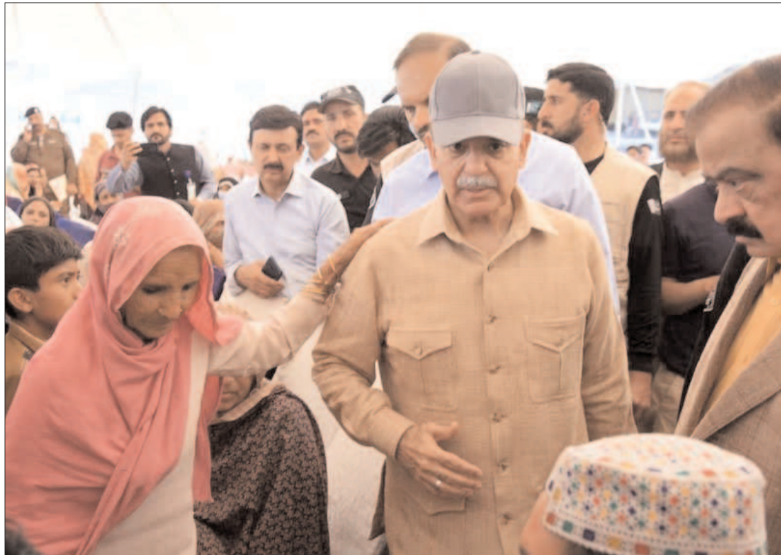
FAISALABAD: Prime Minister Shehbaz Sharif visits free flour distribution points.

ISLAMABAD (Agencies): Chief Justice of Pakistan (CJP) Umar Ata Bandial has summoned a meeting of the Judicial Commission of Pakistan (JCP) on Thursday (April 13) to consider the confirmation of Justice Musarrat Hilali as regular chief justice of the Peshawar High Court. Justice Hilali has been performing the duties of acting chief justice of the PHC since April 1, 2023.