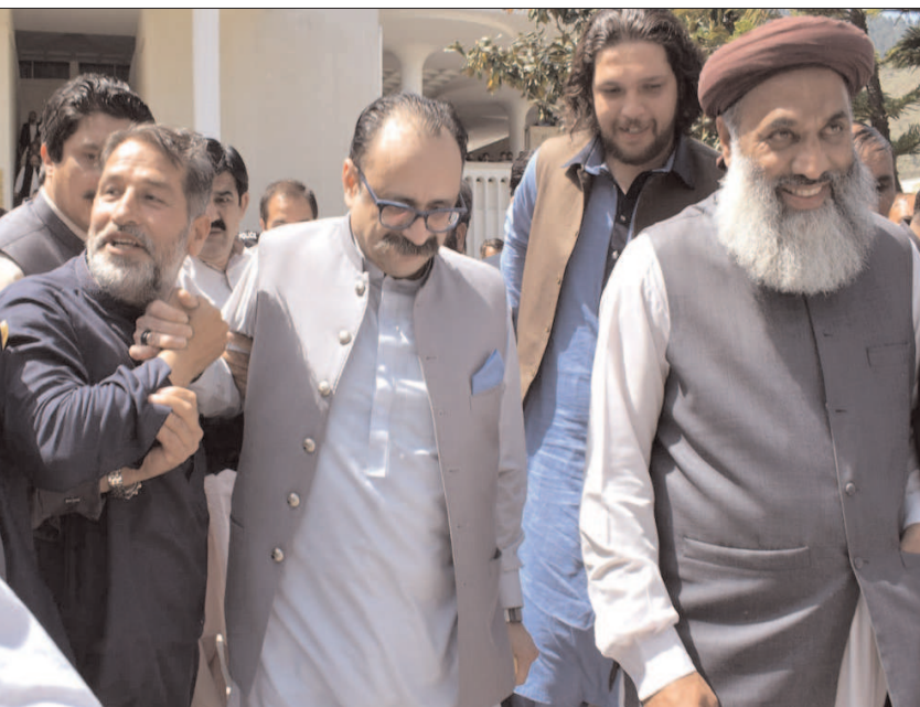
MUZAFFARABAD: Prime Minister of Azad Jammu and Kashmir Sardar Tanveer Ilyas leaving court after disqualification.

The President concluded that the Mohtasib had overlooked these important aspects of the matter, therefore, its orders were being set aside and Utility Stores Corporation was directed to process the case of the complainant for appointment under the PM's Assistance Package at the earliest.