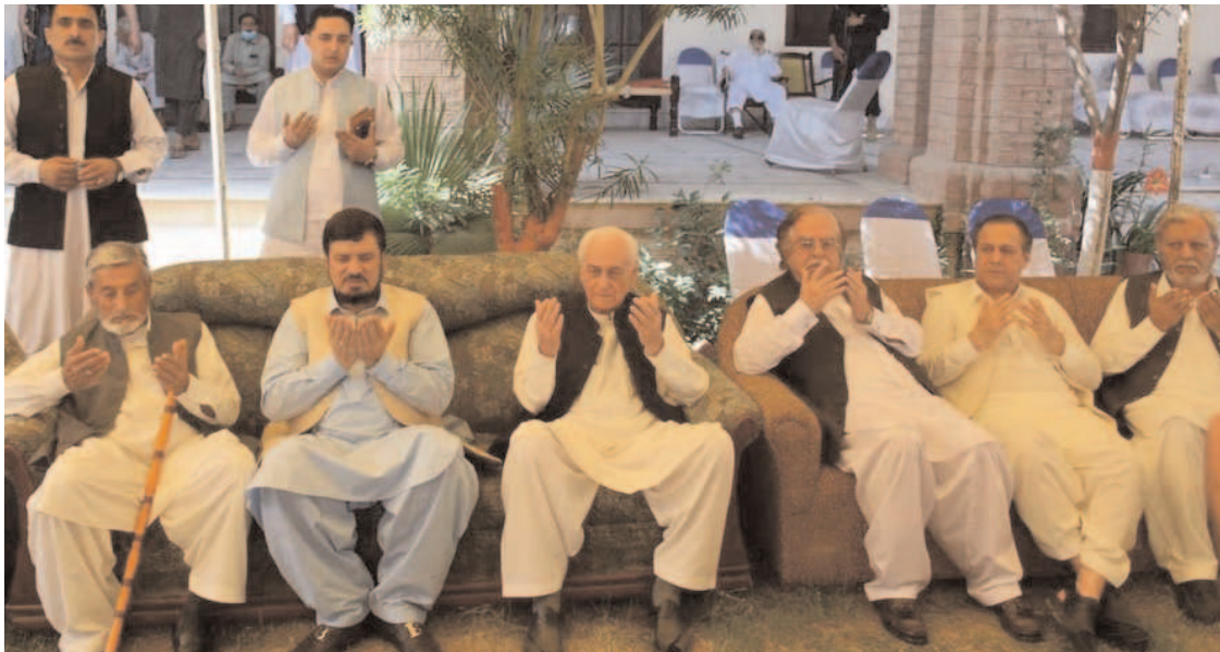
PESHAWAR: Governor Khyber Pakhtunkhwa Haji Ghulam Ali offering fateha for departed soul of nephew of Caretaker Chief Minister Muhammad Azam Khan.

A case has been registered against the arrested accused while further investigation was underway.