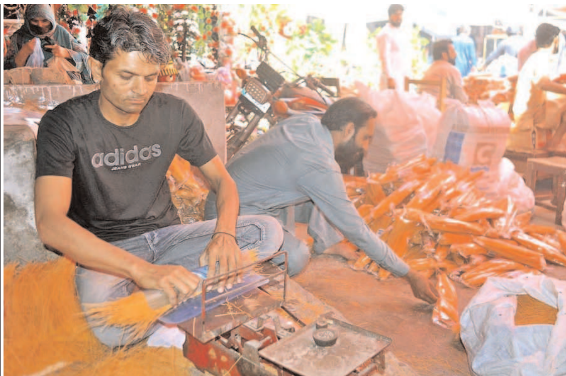
SARGODHA: Vendor weighing vermicelli on scale and packing in plastic bags on his shop.

Payment cards in circulation issued by Banks/MFBs and EMI at the quarter end of Q4-FY22 was 43.0 million which increased to 46.5 million by the end of Q2-FY23. The majority of the issued cards were Debit cards (73.8%) followed by Social Welfare cards (21.8%), Credit cards (4.1%) and Prepaid cards (0.2%).