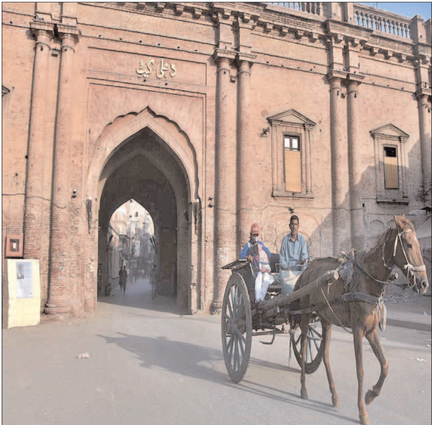
LAHORE: A student passenger traveling on a traditional horse-drawn carriage (tanga swari) passes through Delhi Gate.

According to the vision of Punjab Health Department, the DG Health briefed in detail about the provision of quality medical facilities to the public and prevention of diseases.