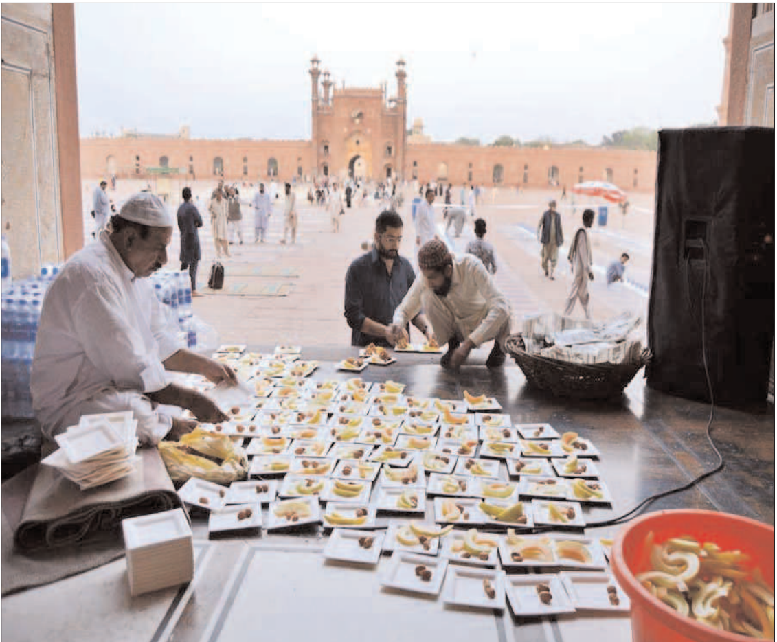
LAHORE: Volunteers distributing food among people to break their fast in Badshahi Masjid.

LAHORE (APP): The current heat wave is likely to be subsided as the Met office has predicted a wet spell from Saturday to Wednesday which may drop maximum temperature 5-8 degree Celsius.According to a spokesman for the Pakistan Meteorological Department, a westerly wave is likely to enter upper parts of the country on April 15 and would spread in western and central parts subsequently.