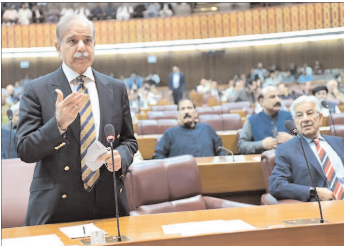
ISLAMABAD: Prime Minister Shehbaz Sharif addressing a session of the National Assembly.