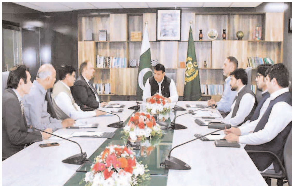
ISLAMABAD: Adviser to PM Engr Amir Muqam chairing progress review meeting of SNGPL ongoing development schemes in KP at National Heritage & Culture Division.

that efforts were underway to provide a hygienic environment to the city's residents. In addition, he said that today, the communication teams distributed waste bags and pamphlets in various areas of all tehsil of the district to highlight the importance of cleanliness and dengue prevention. To eradicate dengue larvae, he added that comprehensive Standing Operating Procedures (SOPs) and an action plan were being followed, and weekly reports were being submitted to the city district government and the government of Punjab. Furthermore, he urged the residents to keep an eye on junkyards, schools and under-construction buildings, which led to the spread of dengue larvae and left no place wet or stagnant water. In case of any complaint, citizens were asked to register their complaints on helpline number 1139, which would be rectified immediately, he added.