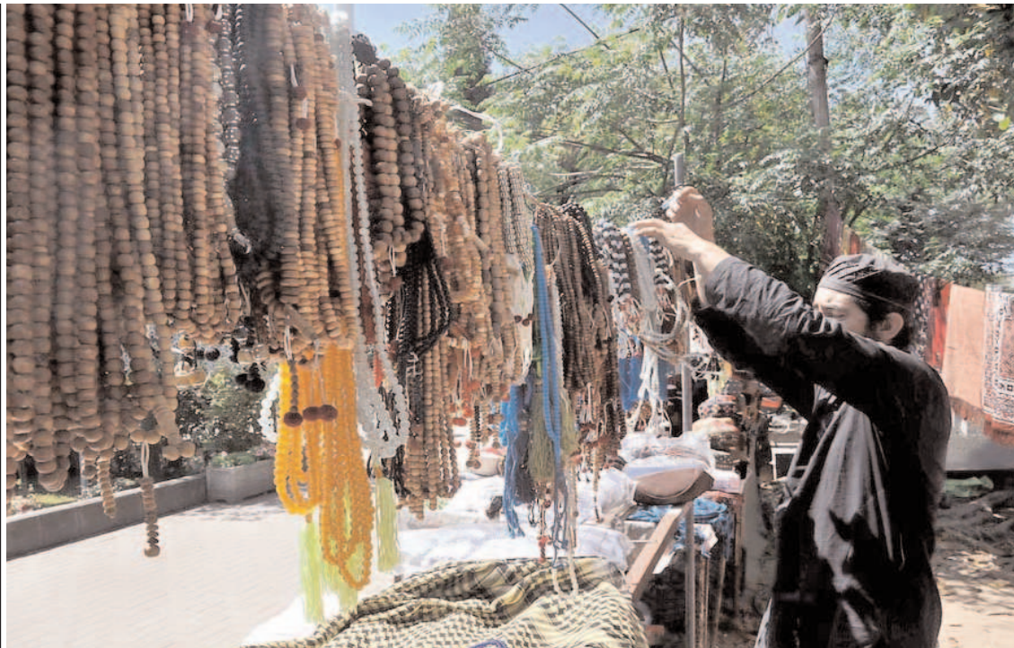
ISLAMABAD: A vendor arranging and displaying tasbeeh (prayer beads) to attract the customers outside masjid at Aabpara during holy month of Ramzan.

(0.03%). On a year-on-year (YoY) basis, the commodities which recorded an increase in their average prices included Cigarettes (165.88%), Wheat Flour (131.72%), Gas Charges for Q1 (108.38%), Diesel (102.84%), Eggs (98.34%), Tea Lipton (97.63%), Rice Basmati Broken (84.92%), Bananas (82.23%), Petrol (81.17%), Rice Irri-6/9 (80.61%), Pulse Moong (68.14%), Potatoes (65.95%), Pulse Mash (56.70%) and Onions (55.75%). The commodities that witnessed a decrease in prices on a YOY included f Tomatoes (50.39%) and Chillies Powdered (6.48%).