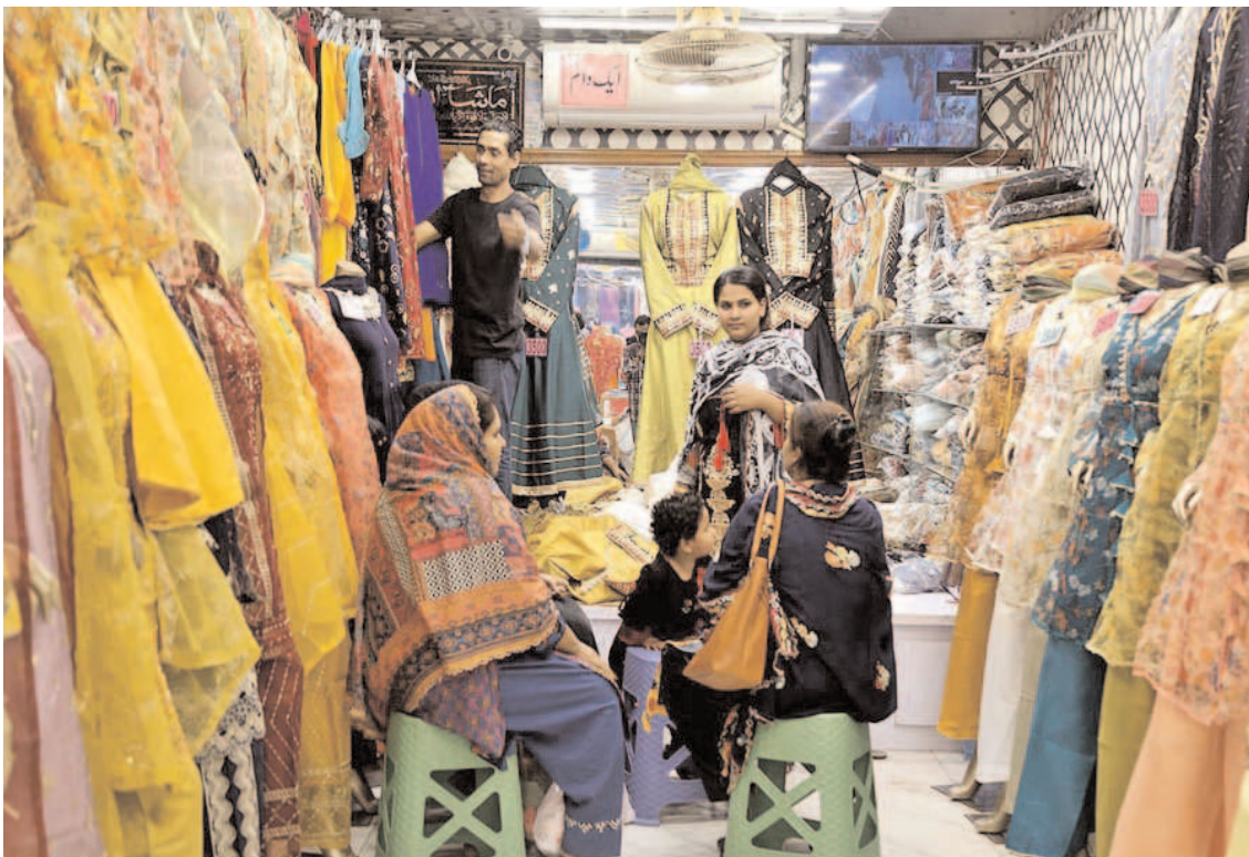
HYDERABAD: Women busy in selecting and purchasing dresses for preparation of upcoming Eid-ul-Fitr at Resham Bazaar.

ISLAMABAD (INP): Former President of the IICCI Dr. Shahid Rasheed Butt on Friday criticizing SBP said the increase in interest rates to 21 percent by the central bank is a wrong decision. According to the issued press release, he said that this move will not reduce inflation or bring economic stability, nor will it pave the way for the loan from the IMF. Butt said that the current inflation in Pakistan is not related to current account deficit or excess capital in the market, but to government policies, including increased taxes and amplified prices of oil, electricity, and gas.