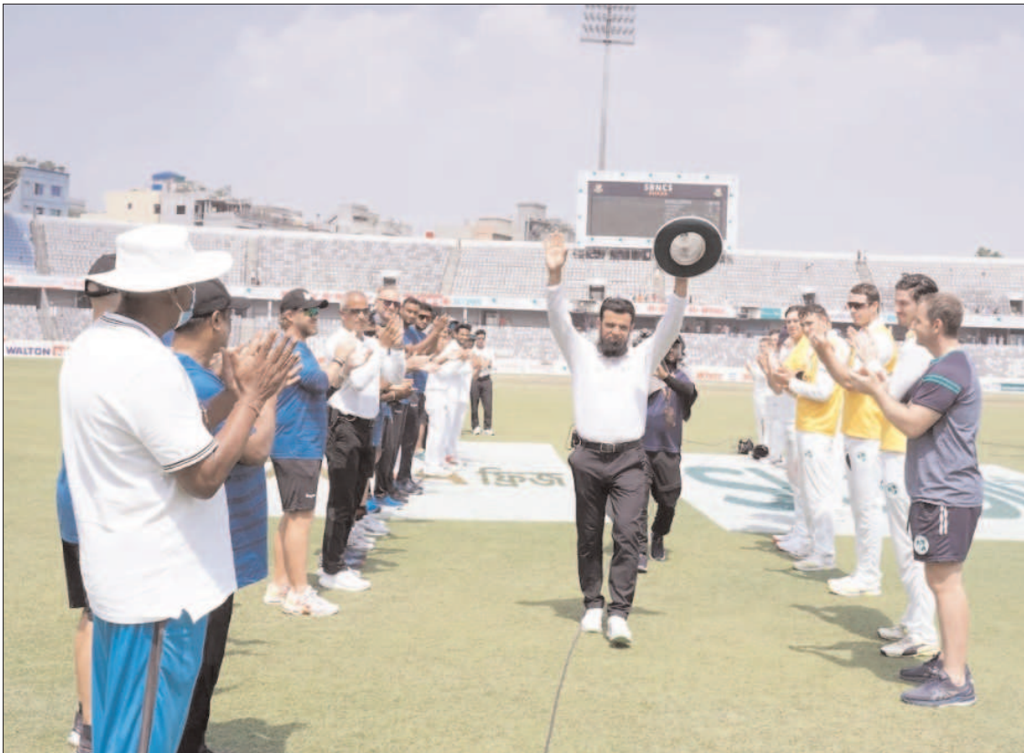
MIRPUR: Bangladesh and Ireland line up in a guard of honour for umpire Aleem Dar, Bangladesh vs Ireland Only Test, 4th day.

MELBOURNE (INP): Australia opener David Warner is in the frame for the World Test Championship final against India but selectors' boss George Bailey declined to back him as an automatic inclusion for the Ashes squad. Selectors will pick a wider squad in about two weeks for the WTC decider at The Oval from June 7-11 and for the first two Tests of the Ashes series, which starts on June 16 in Birmingham. Apart from a defiant 200 against South Africa in December, left-hander Warner has struggled for runs in recent Tests, making a total of 26 in three innings in the recent tour of India before returning home injured.