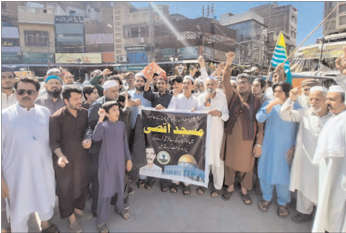
PESHAWAR: Activists of Tehreek Awaz-e-Haq holding a protest against Israeli forces attack on Al-Aqsa mosque.

In a notification, the KP Higher Education Department said on Friday that Vice Chancellor Swabi University has been given the additional charge of VC Women University Swabi. Likewise, VC University of Lakki Marwat has been accorded additional charge of Vice Chancellor University of Science and Technology Kohat. The Vice Chancellor Gomal University Dera Ismail Khan has been given the additional charge of Vice Chancellor University of Agriculture D I Khan. The notification said the appointments have been made for a period of three months or till appointment of regular VCs on these posts.