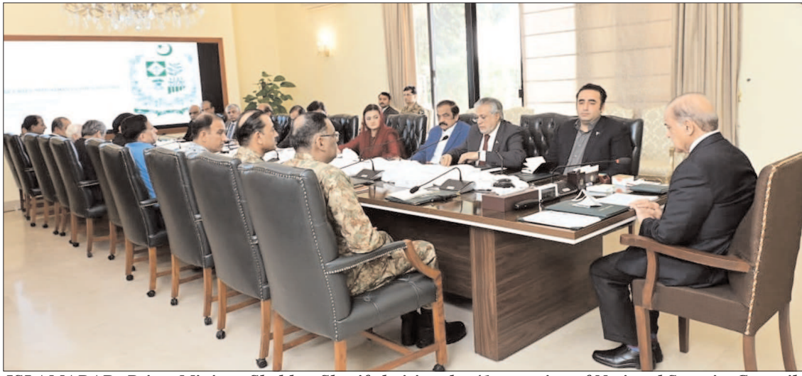
ISLAMABAD: Prime Minister Shehbaz Sharif chairing the 41st meeting of National Security Council.

The committee strongly condemned the increasing hatred and division in society and attempts to spread foreign-sponsored poisonous propaganda on social media against the state institutions and their leadership to achieve hidden targets and stated that those attempts were affecting national security. While expressing resolve to fail the heinous designs of the enemies of the country, the committee said every effort would be made to maintain peace which was achieved with the supreme sacrifices and constant endeavours of the martyrs.