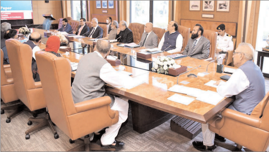
ISLAMABAD: President Dr. Arif Alvi chairing the 4th meeting of the Senate of the Health Services Academy, at Aiwan-e-Sadr.

The court ordered to use machines to remove residue of crops instead of burning them. It also ordered to make a policy in this regard and ensure its implementation and strict monitoring so that no one could burn residue.