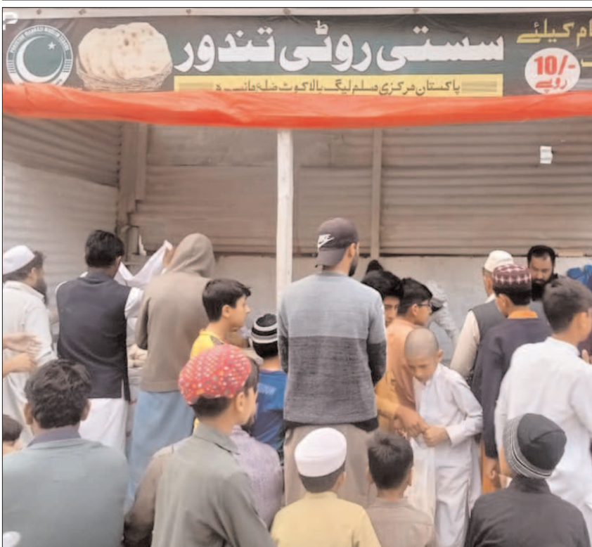
BALAKOT: People getting bread from Sasta Roti Tandoor.

The delegation raised the matters related to students' issues at the varsity with the vice chancellor. The JI leaders said that they wanted the varsity to become a hub of standard education. The VC welcomed the JI suggestions.