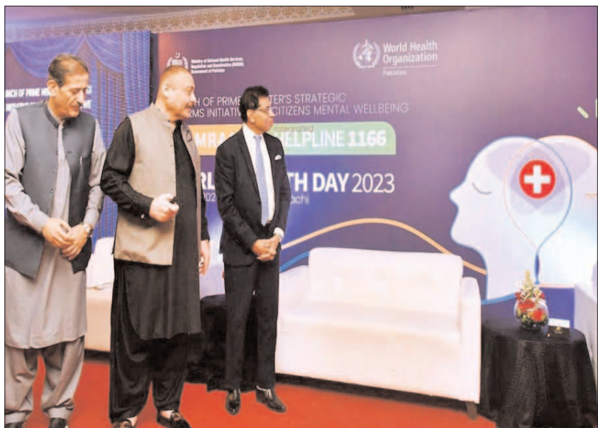
KARACHI: Federal Minister for Health Abdul Qadir Patel addressing the launching ceremony of PM Strategic reforms initiative for citizens mental wellbeing web based application (Humraz) and Integrated helpline 1166 on world Health day 2023.