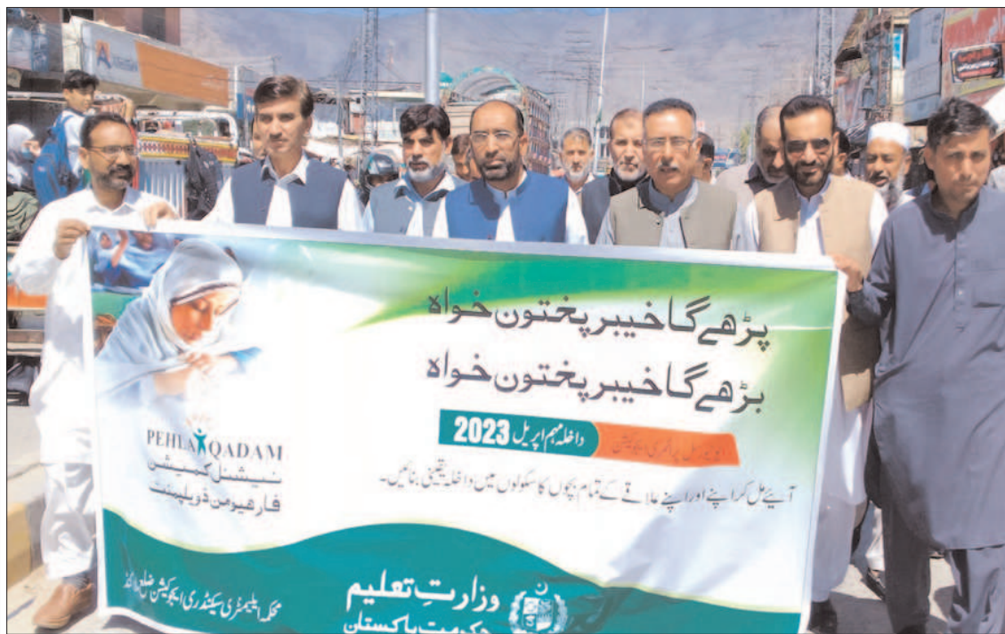
DARGAI: Members of Education Department and NCHD holding a rally on education awareness.

She further said that the elections of national and provincial assemblies should be held at the same time, as the country's economic situation cannot afford repeated elections. The recent crisis is not political, economic, security, but unfortunately, it is becoming a state crisis, which is a very dangerous situation for the country and the country cannot afford this situation in any way.