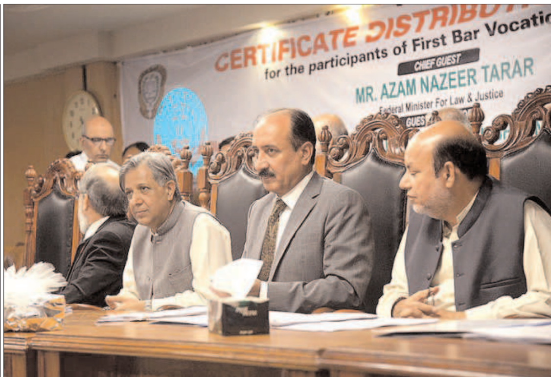
LAHORE: Federal Minister for Law Nazir Tarar, former President Supreme Court Bar Ahsan Bhoon participates in the certificate giving ceremony at the Punjab Bar Council.