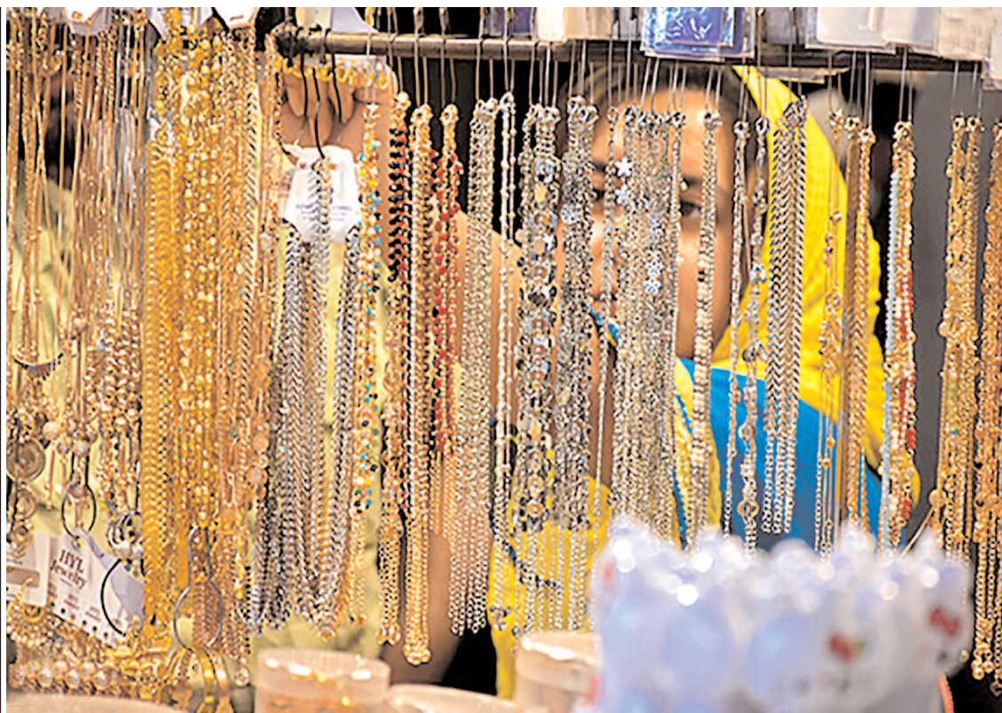
ISLAMABAD: Woman buying jewelry from stall at Karachi Company Market during the upcoming Eid preparation.

Earlier, a tweet posted on Sadpara's account on Friday said he was at Annapurna's camp four at the time along with the rope fixing team of Seven Trek's summit.