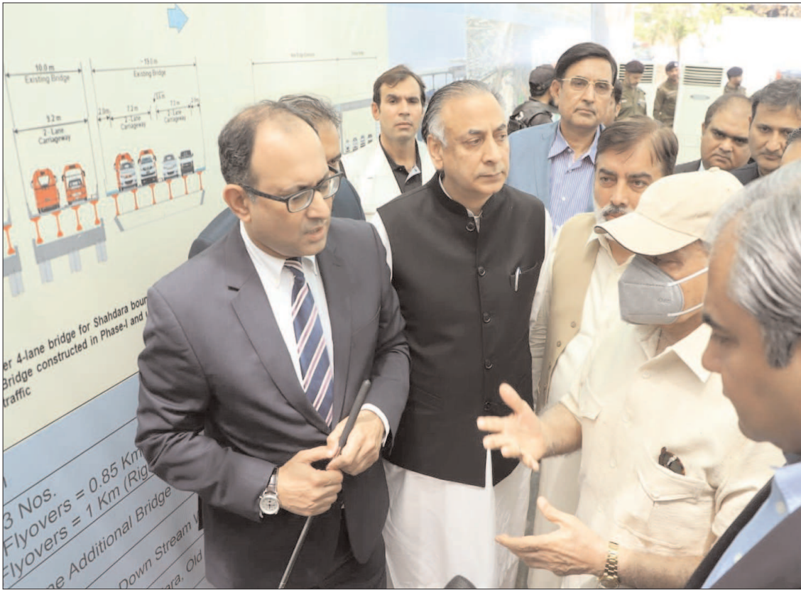
LAHORE: Prime Minister Shehbaz Sharif receiving briefing regarding construction of Imamia Colony Railway Crossing Flyover, Shahdara.

Vol. XXXIX No. 90 Regd. No. 241 RAMAZAN 25 1444 -- SUNDAY, APRIL 16 2023 PESHAWAR EDITION 12 PAGES Price. 20