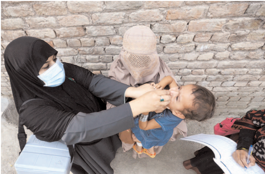
PESHAWAR: Polio health worker administering drops to a child during polio vaccination campaign.