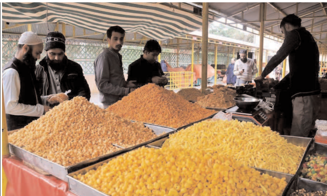
ISLAMABAD: People purchasing food stuff for iftari at sasta bazaar.

The Finance Minister thanked the President AIIB for his continuous support to Pakistan for the sustainable economic development of the country.