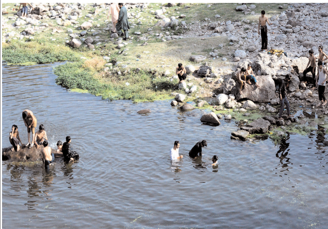
ISLAMABAD: Youngers bathing in Rawal Lake to cool them during high temperatures in the month of holy Ramadan.