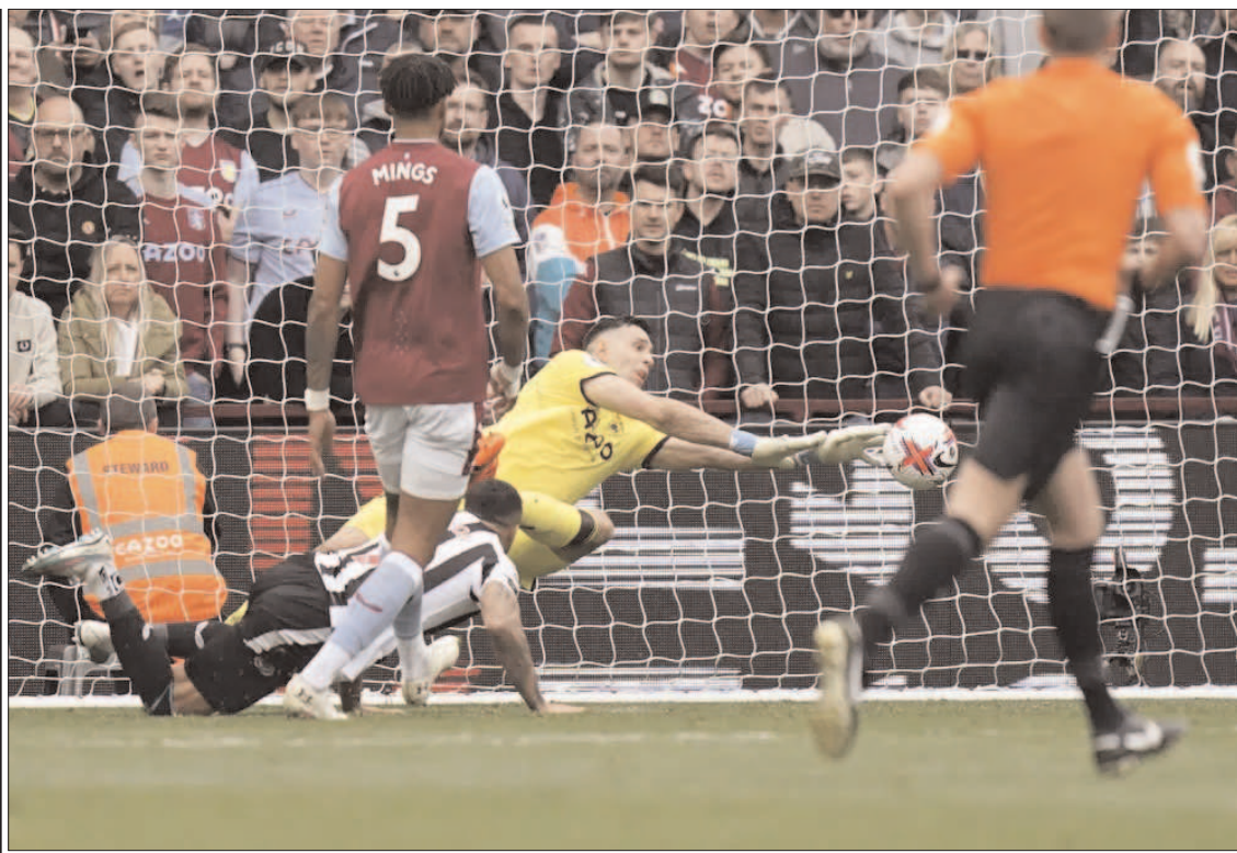
BIRMINGHAM: Aston Villa goalkeeper Emiliano Martinez saves Newcastle United's Callum Wilson's, left, shot during the English Premier League soccer match.

After the conclusion of the Afghanistan T20I series, in which Pakistan lost by 2-1, stand-in skipper Shadab Khan gave comments about the importance of senior players in the team and it sparked controversy on social media.