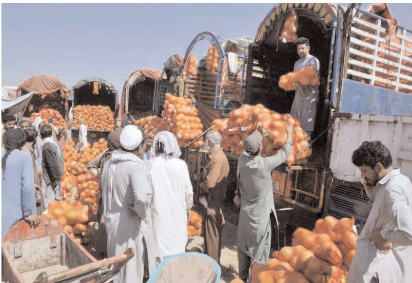
ISLAMABAD: People purchasing melon at fruit and vegetable market.

The US dollar increased to 0.8939 Swiss francs from 0.8882 Swiss francs, and it rose to 1.3360 Canadian dollars from 1.3339 Canadian dollars.