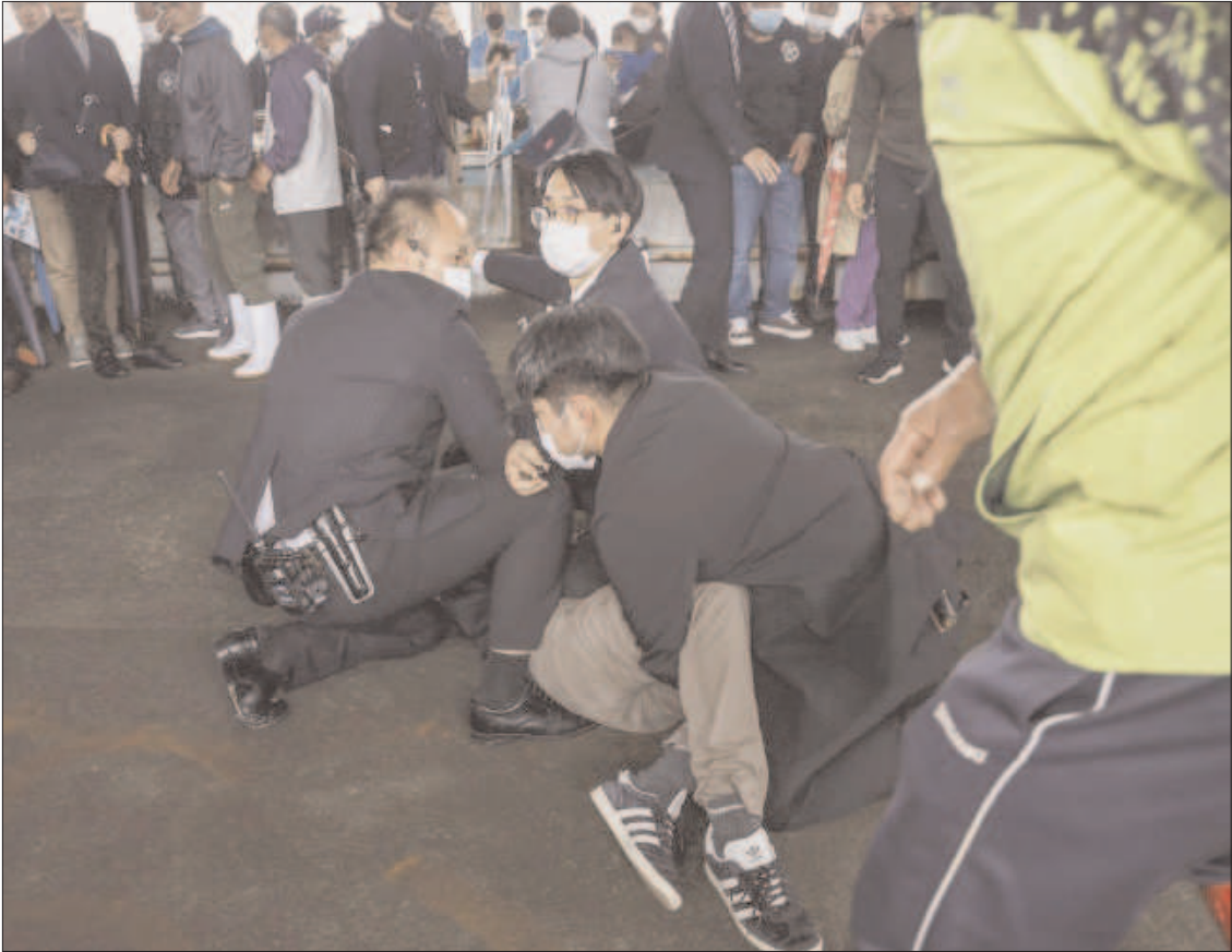
TOKYO: A man, believed to be a suspect who threw a pipe-like object near Japanese Prime Minister Fumio Kishida during his outdoor speech, is held by police officers at Saikazaki fishing port in Wakayama, Wakayama Prefecture, south-western Japan.