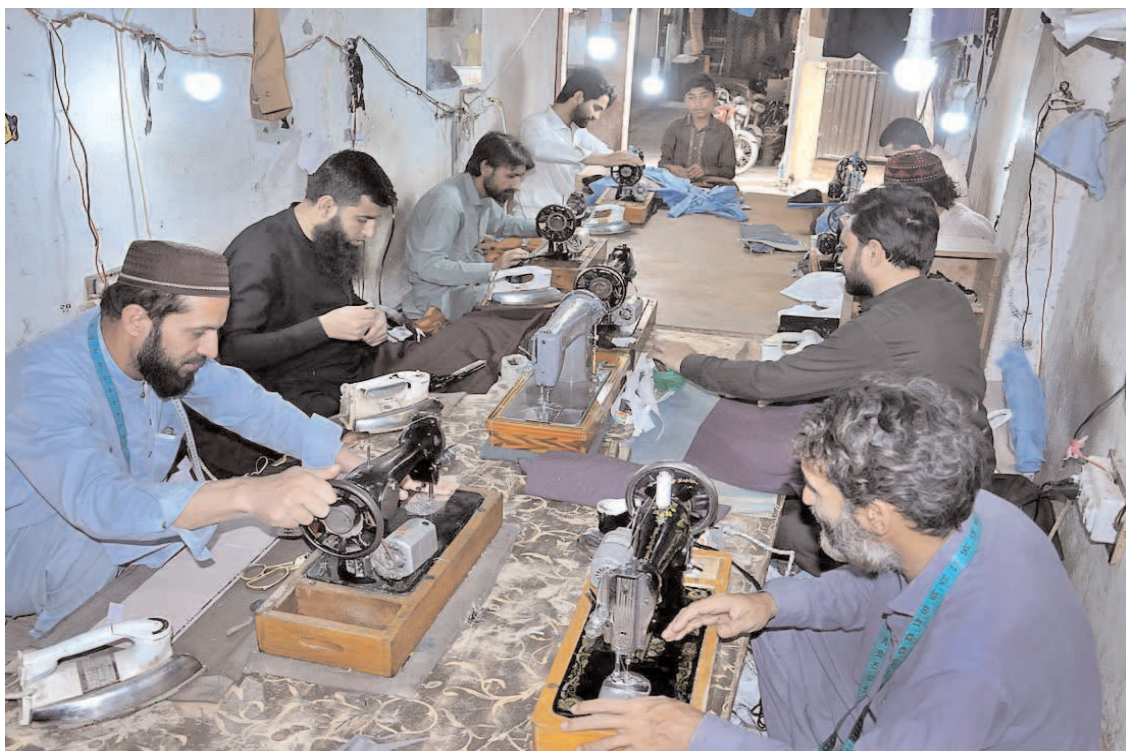
ISLAMABAD: Tailors busy in stitching clothes in connection with upcoming Eid ul Fitr Festival at Khana pull.

RAWALPINDI (APP): Anti-Narcotics Force (ANF) in five operations managed to recover over 195 kg drugs, 1840 intoxicated tablets and arrested five accused, said an ANF Headquarters spokesman. He informed that in two operations at Rawalpindi International Mail Office, ANF recovered 1840 intoxicated tablets from two parcels being sent to London. In an operation at Bacha Khan International Airport, 83 heroin-filled capsules were recovered from the possession of a Dubai-bound passenger resident of Khyber. In another operation conducted in Khyber area, ANF and FC recovered 27 kg charras concealed in plastic bags. In fifth operation, ANF conducted a raid near Hub Winder RCD Highway and foiled a bid to smuggle drugs from Quetta to Karachi. 168 kg charras was recovered during the operation from secret cavities of a bus while four accused residents of Quetta were also sent behind the bars. He said that separate cases have been registered against the accused while further investigations are under process.