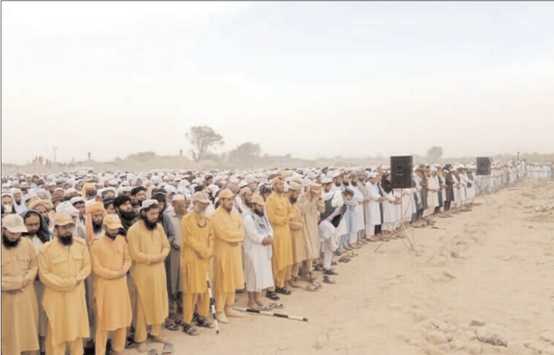
LAKKI MARWAT: JUI-F leaders, workers and others attend the funeral prayers of Religious Affairs Minister Mufti Abdul Shakoor in Lakki Marwat .

He said that the problems could not be solved on the streets, therefore the Opposition should leave the politics of abuse and threats and sit in discussions and the present the demand for elections with political understanding. Regarding the separate election in Punjab and KPK, he said that elections should be held in the whole country one day otherwise the country will go towards further instability. But even if action is taken, PPP is fully prepared for it. Rather, we have also short-listed the names of our candidates, he added.