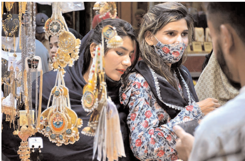
HYDERABAD: Girls selecting and purchasing jewelry during shopping in preparation of upcoming Eid-ul-Fitar at Resham bazaar.

However, she added, after developing differences with Jamali the accused persons warned him against visiting their locality in the future.