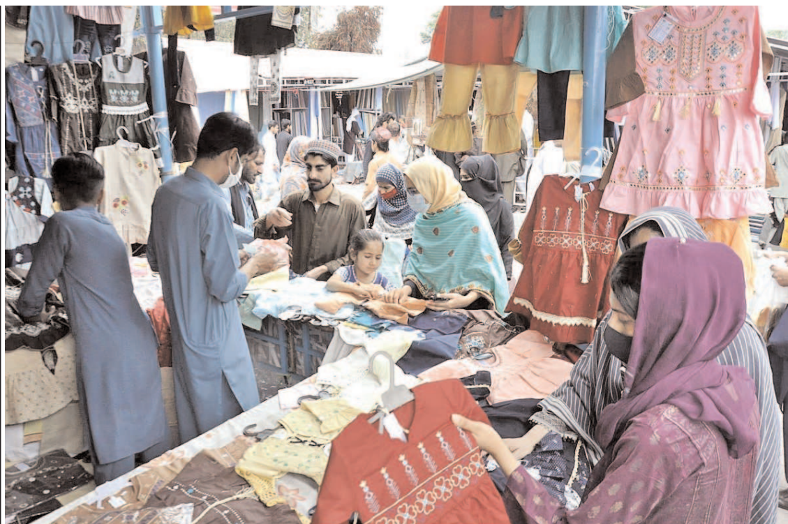
ISLAMABAD: Women selecting and purchasing dresses for preparation of upcoming Eid-ul-Fitr.

With dampened imports, the current account deficit is projected to narrow to 2pc of GDP in the fiscal year 2023 but widen to 2.2pc of GDP in the fiscal year 2025 as import controls ease. The fiscal deficit is projected to narrow to 6.7pc of GDP in the fiscal year 2023 and further over the medium term as fiscal consolidation takes hold. The macroeconomic outlook is predicated on the completion of the IMF program, sound macroeconomic policy, continued