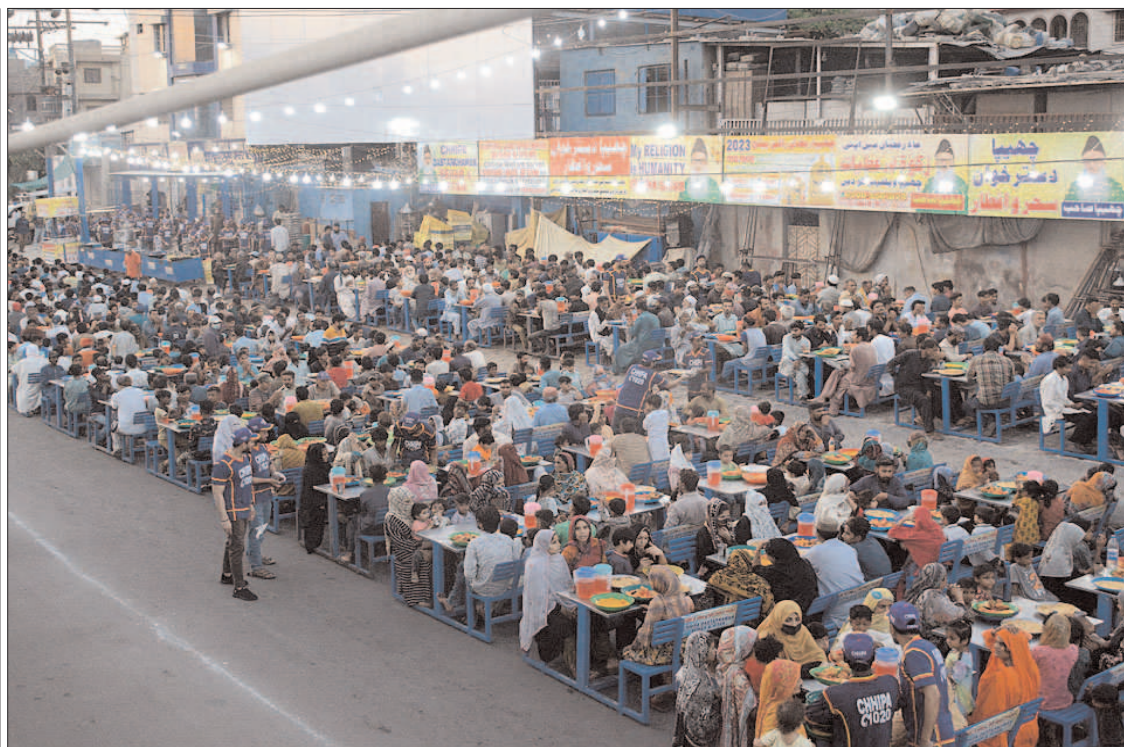
KARACHI: A large number of people are sitting and waiting to break their fast during the Holy Month of Ramadan at Chippa Welfare Association Office.