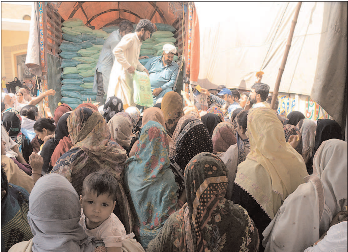
LAHORE: People are receiving free bags of flour from a distribution center organized by the Federal Government.

He said the issue of labor for zig-zag technology has also been resolved after repeated training sessions with the labor. "Kiln industry makes up almost two percent of the GDP also employing five million people. Therefore, it should be paid proper heed to reduce production cost and ensure quality produce." Earlier, the brick kiln industry in the country was unregulated and operating across Pakistan especially in rural areas with very limited environmental and social compliance. But, with rising awareness on environmental issues and introduction of new techniques, the brick kiln owners have to finally opt for a modern and cleaner technology not only to earn better but also to reduce air pollution and ensure better environment for the people.