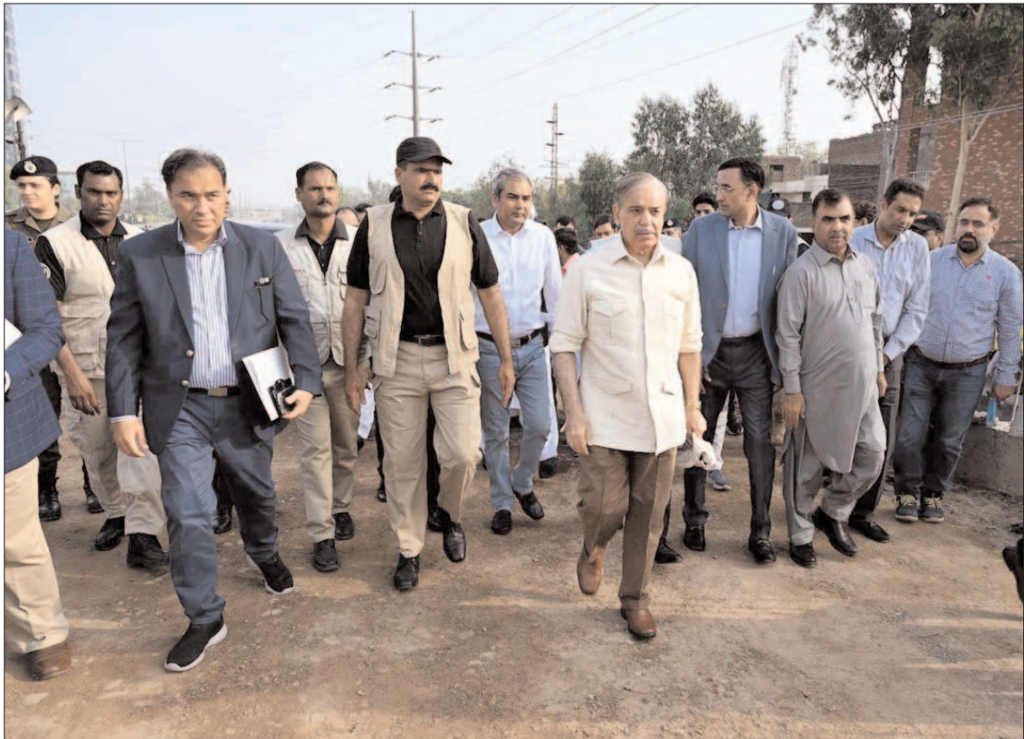
LAHORE: Prime Minister Muhammad Shehbaz Sharif visiting Lahore Bridge Construction site.