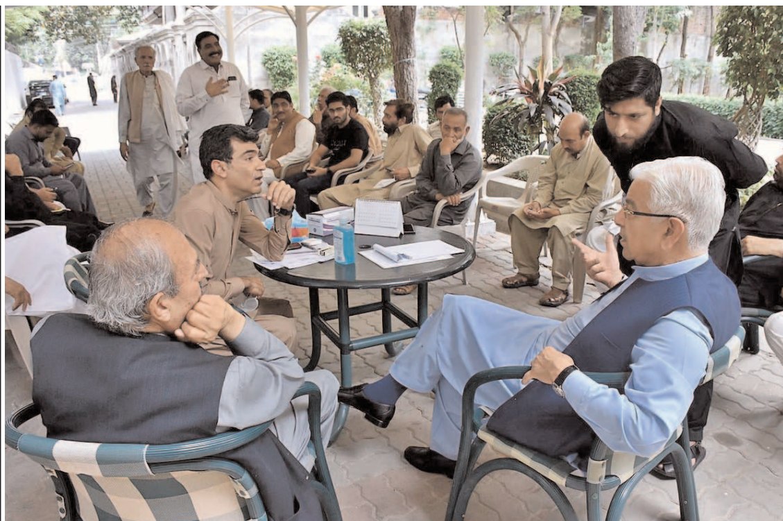
SIALKOT: Federal Minister for Defence Khawaja Muhammad Asif held khuli kachehri for listening to public's problem at his residence.

Food business owners were selling ice creams made with substandard ingredients while fake labelling was being used for the packaging.