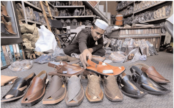
PESHAWAR: Shopkeeper arranging and displaying traditional men's footwear Peshawari Chappal at his shop to attract customers ahead of Eid-ul-Fitr.