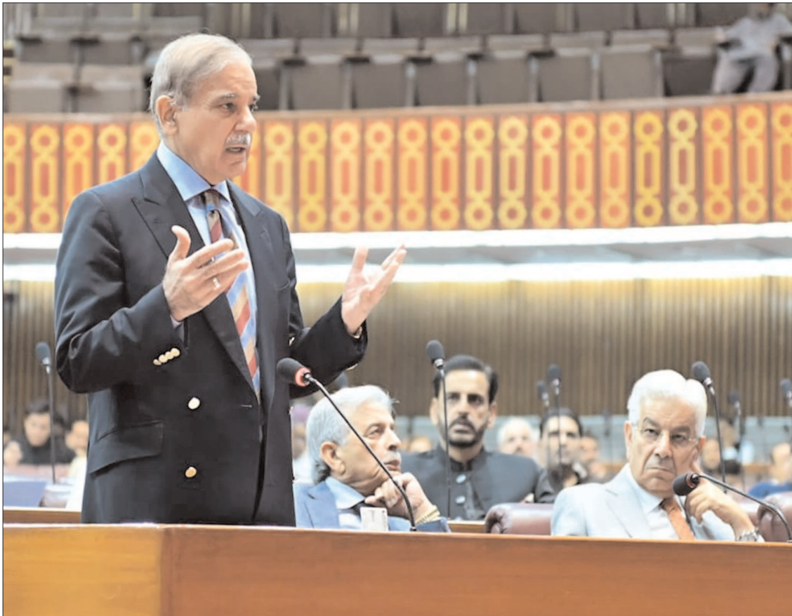
ISLAMABAD: Prime Minister Shehbaz Sharif addressing the National Assembly at Parliament House.

Vol. XXXIX No. 92 Regd. No. 241 RAMAZAN 27 1444 -- TUESDAY, APRIL 18 2023 PESHAWAR EDITION 12 PAGES Price. 20