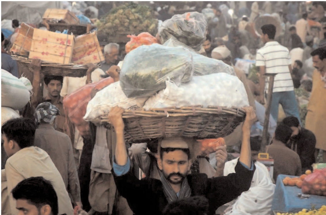
LAHORE: Labourers carrying basket of vegetables on his head to earn livelihood at Vegetable Market.