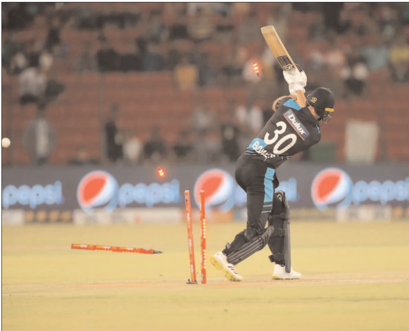
LAHORE: Chad Bowes has his stumps destroyed, Pakistan vs New Zealand, 3rd T20.

LONDON (Agencies): Arsenal captain Kim Little will miss the rest of the season after suffering a hamstring injury in their Women's Champions League quarter-final win. The midfielder, 32, was substituted 12 minutes into the second leg against Bayern Munich in March, which Arsenal won 2-0 to triumph 2-1 on aggregate. Arsenal visit Wolfsburg for the first leg of the semi-final on Sunday, 23 April and play the home leg on 1 May.