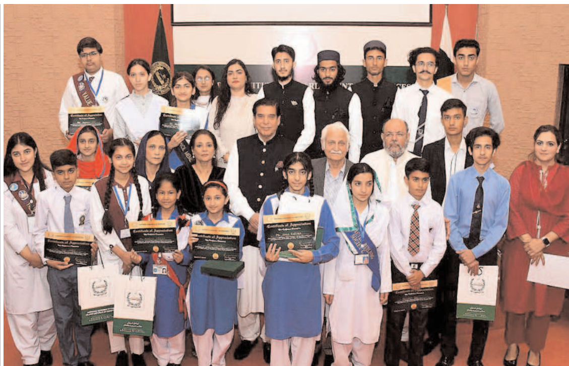
ISLAMABAD: Speaker National Assembly Raja Pervaiz Ashraf in a group photo with the participants of the Final Round of the National Bilingual Declamation contest in-connection with Golden Jubilee Celebrations of Constitution of Islamic Republic of Pakistan at PIPS.

He said that separate cases have been registered against the accused while further investigations are under process.