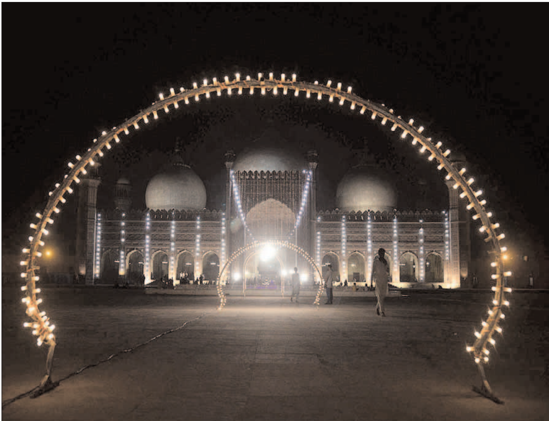
LAHORE: An illuminated view of a Badshahi Masjid decorated with colorful lights in connection with Shab-e-Qadr (Laila Tal Qadr).