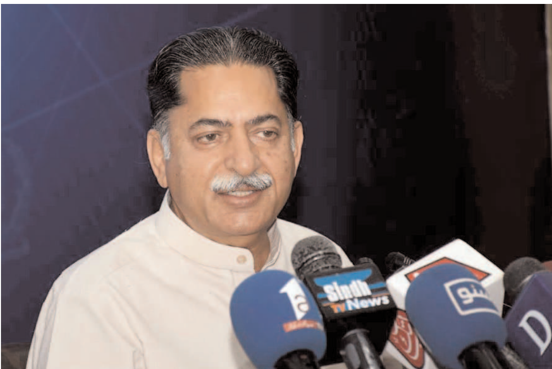
ISLAMABAD: Federal Minister Mian Javed Latif addressing a press conference at PID.

Finally, the fifth and last special train will run from Lahore to Karachi on April 27, enabling passengers to travel from Lahore to Karachi with ease and comfort.