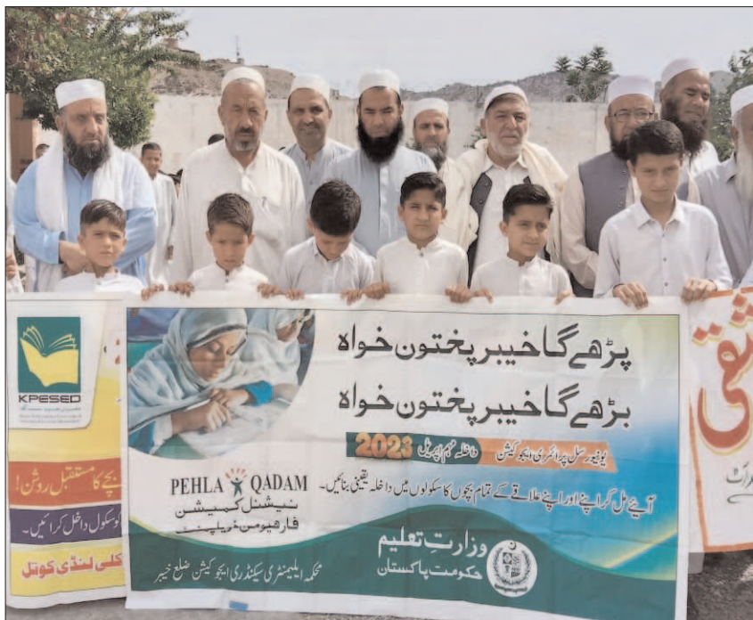
LANDI KOTAL: People holding banners during a school enrollment walk.

DPO asked the policemen to be vigilant and accompany polio teams till the end of day long activity every day. He directed his subordinate officials and cops to implement the security plan in letter and spirit and bring suspects and law breakers into clutches of law.