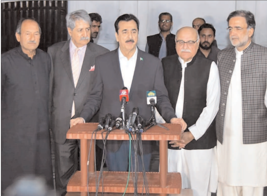
ISLAMABAD: Three members dialogue committee of PPP headed by Syed Yousaf Raza Gillani and ANP leaders addressing a press conference.