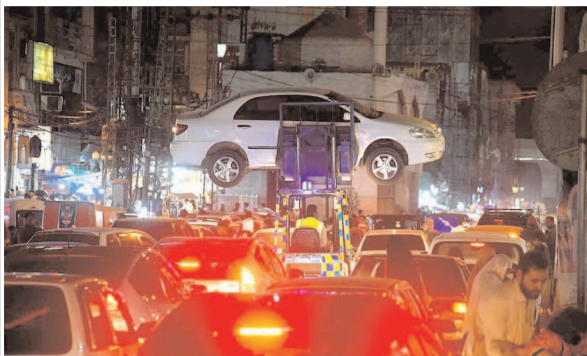
PESHAWAR: Traffic police warden removing wrongly parked vehicle with help of fork lifter at Cantt Bazaar.