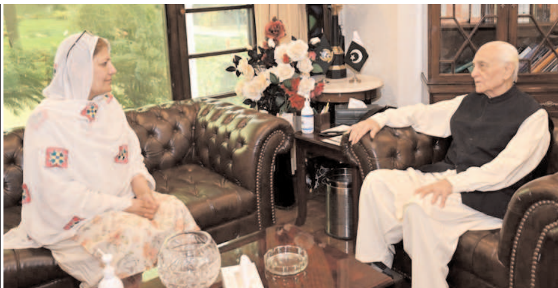
PESHAWAR: Special Assistant on Social Welfare Salma Begum meeting with Chief Minister Khyber Pakhtunkhwa Muhammad Azam Khan.

The Chief Justice emphasized that her main focus would be on courts and jails, and even though the jails were overcrowded, the Superintendent Jail must show exemplary conduct towards the inmates. She also announced that she would regularly make surprise visits to jails in the future for the betterment of the accused.