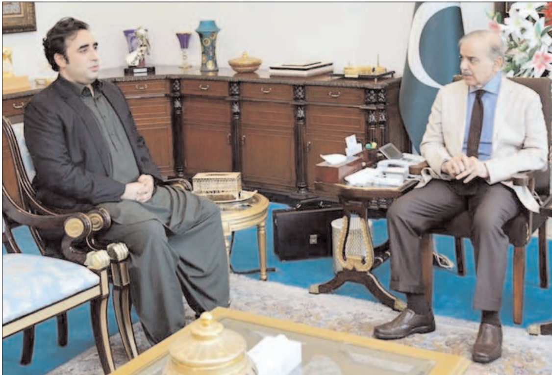
ISLAMABAD: Minister for Foreign Affairs, Bilawal Bhutto Zardari called on Prime Minister Shehbaz Sharif.

As per details, the Lahore High Court announced the reserved verdict. A five-member bench headed by Justice Ali Baqar Najafi heard the Imran Khan plea against the summons notices in 140 cases and inquiries. The court clarified that according to the statement of the Law Officer the court