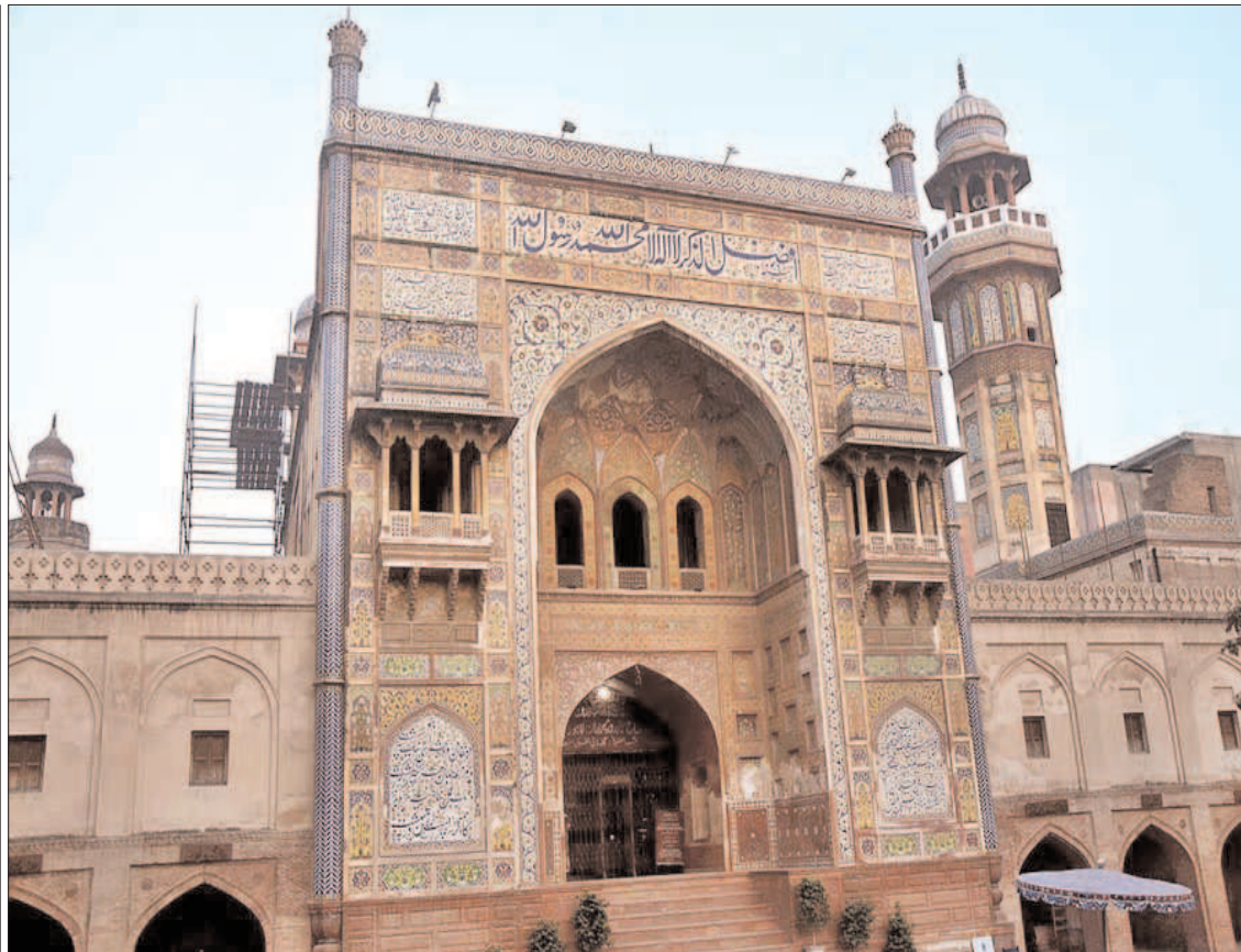
LAHORE: An outer view of entrance gate of Masjid Wazir Khan at walled city.

The orphans had a day filled with joy and entertainment as special activities were arranged for them.