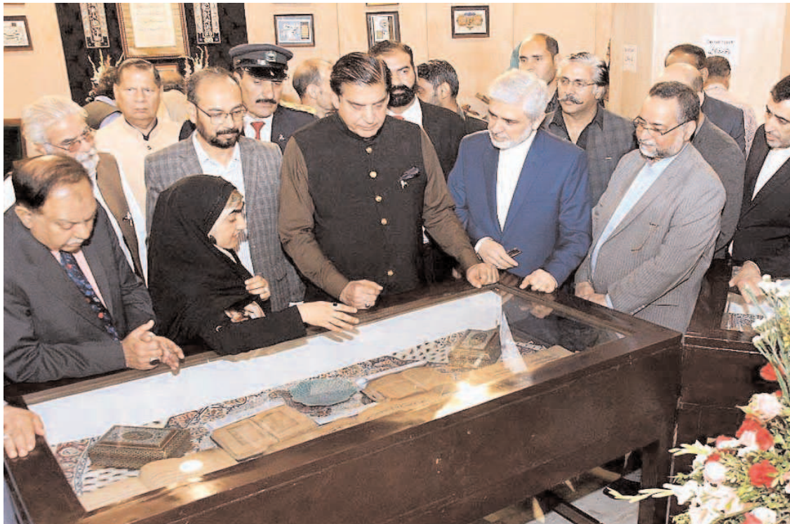
ISLAMABAD: Speaker NA Raja Pervez Ashraf witnessing the Exhibition of rare Manuscripts of the Holy Quran in-connection with the Golden Jubilee Celebrations of the Constitution of Pakistan.