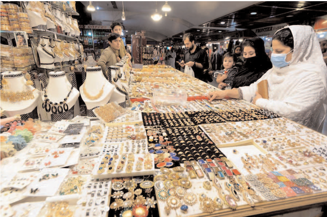
PESHAWAR: Women choosing and buying jewelry in preparation for upcoming Eid ul Fitr festival.

and Rs 75.69, respectively. Gold prices increase by Rs 300 to 217,400 per tola The per tola price of 24 karat gold increased by Rs 300 and was sold at Rs 217,400 on Tuesday against its sale at Rs 217,100 the previous day, the All Sindh Sarafa Jewellers Association reported. The price of 10 grams of 24-karat gold also increased by Rs 257 to Rs 186,385 from Rs 186,128, whereas the price of 10 grams of 22-karat gold went up to Rs 170,853 from Rs 170,618. The price of per tola silver and that of ten-gram silver remained unchanged at Rs 2,530 and Rs 2,170 respectively. The price of gold in the international market dipped by US$ 03 to $2005 against its sale at $2008, the Association reported.