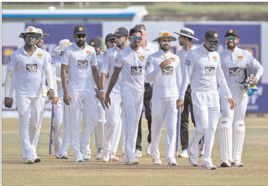
GALLE: Sri Lanka walk back after a mammoth Test win against Ireland.

"But logic would dictate that the position of the sun would have equally impacted other drivers too. It is not a justifiable reason to avoid a penalty for a collision." They added that the other drivers' comments were "not significant or relevant".