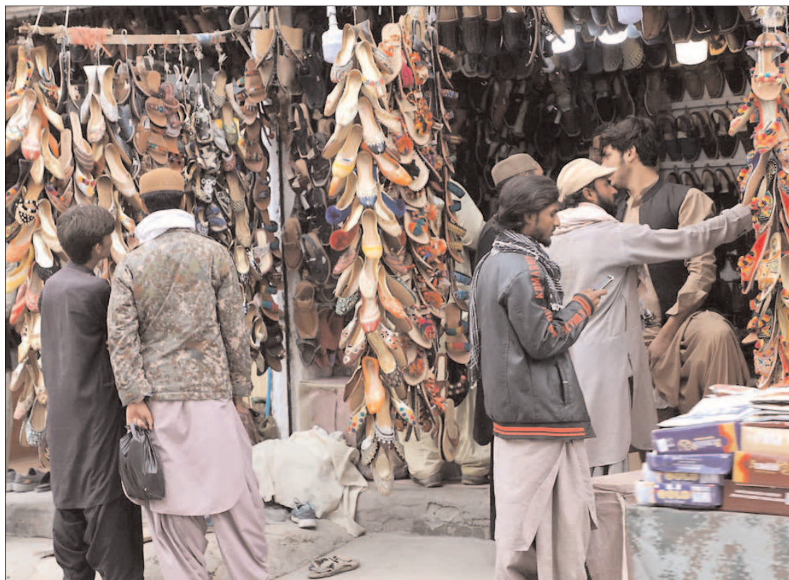
QUETTA: People selecting and purchasing shoes from a shop ahead of Eid.

DSP said that the tourists should respect the traffic rules while traveling. And avoid speeding, he said that if the tourists face any problems during their journey, they should immediately contact the control room of the Lower Dir police on telephone number 09459250048 or traffic in-charge Chakdara on contact number 03453970443 or traffic in-charge Timergara on contact number 03453490896. Get timely police services, he said that the Lower Dir police are trying to promote tourism and all possible measures will be taken to protect the property and life of tourists and in this regard police vehicles will be on the main highway of Lower Dir during Eid. Special patrolling will be done.