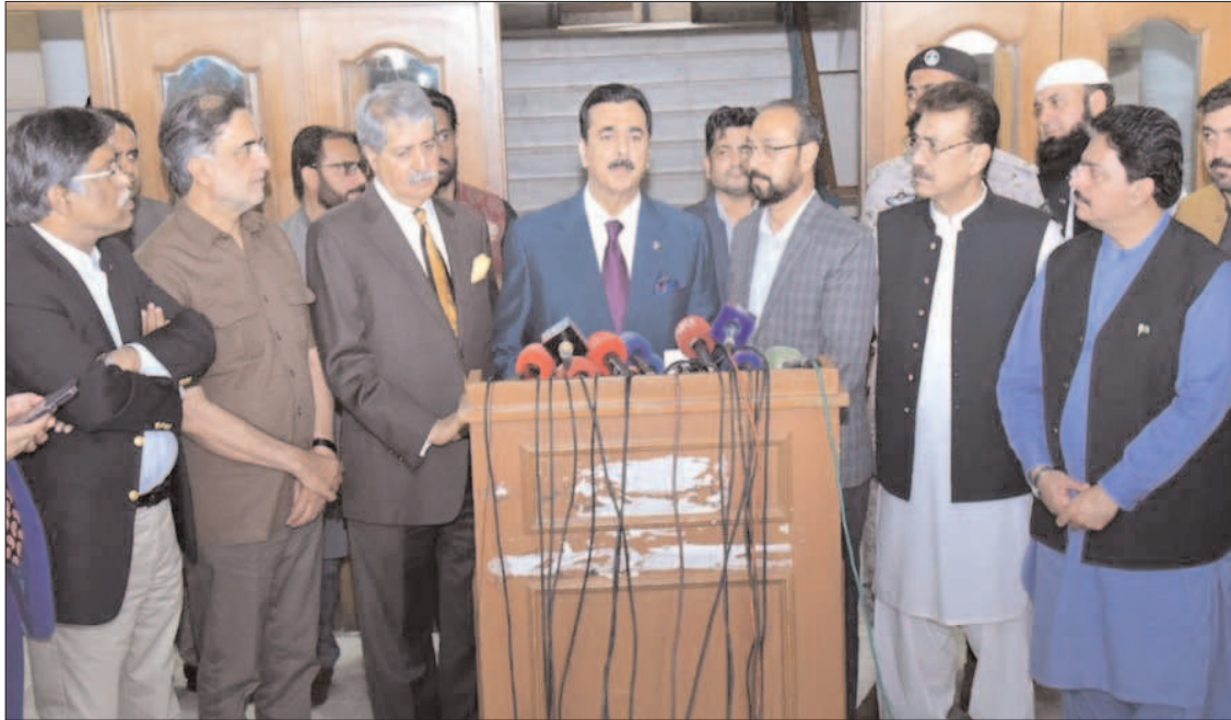
ISLAMABAD: Three members dialogue committee of PPP headed by Syed Yousaf Raza Gillani and leaders of MQM talking to media.

He said, "The message of the delegation will be passed on to the MQM leadership and expressed the hope that these efforts of PPP will be helpful in starting a political discussion in the country." He said, "Elections will be held at the due time." He assured that the MQM would support any such move of allies with the objective to strengthen the democratic system of the country.