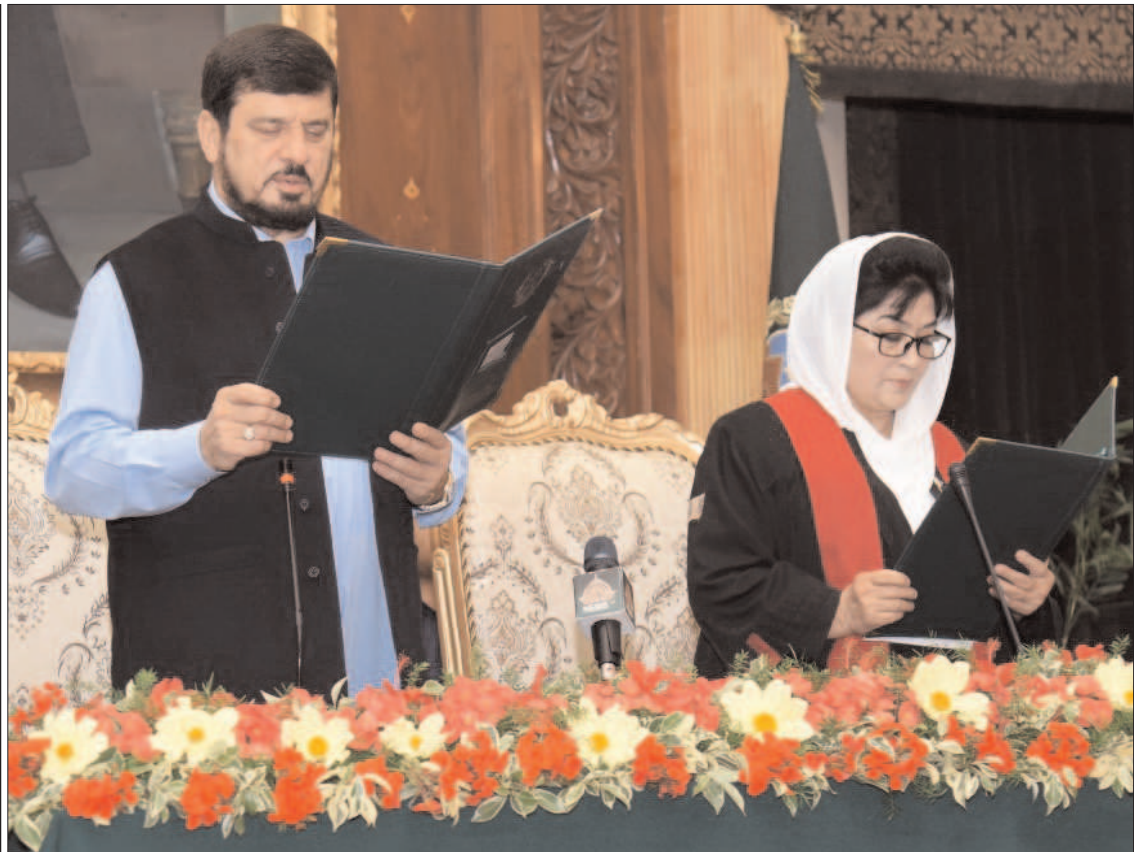
PESHAWAR: Governor Khyber Pakhtunkhwa administering oath from Justice Musart Hilali as first ever women Chief Justice of Peshawar High Court.

On receipt of complete information, the government shall review and decide the final number of intended applicants for Regular Hajj Scheme-2023. Finance Minister Senator Ishaq Dar stated that Hajj was a sacred religious obligation and the Government of Pakistan shall facilitate the Hujjaj in every possible manner.