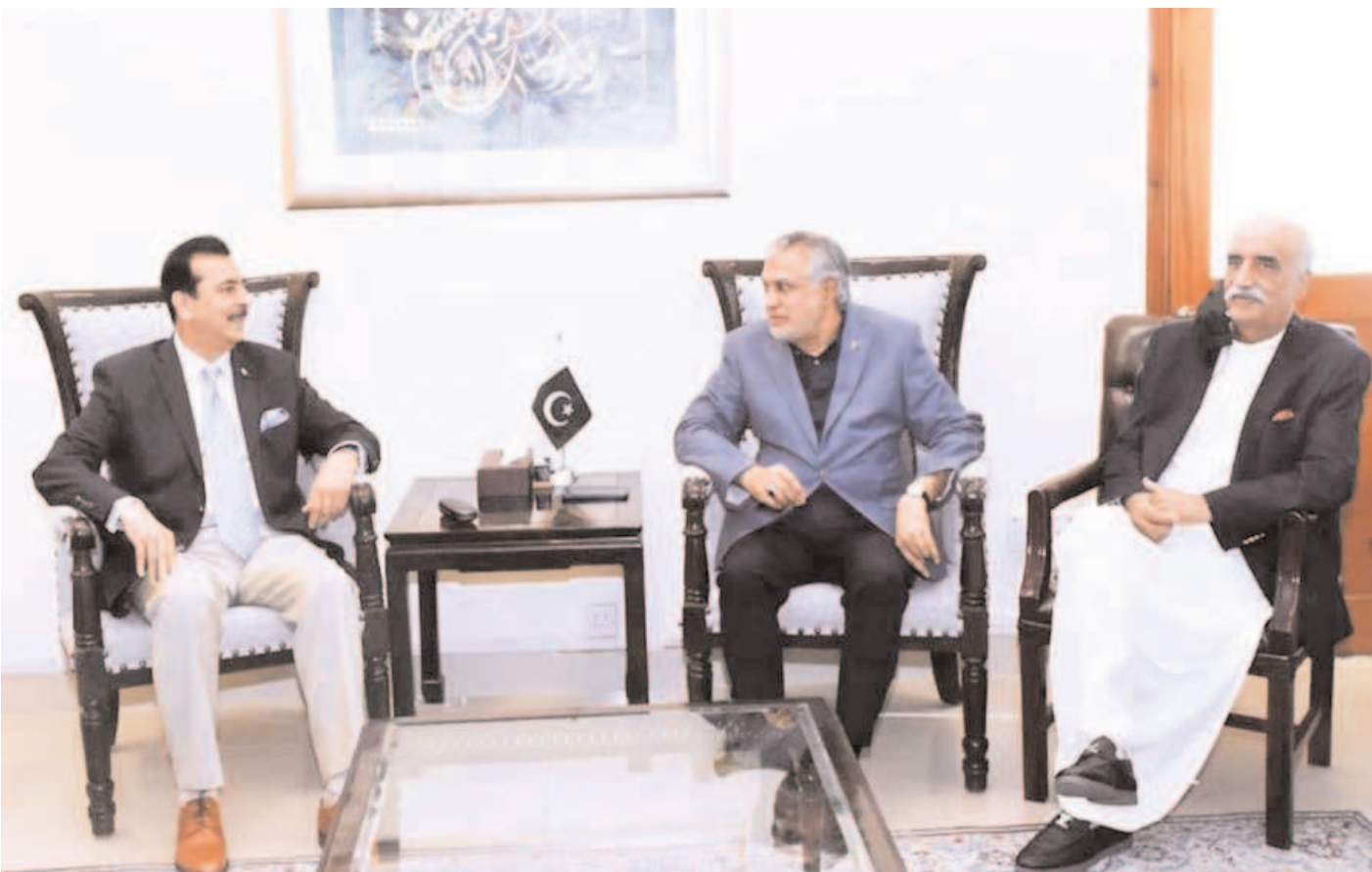
ISLAMABAD: Former Prime Minister Syed Yousuf Raza Gilani and Syed Khurshed Ahmed Shah Federal Minister for Water Resources met Federal Minister for Finance and Revenue Senator Mohammad Ishaq Dar at Finance Division.

The Speaker and the Deputy Speaker offered their condolences to the families of the martyred personnel and prayed for their elevated ranks in the hereafter. They also expressed solidarity with the bereaved families and assured them that the entire nation stands with them in this hour of grief.