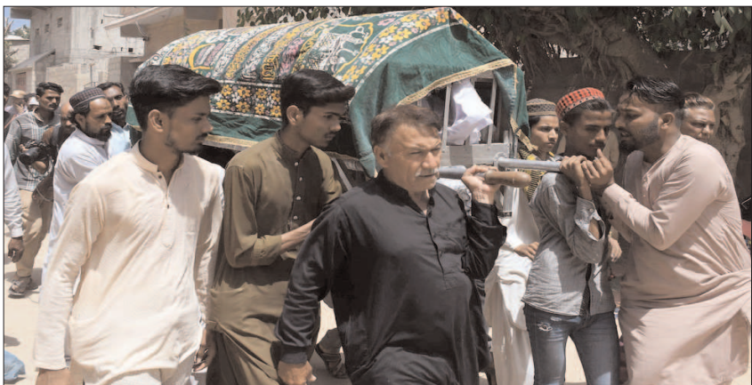
KARACHI: People carrying the coffin victim of stampede for funeral prayer.