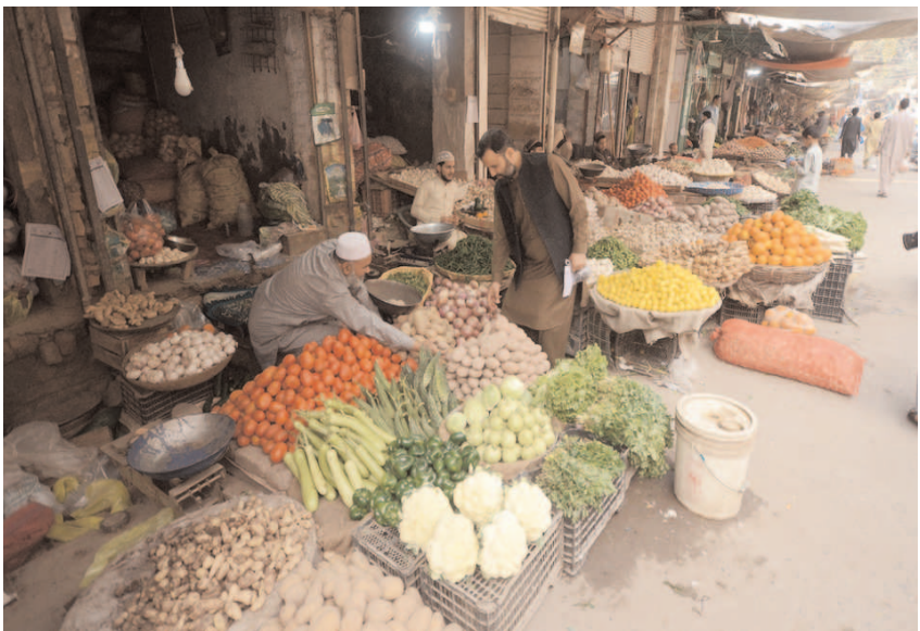
PESHAWAR: A man buying vegetable from local market.