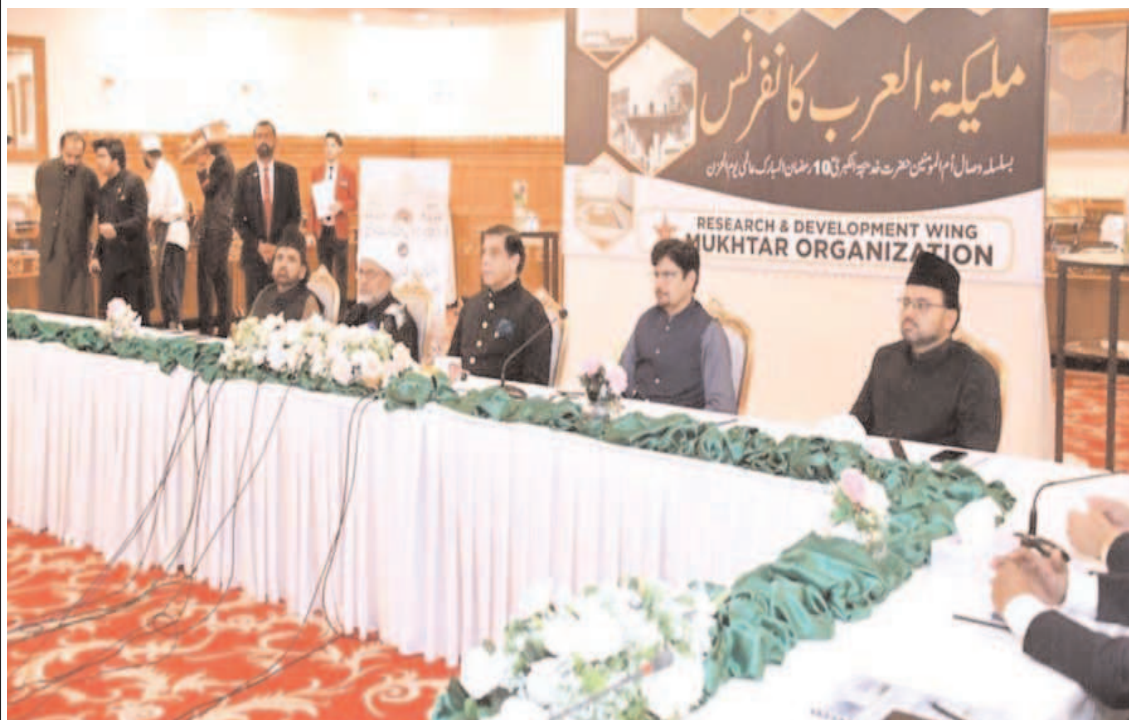
ISLAMABAD: Speaker National Assembly Raja Pervaz Ashraf addressing participants of "Malikatul Arab Conference" to mark death anniversary of Ummul Mominenn Hazrat Khadija tul Kubra.

The Ministry said that in the event of exposure to financial fraud or suspicion of fraud, the pilgrims must inform the bank and the competent authorities.