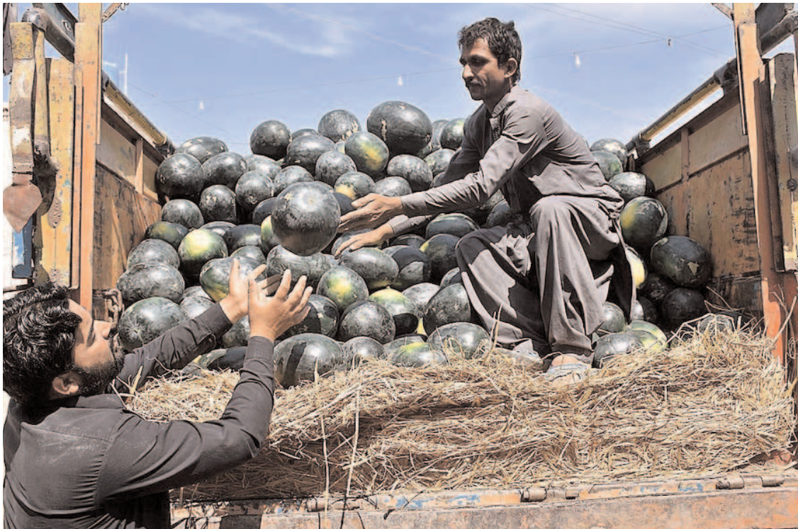
LARKANA: Vendors unloading watermelons from delivery truck at fruit market.