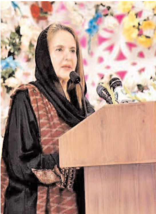
ISLAMABAD: First Lady Begum Samina Alvi addressing an awareness seminar in connection with World Autism Awareness Day at a hospital.

RAWALPINDI (APP): Managing Director (MD) Water and Sanitation Agency (WASA) Rawalpindi here on Saturday directed the authorities concerned to ensure 100 per cent recovery of the outstanding dues from the defaulters, Chaining a meeting held here he reviewed the revenue collection of the agency and directed the authorities including Revenue Director and Deputy Directors to disconnect connections of the defaulters. The meeting was attended by revenue officers and the staff concerned. He also appreciated the efforts of the officers who showed good performance in the revenue recovery campaign and reprimanded those whose performance was not satisfactory. He directed the authorities to continue the crackdown till recovery of the outstanding dues from the last defaulter.