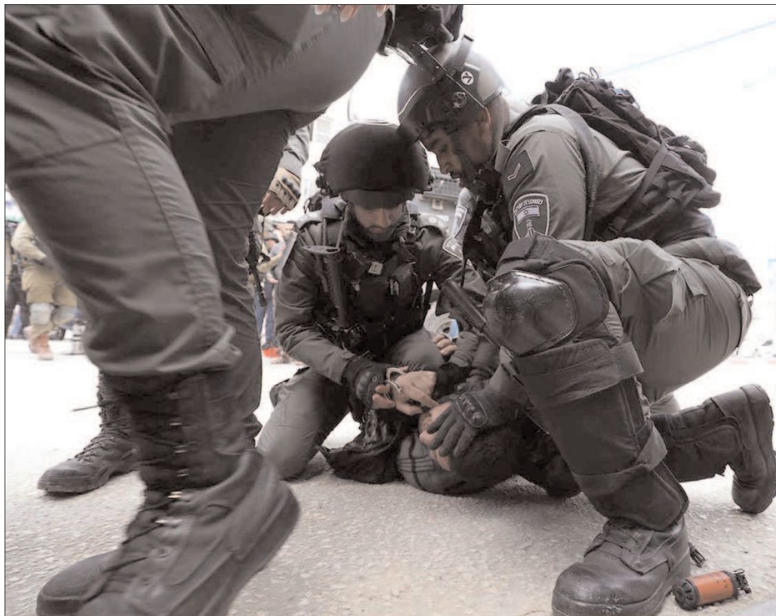
JERUSALEM: Israeli forces trying to arrest a Palestinian during clash in Nablus.

The sedition case was registered against the PTI stalwart after he made controversial remarks on a private news channel last year allegedly aimed at creating a divide in armed forces. He was also arrested in August last but later he was released on bail granted by the Islamabad High Court (IHC).