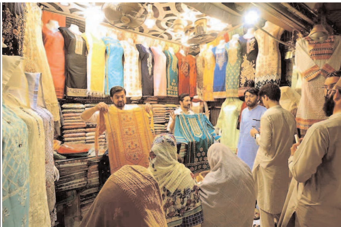
PESHAWAR: Women selecting and purchasing readymade clothes from a vendor at Shafi Bazaar.

Banks shall be responsible for the loss of any customer funds due to delay on their part in taking timely remedial and control meas-