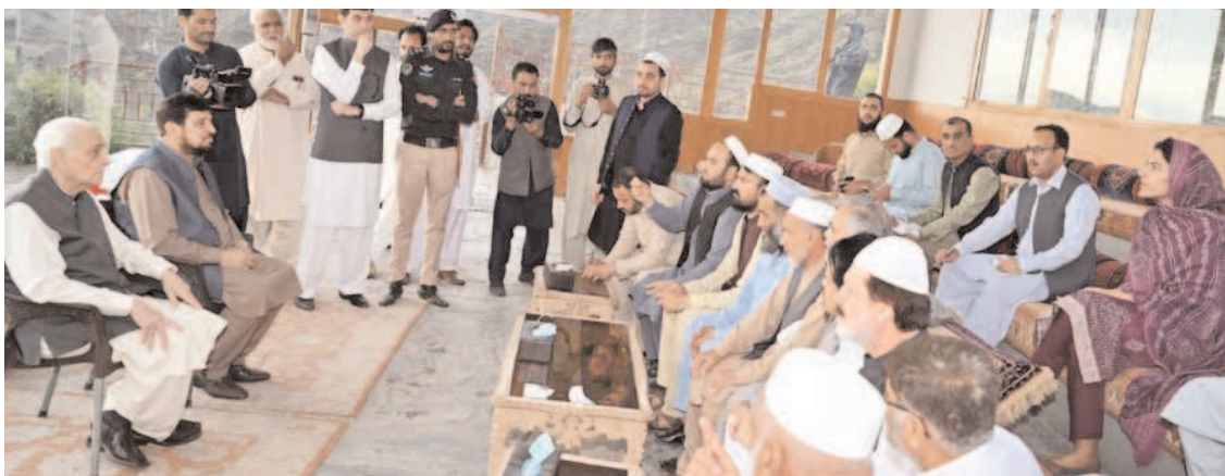
PESHAWAR: Governor Khyber Pakhtunkhwa Haji Ghulam Ali and Chief Minister Muhammad Azam Khan meeting with a delegation of local tribal elders.

The lowest temperature in the province was 2 degrees Celsius in Kalam and 6 degrees Celsius in Malam Jabba, the met department said.