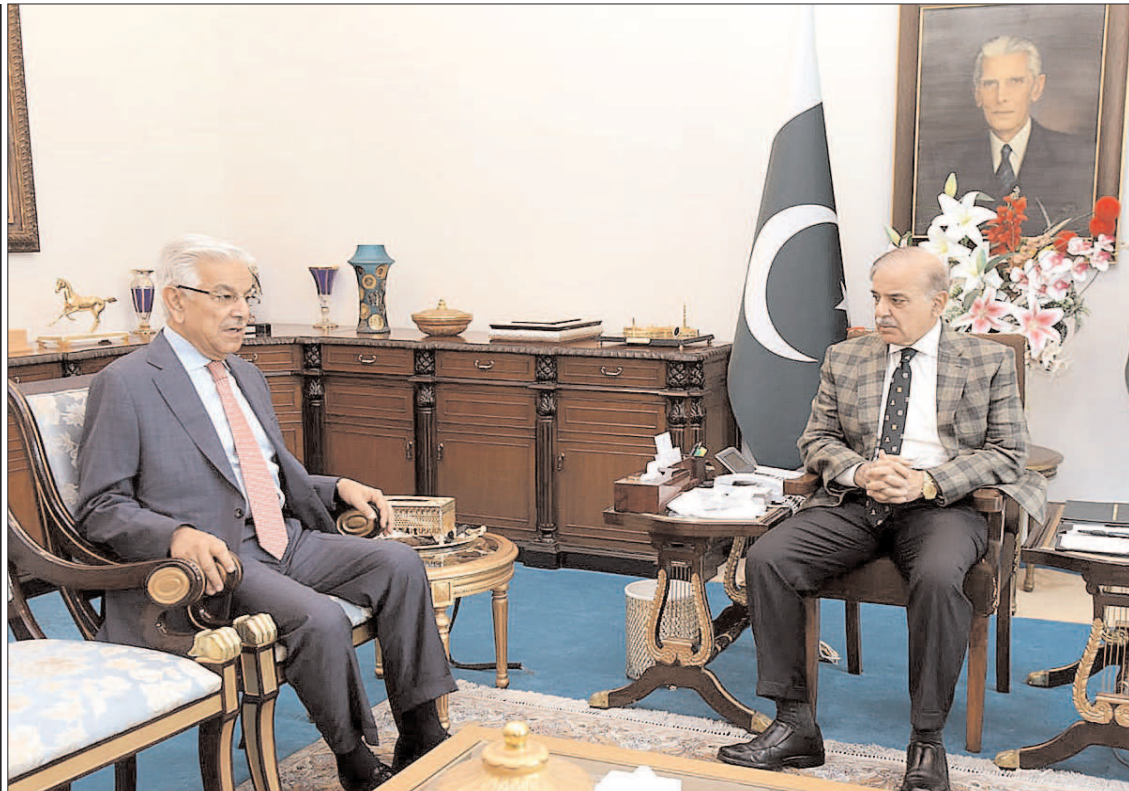
ISLAMABAD: Defence Minister Khawaja Muhammad Asif calls on Prime Minister Muhammad Shehbaz Sharif.

ANP delegation calls on PM: A two-member delegation of Awami National Party (ANP) comprising Aimal Wali Khan and Jawad Khattak Wednesday called on Prime Minister Muhammad Shehbaz Sharif. During the meeting, Minister for Economic Affairs Sardar Ayaz Sadiq and Minister for Federal Education and Professional Training Rana Tanveer Hussain were also present, the PM Office Media Wing said in a press release.