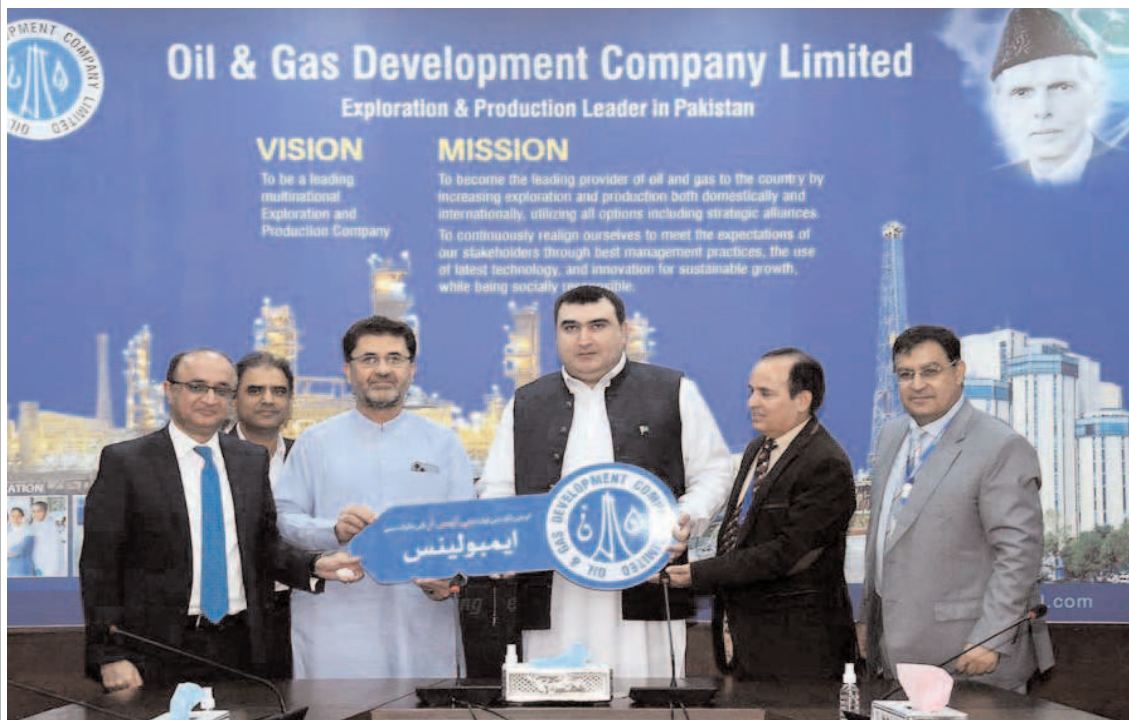
ISLAMABAD: At the OGDCL Head Office, Deputy Speaker of the National Assembly, Zahid Akram Durrani, presented the key of ambulances to the District Health Authority of Bannu district.

In case of any emergency, travellers can contact Motorway Police Helpline 130, he added.