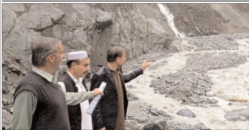
KOHIKISTAN: Officials inspecting damages of floods.