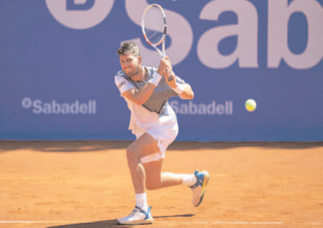
BARCELONA: Cameron Norrie of Great Britain returns a ball against Pavel Kotov during their Men's Singles Second Round match of the Barcelona Open Banc Sabadell at Real Club De Tennis Barcelona.

All-available resources would be utilized to ensure foolproof security arrangements, he said adding coordinated efforts would be made by all the departments concerned for the purpose.