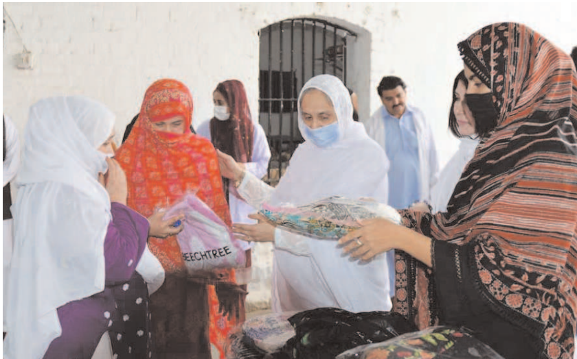
PESHAWAR: Caretaker Law Minister Irshad Qaiser distributing clothes amongst inmates during her visit to Central Jail.

He also thanked the help extended by the philanthropists to whose cooperation made distribution of Eid gifts among the orphans.