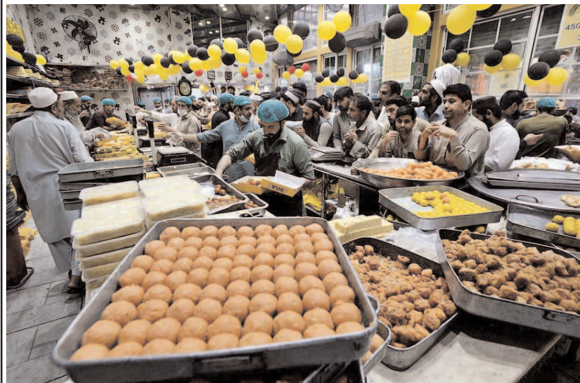
PESHAWAR: People busy in purchasing sweets at a shop in preparation for upcoming Eid-ul-Fitr celebrations.

Shelters Home were being closed due to non-provision of funds by the federal government, it said, adding shelters in Peshawar, Mardan, Abbottabad, Swat, Kohat, Bannu and Dera Ismail Khan would also remain closed, whereas, after April 30, all the employees of the shelters except the security guard would also be relieved.