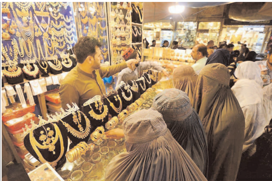
PESHAWAR: Customers selecting and purchasing artificial jewelry at Sadar Bazaar.

The price of gold in the international market rose by US$ 26 to $2000 against its sale at $1974, the association reported.