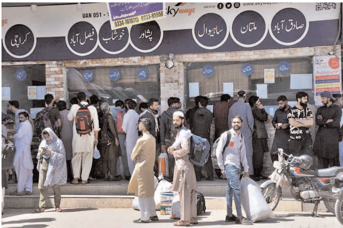
RAWALPINDI: People are eagerly making their way home to celebrate the joyous occasion of Eid-ul-Fitr with their loved ones, carrying their belongings with them at Faizabad Bus Stand as the Ramadan is about to end.