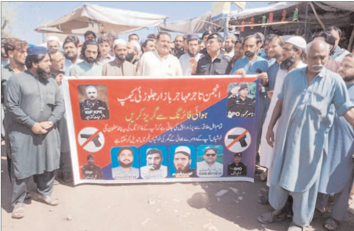
PABBI: Activists of Anjuman Tajir Mohajar Bazaar Jaloza Camp holding a banner during a rally against aerial firing on Eid night.