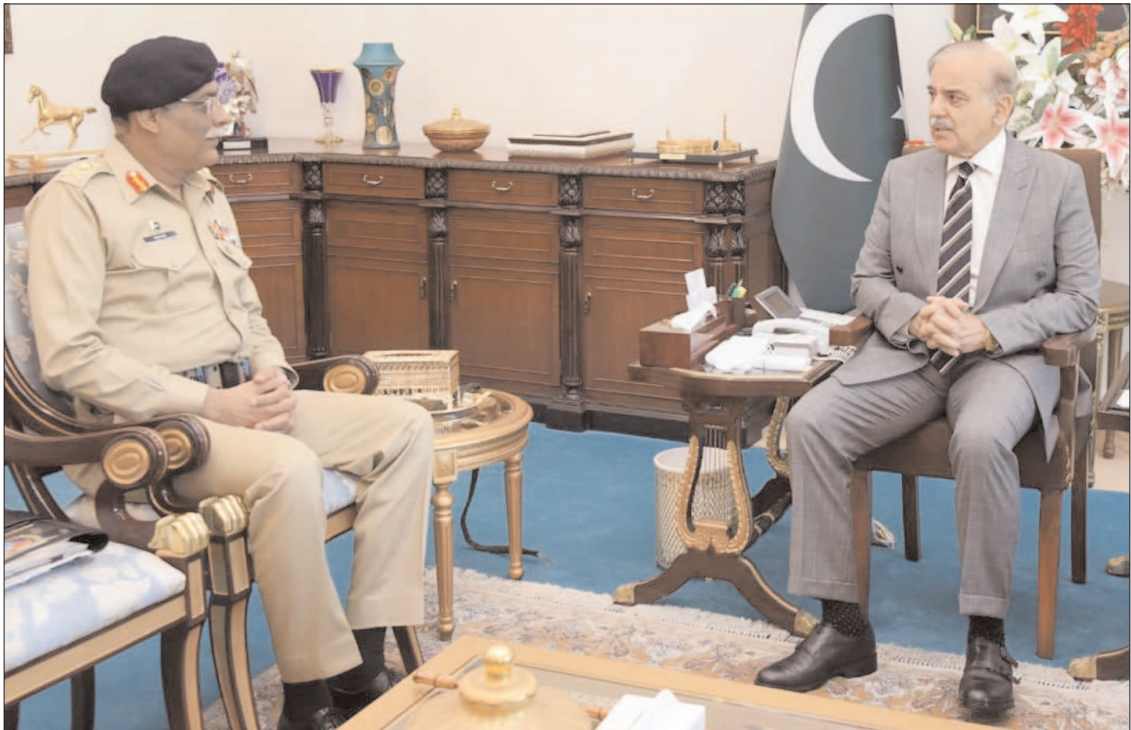
ISLAMABAD: Chairman Joint Chiefs of Staff Committee, General Sahir Shamshad Mirza called on Prime Minister Shehbaz Sharif.

Vol. XXXIX No. 95 Regd. No. 241 RAMAZAN 30 1444 -- FRIDAY, APRIL 21 2023 PESHAWAR EDITION 12 PAGES Price. 20