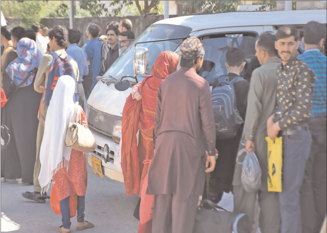
ISLAMABAD: Passengers are rushing to board into vehicle at Karachi Company Bus station as large number of people leaving for their native villages to celebrate Eid.