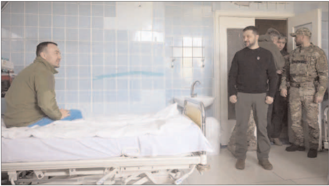
KYIV: Ukrainian President Volodymyr Zelenskyy visiting a hospital near Avdiivka in Donetsk region, Ukraine.