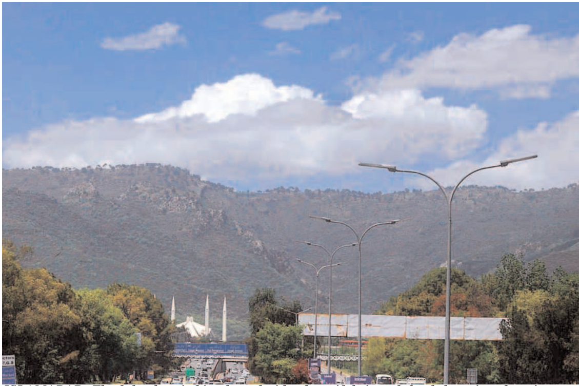
ISLAMABAD: The federal capital is adorned with a beautiful view of clouds hovering above it.

CTP had also formulated a comprehensive plan to regulate the traffic of tourists at the hill station of Murree, he said and informed that 260 traffic wardens would perform duties in Murree.