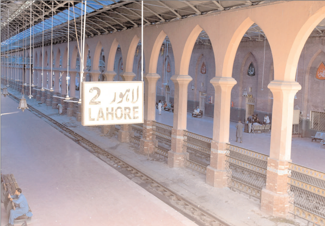
LAHORE: An empty Railway Station presenting deserted view after a lot of hustle and bustle passengers.