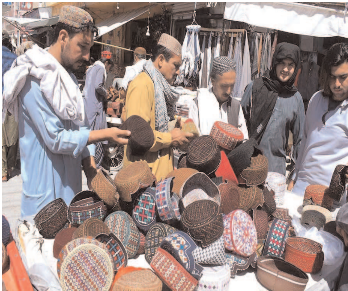
QUETTA: People selecting traditional cap from roadside vendor.

ANKARA (AA/APP): Germany's manufacturing purchasing managers' index (PMI) surprisingly tumbled to a three-year low in April, according to preliminary flash data released on Friday. Germany's Hamburg Commercial Bank (HCOB) Flash Manufacturing PMI dropped from 44.7 in March to 44 in April, the lowest level since June 2020, the US-based financial services company S&P Global said. The market expectation was a rise to 45.7 in April. This was led by a sharp and accelerated reduction in stocks of purchases, combined with a fresh record improvement in supplier delivery times, read an S&P Global report.