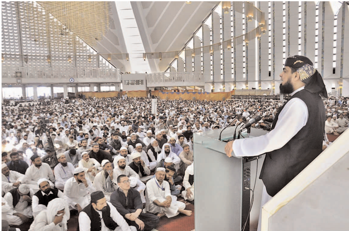
ISLAMABAD: A religious scholar deliver Jumma Khutbah (sermon) at Faisal Masjid during Juma-tul-Wida, the last Friday of the holy month of Ramadan.

RAWALPINDI (APP): Rawalpindi police have finalized all the arrangements to provide effective security and to maintain flow of traffic in Murree during Eid ul Fitr holidays. Over, 1000 police officers and cops men will perform duty. As many as 260 traffic officers have also been assigned to keep flow of traffic in Murree. City Police Officer CPO Khalid Mahmood Hamdani said that the senior officers themselves will be present in the field to ensure effective supervision. Special pickets have also been installed at 14 different places to ensure the safety and convenience of tourists on the occasion of Eid-ul-Fitr. Whereas, 06 facilitation centers have also been established in Murree to guide the tourists. CPO said that the Murree Police is busy 24/7 for the protection and provision of facilities to tourists during Eid. To ensure implementation of instructions issued by tourist police, district administration and meteorological department, CPO said that all available measures are being taken to ensure a safe and pleasant journey of tourists, in case of any problem or emergency call 15, he added.