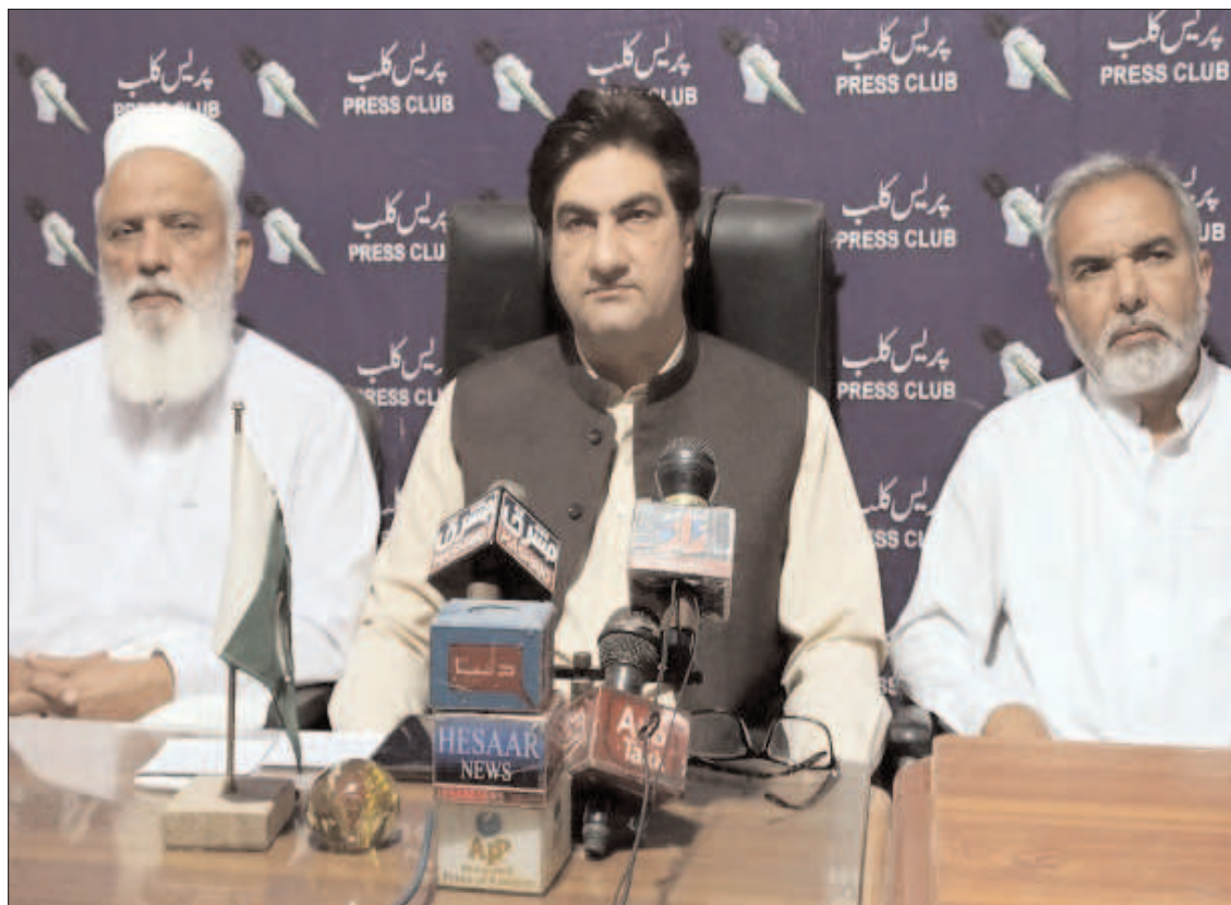
SAKHAKOT: Minister for State and provincial president of PPP Syed Muhammad Ali Shah Bacha addressing a press conference.

Finishing touches are given to a piece including polishing and varnishing to improve its look while artisans also paint its border with a selected chemical for a better shine in the sixth stage. Later on, finishing touches were given to a piece in sixth stage, which includes polishing and varnishing to improve its look while artisans also paint its border with a selected chemical for a better shine.