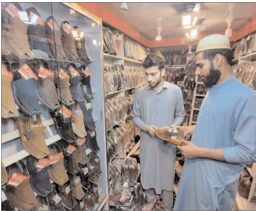
PESHAWAR: A customer selecting Chappal at shop.

The writer is former Registrar Peshawar High Court.