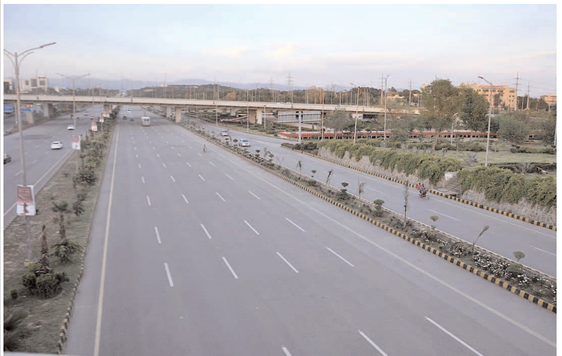
ISLAMABAD: A deserted view of Srinagar Highway as most of the people leave to their hometown to celebrate Eidul Fitr with their loved ones.