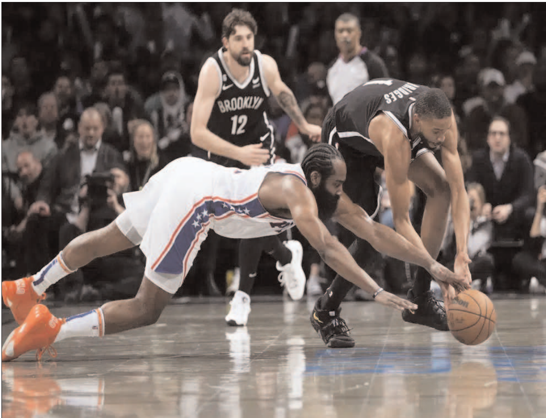
NEW YORK: Philadelphia 76ers' James Harden, left, and Brooklyn Nets' Mikal Bridges scramble for the ball during the second half in Game 3 of an NBA basketball first-round playoff series Thursday.

The Golden State Warriors reduced their deficit to 2-1 in their play-off against Sacramento Kings with a 114-97 victory. Stephen Curry was the top scorer in the game with 36 points for the Warriors, who were without Draymond Green after he was given a one-match suspension for stamping on the Kings' Domantas Sabonis.