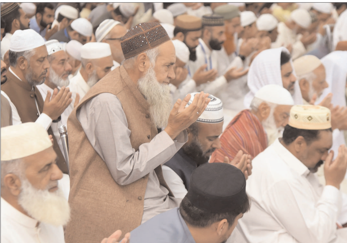
ISLAMABAD: People offering dua on the last Friday prayer of Ramazan at Faisal Mosque.

Iqbal was a Sufi poet for the modern age who aroused a revolutionary spirit in the nation through his poetry. His poetry has been translated in Spanish, Chinese, Japanese, English and several other languages and is considered a great philosopher all over the world. Unfortunately, he could not see the independence of Pakistan and died on April 21, 1938. Prime Minister Shehbaz Sharif on Friday, paying tribute to Allama Muhammad Iqbal, said the great poet and philosopher gave the Muslim Ummah a new dimension of thinking.