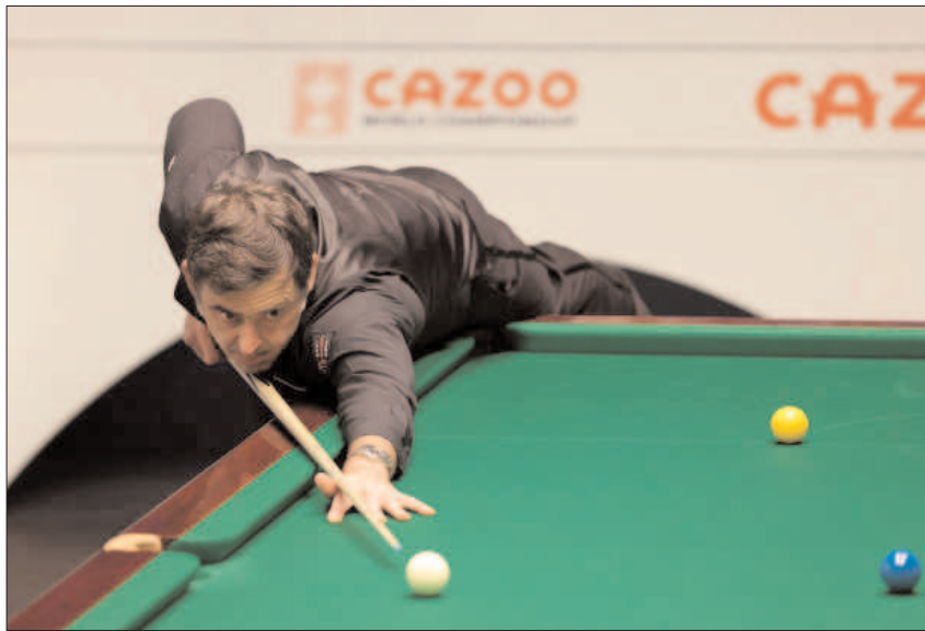
SHEFFIELD: Ronnie O'Sullivan of England plays a shot during their round two match against Hossein Vafaei of Iran on Day Seven of the Cazoo World Snooker Championship 2023.

Adding that there were no security issues in Pakistan, he added that since all other teams were coming, India too was welcome.