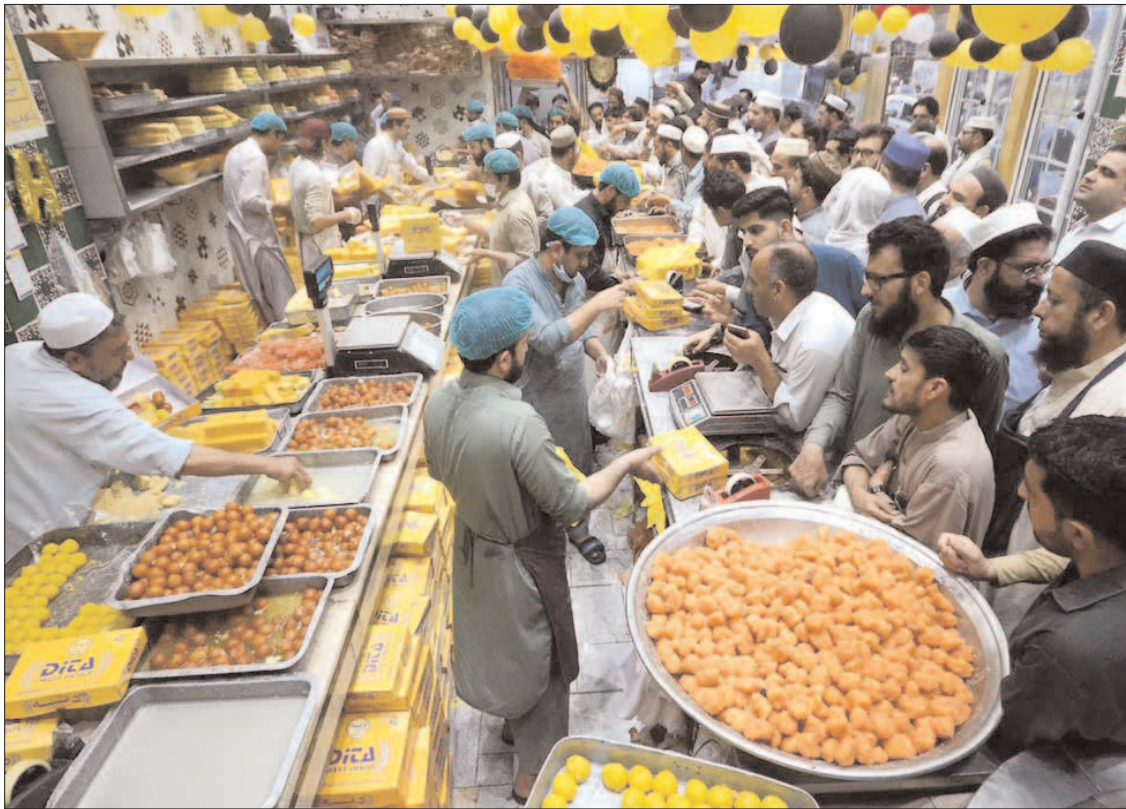
PESHAWAR: People buying sweets for Eid at a shop.

The daytime fasting month of Ramadan is one of the five pillars of Islam. Observant Muslims refrain from eating and drinking from dawn to dusk, and traditionally gather with family and friends to break their fast in the evening. It is also a time for prayer, with the faithful converging in large numbers on mosques, especially at night. Fasting is widely practised in Saudi Arabia, home of the holiest shrines in Islam in Mecca and Medina.