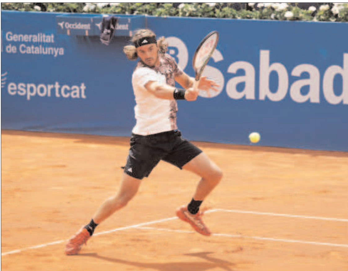
BARCELONA: Stefanos Tsitsipas during the match against Alex de Minaur, corresponding to the quarter final of the Barcelona Open Banc Sabadell, 70th Conde de Godo Trophy.

LONDON (Agencies): Eilish McColgan has "shed a lot of tears" after a knee injury forced her to withdraw from the London Marathon. McColgan, 32, was set to make her debut at the distance on Sunday in an event won by her mother Liz in 1996. However, the Briton, who has stepped up after a successful season over 5,000m and 10,000m, has had to admit defeat in her attempt to make the start line. "Trust me, I've tried but it's just got to the point where it's not going to be feasible to run," she said. "It's nothing serious but I don't want to take any unnecessary risks because I don't want to put my long-term career in danger. There's been a few factors — a bad storm — over the past few weeks and this knee thing is just the last crack in the armour."