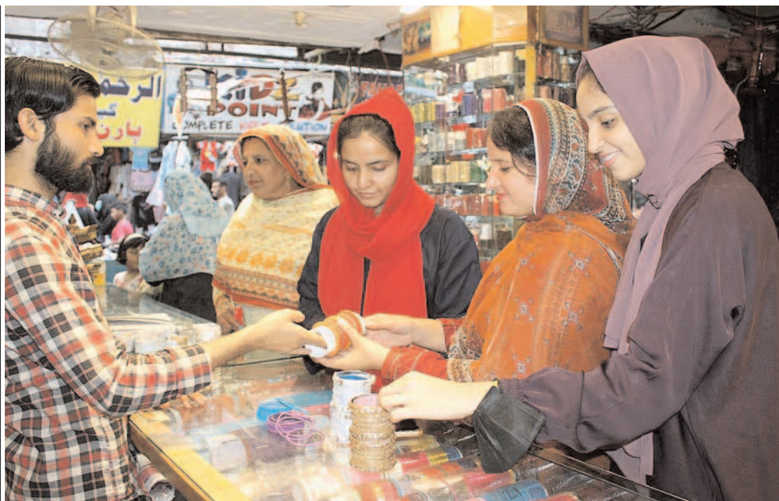
HYDERABAD: Women busy in selecting and purchasing bangles during chand raat at Resham Bazaar.