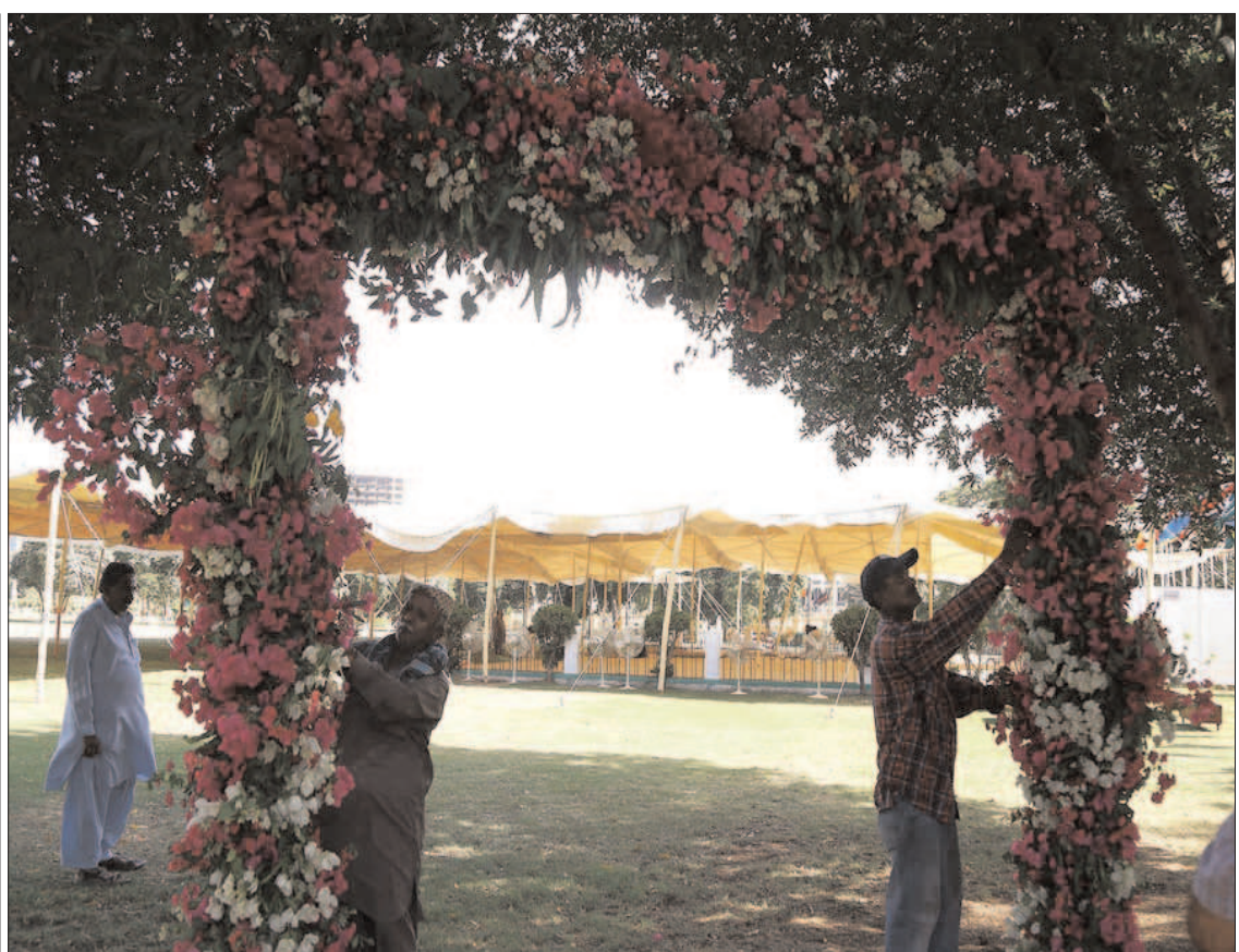
KARACHI: A view of eid ul fitr prayer preparation at Polo gerund.