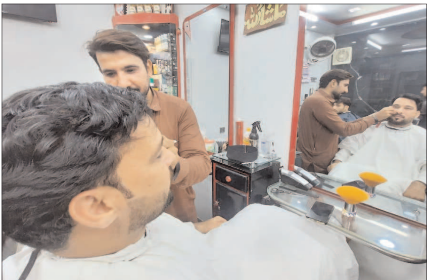
PESHAWAR: A haircutter busy in cutting of hair of a customer on the occasion of Eid.

In another action, the Anti Narcotics Force (ANF) recovered 1,450 hallucinating drugs from the possession of a passenger at Jinnah International Airport, Karachi. He who was going to Mascot and he hailed from Muzaffargarh. The ANF spokesperson said that investigation has started against all the accused after registering cases against them under the anti-narcotics act.