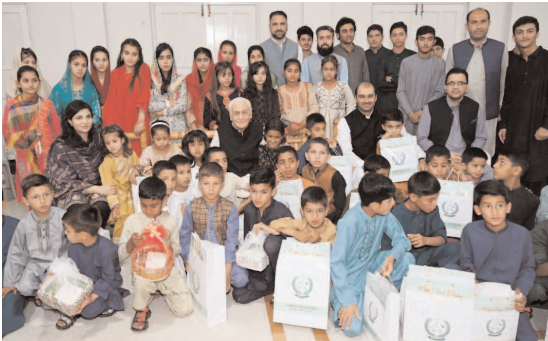
PESHAWAR: Caretaker Chief Minister Khyber Pakhtunkhwa Muhammad Azam Khan with children during his visit to SOS Village.

He said his department will not only ensure strict prevention of drugs but will also cherish the great task of treatment and rehabilitation of patients suffering from drug addiction, for which measures are being taken on emergency basis. The provincial minister also assured to establish a drug rehabilitation hospital. He clarified that he will endeavor to cherish this project as soon as possible even by meeting the Chief Minister and the Governor in this regard.