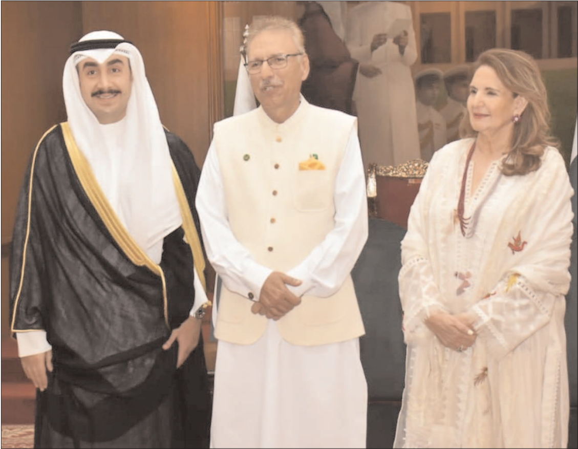
KARACHI: President Dr. Arif Alvi exchanging Eid greetings with people from different walks of life, including diplomats, at an Eid Milan event.