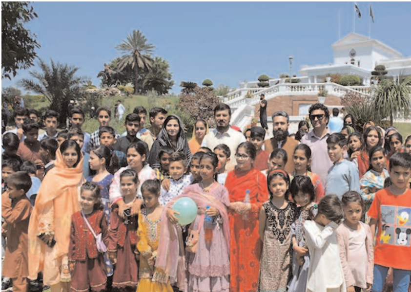
PESHAWAR (APP): The Governor House Peshawar was opened for families

and children on the third day of Eid-ul-Fitr celebrations by the Governor Haji