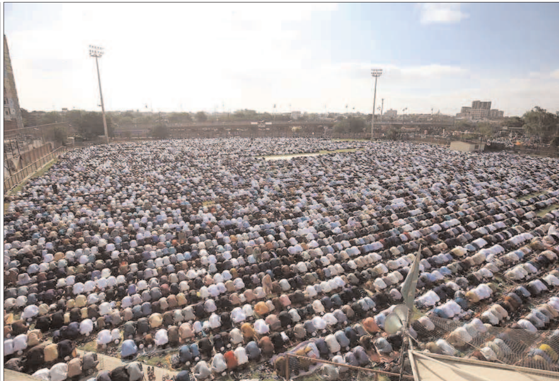
KARACHI: A larger number of faithful offering Eid al-fitr prayer at Nazmabaad.

A specially trained force had been deployed for Murree Tourism Police, he said. Rawalpindi district administration, district police and CTP on the directives of Chief Minister Punjab had taken solid steps to ease traffic flow and facilitate tourists in Murree. The officers of the district administration, district police and CTP were present in the field to monitor the situation. All possible steps were being taken to ease traffic flow and ensure smooth flow of traffic on the roads of Murree, he added.