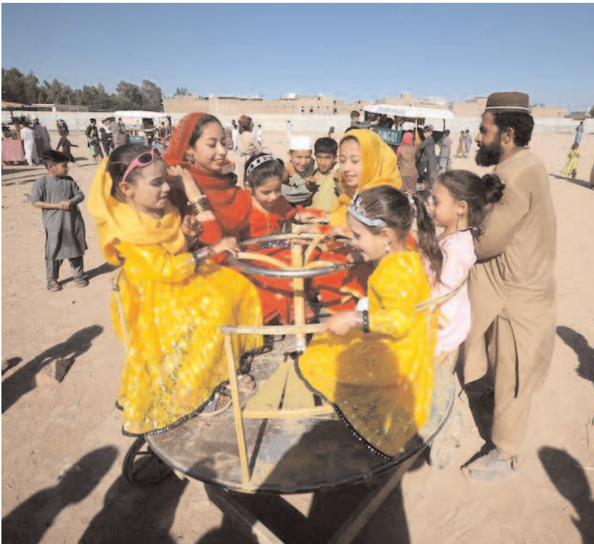
PESHAWAR: Children enjoying hand swing in park during Eid holidays.

Deputy Commissioner (DC) Khyber district highly lauded the 16 Engineers of 11 Corps Pakistan Army, Rescue-1122 KP, District Administration Khyber, Khyber Rifles Landi Kotal and other Provincial Departments role in the operation. The catastrophic land sliding incident occurred on April 18, at 2:18 am at Torkham in Khyber district.