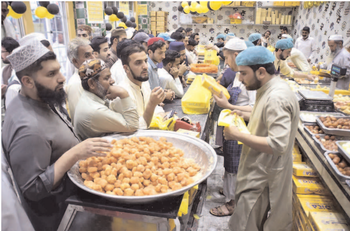
PESHAWAR: Peoples purchasing sweets from shop.

ADB is evolving to better meet the changing and complex needs of its DMCs. These include measures to unlock greater resources to support the region's development through an ongoing review of the bank's capital adequacy framework, as well as structural and nonstructural organizational reforms guided by a new operating model. "I am confident that these reforms will ensure ADB delivers greater impact in the region, including by scaling up climate financing, mobilizing more private sector investment, and providing a wider range of development solutions in response to client needs," said the ADB President. The ADB is committed to achieving a prosperous, inclusive, resilient, and sustainable Asia and the Pacific, while sustaining its efforts to eradicate extreme poverty, he added.