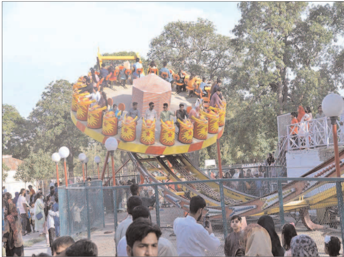
LAHORE: Children enjoying swings in Gulshan-e-Iqbal Park on the 3rd day of Eid-ul-Fitr festival.

Over the past several months, the CDA had launched several operations against the encroachment mafia and confiscated land worth billions of rupees.