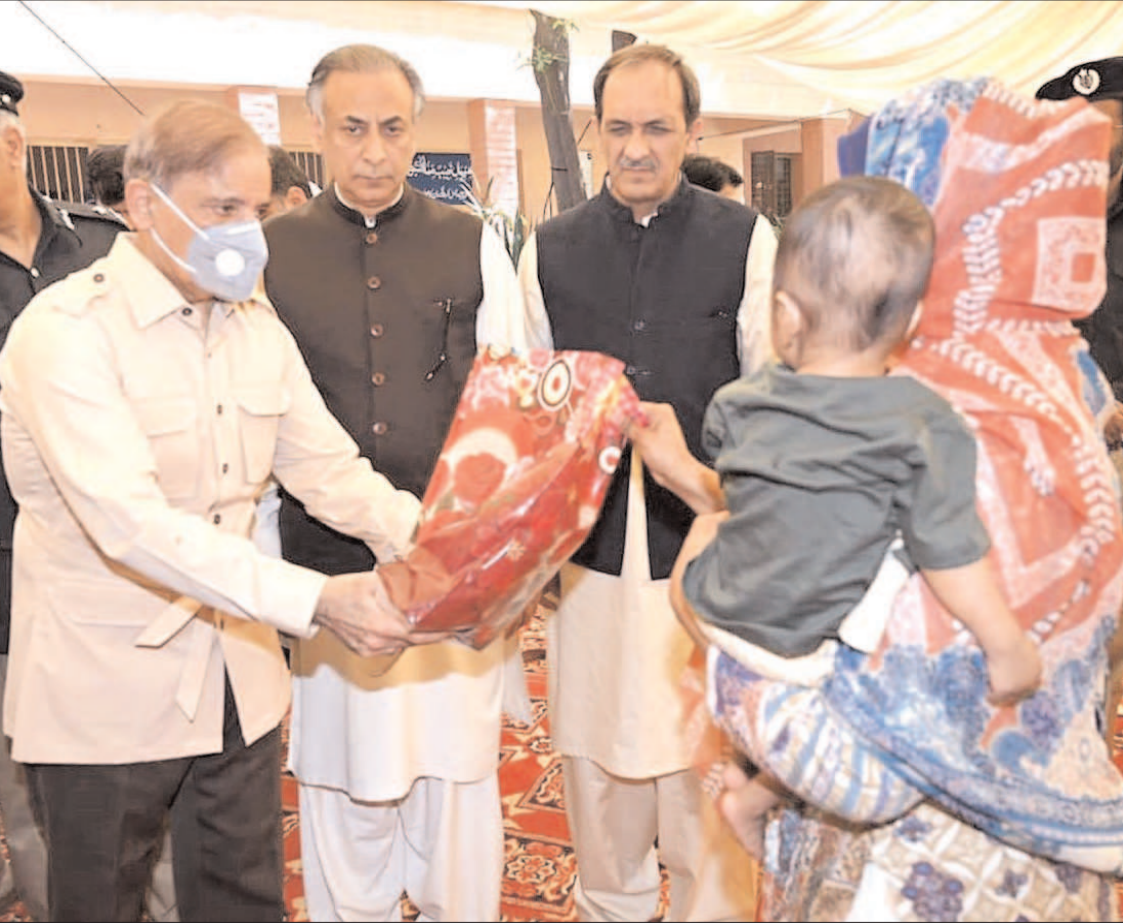
LAHORE: Prime Minister Shehbaz Sharif distributing gift hampers among the staff and prisoners of Kot Lakhpat Jail on the occasion of Eid.