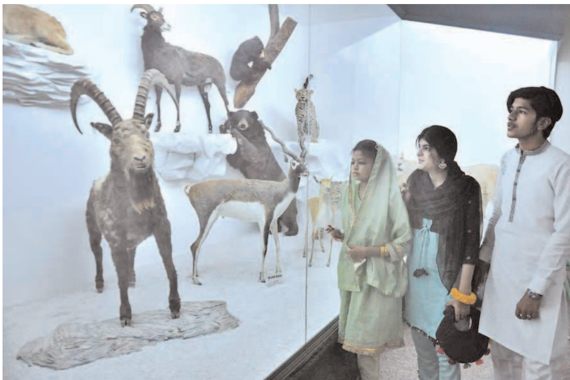
ISLAMABAD: Children eager to watch the stuffed wild mountain animals during their visit to Pakistan Museum of Natural History on the 3rd day of Eid ul Fitr festival.