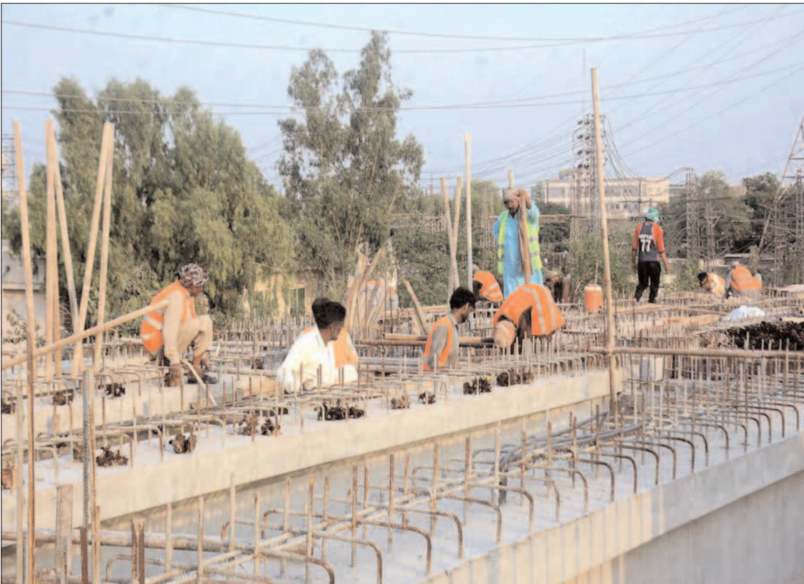
LAHORE: Laborers busy in construction work of bridge at Ferozpur Road during a development project by government in the city.

Moreover, the airport staff is restricted to give any protocol to the passenger despite rank or grade, all international passengers will undergo a complete medical examination, while suspected passengers will be immediately isolated and sent to the hospital. It is pertinent to mention here that, as many as two cases of Monkeypox were reported in Pakistan for the first time which was also confirmed by the health department on Tuesday. According to the health ministry, Monkeypox patients belong to the twin cities, of Rawalpindi and Islamabad.