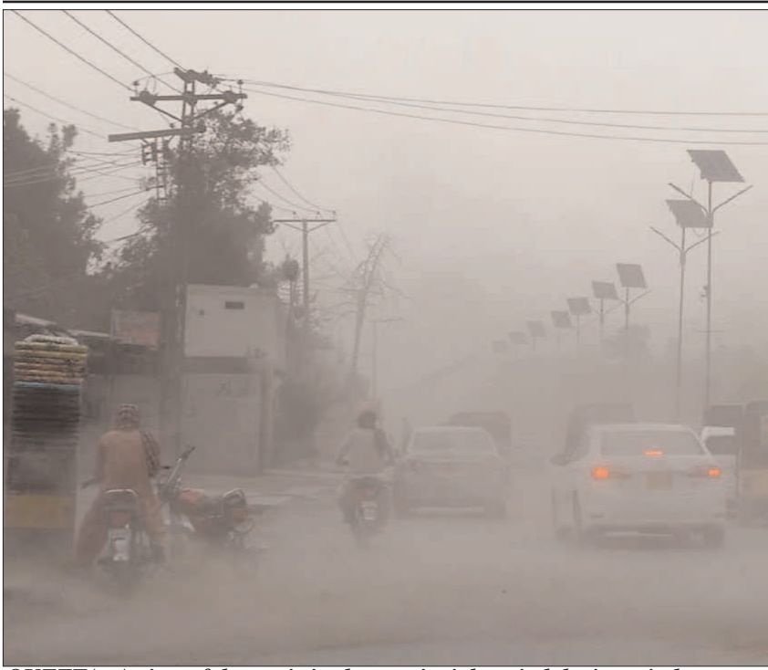
QUETTA: A view of dusty air in the provincial capital during winds.