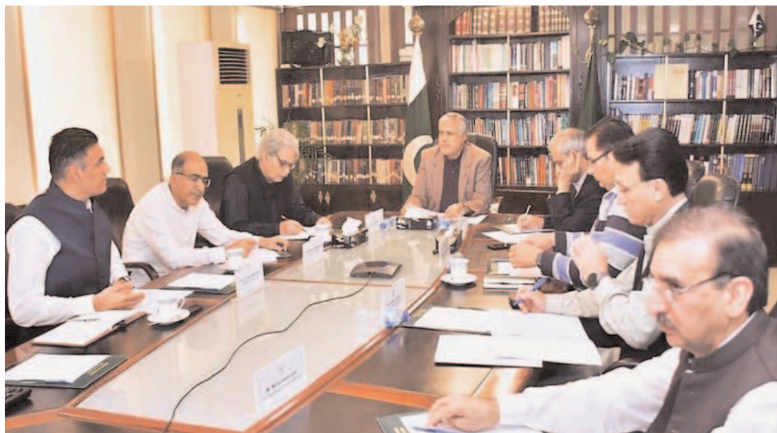
ISLAMABAD: Federal Minister for Finance and Revenue Senator Mohammad Ishaq Dar chairing a meeting on CDA's projects for overseas Pakistanis at Finance Division.