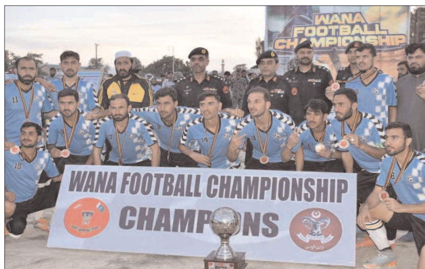
prizes to participants. IGFC KP South appreciated the game of both teams and motivated them to participate in other provincial Tournaments as well.