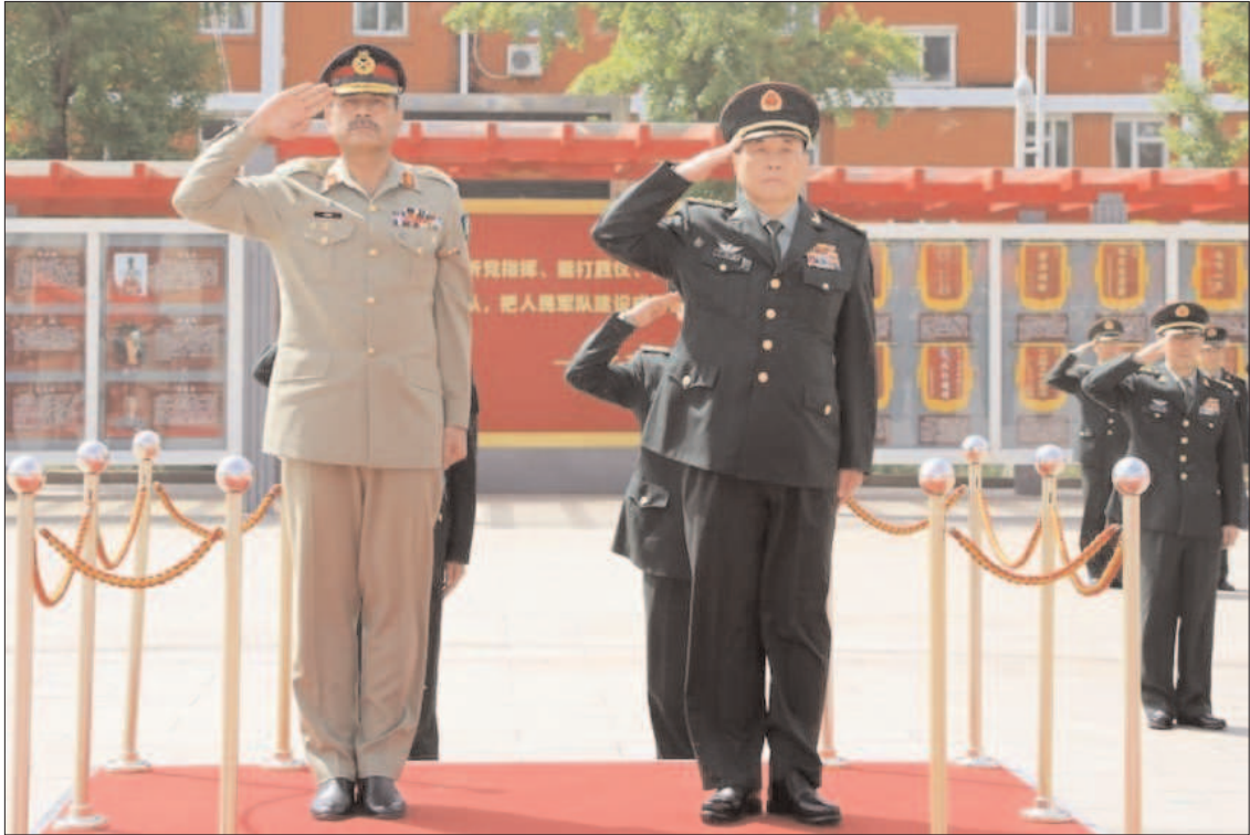
BELJING: Chief of the Army Staff, General Asim Munir Ahmed being presented with the guard of honour at PLA Army Headquarters.