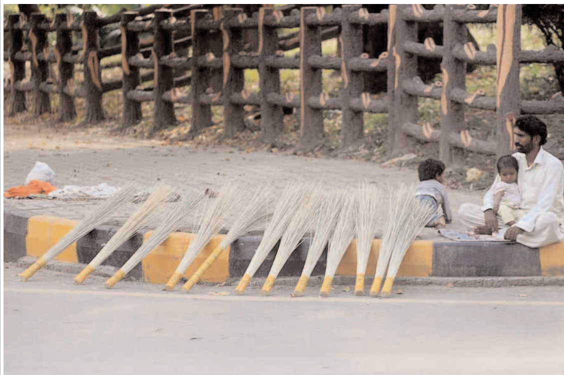
ISLAMABAD: An old man is selling brooms at a roadside setup to earn some livelihood.

It is pertinent to mention here that the Office of District Magistrate ICT had prohibited the manufacturing and selling of kites, kite flying string sharp Maanjha metallic wire and nylon cord within the revenue/territorial limits of Islamabad district for a period of two months through an order on April 4. The order asked the owners/occupants of the house, shops, hospitals, buildings, etc not to allow kite flying activity on their roof-tops.