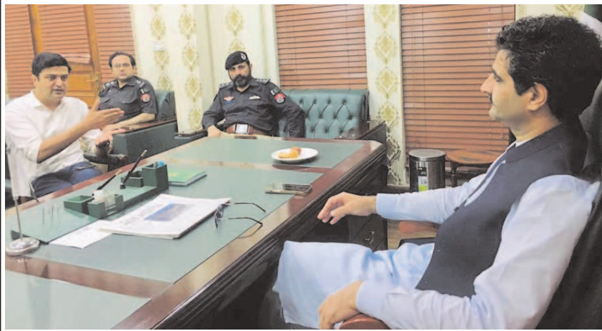
PESHAWAR: Caretaker Minister for Excise, Taxation and Narcotics Control Haji Manzoor Khan Afridi presiding over a meeting regarding performance of Excise Department.

Secretary Food appraised the forum that more than 15.3 million bags of 10 Kg of free flour were distributed among over 5.2 million eligible households during Ramadan. The Chief Secretary directed that dealers' stocks should be closely monitored and special attention should be paid to control excess supply of essential commodities to the border districts.