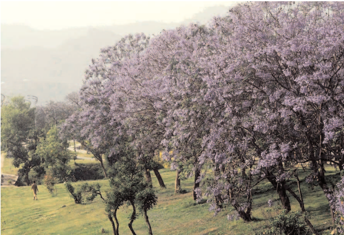
ISLAMABAD: A beautiful view of seasonal flowers in the Federal Capital.