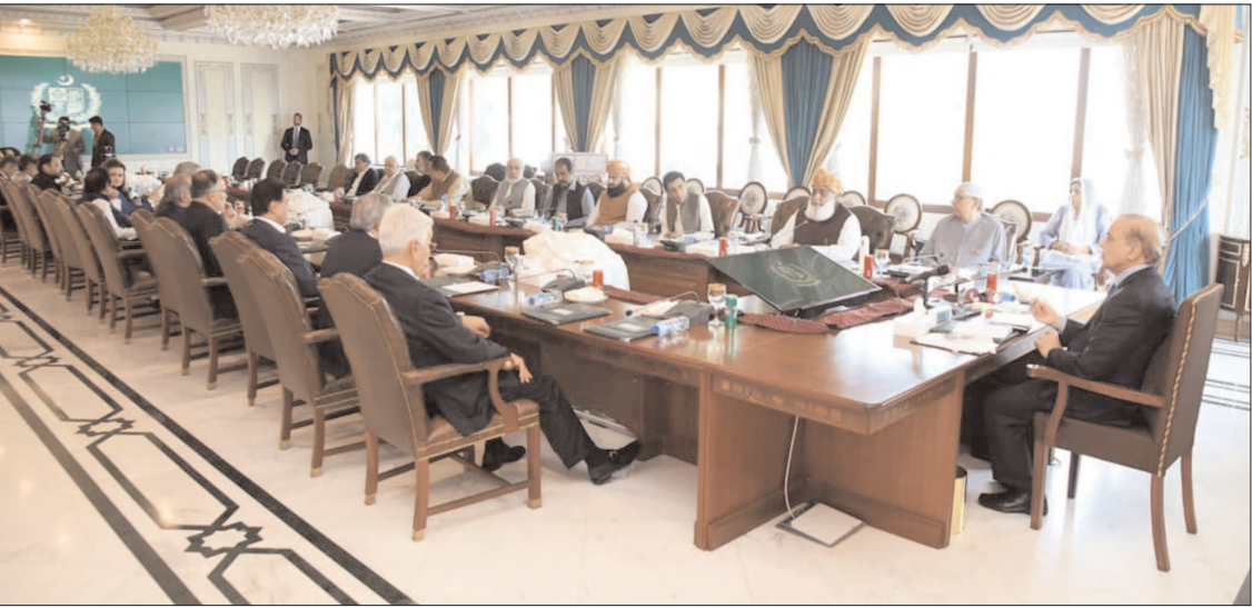
ISLAMABAD: Prime Minister Shehbaz Sharif chairing a meeting of the Federal Cabinet.