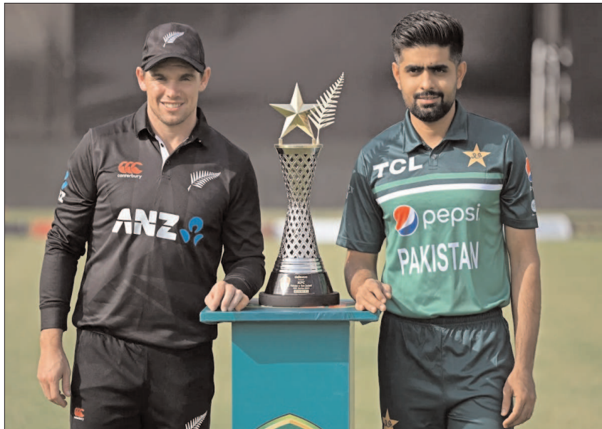
RAWALPINDI: Tom Latham and Babar Azam pose with the ODI series trophy, Pakistan vs New Zealand.

S H E F F I E L D (Agencies): Ronnie O'Sullivan's hopes of an eighth World Championship title came to an end in the quarter-finals as Luca Brecel staged a superb fightback to win 13-10. O'Sullivan, who equalled Stephen Hendry's record of seven Crucible crowns last year, had led 6-2 and 10-6. But he failed to win a single frame in the final session in Sheffield as Brecel reeled off seven on the trot. The Belgian compiled breaks of 112, 64, 72, 61, 78 and 63 to seal a memorable victory and a place in the last four. Brecel, 28, meets Anthony McGill or Si Jiahui in the semi-finals, with their match finely balanced at 8-8 heading into the final session at 19:00 BST. Brecel's victory came in a remarkable finale that saw 39-time ranking-event winner O'Sullivan fail to win a frame in a session at the Crucible for the first time since his 17-11 loss to Graeme Dott in the 2006 semi.