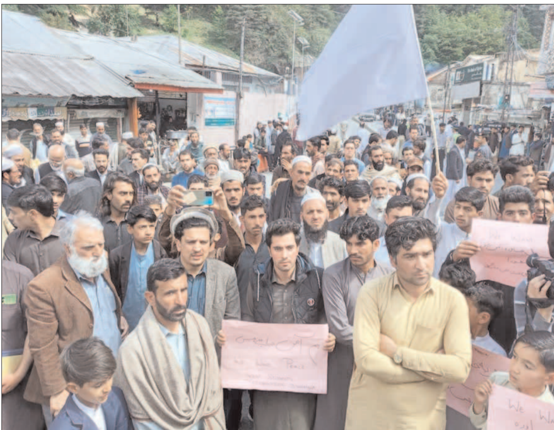
SHANGLA: People of Shangla political leaders and religious scholars holding a protest against terrorist attack on CTD police station at Swat.

ATTOCK (PPI): Three people, including two women, were killed and four others were severely injured when a speeding car crashed into a truck from the rear side near Kharapa Interchange near Pindigheb tehsil of Attock on Friday. According to the sources, the accident occurred as the rashly driven car, they were travelling in, lost the control after its driver fell asleep while driving. A rescue 1122 team reached the site after the incident was reported and shifted the bodies and injured to the PindiGheb Hospital where two injured were referred to Rawalpindi in critical condition.