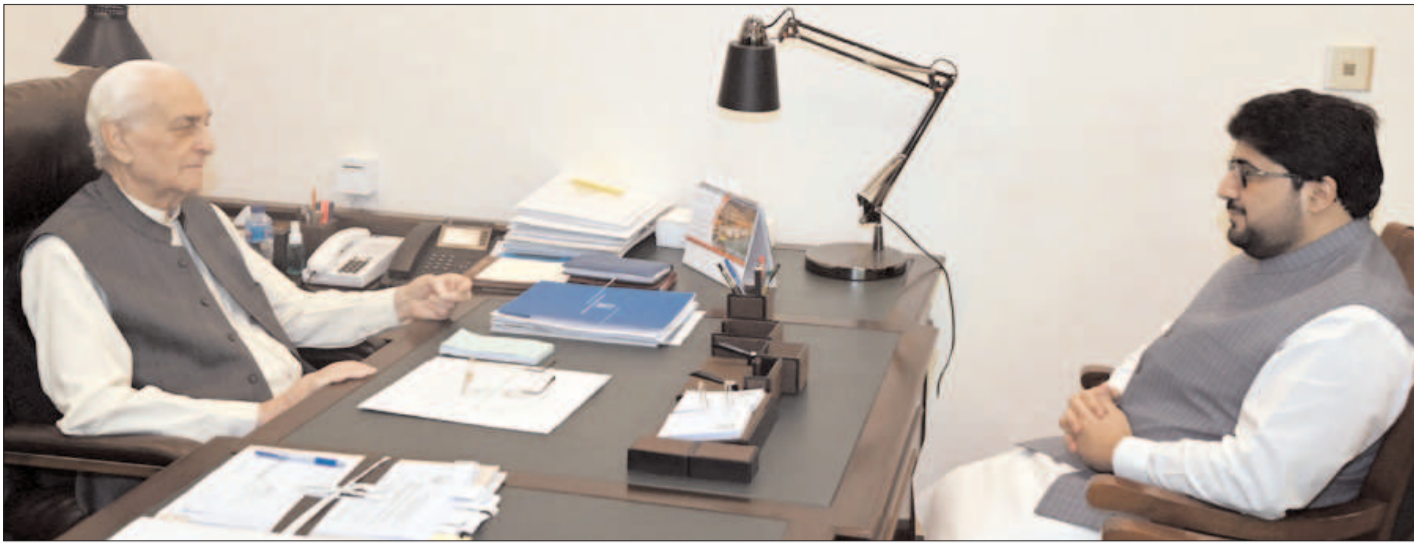
PESHAAR: Caretaker Chief Minister Muhammad Azam Khan called on by provincial minister Sawal Nazir Advocate.