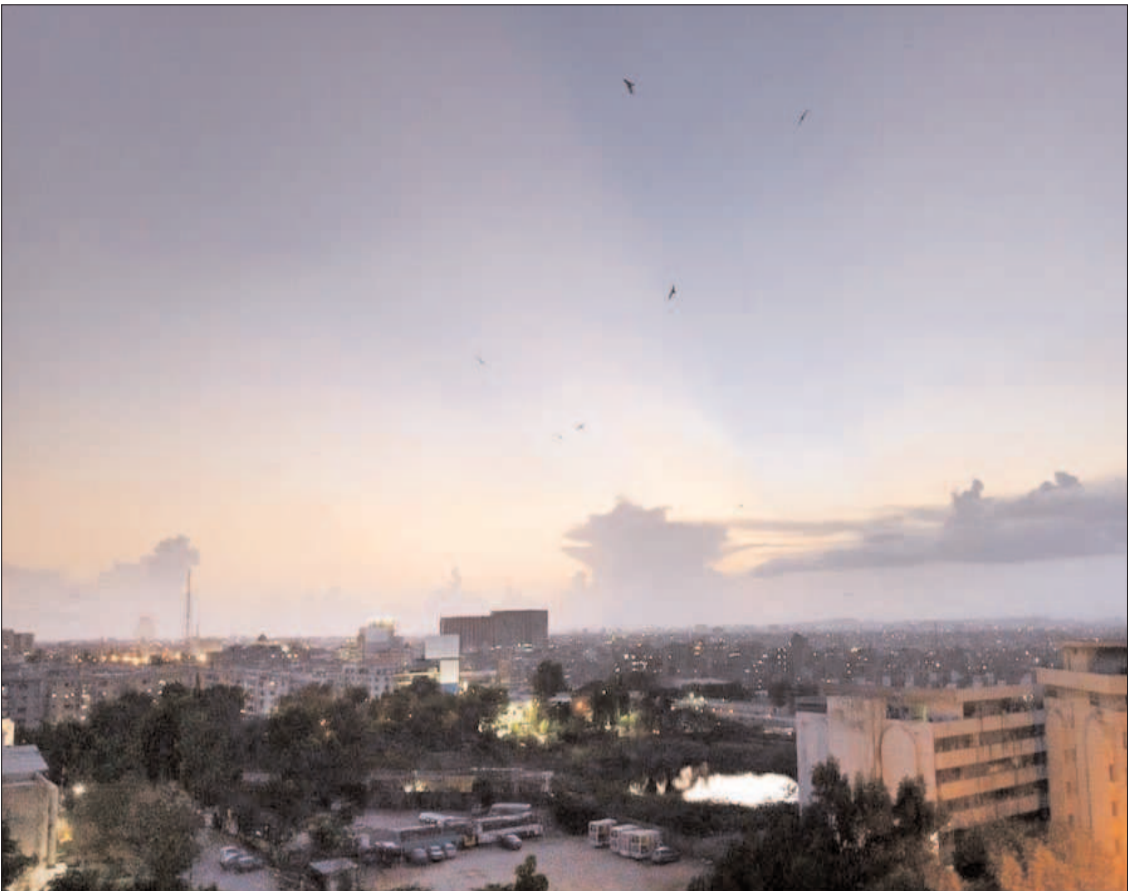
KARACHI: The sight of dark clouds looming in the sky during sunset is quite captivating.

Citizens are requested to abide by the traffic rules and enforce the law, as this will prevent accidents and ensure the protection of life and property of citizens.