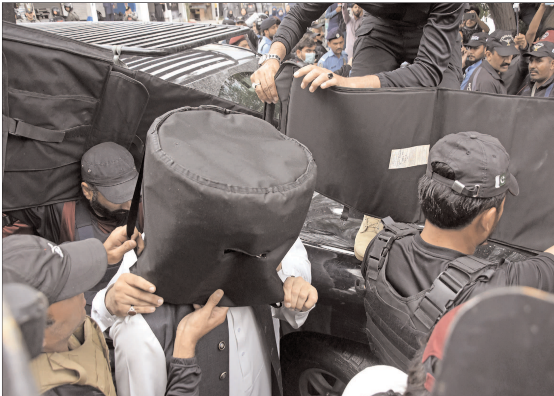
ISLAMABAD: Security personnel cover PTI chief, Imran Khan with bullet proof shield on his arrival at court for hearing.