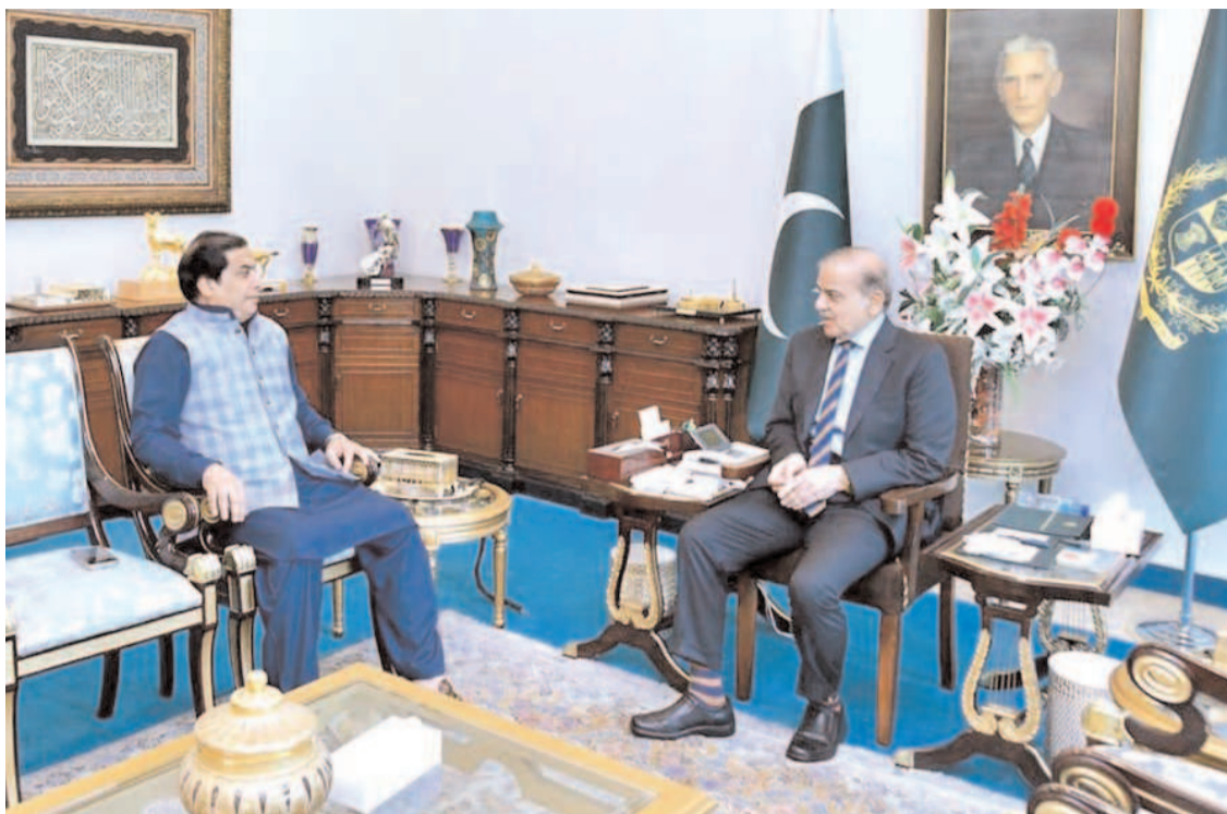
ISLAMABAD: Former Member National Assembly Hanif Abbasi calls on Prime Minister Muhammad Shehbaz Sharif.