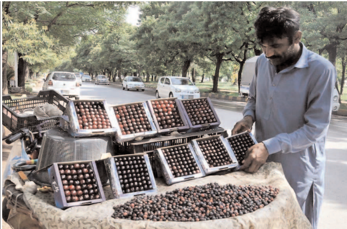
ISLAMABAD: A hawker is selling fresh cherry and Phalsa (Sherbet Berry) on roadside in Federal Capital.

"The Markhor and Deodar trees pictured on the reverse of the Banknote highlight our national commitment to address climate change and its repercussions," a statement issued then by the SBP mentioned.