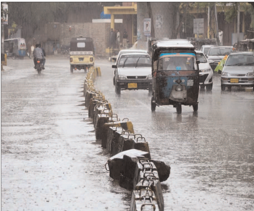
HYDERABAD: Vehicle passing through rainwater during heavy downpour in the city.

In times like these, it is important for the community to come together and support those in need. The appeal for the sick woman's treatment is a testament to the resilience and compassion of the people of the Manatu area.