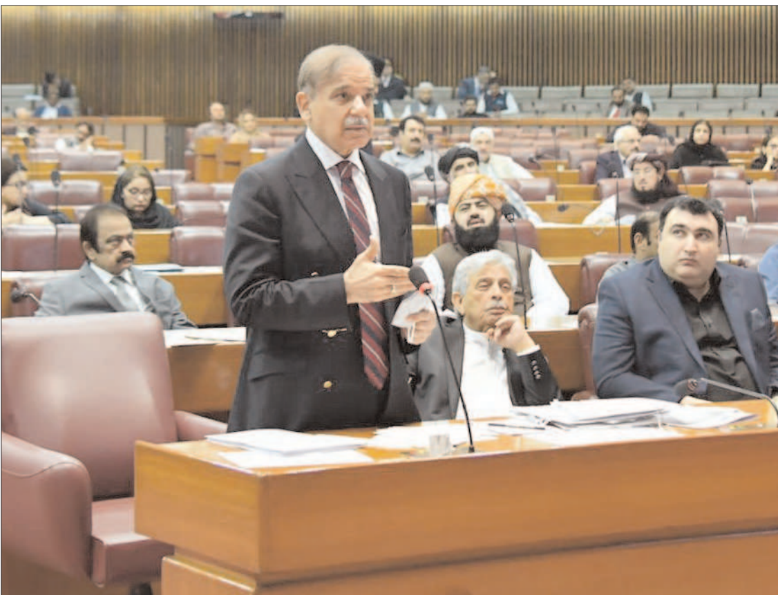
ISLAMABAD: Prime Minister Shehbaz Sharif addressing the National Assembly session.