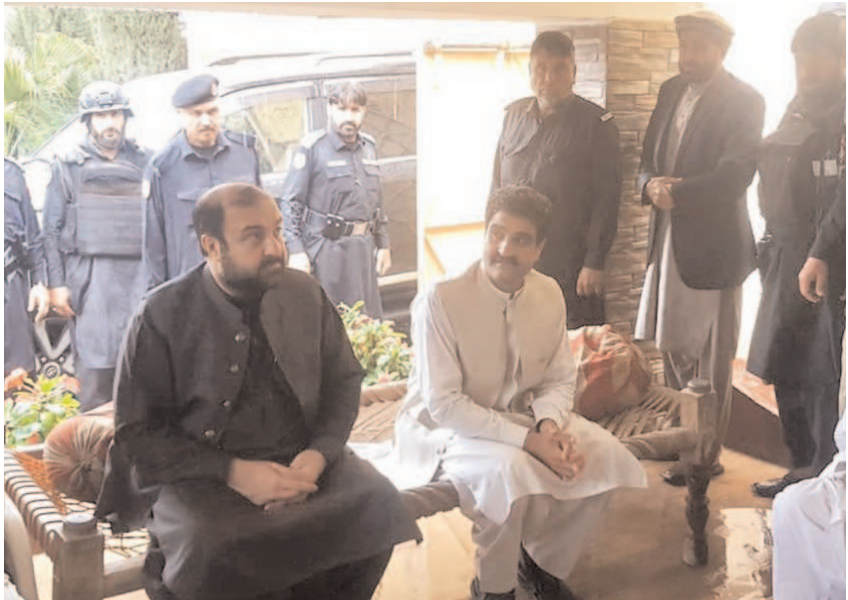
PESHAWAR: Caretaker Khyber Pakhtunkhwa Minister for Labor, Excise and Narcotics Control Haji Manzoor Khan Afridi talking to tribal elders.

and bravery of the tribal people is beyond doubt, while on the other hand, they are naturally the protectors of the geographical borders of the country. The minister assured that like other merged districts, the people of Khyber will also be benefited from the development and welfare schemes of the provincial and federal governments adding the prevalent poverty and backwardness there would be eradicated from this district for good. He also assured to resolve the problems and issues presented by the tribal people on priority basis.