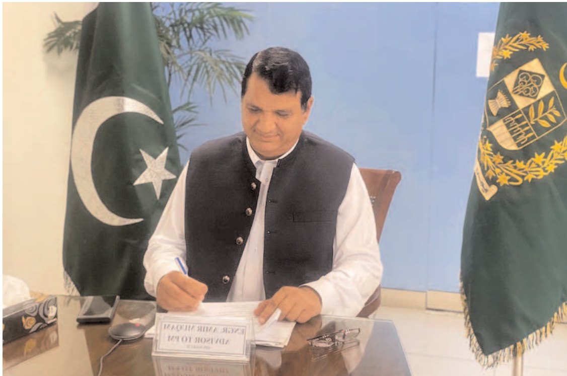
ISLAMABAD: Adviser to PM Engr Amir Muqam signing final protocol of 20th Ministers of Culture of Member State of Shanghai Cooperation Organization.

RAWALPINDI (APP): Anti-Narcotics Force (ANF) in eight operations managed to recover over 447 kg drugs and arrested eight accused, said an ANF Headquarters spokesman here on Monday. He informed that ANF managed to recover five charras-filled capsules from the possession of an Abu Dhabi-bound passenger, a resident of Bannu, netted at Islamabad International Airport. In another operation, 1.2 kg heroin was recovered from a private courier company office near Chandni Chowk Rawalpindi. The parcel was booked for Birmingham. In third operation near Motorway Toll Plaza, 3.6 kg charras was recovered from the possession of an Afghan national. The spokesman informed that ANF in an operation near Islamabad Chungi No 26 recovered 2.4 kg charras from the possession of a drug smuggler resident of Peshawar. ANF and ASF in an operation at Lahore International Airport arrested three accused residents of Okara and recovered 104 heroin-filled capsules from the possession of an accused. He said that in an operation at Karachi International Airport, over two kg heroin was recovered from the possession of a Saudia-bound passenger resident of Chiniot. Heroin was tactfully concealed in a hotpot. ANF and FC in an operation in Noshki managed to recover 416 kg charras while in the eighth operation ANF recovered 22 kg charras concealed in bushes in Dalbandin area.