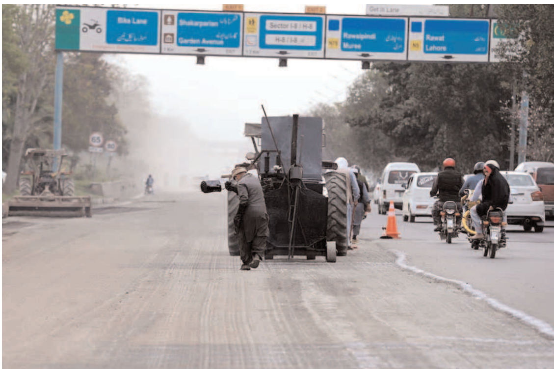
ISLAMABAD: Workers busy in fixing the damaged section of the road at Zero Point.

It could have taken several days, but NHA engineers and other related staff completed the work while fasting during Ramazan. The efforts of the officers and staff were highly appreciated.