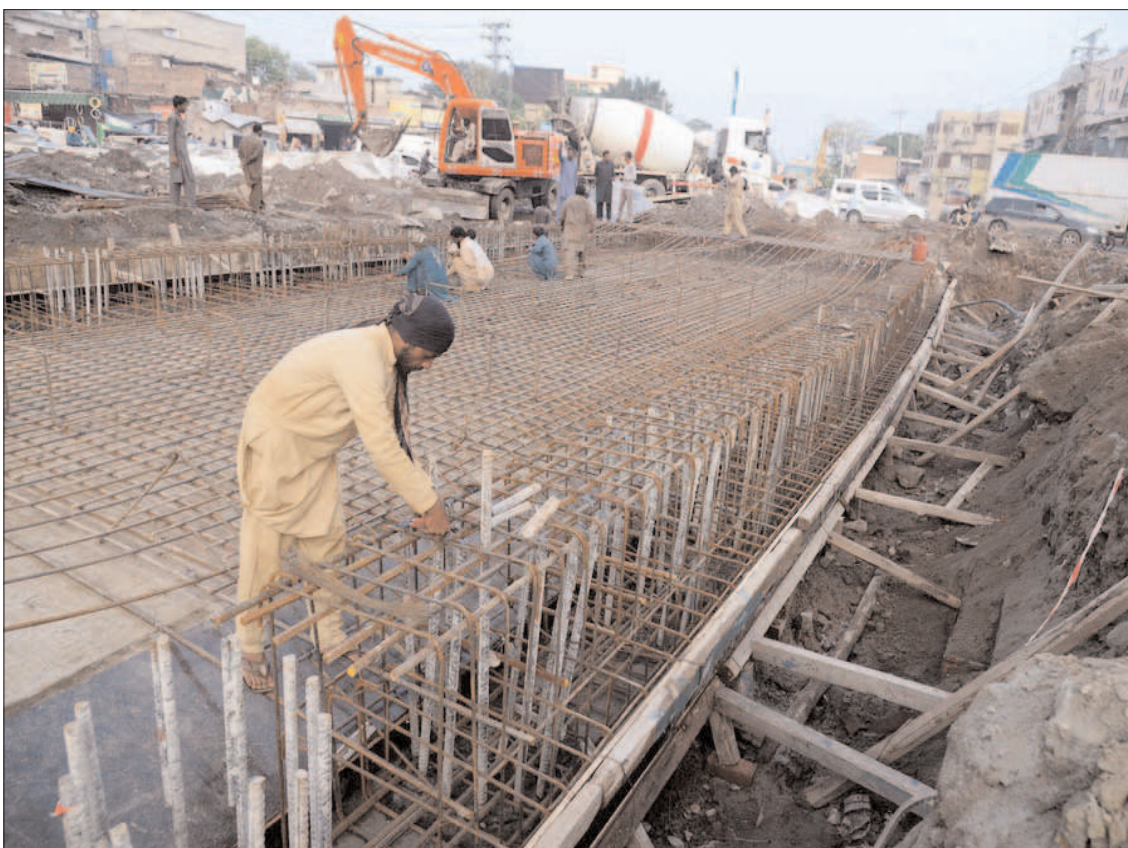
LAHORE: Labourers working at construction work of Sumanabad Underpass.

Speaking at the occasion the secretary said that it was the era of Information Technology and all universities should focus on the fastest growing technology to equip their students with IT education.