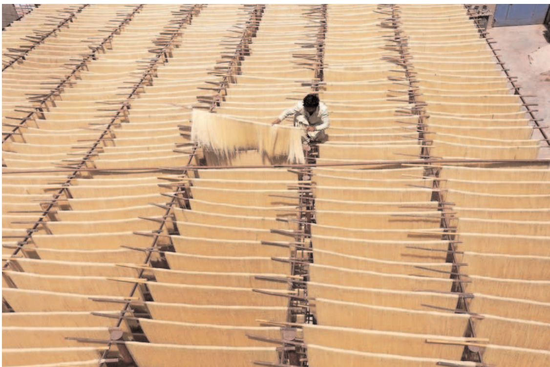
HYDERABAD: Worker busy in drying vermicelli which used to make a traditional sweet dish popular during holy fasting month of Ramadan at his work palace.

ISLAMABAD (APP): Pakistan rupee weakened by Rs1.25 against the Dollar in the interbank trading on Monday and closed at Rs 285.04 against the previous day's closing of Rs 283.79. According to the Forex Association of Pakistan (FAP), the buying and selling rates of Dollars in the open market were recorded at Rs 285.15 and Rs 288 respectively. The price of the Euro increased by 49 paisas which closed at Rs 308.89 against the last day's closing of Rs309.38, according to the State Bank of Pakistan (SBP). The Japanese Yen closed at Rs 2.13 without any change; whereas a decrease of 51 paisas was witnessed in the exchange rate of the British Pound, which traded at Rs 351.15 as compared to its last day's closing of Rs 351.66. The exchange rates of the Emirates Dirham and Saudi Riyal witnessed an increase of 34 paisas each to close at Rs 77.66 and Rs 75.94 respectively.