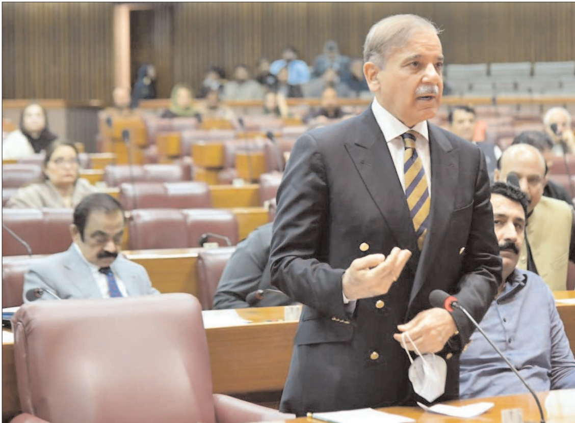
ISLAMABAD: Prime Minister Shehbaz Sharif addressing the National Assembly session.