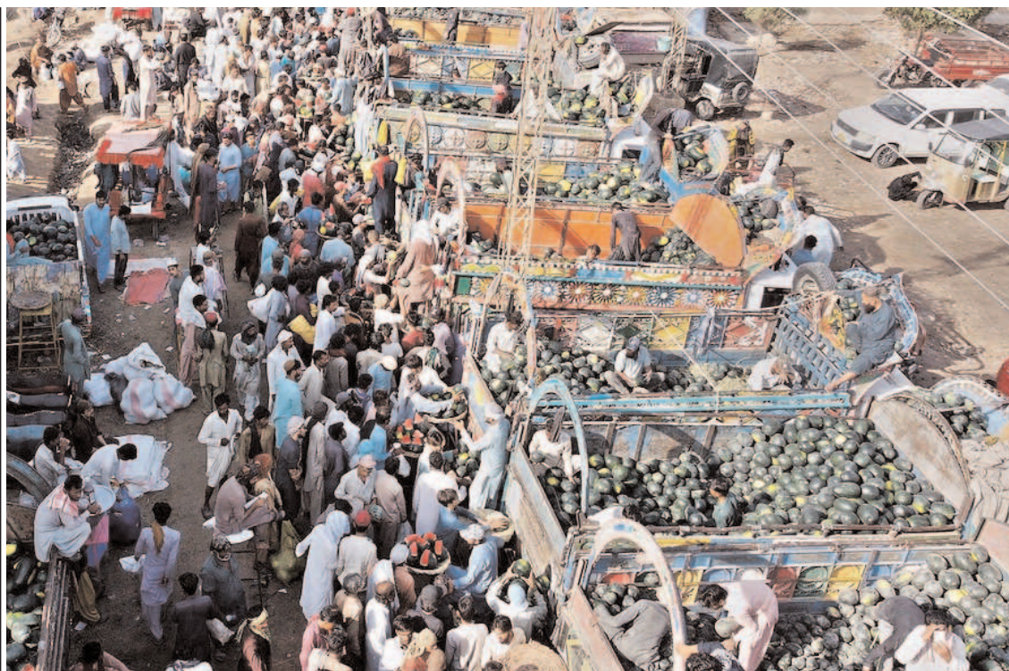
HYDERABAD: A large number of customers purchasing watermelons from vendor at fruits market.

Secondly, the recent depreciation of the US Dollar made those goods more affordable and accessible to a number of inflation-torn economies," said Al-Ghaith.