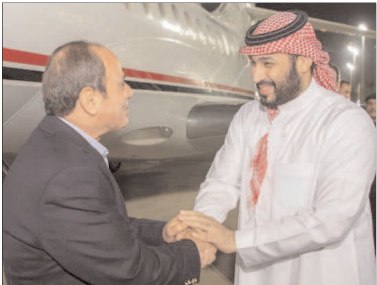
President Joe Biden's Mideast trip.