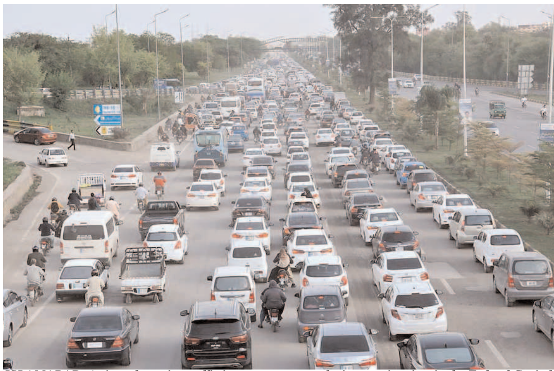
ISLAMABAD: A view of massive traffic jam at expressway during evening time in the Federal Capital.

The IGP said that Safe City Project was playing an important role in tackling crimes in the city and tracing the criminal elements. The Citizens are also requested to keep an eye on their surroundings and report any suspicious activity to Pucar-15 immediately.