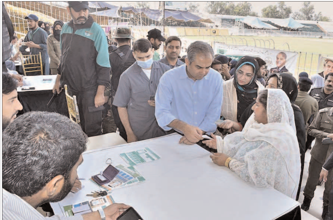
FAISALABAD: Caretaker Chief Minister (CM) Punjab Syed Mohsin Raza Naqvi is visiting flour distribution point at Hockey Stadium Madina Town.

Also, establishing such a culture within campus to impact nationally and internationally is his top priority for which he was, is and will always be striving to his maximum. The Vice Chancellor appreciated the role of faculty members within campus whose efforts and hardwork have enabled innovation and research culture within campus that is impacting students that are further impacting society.