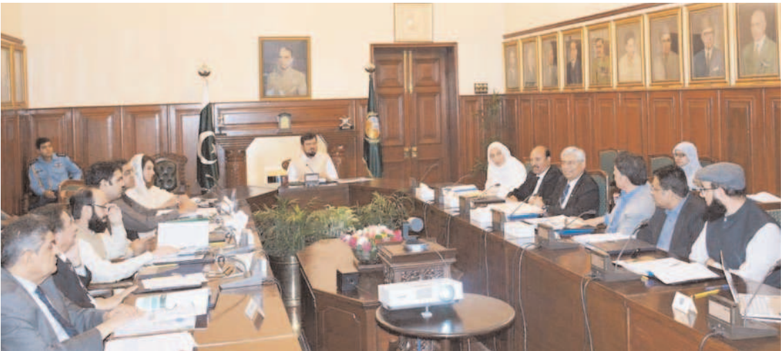
PESHAWAR: Governor Khyber Pakhtunkhwa Haji Ghulam Ali presiding over 6th Board of Governor meeting of Pak-Austria Fachhochschule University Haripur.

PESHAWAR (APP): PESCO on Tuesday notified power suspension from Kuram Ghari and Bannu Grid Stations on April 6, 8, 10, 12, 13, 15 due to unavoidable maintenance work. A press release issued here said that power supply would remain suspended from 66 KV Kuram Ghari Grid Station from 9 a.m. to 1300 hours on the given dates resultantly consumers of 66 KV Kuram Ghari Transmission Line connected 11 KV feeders would face inconvenience.