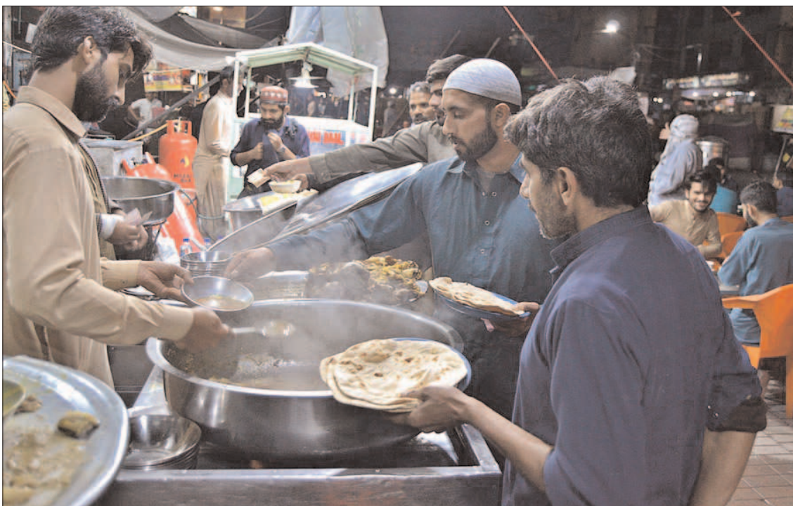
LAHORE: A vendor selling traditional food stuff to customers for sehri at Anarkali Bazaar during Holy Fasting Month of Ramzanul Mubarak.

The party's spokesperson also stressed that there is no place for such remarks or non-parliamentary language within the party's policies.