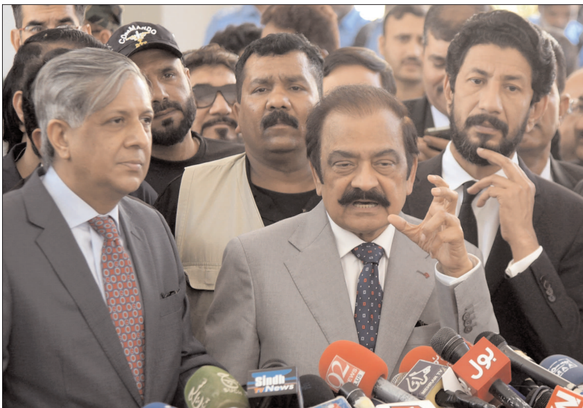
ISLAMABAD: Interior Minister Rana Sanaullah talking to media persons after hearing in election suo motu case at Supreme Court.

He observed that with these measures, the economic documentation process would be further improved, enhancing country's revenues. The prime minister also sought a report within two weeks over the positive steps in this regard.