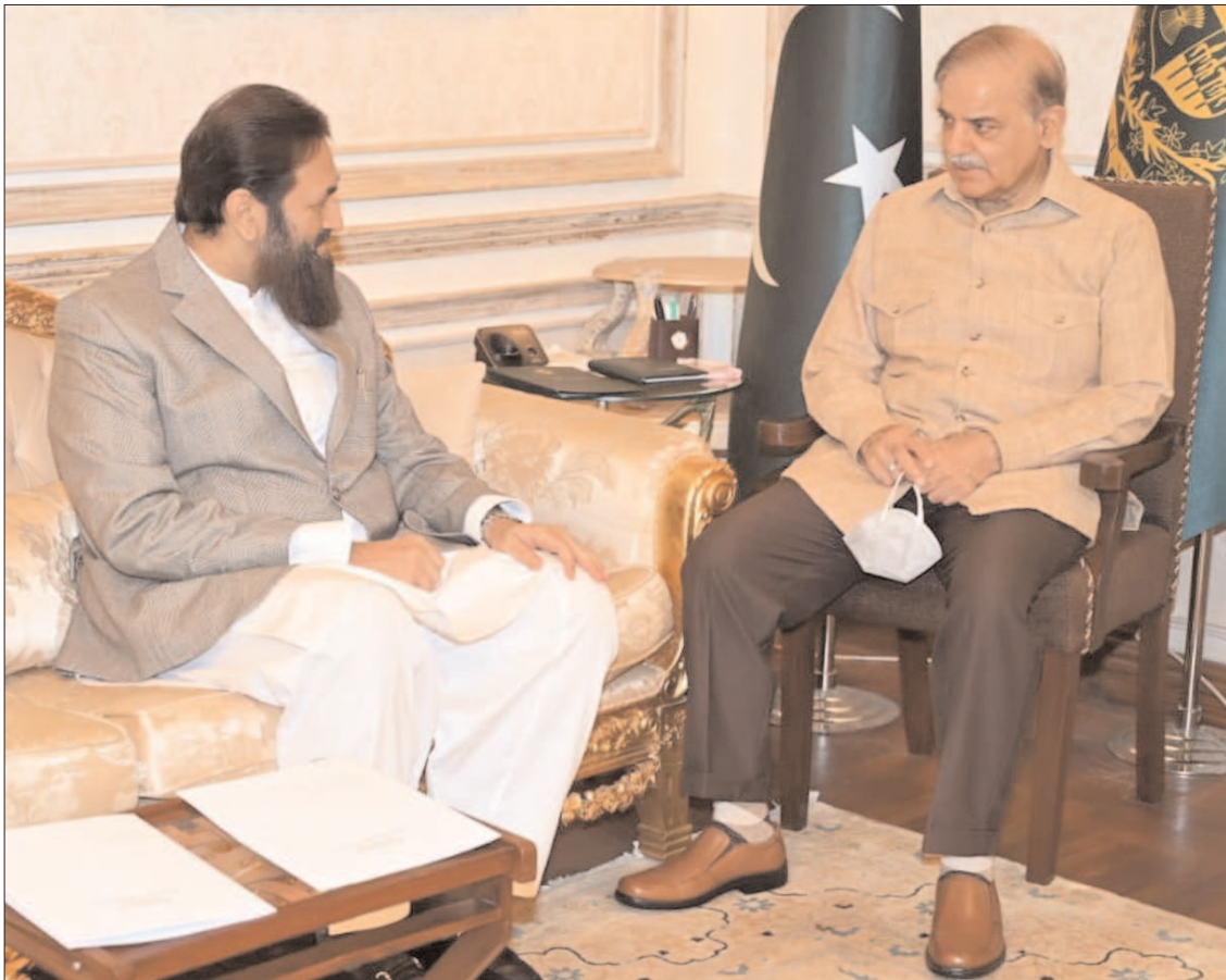
LAHORE: Governor of Punjab Muhammad Baligh-ur-Rehman called on Prime Minister Shehbaz Sharif.