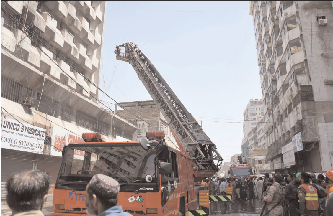
KARACHI: Firefighters trying to extinguish fire which broke out at residential building near Bolton Market.