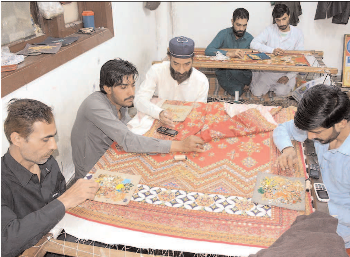
QUETTA: Workers busy in embroidery work on traditional women cloth as per demand of customers for celebrations of upcoming Eidul Fitr.