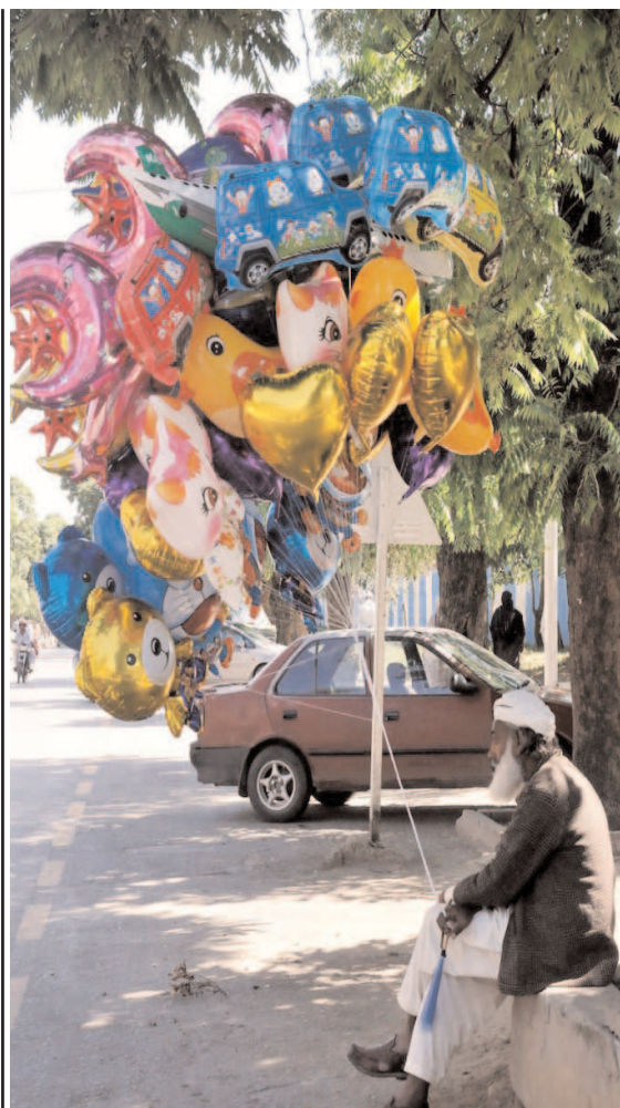
ISLAMABAD: An old man selling colorful balloons to attract costumers at Roadside.

The minister urged the Supreme Court to constitute a full-court bench on the issue of the election. He went on to explain that had the verdict by a full-court bench been given it would have been agreed by all the parties involved.