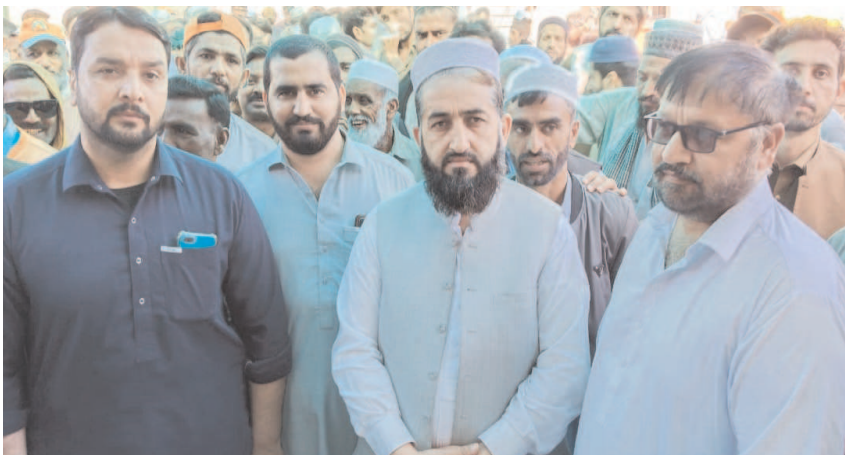
PESHAWAR: Employees of WSSP protesting over non payment of salaries.

decisions about the elections must be made calmly, as the real stakeholders in this situation are the people of the province, the police force, and the electoral staff. He asks the PTI to explain whether they will be able to conduct an election campaign in this situation. "Can they organize election campaigns in Wana, Kurram, Bajaur, Mohmand, Khyber, and other areas of Khyber Pakhtunkhwa at this time?" he questioned the PTI. Everyone wants the elections to be held, for which the KP governor believes that all political parties should sit together and discuss how to ensure this.