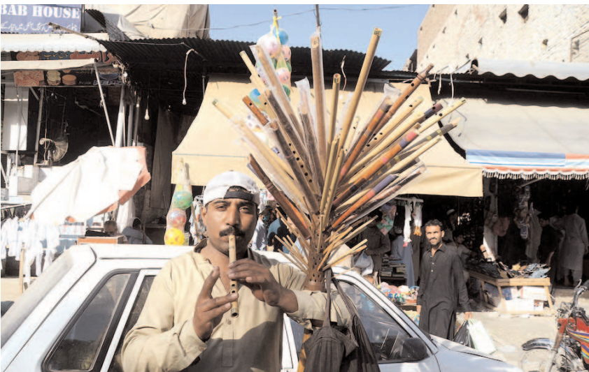
PESHAWAR: A vendor spreading tunes while displaying flutes to attract customers.

PESHAWAR (APP): A total of 49 BRT buses are parked under open sky at Chamkani depots and despite protective sheds for the buses in the project, it has not been constructed to protect the buses from bad weather conditions. During a visit to the depot at Chamkani where the new 49 BRT buses are parked under the open sky, there is a fear of damage to standing BRT buses due to bad weather conditions. In the BRT project, protective sheds for buses have not been constructed at depots, an official told this agency. A BRT bus costs at least Rs 50 million, the official, who wished not to be named, said. He said the total cost of 49 buses parked at the depots is more than Rs. 2.70 billion. Out of 220 BRT buses, 171 buses are being operated on different routes, he informed. The Minister in-charge has already imposed a ban on direct contact with media, so no one is ready to share his or her comment about any project in the pipeline regarding construction of protective sheds for the buses to protect them from damages due to weather conditions.