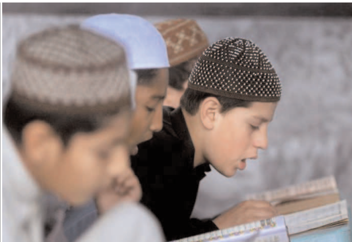
RAWALPINDI: Madrassa Students reciting Holy Quran during the Holy fasting month of Ramazan ul Mubarak at madrassa Chiragh ud Din Shah.

Upon receiving the application, the Margalla police team immediately started the investigation. The police team used technical and human resources and succeeded to trace the missing boy and reunited him with his family in the presence of Rawalpindi police officials. The parents appreciated the police team's efforts and thanked the Islamabad capital police for immediate action.