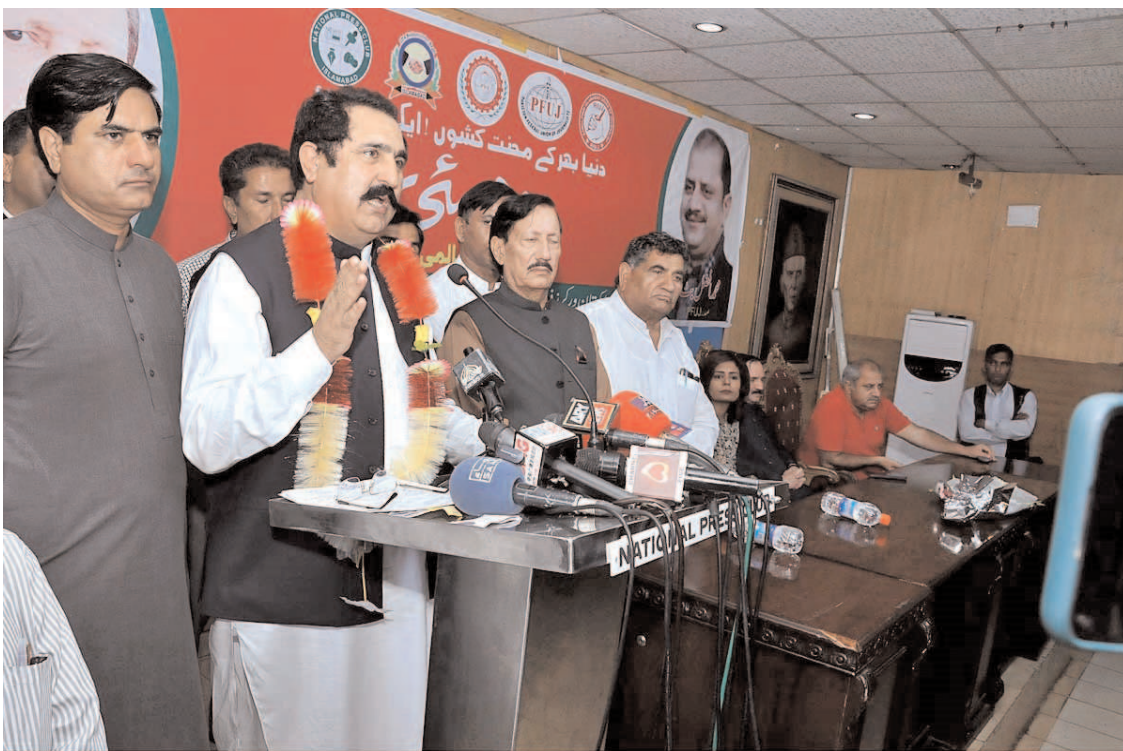
ISLAMABAD: Federal Minister Overseas and Human Resource Development Sajid Hussain Turi addressing during Labour Day seminar at National Press Club.

RAWALPINDI (APP): The Food Department Rawalpindi and district police here on Monday foiled five bids to smuggle 3720 flour bags. According to a district administration spokesman, the authorities of the food department along with Potohar Division police conducted raids in different areas and rounded up five namely Sajjad, Mushtaq, Sarfraz, Zahid and Raheem Khan on recovery of 3720 flour bags. He informed that the accused were trying to smuggle wheat flour bags out of Rawalpindi division.