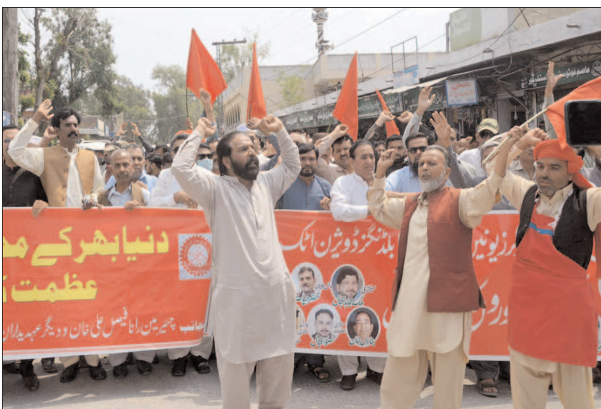
ATTOCK: A rally is being organized by All Pakistan PWD workers Union on the occasion of International Labour Day.