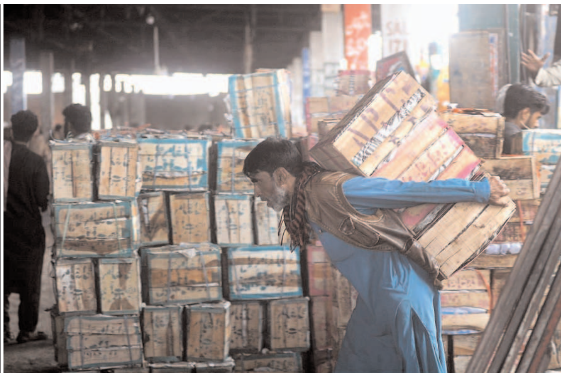
ISLAMABAD: A laborer carrying a crate on his back at market.