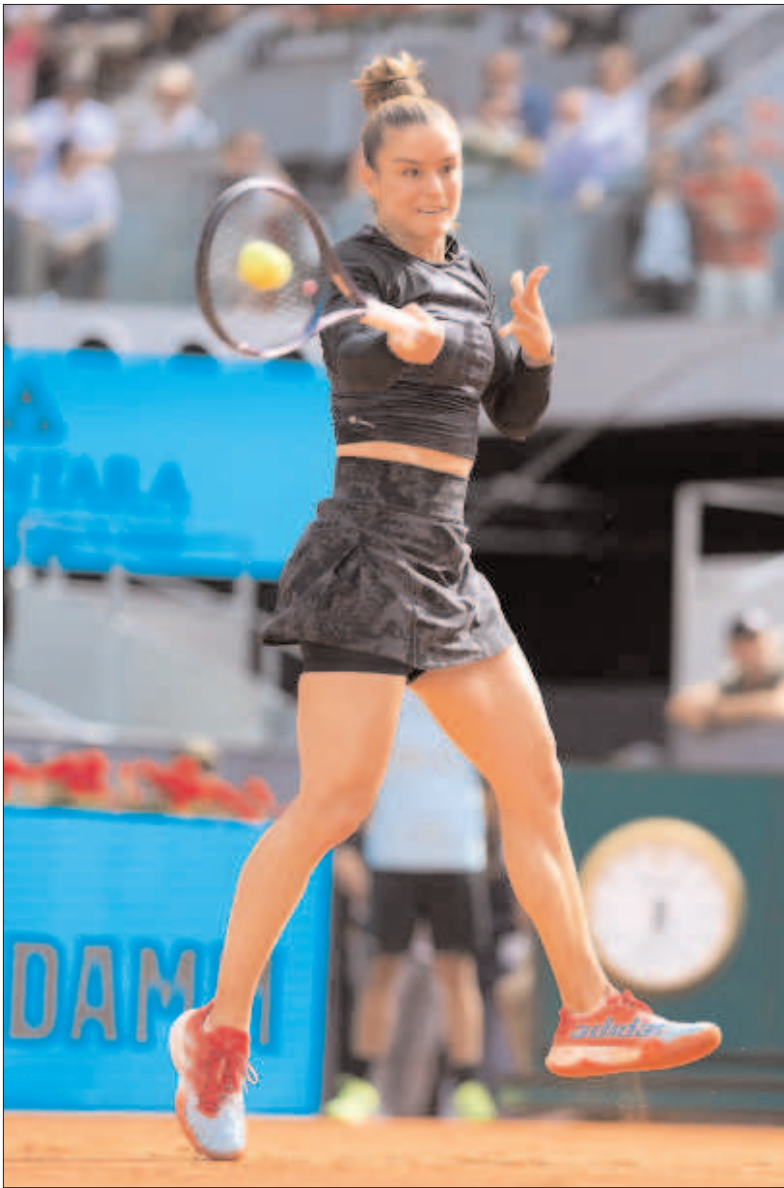
MADRID: Maria Sakkari plays a forehand shot against Paula Badosa during their Women's Singles fourth round match.