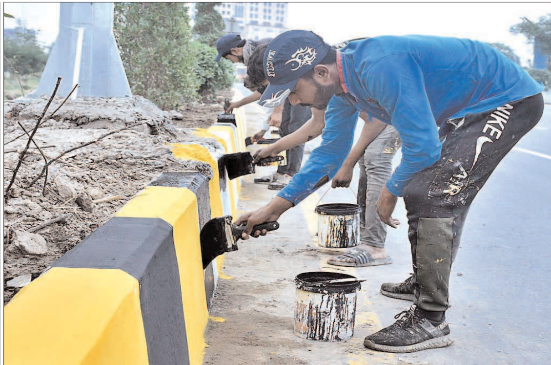
LAHORE: While the world commemorates International Labour Day, painters are busy painting the roadside.