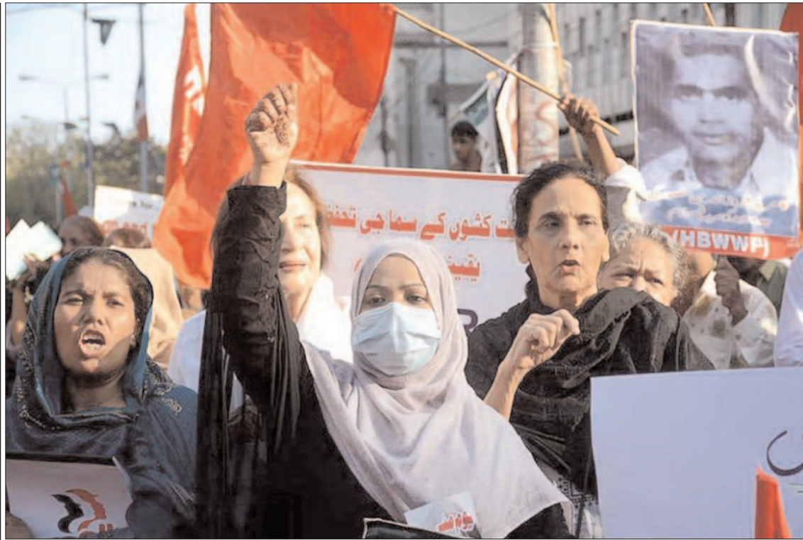
KARACHI: Women activists of National Trade Union Federation Pakistan and Home-Based Woman Workers Federation chanting slogans in favour of their demands at a rally.