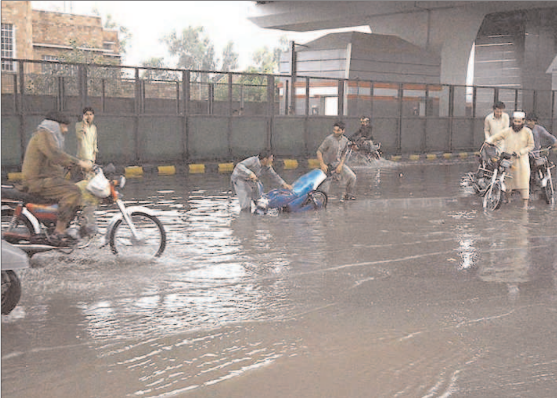
PESHAWAR: Following a heavy rain, a man is seen grappling to retrieve his bike from a manhole amidst the stagnant water that has accumulated on Sadar Road.