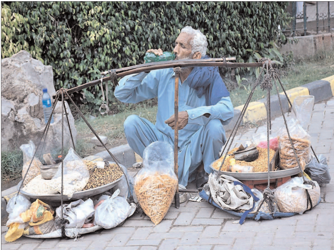
LAHORE: A labourer is waiting for customers as the world marks International Labour Day.