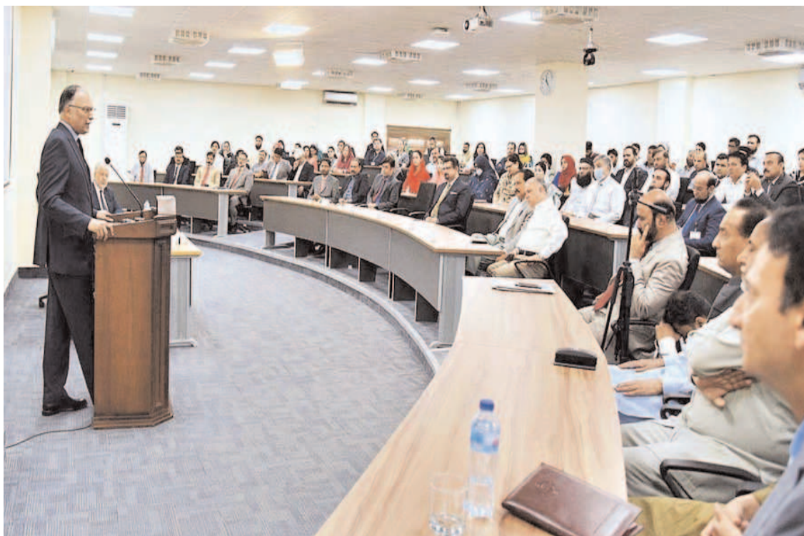
ISLAMABAD: Federal Minister for Planning and Development Ahsan Iqbal speaking at the inauguration ceremony of the Research and Strategic Block of the National University of Modern Languages.

ISLAMABAD (APP): Islamabad Electric Supply Company (IESCO) on Wednesday issued a power suspension programme for Thursday for various areas of its region due to necessary maintenance and routine development work. According to IESCO Spokesman, the power supply of different feeders and grid stations would remain suspended for the period from 09:00 AM to 02:00 PM, Islamabad Circle, Highway, Iqbal Town, Zia Masjid, Service Road East, Tufail Shaheed, Charah, Farash Town, Karpa, Suhdaran Road Feeders, Rawalpindi City Circle, EME Complex, P&T Wini, Jhangi, Azharabad, Dhok Hasu, Major M a s o o d, G u l s h a n a b a d, Industrial, Dhok Mangatal, Kayani Road, Tench Bhatta, Mohanpura Feeders, Rawalpindi Cantt Circle, Kahota City-II, Hanif Shaheed, Army Flats, RA Bazar, IST, New Rawat, Fazal Ahmad Shaheed, Choah Khalsa, Feeders, Jhelum Circle, Mandi Bhalwal, F-3 Gul Afshan, Smoot Feeders, Chakwal Circle, Basharat Feeder, Attock Circle, from 08:00 AM to 01:00 PM Shadi Khan, Sirk, S h a m s a b a d, Ghorghashti, Barazee, Maskinabad, Shah Deer, Radio Pak. 1 & 2, Lawrencepur, Qaziabad, GBHP Colony, Shafi Chauhan Feeder and surrounding areas.