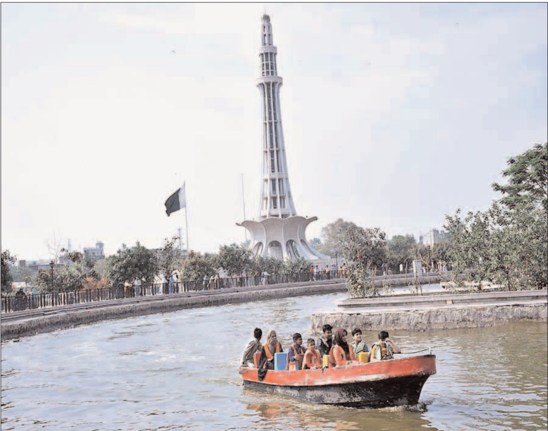
LAHORE: Families enjoying a boat ride at Minar e Pakistan's Greater Park.