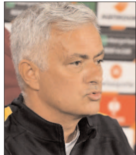
LaLiga, Copa del Rey, and the Spanish Super Cup.

Together, they clinched prestigious titles such as