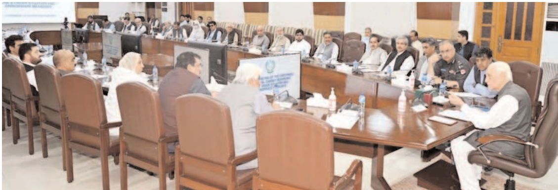
PESHAWAR: Caretaker Chief Minister Khyber Pakhtunkhwa Muhammad Azam Khan chairing a special meeting of Provincial Cabinet.

in 1969. PPSC has conducted 92 long courses and trained about 2500 officers of all the provincial govts of Pakistan including GB and AJK. The DG then highlighted the projects carried out for infrastructure development of the campus, especially thanking the Chief Secretary for supporting the Academy's developmental activities through a 50 bed hostel for PPSC and a solar system for the PARD Agriculture demonstration farm. The Chief Secretary then visited the developmental projects of under construction PPSC hostel for trainee officers, PARD Agri-farm solar project and the new Cafeteria and IT Lab for SMC and MCMC participants and Employees Welfare Complex for campus residents and trainee participants for all courses. He promised to expedite the release of fund from the provincial government and instructed the concerned provincial departments to speed up the work on the projects. In the end, the honorable Chief Secretary also planted a Magnolia plant at the campus.