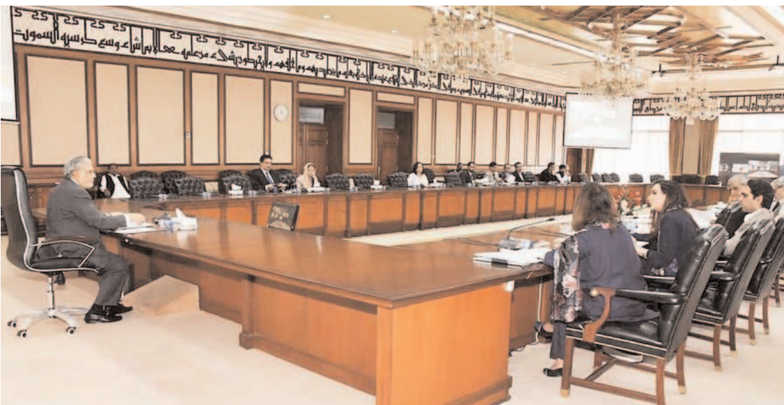
MULTAN: Federal Minister for Finance and Revenue Senator Mohammad Ishaq Dar chairing meeting of Economic Coordination Committee of Cabinet.

nologies to optimize battery life for all 5G connection conditions. Smartphones powered by the MediaTek Dimensity 9200+ are expected to be released in May 2023.