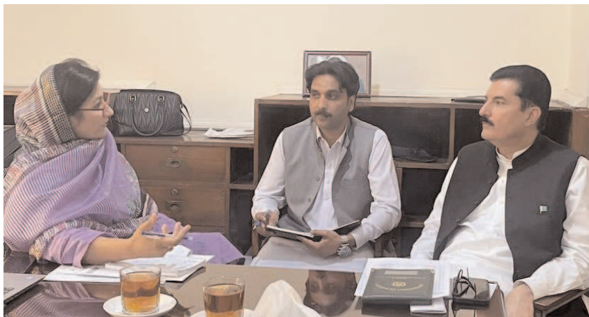
PESHAWAR: Federal Minister Faisal Kareem Kundi meeting with Director General BISP during his visit to central zonal office KP region.

tate people and resolve their confronting problems. The representatives of multinational and national companies from across the country observe and evaluate the projects of the students and conduct their interviews.