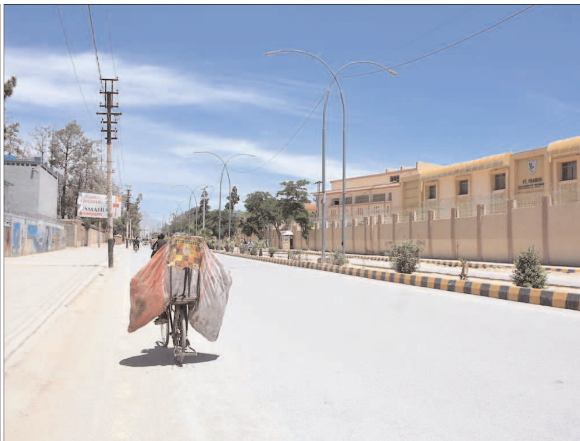
QUETTA: A deserted look of busy road due to protest against arrest of PTI chairman Imran Khan.