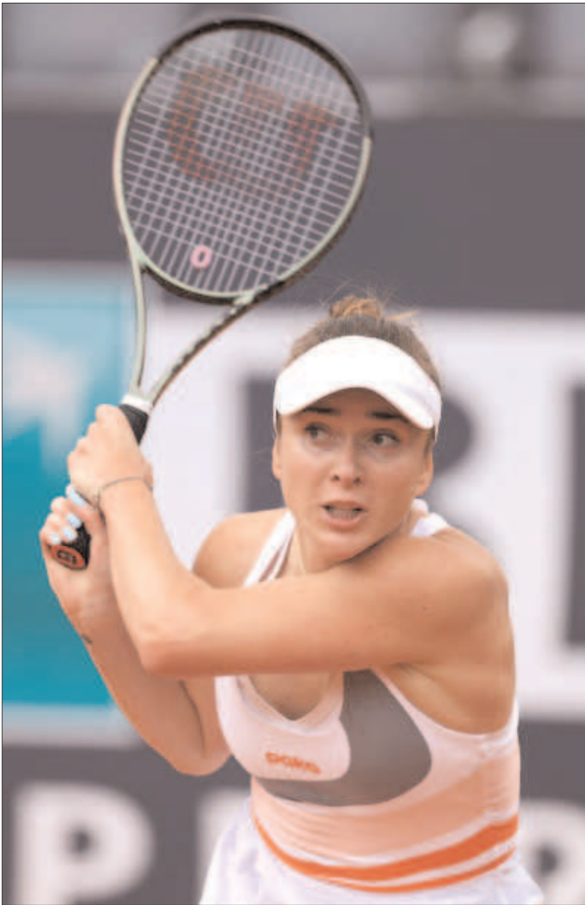
ROME: Elina Svitolina of Ukraine plays a backhand during their round of 128 match against Lesia Tsurenko of Ukraine at Foro Italico.

The former Spain captain retired from international football in December, having won the 2010 World Cup and 2012 European Championship with his national side.