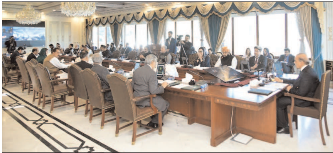
ISLAMABAD: Prime Minister Shehbaz Sharif chairing a meeting of the Federal Cabinet.

"Avoid unnecessary travel to Pakistan-administered Kashmir, Balochistan, KP. Also avoid non-essential travel to Karachi due to the threat of violence and terrorism. The Canadian government may not be in a position to provide consular assistance to the Canadian citizens in the areas of serious security concern," the high commission informed the Canadian citizens in Pakistan.