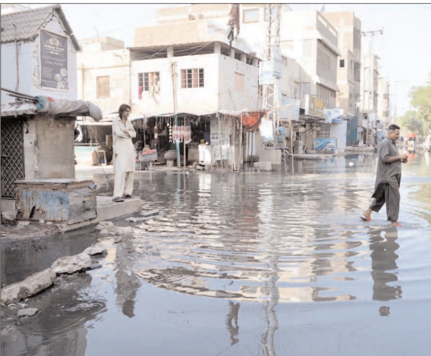
HYDERABAD: Inundated road by overflowing sewerage water, causing unhygienic atmosphere and creating problems for residents and commuters.