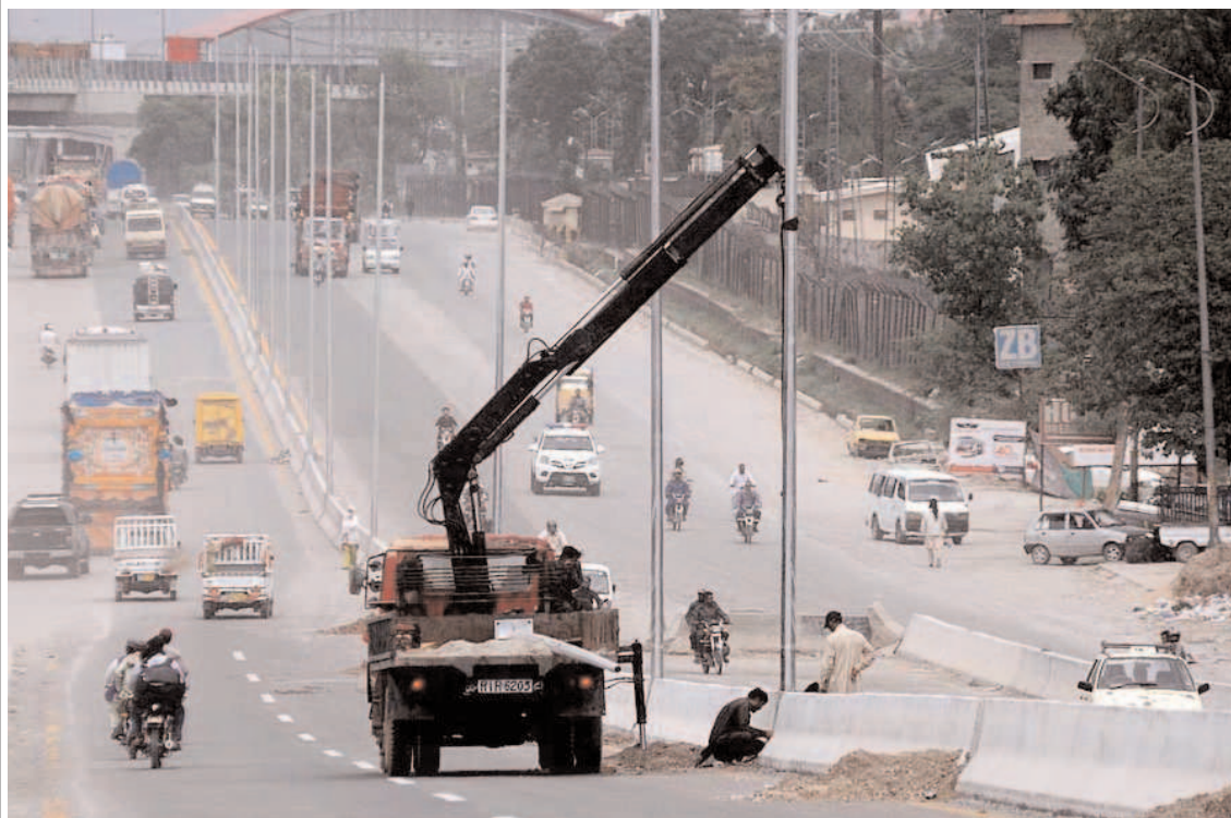
ISLAMABAD: CDA Workers installing new pole lights at IJP Road.

After realizing the growth potential of the tourism sector in the country, the PTDC initiated devising policies, strategies and frameworks to attract tourists coming from various parts of the country and the world. The PTDC is representing the country by organizing domestic and international events and exhibitions for assisting tourists with the provision of transport and accommodations facilities within the country. The incumbent government has taken many initiatives to promote and revive the tourism industry to explore historical sites to yield desirable results in this sector.