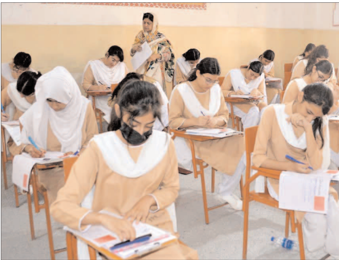
HYDERABAD: Matric students solving paper during SSC examination.