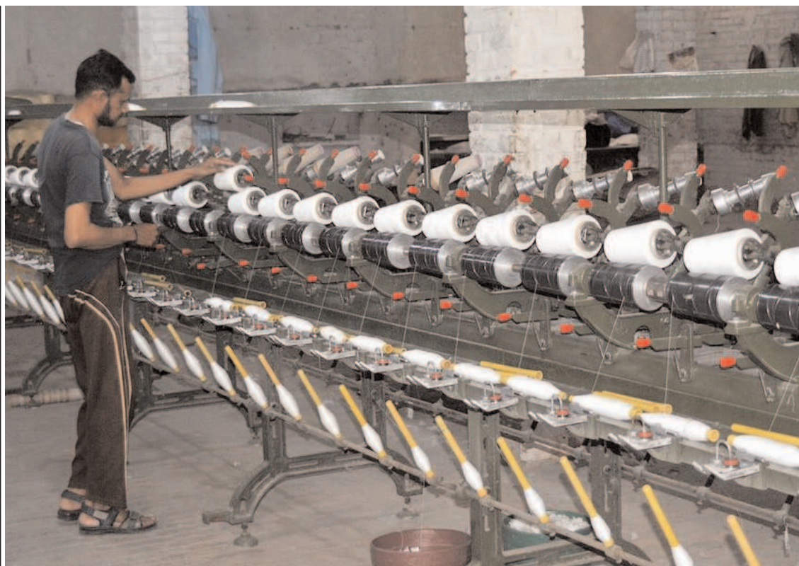
MULTAN: A factory worker making thread reels on machine.

The price of gold in the international market rose by $7 to close at $2,038 as compared to $2,031 last day, the Association reported.