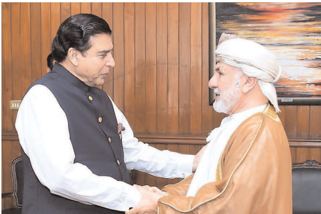
ISLAMABAD: Speaker National Assembly Raja Pervez Ashraf receiving Deputy Chairman State Council of Oman Sheikh Dr. Al-Khattab bin Ghalib bin Ali Al-Hinai at Parliament House.