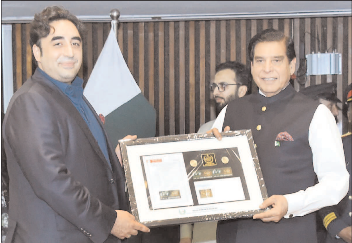
ISLAMABAD: Speaker National Assembly Raja Pervez Ashraf presenting commemorative stamp and coin to Federal Minister of Foreign Affairs Bilawal Bhutto Zardari at Parliament House.