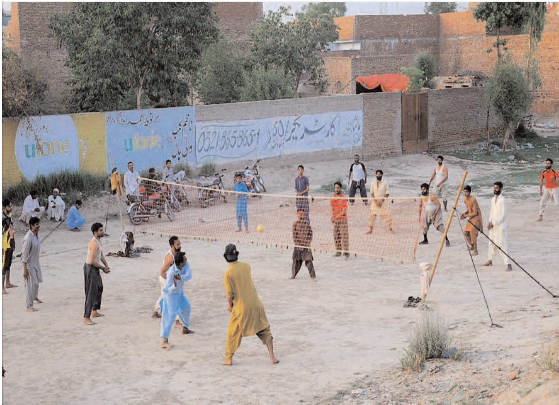
MULTAN: Youngsters playing volleyball in a local ground.

"I think going to rehab taught me happiness is an inside job, which I truly believe. So since that moment in 2000, I've always believed that."