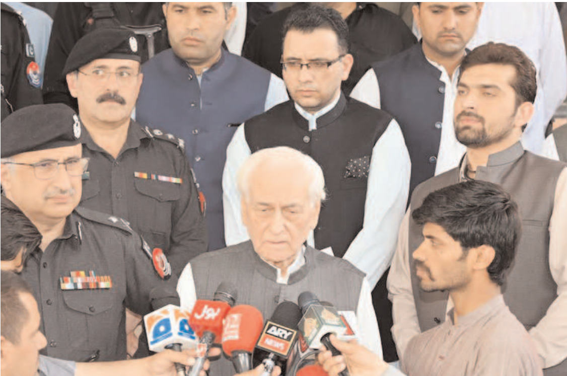
PESHAWAR: Caretaker Chief Minister Khyber Pakhtunkhwa Muhammad Azam Khan talking to media during his visit to Police Hospital.