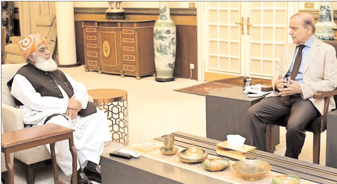
ISLAMABAD: JUI-F chief Maulana Fazlur Rehman called on Prime Minister Shehbaz Sharif.