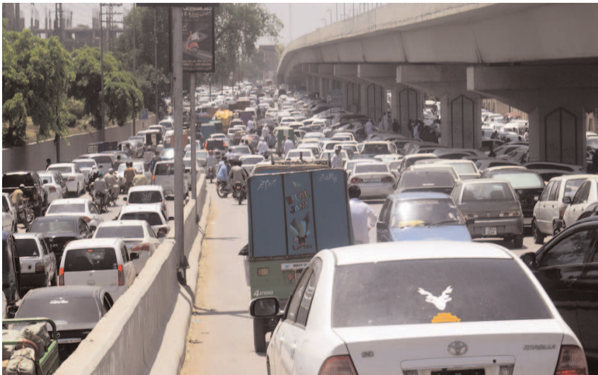
PESHAWAR: A view of block road front front of Provincial Assembly and Peshawar High Court.