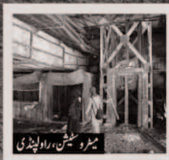
میہرون نشین، راولپنڈی