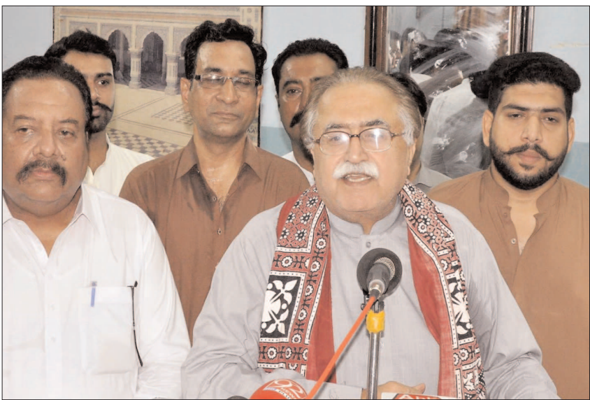
HYDERABAD: PPP leader Maula Bux Chandio addressing party workers.

The shooting incident took place at the victim's shop near Swabi Link road. The suspects escaped from the crime scene. Emergency responders including cops rushed to the crime scene, collected necessary evidence and shifted the bodies to a state hospital for legal formalities. Police have formed a team to arrest the killers.