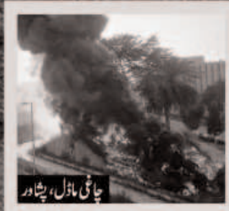
جانی باڈل، پشاور