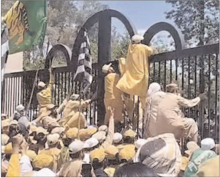
ISLAMABAD: JUI-F's crossing gate to enter in Supreme Court during a sit-in.