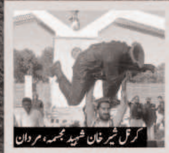
کرتل خٹک خان شہید مجسمہ، سرگودھا