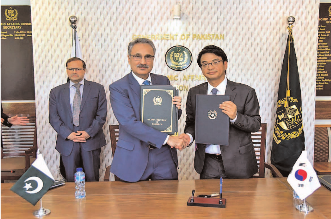
ISLAMABAD: Government of Pakistan signs Agreement with the Republic of Korea under the G-20 Debt Service Suspension initiative.