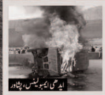
ایڈس ہسپتال، پشاور