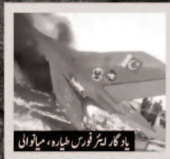
یادگار میرزا نور خان شاہروہ، میانوالی