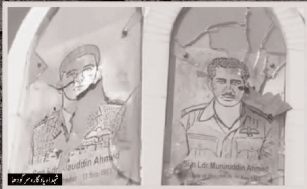
شہداء یادگار، سرگودھا