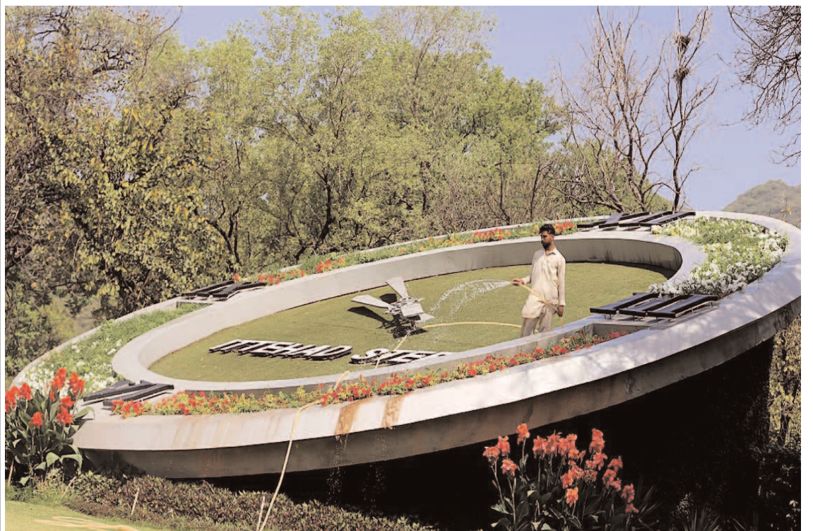
ISLAMABAD: A CDA worker watering plants at Margalla Road in the Federal Capital.