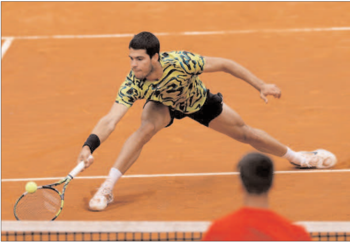
ROME: Carlos Alcaraz of Spain in action during the matcg between Marozsan vs Alcaraz at the Internazionali BNL D'Italia 2023 - Day Eight at Foro Italico.

NEW YORK (Agencies): Jayson Tatum led the Boston Celtics to a 112-88 game-seven victory over the Philadelphia 76ers to reach the NBA Eastern Conference finals. Tatum's 51 points beat the game-seven record of 50 set by Golden State's Stephen Curry against the Sacramento Kings earlier this month. He also added 13 rebounds, five assists and a couple of steals. Boston will now face the Miami Heat - the team they beat in seven games in last year's conference finals. The opening game of the series takes place on Thursday at 01:30 BST. The Celtics defence restricted NBA Most Valuable Player Joel Embiid, who was held to 15 points. Jaylen Brown added 25 points for Boston, who broke open a close game in the third quarter as they out-scored the 76ers 33-10. Philadelphia went the six minutes of the period without a basket and trailed by 26 heading into the fourth, when Boston pushed the lead to 30 with less than four minutes to play after Tatum was taken out of the game. "It felt great," Tatum told ESPN. "This was a back and forth series. Obviously I didn't play well the first half of the last game and I was just happy to get an opportunity to bounce back. To come back home, game seven on Mother's Day. I had to put on a special performance for her." It was another crushing play-off exit for the 76ers who were led by Tobias Harris' 19 points, while star guard James Harden scored just nine as they were limited to 37.3% shooting from the floor.