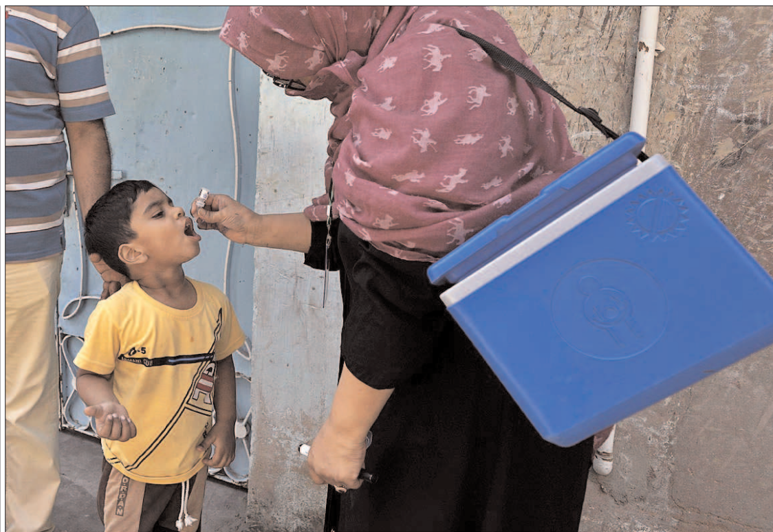
KARACHI: Lady Health worker administering polio drops to a child at district central.

The ruins of Mohenjo Daro were rediscovered in the 1920s and have since been excavated by archaeologists, providing valuable insight into the history and culture of the Indus Valley Civilization. Today, the site is a UNESCO World Heritage Site and attracts visitors from all over the world. A hard. The hard works of artificial thoughts done by a painter create artificial images of Moen Jo Daro in this modern world.