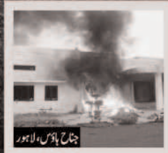
جناح پلاز، لاہور

شہیدوں کی وفا کی یادگاریں، فخر تھیں تیرا یہ طیارہ نہیں تھا، استعارہ تھا کہ سرحد پار سے دشمن تیرے گھر آ نہ پائے گا