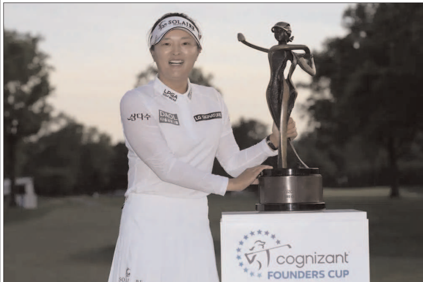
CLIFTON: Jin Young Ko, of South Korea, poses for a photo with the trophy after winning the LPGA Cognizant Founders Cup golf tournament in a playoff.

"So what's going on? Why can't the Indian cricket team come to Pakistan?"