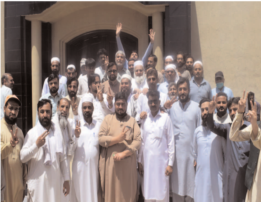
PESHAWAR: Members of All Municipal Workers Union WSSP chanting slogans during a protest in favour of their demands.