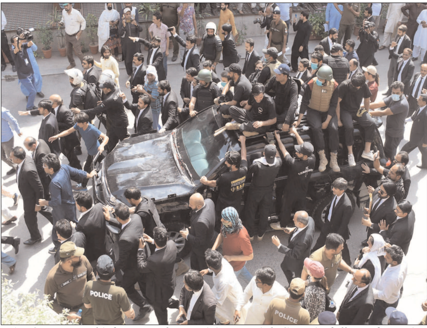
LAHORE: PTI chief Imran Khan arriving to High Court in full proof security, for his hearing.

Maryam said the first attack on the General Headquarters was carried out by the TTP and now the PTI was behind the second one. Imran Khan had let loose his gang of criminals set the aircraft – the symbols of the courage shown by brave soldiers in the war, on fire. She asserted not more than 500 people had come out anywhere in Pakistan after Imran Khan’s arrest.