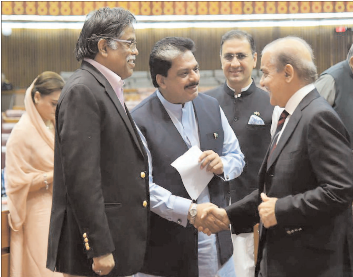
ISLAMABAD: Prime Minister Shehbaz Sharif interacting with Parliamentarians during the National Assembly session.