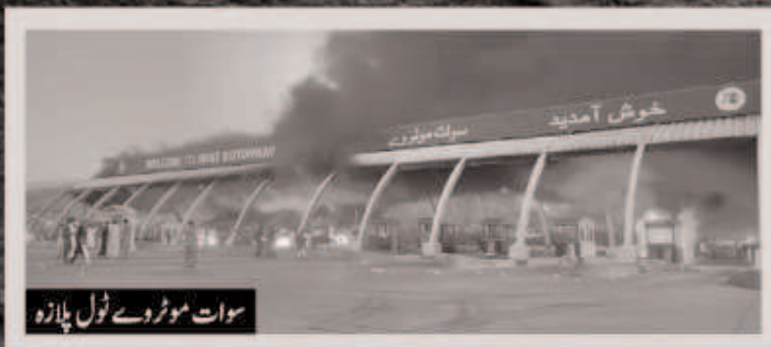
سوات موٹروے ٹول پلازہ

تمہیں تعلیم نفرت کی جو دے، دشمن تمہارا ہے سازشی سیاست کی چڑھونہ بھینٹ، وطن ہم سب کو پیارا ہے