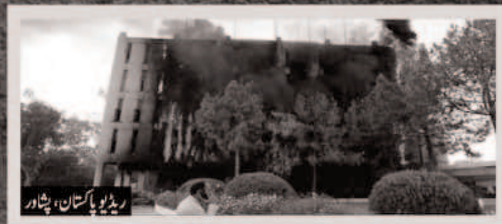
ریڈیو پاکستان، پشاور