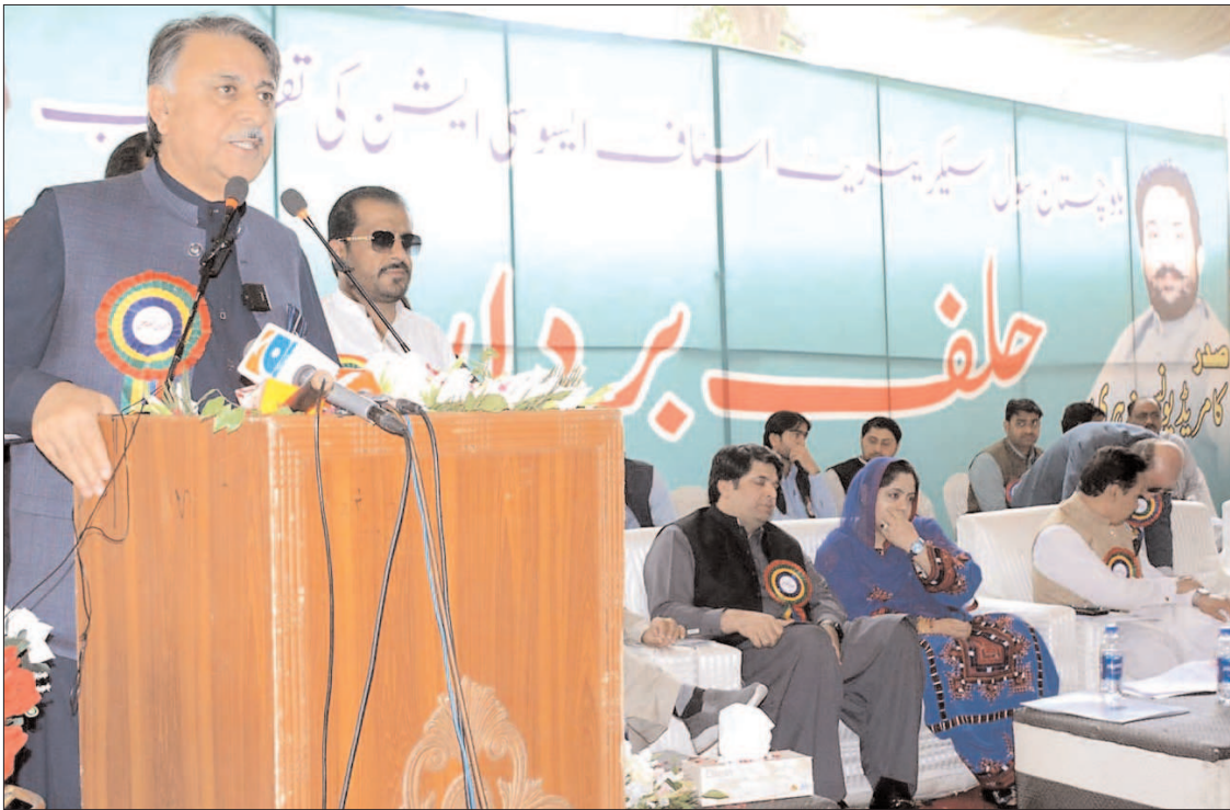
QUETTA: Governor of Balochistan Malik Abdul Wali Kakar addressing during a ceremony.