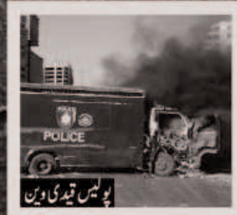
پولیس قیدی دین