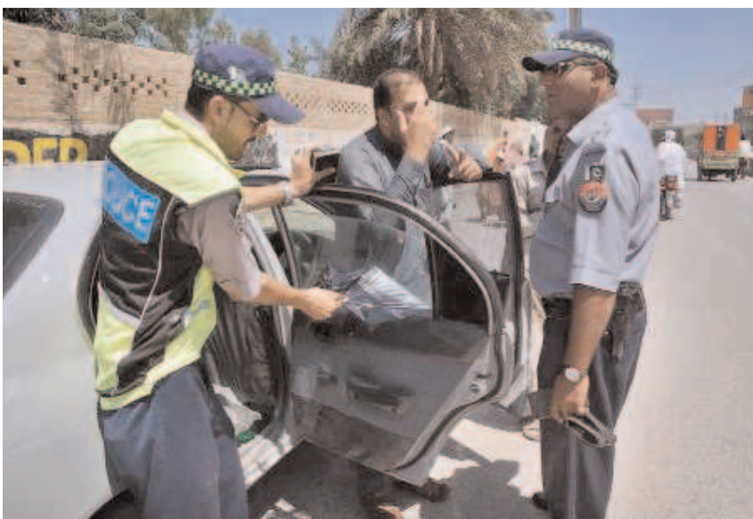
PESHAWAR: Traffic warden officials removing tinted glasses from a car during a campaign at Eid Gah Road.

She added that we desire to expand the dynamics of linkages for benefit of students and appreciated Khyber Pakhtunkhwa Culture and Tourism Authority for joining hands in order to encourage the Student's work. Such collaborations lead to encouragement, confidence building and a way to open opportunities for the students, she added.