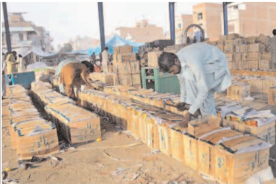
MULTAN: Laborers busy in packing tomatoes in wooden boxes at vegetable market.

The Cotton Commission further informed that the incumbent government was taking appropriate measures to revive cotton output and introduced several measures for encouraging local growers.