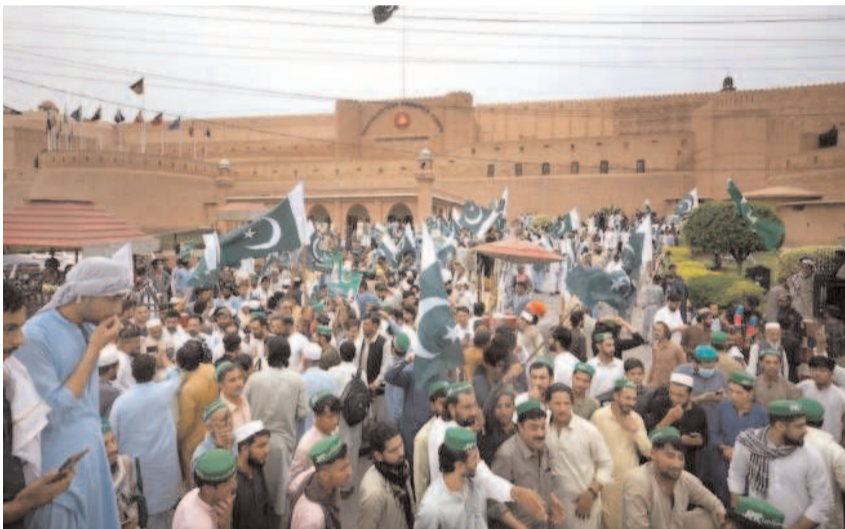
PESHAWAR: A large number of people attending rally in favour of Pakistan Army at Fort Balahisar.

The power supply will remain suspended from 132 KV Peshawar City Grid Station on 18th, 22nd, 25th and 29th May from 8:00 a.m. to 2:00 p.m. resultantl consumers of 11KV Sikhandar Abad, Zaryab, Pandu Road, City Home, Bana Mari, Umar, Islamabad, Faqir Abad, Sheikh Abad, Molvi G, Nisht-arabad, NHA feeders will face inconvenience.