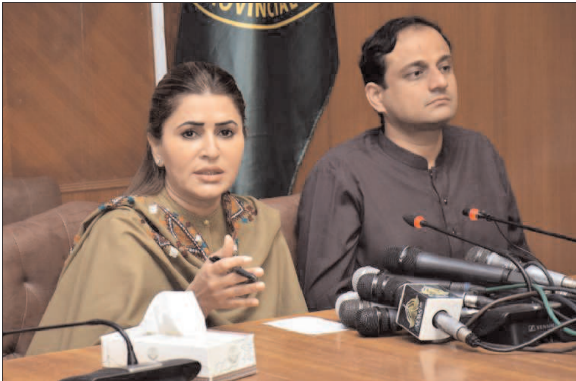
KARACHI: Shazia Marri Federal Minister for Poverty Alleviation & Social Safety and Chairperson Benazir Income Support Program addressing the press conference .