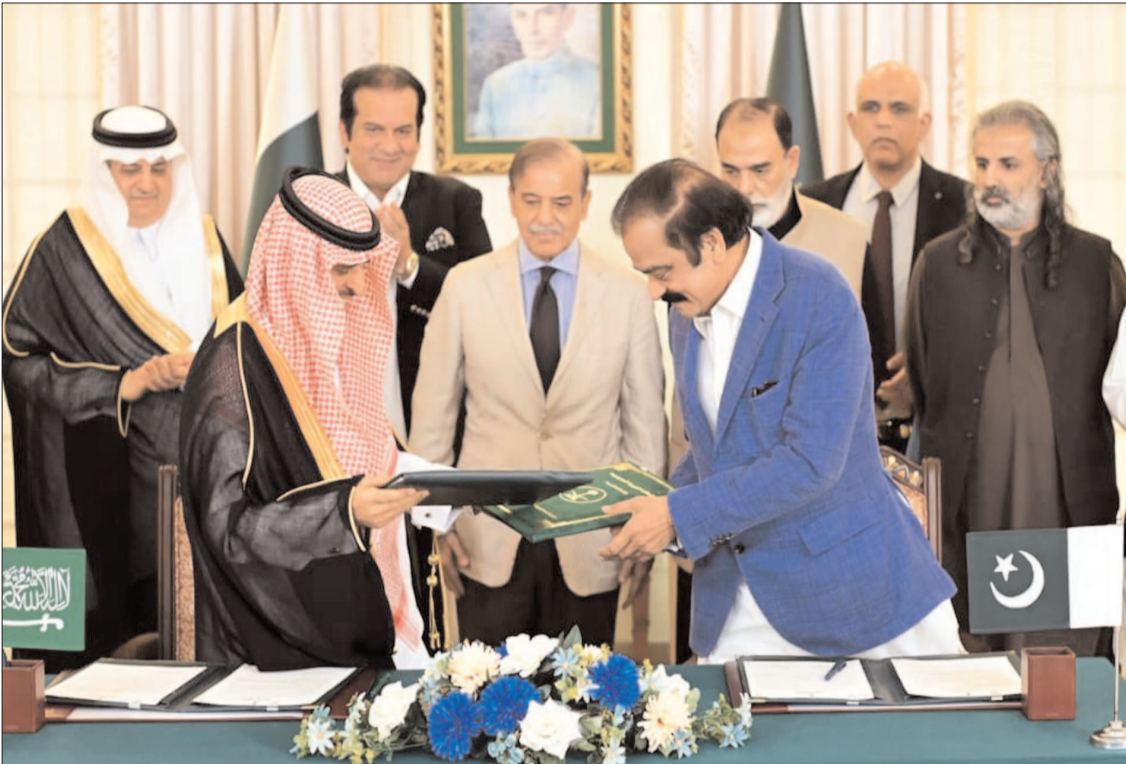
ISLAMABAD: Prime Minister Shehbaz Sharif witnessing the signing ceremony of Memorandum of Understanding between Saudia Arabia and Pakistan ‘Road to Makkah Project’ aimed at facilitating Pakistani Hujjaj.