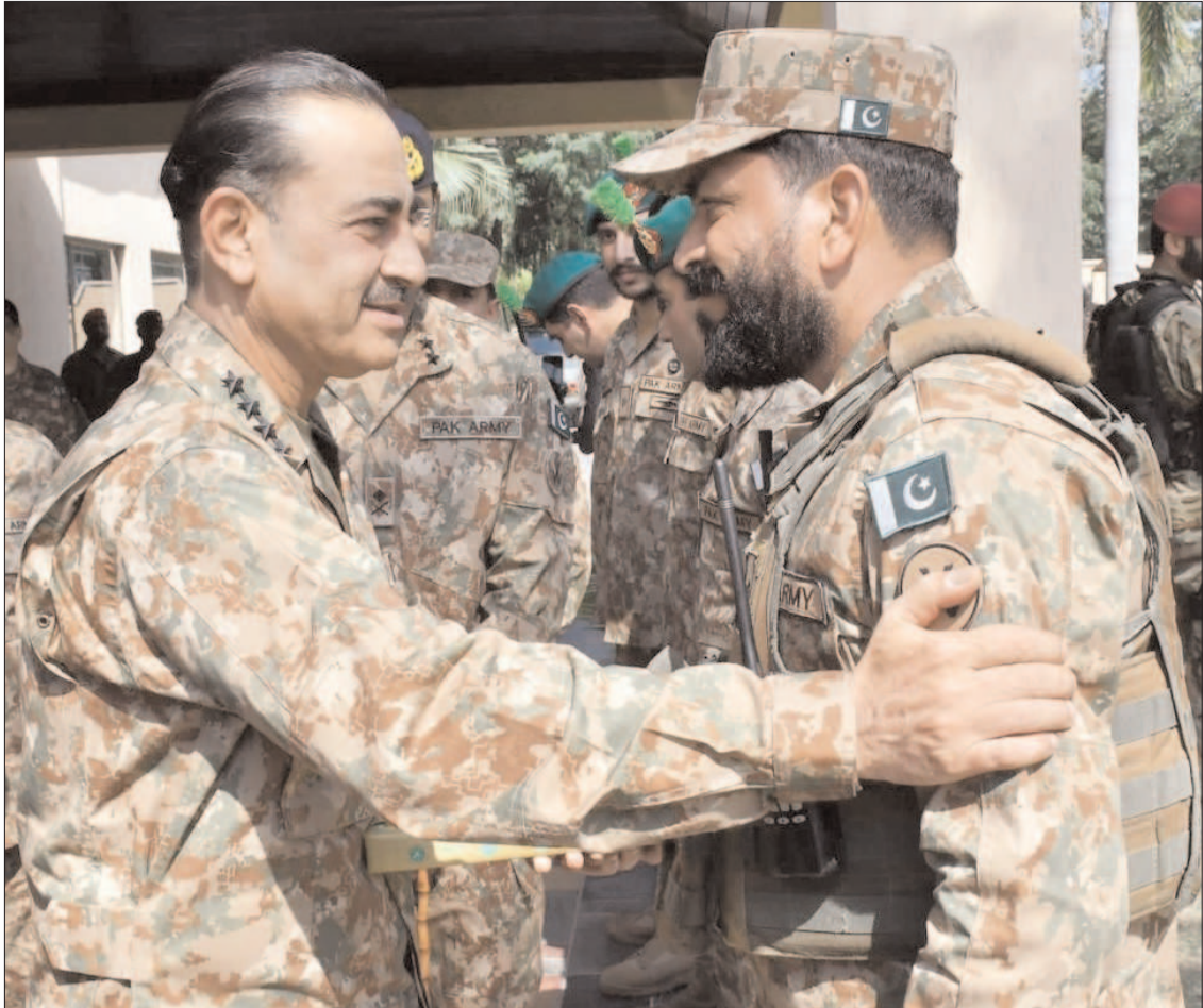
RAWALPINDI: General Syed Asim Munir, COAS interacting with jawan during his visit to Sialkot Garrison.