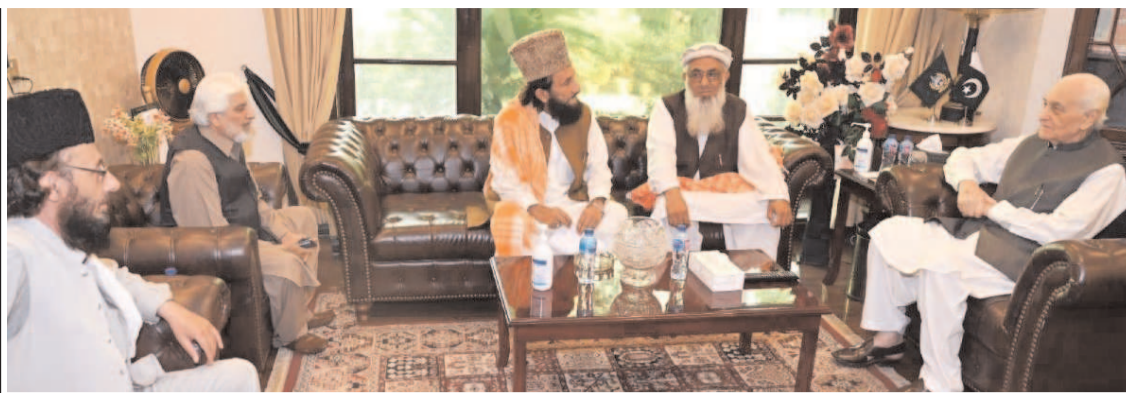
PESHAWAR: Delegation of Chitral meeting with Caretaker Chief Minister Khyber Pakhtunkhwa Muhammad Azam Khan. Caretaker Minister Abdul Haleem Qasuria also present on occasion.

During the operations over 30 ramps, encroached sheds were removed by the heavy machinery while an illegal fruit market was also removed.