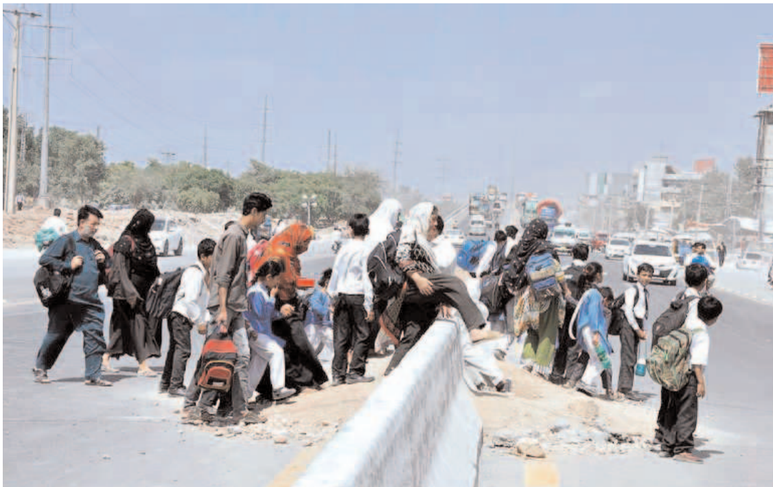
ISLAMABAD: Hundreds of students daily cross the busy IJP Road due to unavailability of crossing space or pedestrian bridge, needs the attention of concerned authorities.

Federal Minister for Information Technology (IT) and Telecommunication Sted Amin ul Hage in a message said, "I wish that public and private sectors should make pledges for universal connectivity and digital transformation."