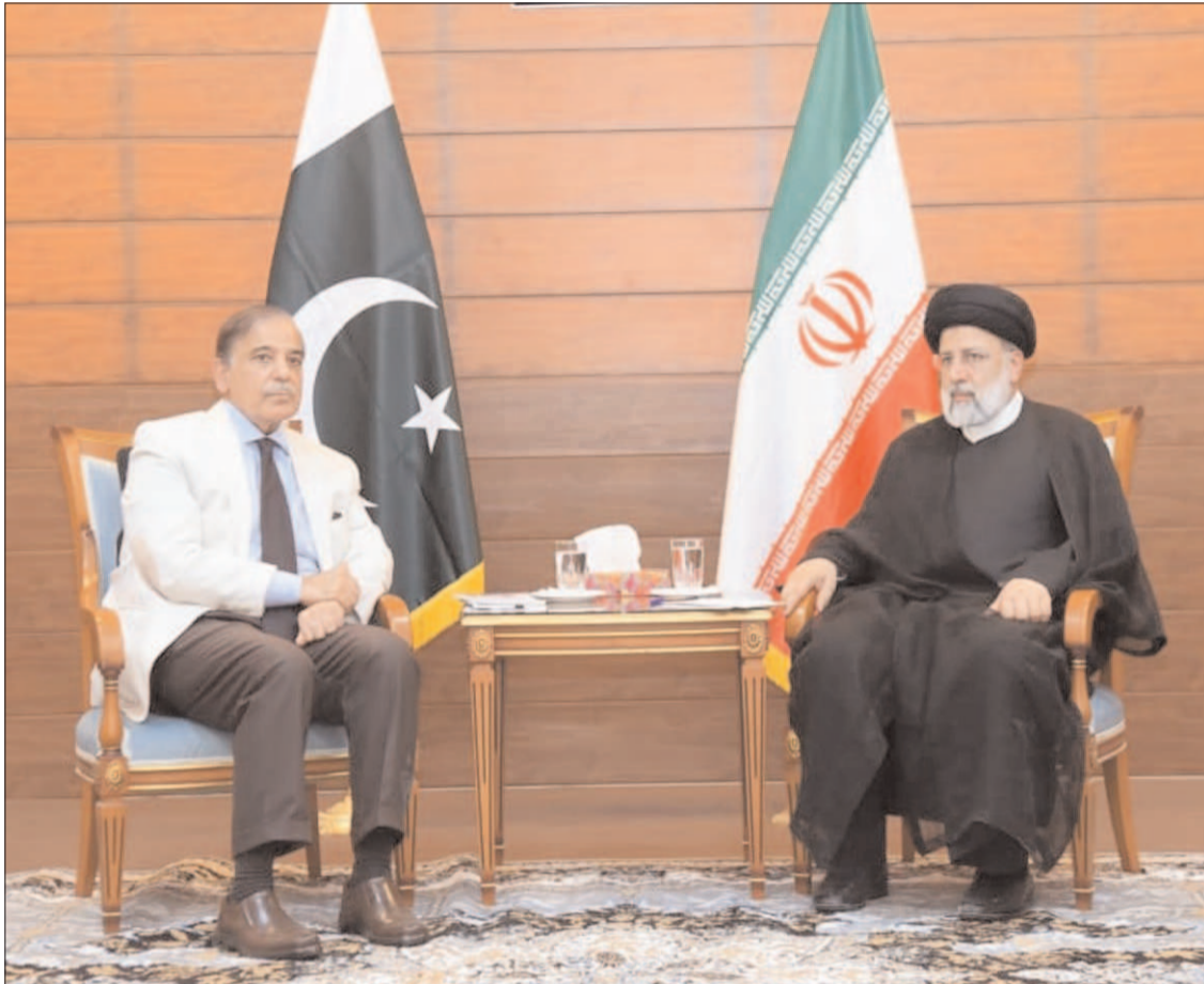
PISHIN: Prime Minister Shehbaz Sharif and Iranian President Ebrahim Raisi in a delegation level meeting at Man-Pishin joint border market at Pakistan-Iran border.

Office in a statement said, "The joint inauguration is a manifestation of the strong commitment of Pakistan and Iran to uplift the welfare of residents of the neighboring provinces of Balochistan and Sistan-o-Balochestan, respectively."