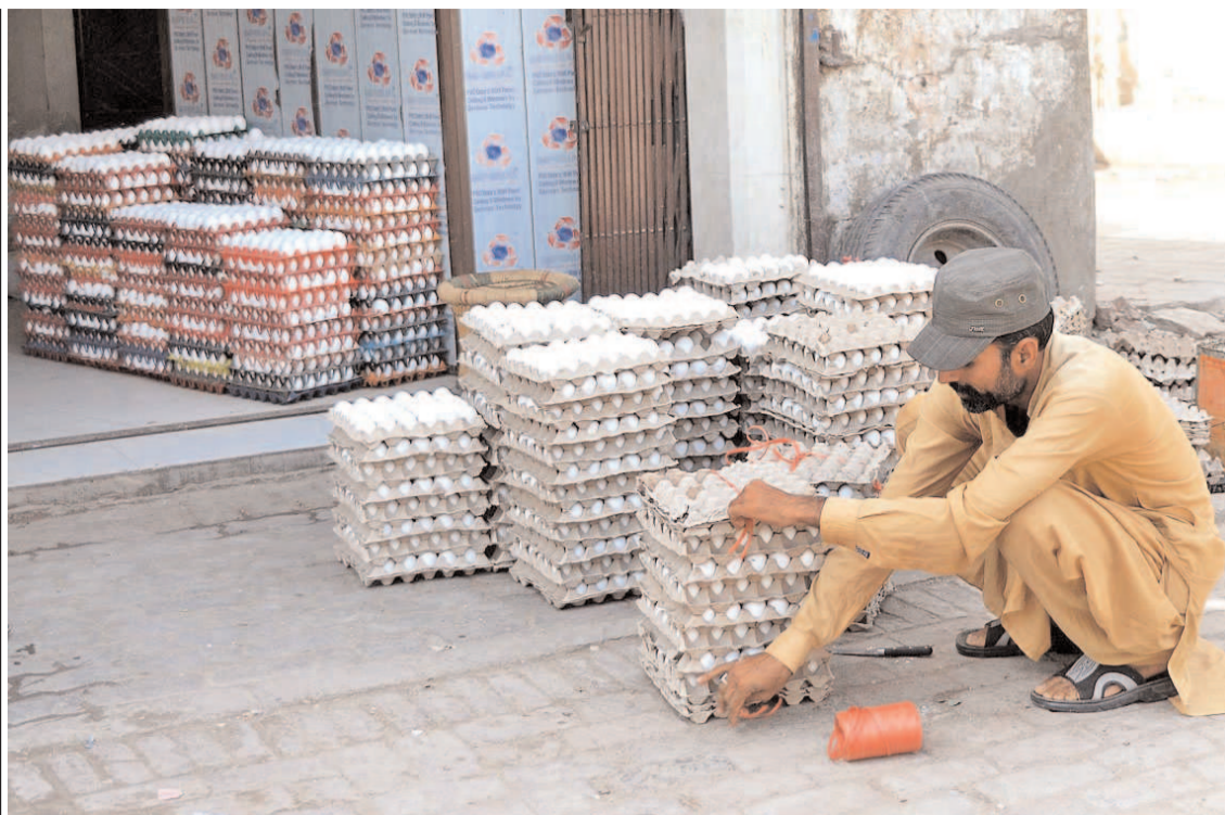
MULTAN: A shopkeeper busy in binding the crates of eggs to deliver in the market at his shop.

In one of the major interventions to restrict fraudulently transferred funds from leaving the banking system, SBP has directed banks offering branchless banking wallets to restrict cash-out, mobile top-up and other online purchases from incoming fund transfers for two (2) hours. A new liability shift framework is also part of these instructions, where banks are required to compensate the customers due to delay on their part in taking timely remedial and control measures such as delay in blocking digital channels, delay in raising dispute requests, etc.