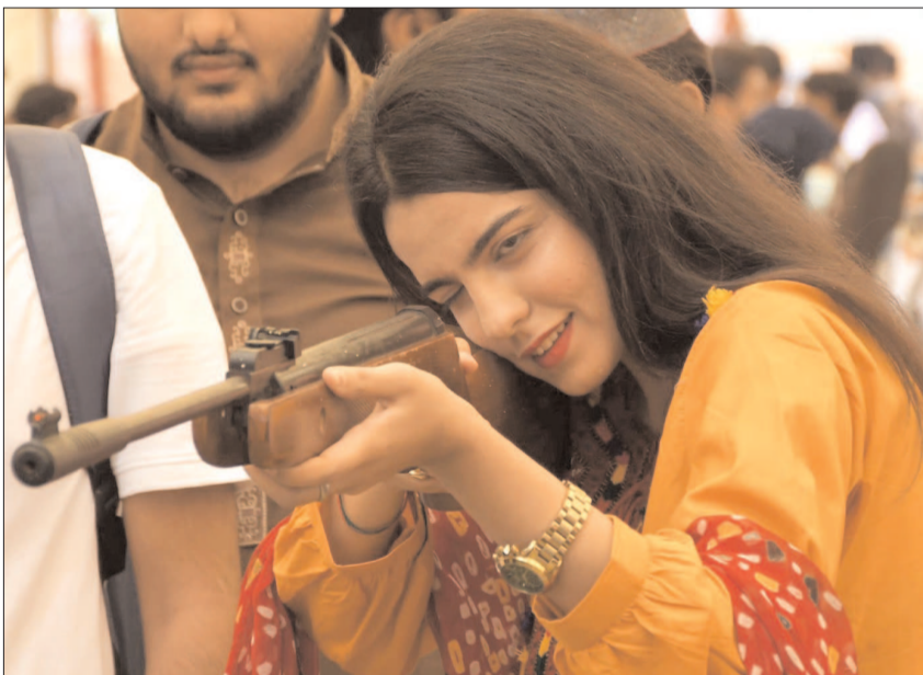
JAMSHORO: A student targeting balloon from his gun during Rang-e-Saqafat event.