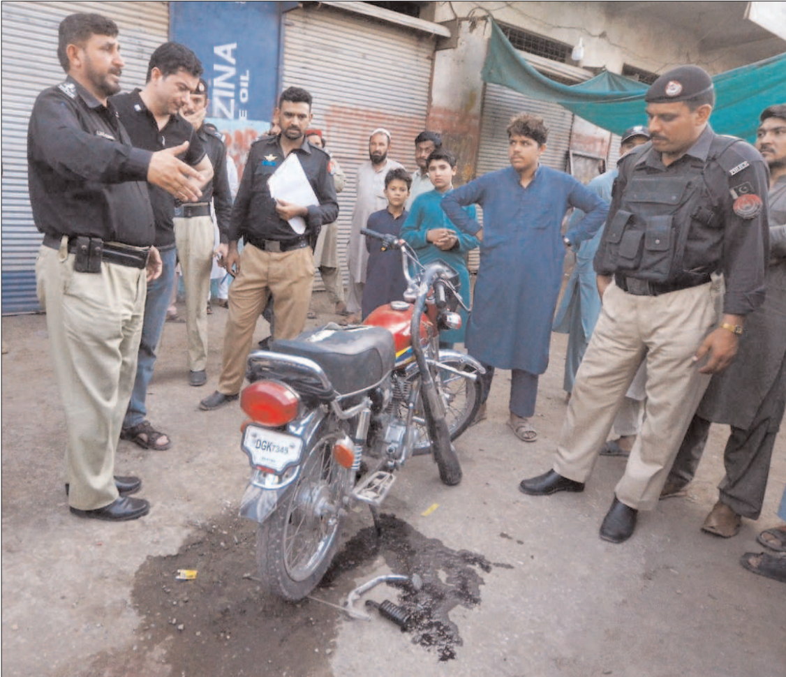
PESHAWAR: Police officials gathered around the spot of blast at Ring Road.

He said several such agreements were under discussion in various fields to enhance cooperation in the fields of television, films, cinema, literary and linguistic enterprises. These would help depict our rich culture and traditions in their true light and further strengthen the ties of friendship and solidarity between our two nations, he remarked.