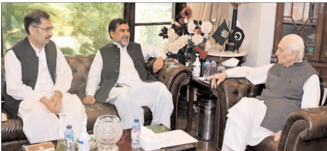
PESHAWAR: KP Caretaker Chief Minister Muhammad Azam Khan talking to high ups of SNGPL and PESCO.