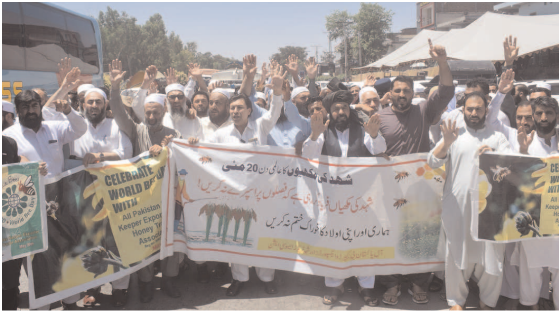
PESHAWAR: Members of Local Honey Beekeepers and Honey Traders Association hold placards during a walk at Tarnab Honey Market to mark World Bee Day.