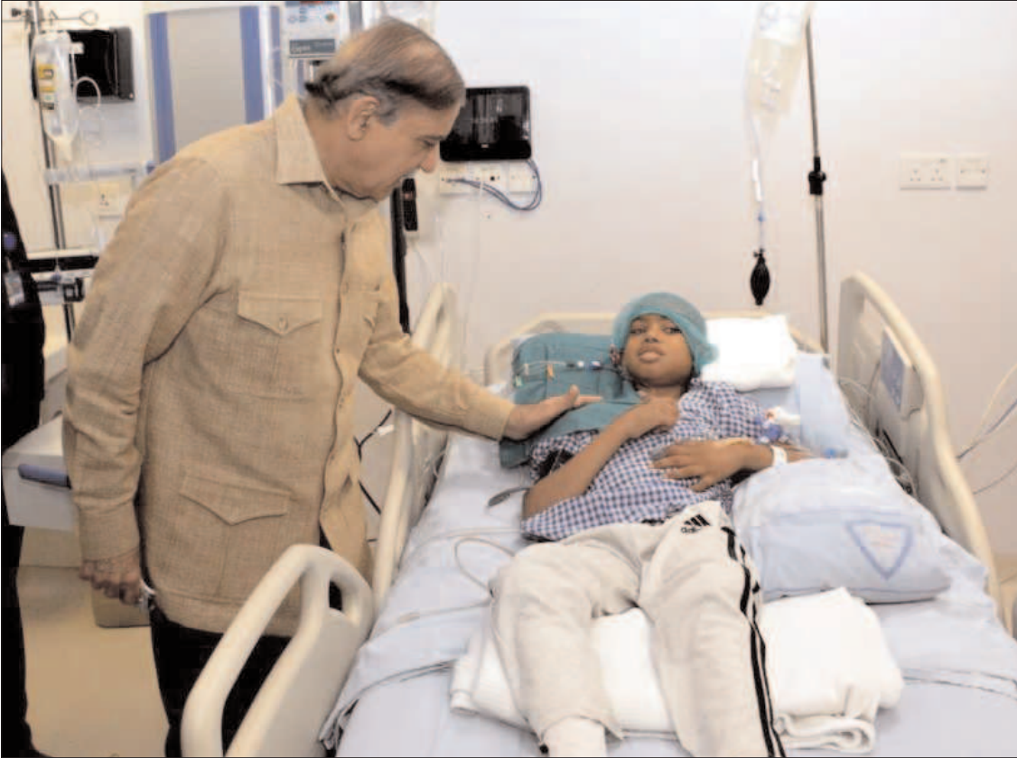
LAHORE: Prime Minister Shehbaz Sharif meeting a patient during his visit to Pakistan Kidney and Liver Institute.