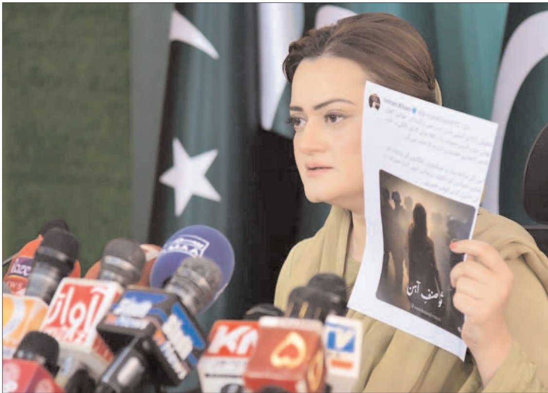
ISLAMABAD: Federal Minister for Information and Broadcasting, Marriyum Aurangzeb addressing a press conference.

It is pertinent to mention that violent clashes broke out across Pakistan after the former prime minister and PTI chairman Imran Khan was arrested from the premises of the Islamabad High Court (IHC) on May 9. The protests were held in remote and major cities as the party workers agitated due to their chairman's arrest, with Balochistan, Punjab, Khyber Pakhtunkhwa, and Islamabad summoning the armed forces to ensure law and order.