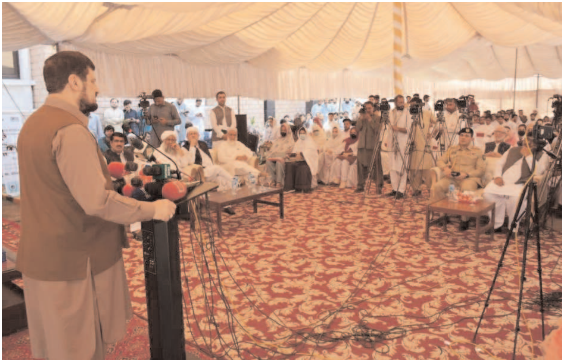
PESHAWAR: Governor Khyber Pakhtunkhwa Haji Ghulam Ali addressing during scholarship distribution ceremony at Khyber Medical University.

Different Abilities children and waive fees. Persons with Different Abilities with parents consider me as their guardian, do not leave them alone, Haji Ghulam Ali said. “Persons with Different Abilities are being provided full opportunities to come forward in other educational fields including medical,” said Haji Ghulam Ali. Haji Ghulam Ali said that he held two-day meetings of 7 hours each with the Vice-Chancellors and provided them with guidelines for the improvement of the Universities.