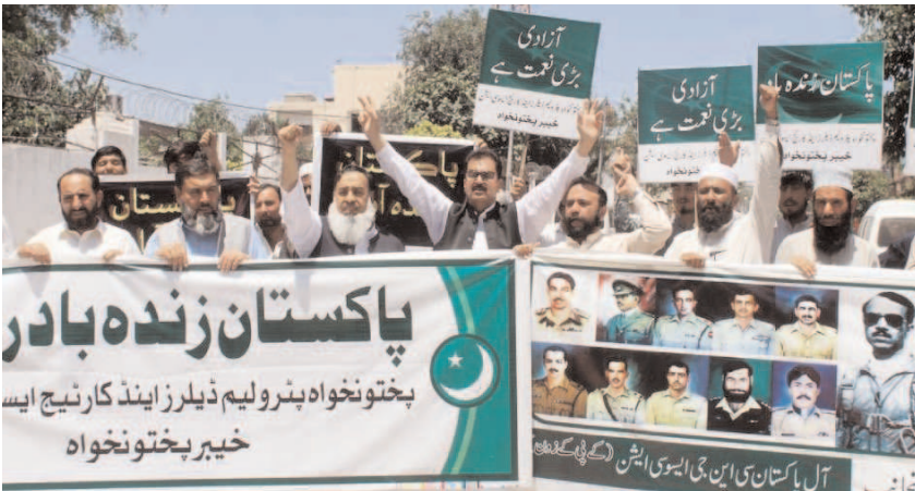
PESHAWAR: Members of All Pakistan CNG Association chanting slogans in favour of Pak Armed Forces.

tance of the Excise Department in terms of vehicles registration, properties taxation and anti-narcotics is above board both at the provincial and the national levels and if the authorities ensure the achievement of their goals, then only this department will be sufficient to contribute to the revenue and economic stability of the province. The Secretary Excise, Taxation and Narcotics Control assured that the instructions of the minister in-charge would be properly implemented and 100 percent targets would be achieved accordingly.