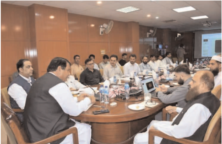
PESHAWAR: Adviser to Prime Minister Engineer Amir Muqam meeting with Pesco officials at Wapda's House.