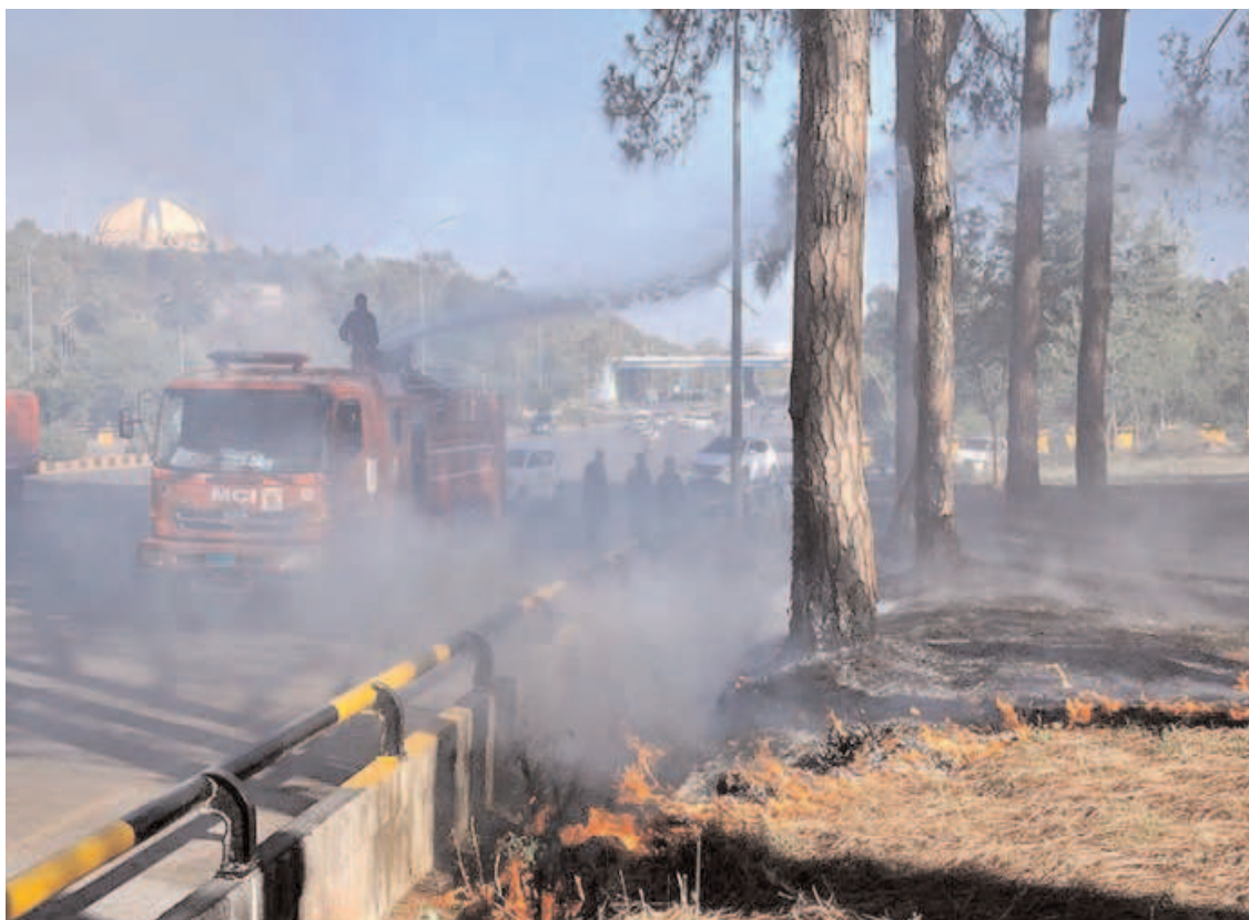
ISLAMABAD: CDA Fire fighters estinguishing fire erupted at the greenbelt area near Zeropoint due to sizzling weather in the city.

ISLAMABAD (APP): The Indus River System Authority (IRSA) on Saturday released 159,300 cusecs of water from various rim stations with an inflow of 150,800 cusecs. According to the data released by IRSA, the water level in River Indus at Tarbela Dam was 1426.04 feet and was 28.04 feet higher than its dead level of 1,398 feet. Water inflow and outflow in the dam were recorded as 44,900 cusecs and 50,000 cusecs respectively. The water level in River Jhelum at Mangla Dam was 1115.70 feet, 65.70 feet higher than its dead level of 1,050 feet. The inflow and outflow of water were recorded as 44,600 cusecs and 48,000 cusecs respectively. The release of water at Kalabagh, Taunsa, Guddu and Sukkur was recorded as 69,200, 59,700, 41,900 and 13,400 cusecs respectively. Similarly, from River Kabul, a total of 36,200 cusecs of water was released at Nowshera and 15,900 cusecs were released from River Chenab at Marala.