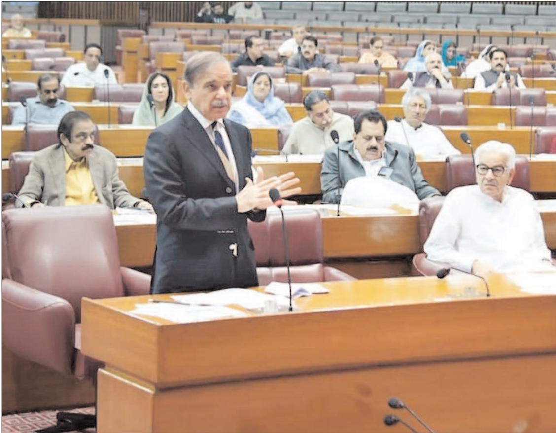
QUETTA: Prime Minister Shehbaz Sharif addressing during National Assembly session.