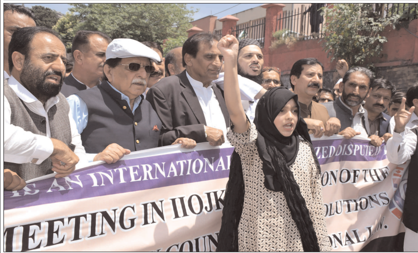
MUZAFFARABAD: A girl along with others participating in a rally to protest against G20 meeting hosted by Indian government in Srinagar.

Amir Dogar said that arrests can't weaken their determination for a national cause and Imran Khan was their 'Redline'. He said that we strongly condemned the May 09, vandalism but it all occurred in reaction of arrest of chairman PTI. Dogar claimed that the future belongs to Imran Khan and he will surely take the slot of prime minister again.