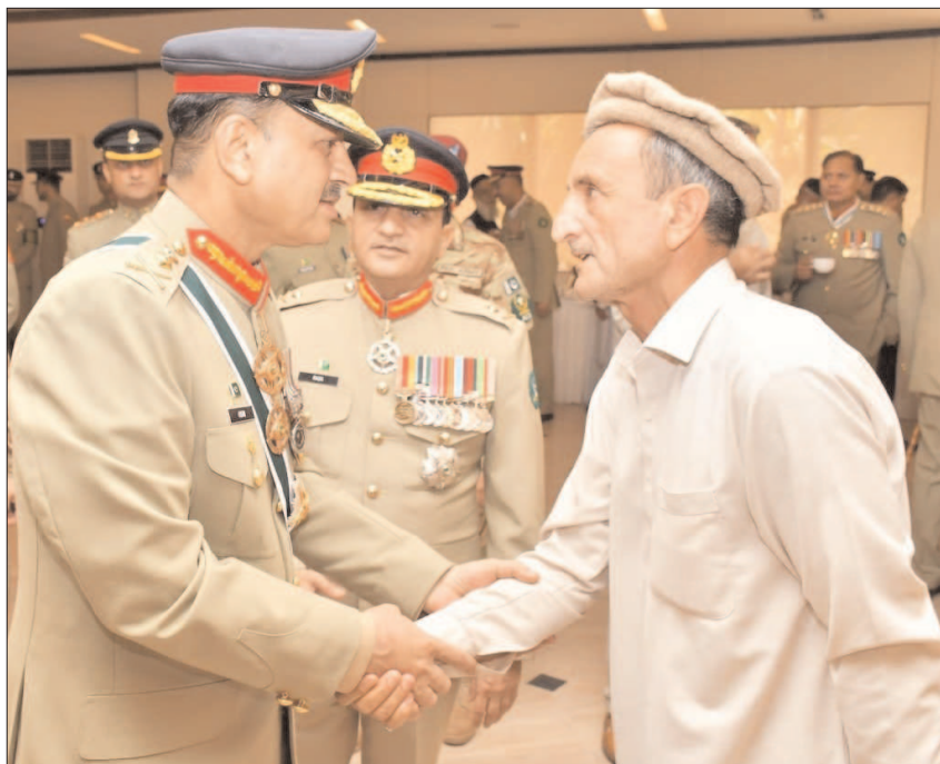
RAWALPINDI: Chief of Army Staff, General Asim Munir interacting with army official during a ceremony.

During a meeting held at the Governor House, the governor lauded the prime minister for taking keen interest in the development and progress of the province, PM Office Media Wing said in a press release. Earlier, the prime minister arrived here on a day-long visit. Upon arrival, the prime minister was warmly received by Governor Balochistan and Chief Minister Abdul Qaddus Bizenjo.