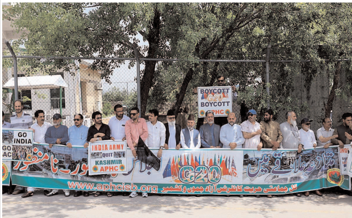
ISLAMABAD: Kashmiris belonging to APHC holds an Anti-India protest outside the office of the United Nations Military Observers Group in India and Pakistan (UNMOGIP) for hosting G20 tourism meeting in the disputed Himalyan Kashmir.

Traffic signals should not be violated as such violation with negligent driving might lead to fatal accidents, he said and informed that the traffic police were also disseminating information on various roads and traffic signals in all tehils of the district to educate citizens about traffic rules, signals and the damages caused by traffic violations.