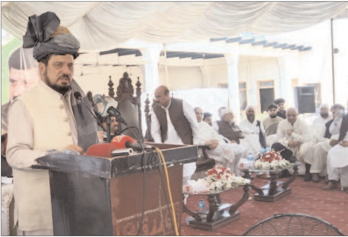
BARA: KP Governor Haji Ghulam Ali addressing public gathering during his visit to Khyber.

CHITRAL: Like other parts of the country, a peace rally was held in Chitral showing solidarity with the Pakistan Army on Monday. The rally started from Ataliq Bazar and reached Cantonment Bridge near Chitral Scouts headquarters on Bypass Road from where it marched towards Chitral Bazar. Representatives of different political parties, traders, social workers, representatives of civil society and shopkeepers participated in the rally that was led by Farmanullah. On this occasion, the social workers of the area were holding banners on which various slogans were written to convey a message regarding solidarity with Pak Army. The rally participants were also carrying banners and placards and chanted slogans in favor of the Pakistan Army. Some of the participants were also waving the national flag on their motorcycles. Later, the rally was also joined by car riders. Talking to the media on this occasion, some participants said they participated in this rally to express solidarity with the Pakistan Army. They said due to our army we sleep peacefully in our houses adding the situation of Syria, Iraq, Afghanistan, Palestine was in front of everyone.