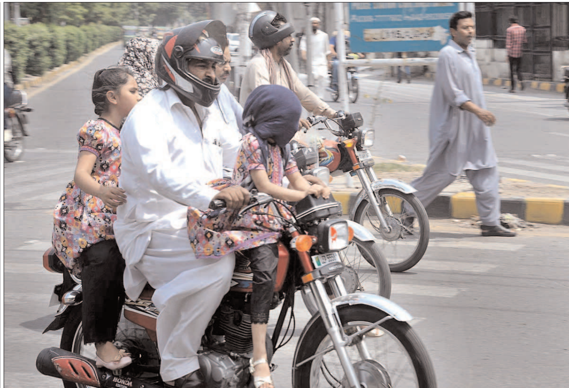
LAHORE: A child on a motorcycle covered herself with a handkerchief to avoid the heat and the strong sun.

OFFICE OF THE ADDITIONAL DISTRICT & SESSIONS JUDGE-IV KOHAT Phone No. 0922-9260041