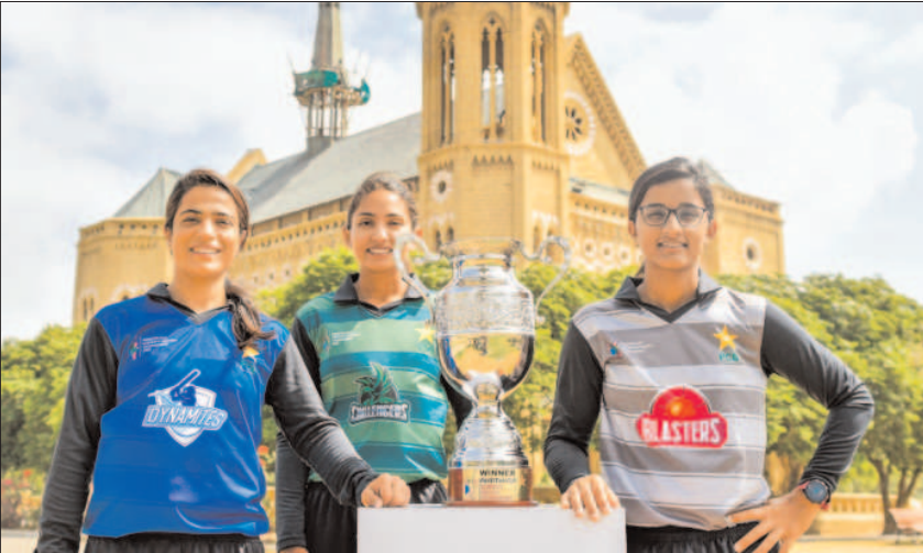
The three captains unveil trophy for the one-day phase of Pakistan Cup Women's Tournament.

Tennis Association and Member of Organizing Committee of the 34th National Games ? Tennis also attended the meeting. After explaining the rules and regulations of the Games to all the Captains and officials of the teams, a draw ceremony for the team event of men and women was held. The top four teams of the men's team Event are Pakistan WAPDA, Pakistan Army, Pakistan Air Force and Khyber Pakhtunkhwa. The top two teams of the women's team event are Pakistan WAPDA and Pakistan Army.