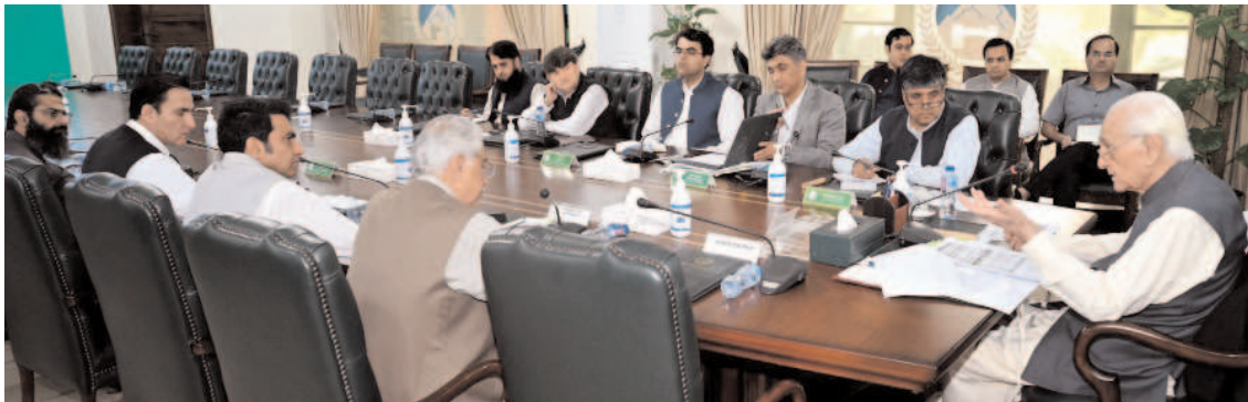
PESHAWAR: Caretaker Chief Minister Khyber Pakhtunkhwa Muhammad Azam Khan chairing a meeting regarding budget estimates 2023-24.

the governor planted a sapling on the lawn and inaugurated the newly constructed administration block of the university. Besides, the Governor was briefed about fund issues by VC Prof. Dr. Zia ul Haq on the proposed project of Stroke and Rehabilitation Center on 120 kanal area in Swat, the hospital built with the financial support of the federal government in KMU, the treatment of thalassemia disease and the public health reference laboratory. The Governor assured to solve the problems by calling a meeting of the relevant departments next week for the delivery of the funds and inclusion of these projects in the next ADP. On this occasion, in the presence of the Governor, a Memorandum of Understanding was also signed between KMU and PEDO regarding the welfare of disabled persons.