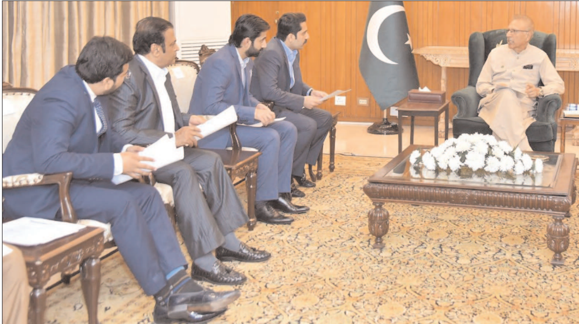
ISLAMABAD: President Dr. Arif Alvi talking to a delegation of a local electric bike manufacturing company, at Aiwan-e-Sadr.