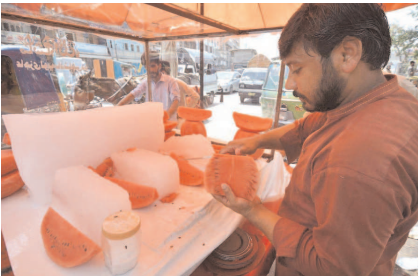
PESHAWAR: Vendor selling and displaying watermelon to attract customers at Bacha Khan Chowk.