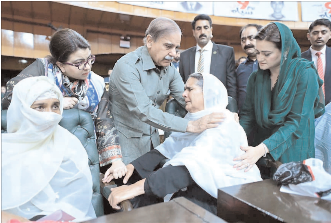
ISLAMABAD: Prime Minister Shehbaz Sharif meeting with families of Shuhada at Azmat-e-Shuhada Convention.