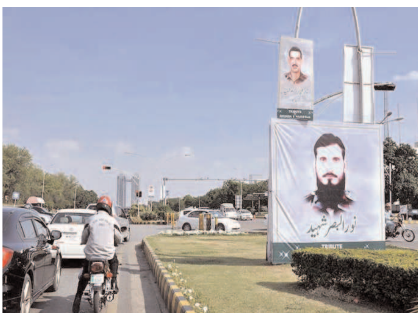
ISLAMABAD: Portraits of soldiers, martyred during fighting against terrorists, displayed on Constitution Avenue in connection with observing Takreem-e-Shohada Day across country.

They further specified the requirement to formulate and connect a team of all DM stakeholders including local/global partners working in silos, for pre-identifying risks and preparation of plans of action for foreseeable disasters. NDMA delegation is currently representing Pakistan in sessions/meetings about disaster risk management and financing, organized by global partners/stakeholders.