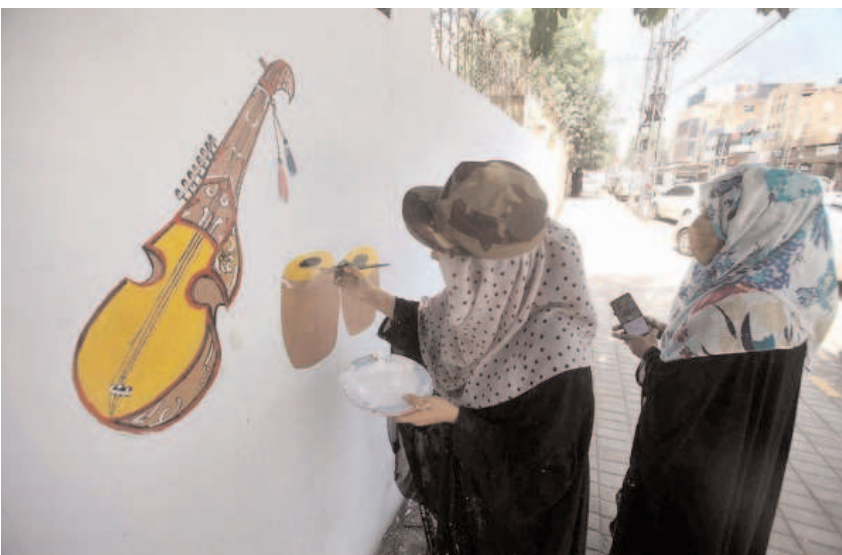
PESHAWAR: Students painting on wall of GPO during city beautification campaign organized by DC Peshawar.