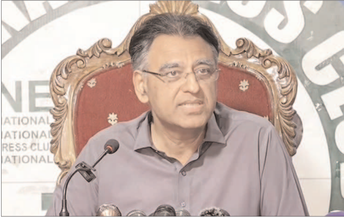
ISLAMABAD: PTI leader Asad Umar addressing a press conference.