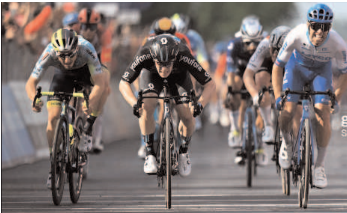
CAORLE: Alternate crop) (L-R) Niccolò Bonifazio of Italy and Team Intermarché - Circus - Wanty, Alberto Dainese of Italy and Team DSM, Michael Matthews of Australia and Team Jayco AlUla and Jonathan Milan of Italy and Team Bahrain - Victorious - Purple Points Jersey sprint at finish line during the the 106th Giro d'Italia 2023, Stage 17 a 197km stage from Pergine Valsugana to Caorle.