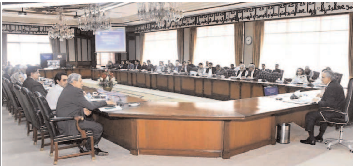
ISLAMABAD: Federal Minister for Finance and Revenue Senator Mohammad Ishaq Dar chairing meeting of Economic coordination committee of Cabinet.

"The business community of the entire Islamabad is standing with Pakistani forces, and in this regard, the Islamabad Chamber will organize a solidarity ceremony with the martyrs of armed forces and to pay tributes to their great sacrifices," he added.