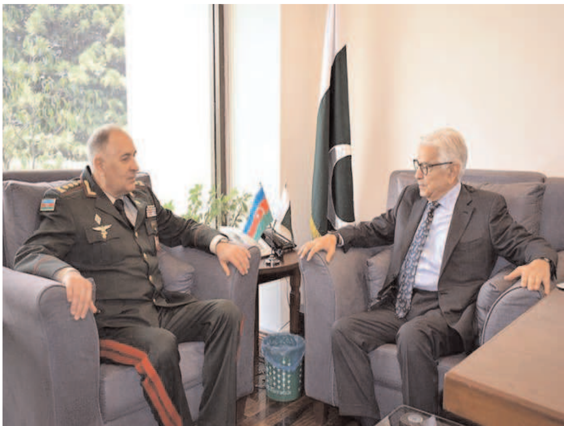
ISLAMABAD: Deputy Minister of Defence and Chief of General Staff of Azerbaijan Colonel Gerneral Karim Valiyev meeting with Minister for Defence Khawaja Muhammad Asif.

ISLAMABAD (APP): Indus River System Authority (IRSA) on Wednesday released 164,800 cusecs water from various rim stations with an inflow of 186,700 cusecs. Water level in River Indus at Tarbela Dam was 1426.87 feet and was 28.87 feet higher than its dead level of 1,398 feet. Water inflow and outflow in the dam was recorded as 64,500 cusecs and 50,000 cusecs respectively. The water level in River Jhelum at Mangla Dam was 1116.25 feet, which was 66.25 feet higher than its dead level of 1,050 feet. The inflow and outflow of water was recorded 50,400 cusecs and 43,000 cusecs respectively. The release of water at Kalabagh, Taunsa, Guddu and Sukkur was recorded as 58,500, 61,100, 42,900 and 14,200 cusecs respectively. Similarly, from River Kabul, a total of 39,000 cusecs of water released at Nowshera and 23,300 cusecs released from River Chenab at Marala.