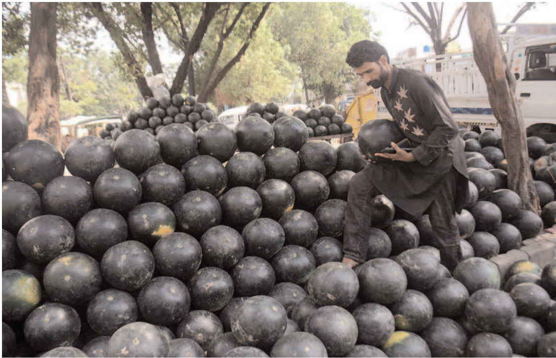
LAHORE: A vendor is displaying and selling watermelons to attract the customers at his roadside setup.

On a Year-on-Year (YoY) basis, the commodities which recorded an increase in their average prices included Cigarettes (138.50%), Tea Lipton (114.93%), Wheat Flour (110.17%), Gas Charges for Q1 (108.38%), Gents Sponge Chappal (100.33%), Bananas (99.58%), Potatoes (98.10%), Rice Basmati Broken (81.24%), Rice Irri-6/9 (79.96%), Petrol (79.85%), Diesel (78.68%), Eggs (69.55%), Pulse Moong (63.18%), Bread (63.17%) and Pulse Mash (55.93%).