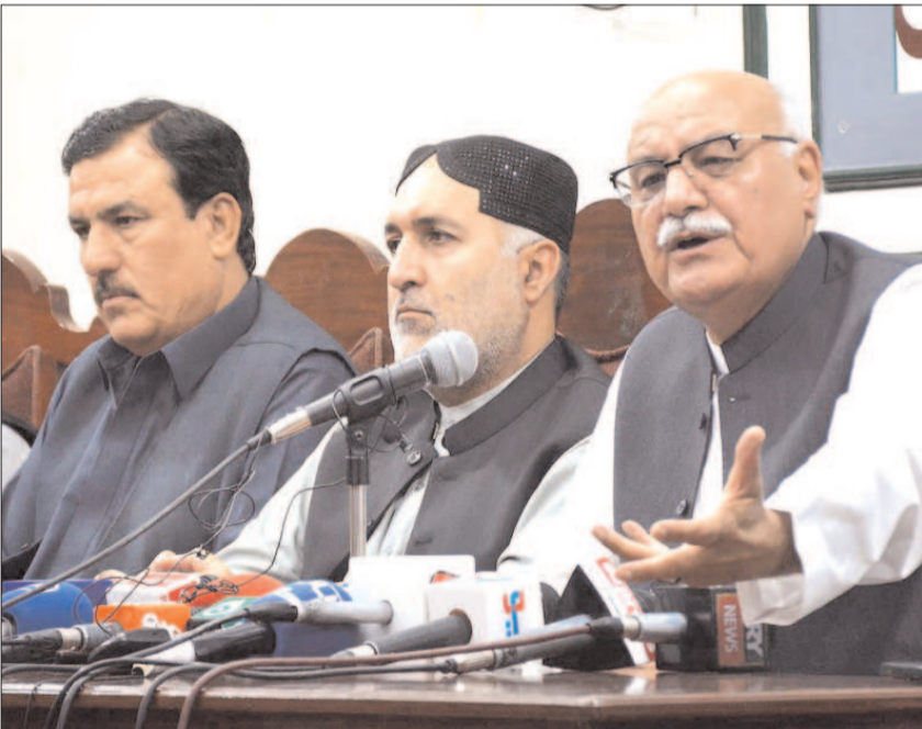
QUETTA: Secretary General of ANP Mian Iftikhar Hussain addressing a press conference.

According to official sources, special teams consisting of officers of district administration and environment department are engage in monitoring and patrolling in the district particularly alongside Motorways to overcome spread of environmental pollution.