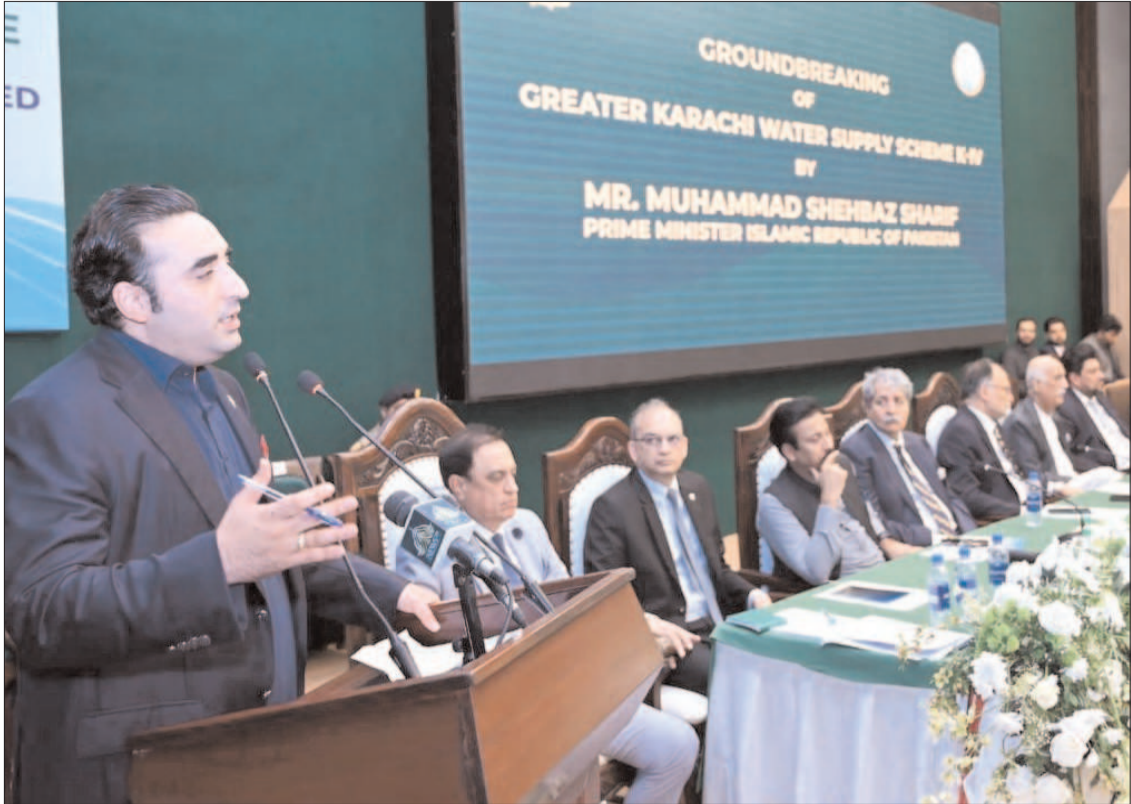
KARACHI: Foreign Minister and Chairman Pakistan People's Party Bilawal Bhutto Zardari addressing the ground breaking ceremony of Greater Karachi Bulk Water Supply Scheme (I-IV Project).