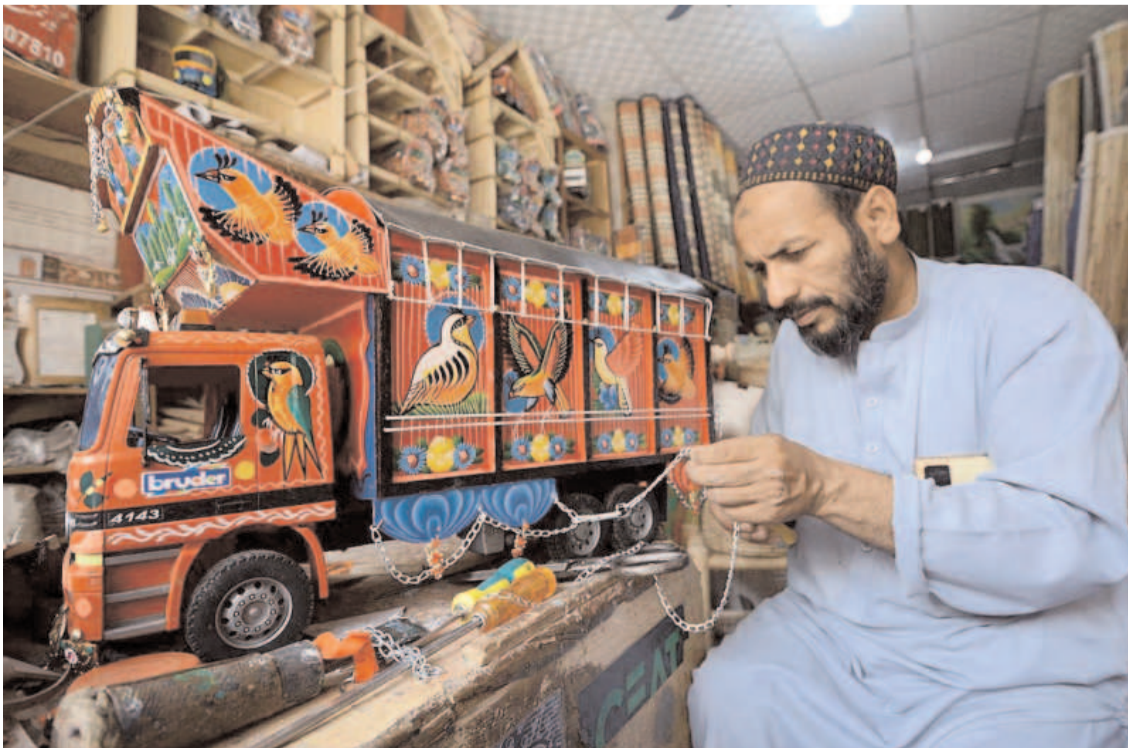
PESHAWAR: An artisan gives the final touch to a wooden made truck for decoration at his workplace.

Meanwhile, traffic has started building up in Dover as delays are expected on roads and ports over the bank holiday and school half-term break.