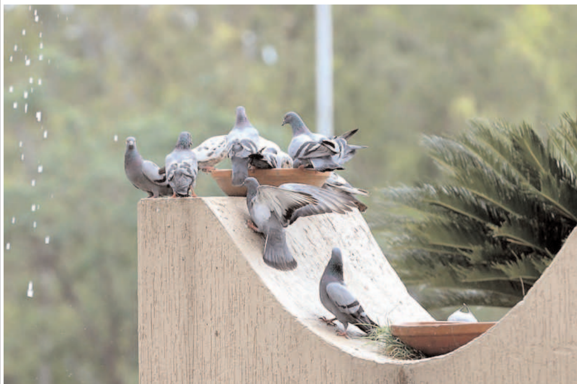
ISLAMABAD: A flock of piegon eating food at F-10.

There is also a dire need to control unbridled population growth, enhance productivity and raise awareness on the prudent use of commodities avoiding wastage in daily life, especially during wedding ceremonies. A comprehensive strategy for price controlling, the exploitative role of middlemen and hoarding of commodities for illegal profit gains must also be in place besides charity initiatives to reach out to hunger-stricken rural and urban poor.