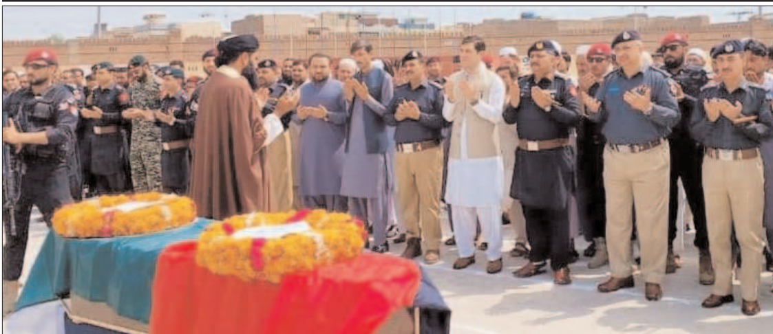
JAMRUD: Officials pray for the departed souls of martyred cops after funeral prayer in Levies Centre Shahkas.

The virus is genetically similar to the virus found in the Nangarhar province of Afghanistan. It is to be noted here that poliovirus was found in an environmental sample taken from the same location last month.