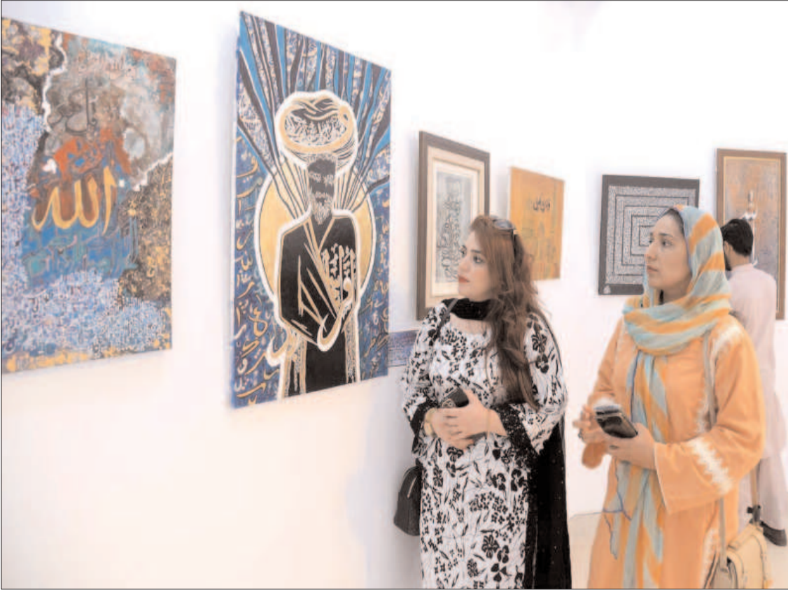
LAHORE: Visitors watching artworks during painting exhibition on Sufism in Al Hamar Hall.