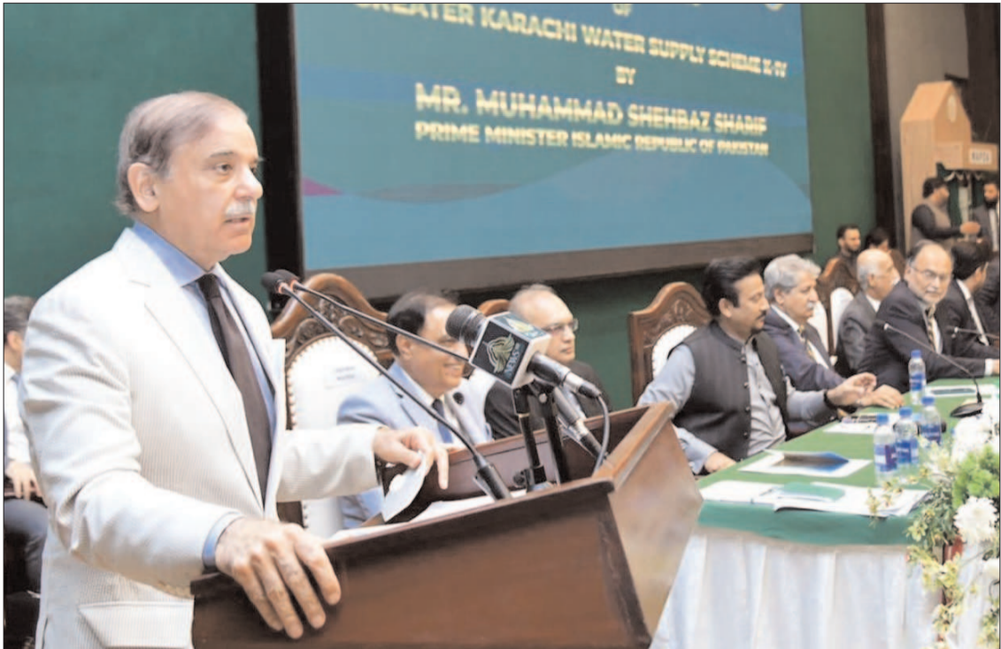
KARACHI: Prime Minister Shehbaz Sharif addressing the ground breaking ceremony of Greater Karachi Bulk Water Supply Scheme (I-IV Project).

Vol. XXXIX No. 129 Regd. No. 241 ZIQA'AD 06 1444 -- SATURDAY, MAY 27 2023 PESHAWAR EDITION 12 PAGES PRICE. 30