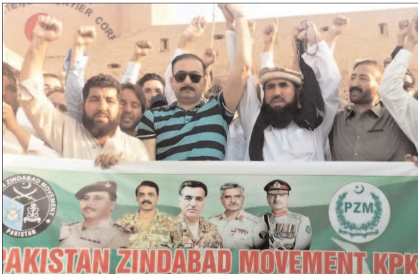
PESHAWAR: Activists of Pakistan Zindabad Movement KP holding a rally in favour of Pakistan Army.

In the first phase, the filing of red zone entrances and important buildings will be completed, Police officials said. After completion of Peshawar profiling, the final security draft will be sent to the Central Police Office, Police Officials said. The Special Security Unit will have modern equipment and will be connected to the operation room, officials said.