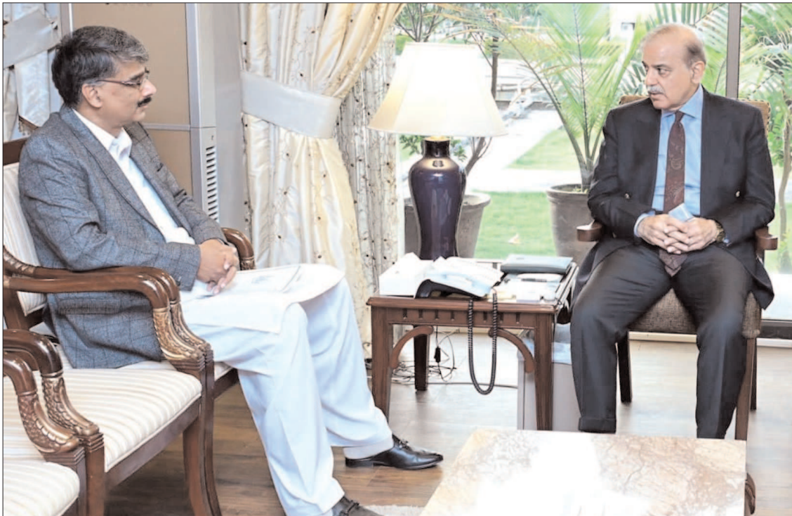
ISLAMABAD: Prime Minister of Azad Jammu and Kashmir, Anwar-ul-Haq called on Prime Minister Shehbaz Sharif.

Vol. XXXIX No. 105 Regd. No. 241 SHAWWAL 12 1444 -- WEDNESDAY, MAY 03 2023 PESHAWAR EDITION 12 PAGES Price. 20