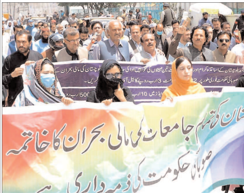
QUETTA: Activists of Joint Action Committee hold protest in favor of their demands.

He directed that concrete measure should be taken to check the cleanliness of food items in the markets, check the prices and prevent artificial inflation, and organize operations to eliminate illegal encroachments.