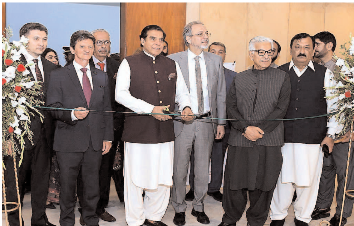
ISLAMABAD: Speaker National Assembly Raja Perviz Ashraf inaugurating the opening ceremony of the photo exhibition on Islamic Architectural Heritage of Hungary at Parliament House.

The laureate's portrait will then be added to the collection. Public can submit nominations for the award through www.heroines.pk.