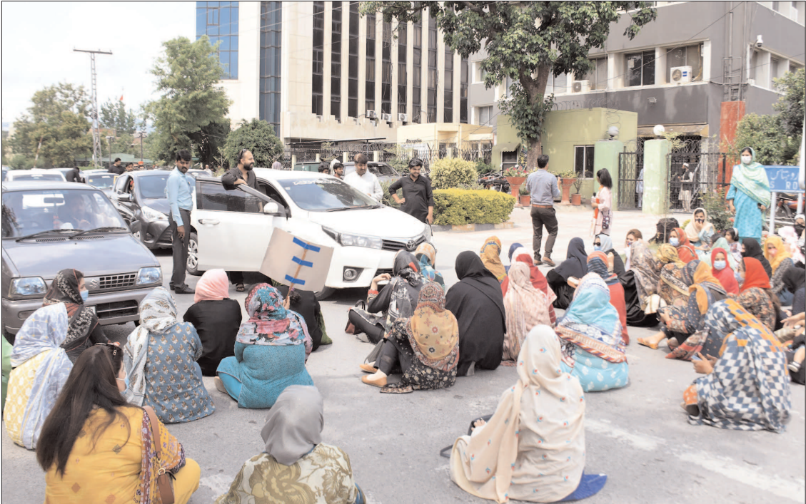
ISLAMABAD: Contract base female teachers blocked the road outside Federal Directorate of Education, during a protest for release of their salaries.