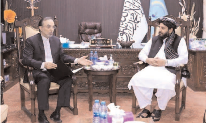
said that the AFDA is ready to provide investment opportunities for international companies in healthy products and drug, according to the statement.