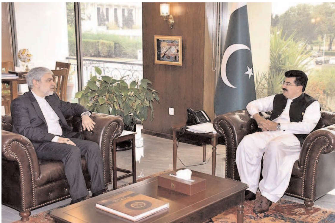
ISLAMABAD: Chairman Senate, Muhammad Sadiq Sanjrani exchanging views with Ambassador of the Islamic Republic of Iran Mr. Seyed Mohammad Ali Hosseini at Parliament House.

ISLAMABAD (APP): Allama Iqbal Open University (AIOU) has set May 4, (Thursday) as the last day of its 2nd phase admissions of post-graduate programs for the semester spring 2023. According to AIOU, the Programs offered in this phase include Associate degree (BA, B.Com), Associate degree in (Education, Human Resource Management and, Islamic Banking and Marketing), B.Ed (1.5 Years, 2.5 Years and 4 Years), BS (ODL programs), BBA and Postgraduate Diploma programs. Admission forms and prospectuses for these programs are available on the university's website (www.aiou.edu.pk). The students have been instructed to apply online and submit fee by the evening of May 4 to avoid the late fee charges. (Continuing students) have been allowed to enroll till May 11 without late fee charges.