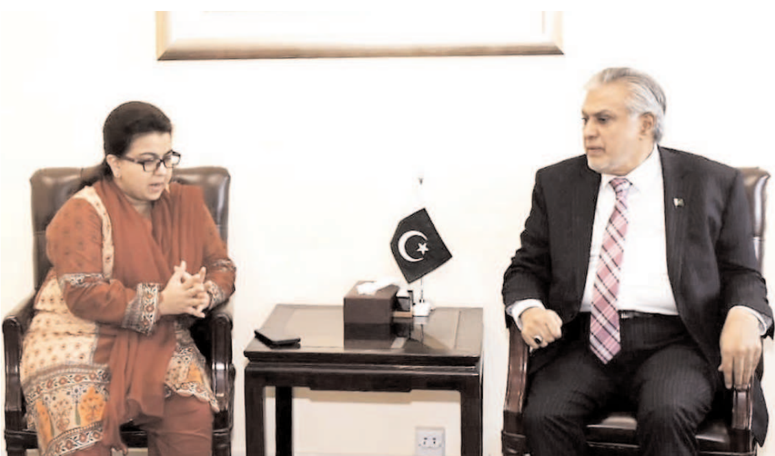
ISLAMABAD: SAPM on Youth Affairs Shaza Fatima meeting with Finance Minister Senator Mohammad Ishaq Dar at Fiance Division.

Rs1,89,472 per 10 grams in the local markets. Rates of 10 grams of gold of 22 karats have also increased and traded at Rs1,73,683 per 10 grams on Tuesday. Gold prices remained unchanged on Tuesday's international market and traded at US$1,990 per ounce on the second day of the week. The rate of 24 karats fine silver also increased by Rs130 per tola to Rs2,730 per tola while the price of 24 karats silver of 10 grams increased by Rs111.45 to Rs2,340.53 per 10 grams.