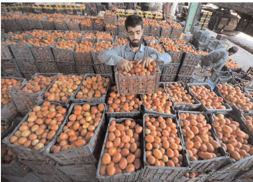
PESHAWAR: Labour busy in packing tomatoes at vegetable market.