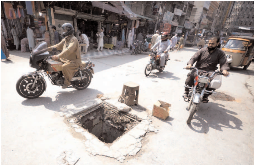
PESHAWAR: A view of open main hole in middle of road near Qasim Ali Khan Mosque which can cause any major accident.