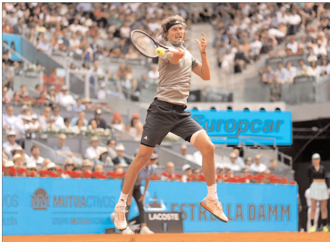
MADRID: Alexander Zverev of Germany plays a forehand against Carlos Alcaraz of Spain the Fourth Round match on Day Nine of the Mutua Madrid Open.