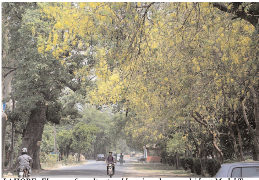
LAHORE: Flowers of amaltas tree blooming along roadside at Model Town.