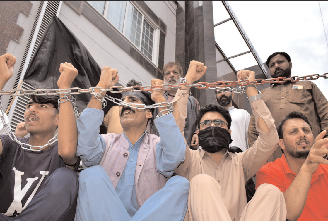
MUZAFERABAD: Protestors cuffed their hands and chanting slogans during a protest at Azadi Chowk against the alleged punishment of life imprisonment to Hurriyat Leader Yasin Malik by India.

These government scheme pilgrims had arrived in Madinah through three flights on May 21. This year, a total of 179,200 Pakistani pilgrims are expected to perform Hajj. Out of this number, approximately 81,230 pilgrims will be partaking in Hajj under the government scheme, while the remaining individuals will be facilitated by private tour operators, as per the authorities’ arrangements. The last flight carrying Pakistani pilgrims is scheduled to depart for Saudi Arabia on June 21, according to the Pakistani Ministry of Religious Affairs.