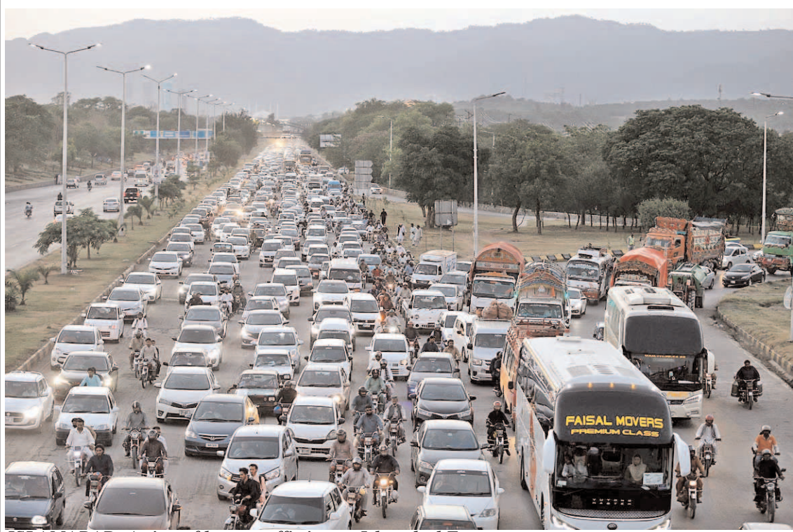
ISLAMABAD: A view of heavy traffic jam at Islamabad Expressway.

resident of Khyber. In third operation in Islamabad, E-11/2 area, 60 intoxicated tablets were recovered from the possession of an accused resident of Islamabad. In an operation at Lahore International Airport Cargo, 184 grams heroin was recovered from a parcel booked for Australia.