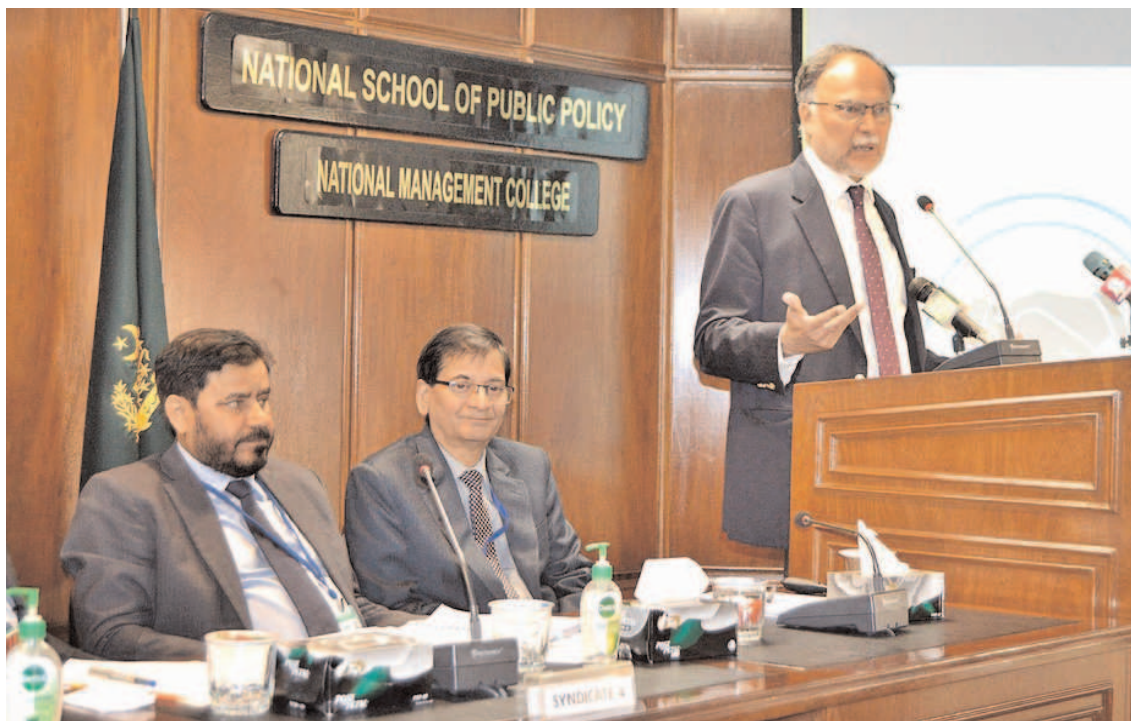
LAHORE: Federal Minister for Planning Prof. Ahsan Iqbal addressing participants of National School of Public Policy.