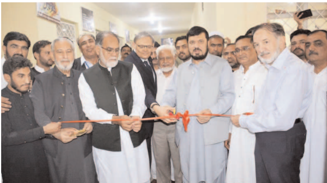
PESHAWAR: Khyber Pakhtunkhwa Governor Haji Ghulam Ali cutting a ribbon to inaugurate mobile screening project of Khyber Eye Foundation in Shaheed Ahmad Elahi school Gulbahar.

The civil society claimed unemployment has already distributed law and order situation in Peshawar because dacoities are reporting in brought daylight in the provincial metropolis of Khyber Pakhtunkhwa.