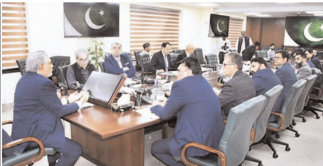
ISLAMABAD: Federal Minister for Finance and Revenue Senator Mohammad Ishaq Dar addressing a delegation of Association of Builders and Developers of Pakistan during a meeting on budget proposals.

He envisioned that Pakistan’s Islamic Capital market to be a fair, modern, efficient and globally competitive market, responsive to the needs of its stakeholders, and based on sound regulatory principles, which should provide the impetus for sustainable economic growth.