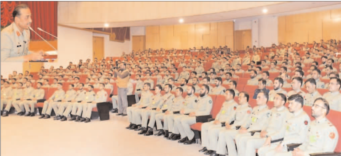
RAWALPINDI: Chief of Army Staff, General, Syed Asim Munir, addressing officers during his visit to Quetta Garrison.

It is pertinent to mention that the Islamabad police had registered a case against Pakistan Tehreek-e-Insaf (PTI) chairman Imran Khan and other party leaders for attacking, vandalising, and damaging the judicial complex during the former premier's appearance. According to the FIR, the leaders of a "political party" were leading the mob, adding that they provoked the people, which led to vandalism.