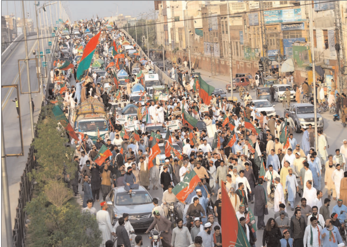
PESHAWAR: PTI workers holding a rally at Pir Zakuri Bridge, Ring Road to express solidarity with the supremacy of the Constitution and Chief Justice.