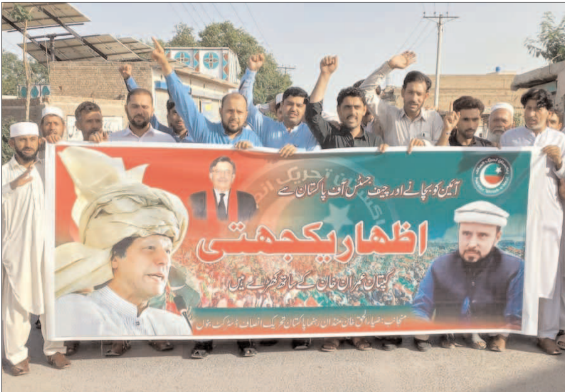
BANNU: Activists of PTI holding a banner during a rally to show solidarity with party chief Imran Khan.