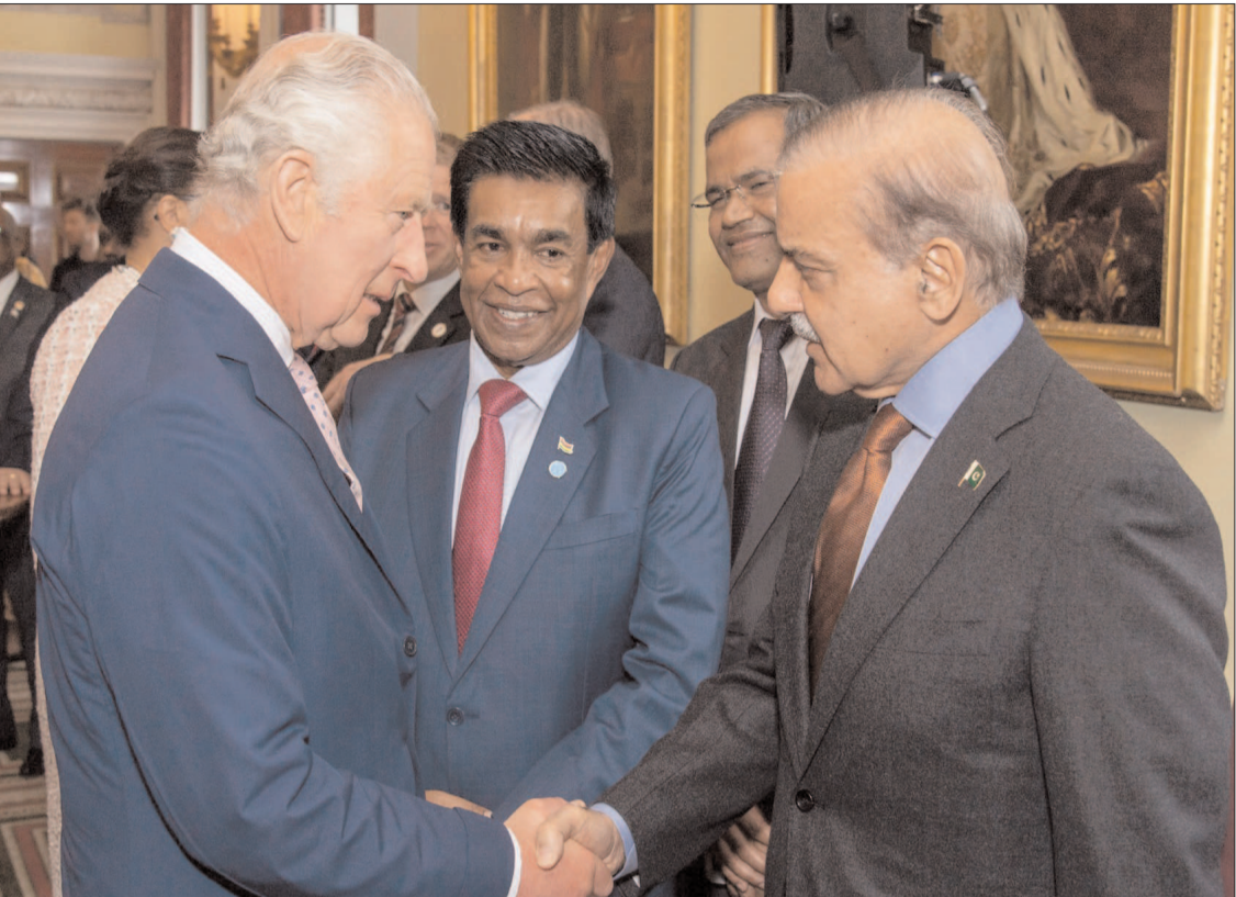
LONDON: Prime Minister Shehbaz Sharif met King Charles III on the sidelines of a meeting of leaders of Commonwealth countries.