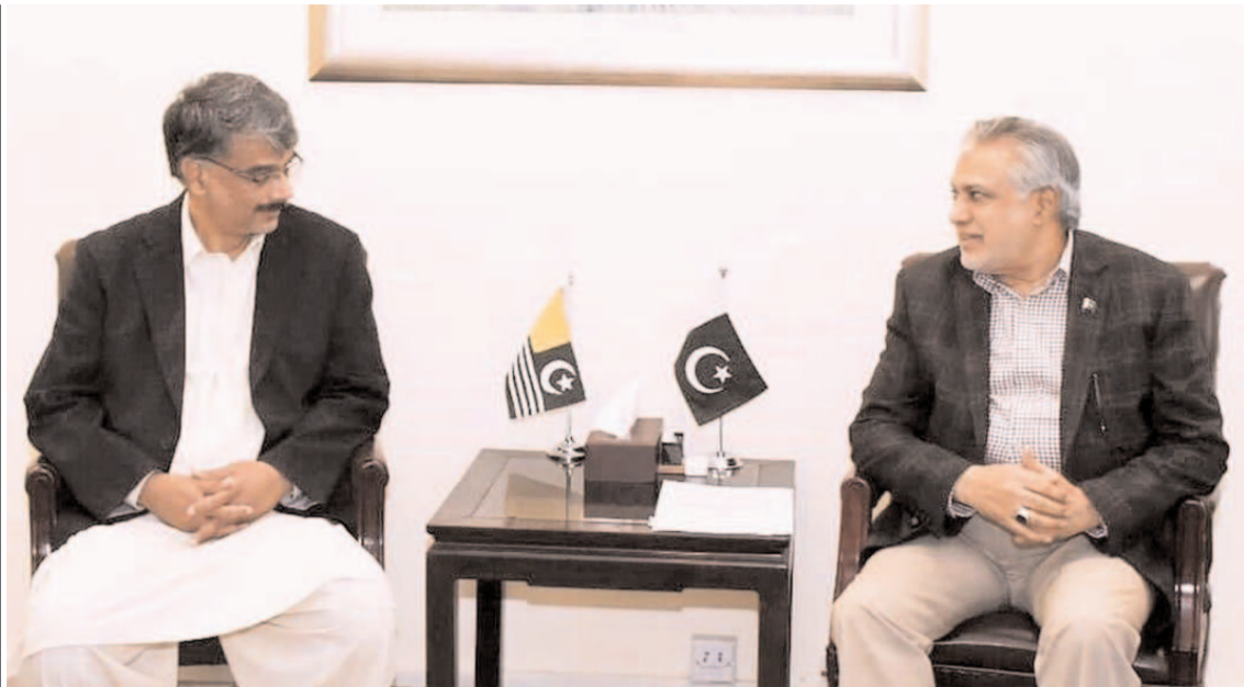
ISLAMABAD: Prime Minister Azad Jammu and Kashmir Chaudhry Anwar Ul Haq meeting with Federal Minister for Finance and Revenue Senator Mohammad Ishaq Dar at Finance Division.

time, “Hopefully we will increase our sales with the whole world.” Launched in 1957 and held twice yearly, Canton Fair is considered a major gauge of China’s foreign trade. This year’s fair resumed all on-site activities in Guangzhou, after being held largely online since 2020 due to COVID-19 prevention measures. The on-site activities of the 133rd Canton Fair occupied an area of 1.5 million square meters, with 35,000 companies participating offline and foot traffic exceeding 2.9 million people. All figures set new records. During the offline exhibitions, export deals worth a total of $21.69 billion were signed, which was better than expected, according to fair spokesperson Xu Bing. The event attracted overseas buyers from more than 220 countries and regions either online or offline. Nearly 130,000 buyers attended the offline exhibitions, with approximately half coming from countries along the Belt and Road.