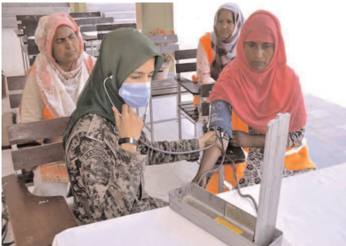
ISLAMABAD: Establishment of Free Medical Camp by 21 Wing Panjnad Rangers to provide the facility of free medical checkup minor treatments and free medicines to the needy and poor people at Noor Pur Shah Girls High School Bari Imam.

ISLAMABAD (APP): National Assembly Speaker, Raja Pervaz Ashraf extended his heartfelt congratulations to the national cricket team on their recent victory against New Zealand in the one-day series and attaining the number one spot in the International Cricket Council's (ICC) ranking. In a message on Saturday, Raja Pervaz Ashraf applauded the entire management and all the players, including chairman Najam Sethi, for their efforts in bringing glory to the country. He praised the team's dedication and hard work, which resulted in their outstanding achievement of becoming the world's best cricket team. The Speaker also lauded captain Babar Azam for scoring the fastest 5,000 runs in one day cricket and urged other players to follow in his footsteps. He emphasized that the Pakistani youth possess immense talents and have proven their abilities in every field. In conclusion, Raja Pervaz Ashraf congratulated the Pakistan cricket team on their success and expressed his belief that they would continue to make the country proud with their outstanding performances.