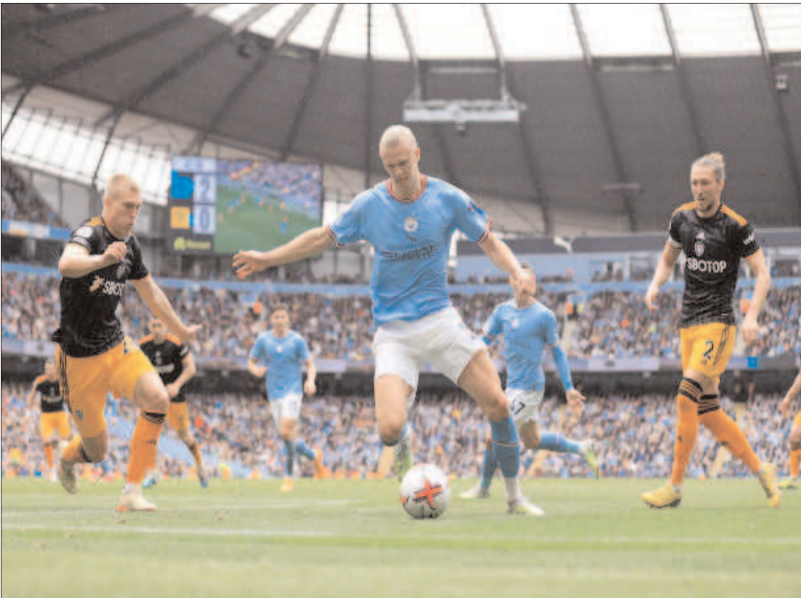
MANCHESTER: Erling Haaland of Manchester City battles with Rasmus Kristensen of Leeds United (L) during the Premier League match between Manchester City and Leeds United at Etihad Stadium.

started 1 for 9 from the field but made 11 of his final 22. "It's frustrating not making shots, because that's what I'm paid to do," Durant said. "But there also comes a time when you've just got to figure it out and push through it." Denver's Nikola Jokic — who finished second in the MVP voting on Tuesday to Philadelphia's Joel Embiid — finished with 30 points, 17 assists and 17 rebounds. Jamal Murray led the Nuggets with 32 points, while Michael Porter Jr. added 21 points and 12 rebounds. Murray said he was disappointed he didn't contribute more down the stretch. "I had some great looks at the end of the game and that would have kept us right there," Murray said. "I feel like they pulled away because of that. I have to be more locked in, more relaxed down the stretch." Denver coach Michael Malone said his team played well at times, but that the defense against Booker was "unacceptable." Booker repeatedly got near the rim for short jumpers or layups, which contributed to the 20 of 25 shooting night.