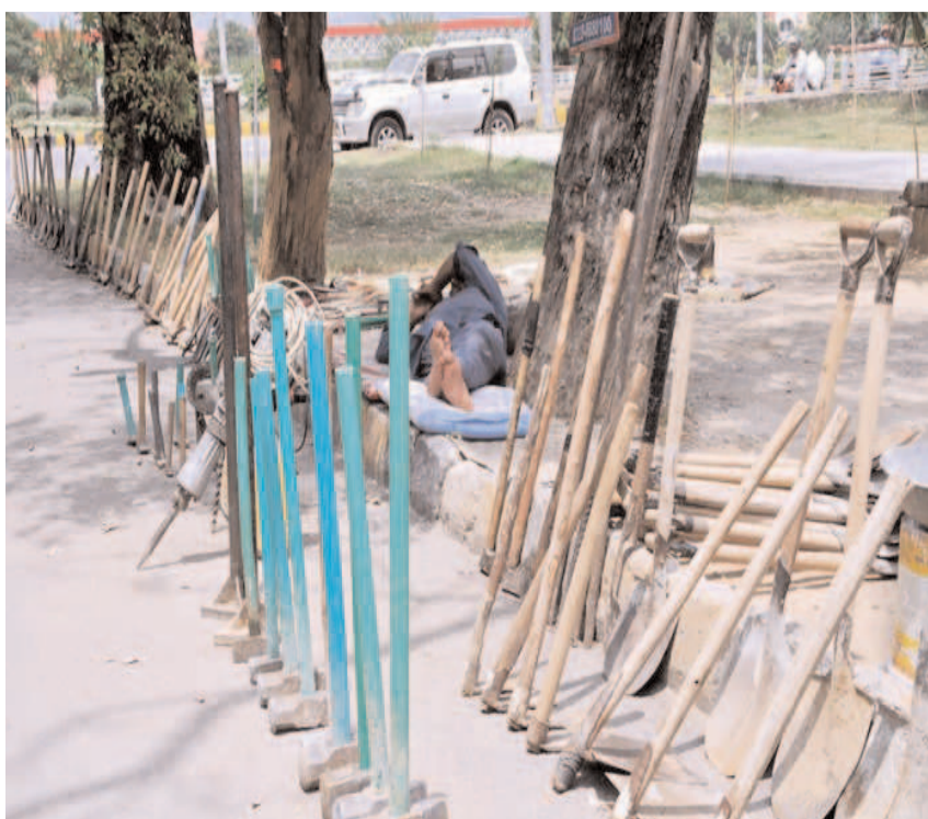
ISLAMABAD: Daily wage labourer taking nap while waiting for customers at Peshawar mor.

He directed that if they were not participating in the training session without any logical reasons, their nominations must be cancelled and others should be given a chance to serve the 'Guests of Allah'.