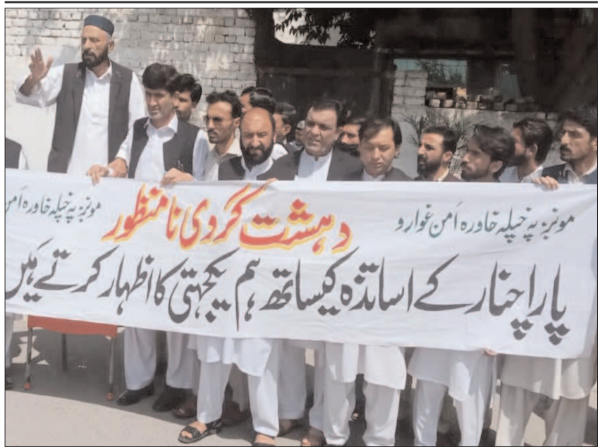
HANGU: Residents holding a rally to condemn the Kurram incident.

The family members of the victim transferred her to Chandka Hospital in a critical condition. According to rescue sources, the affected girl has gone through a surgery and been shifted to the ICU. Upon receiving the information of the incident, the Sindh police have ordered an investigation into the matter.