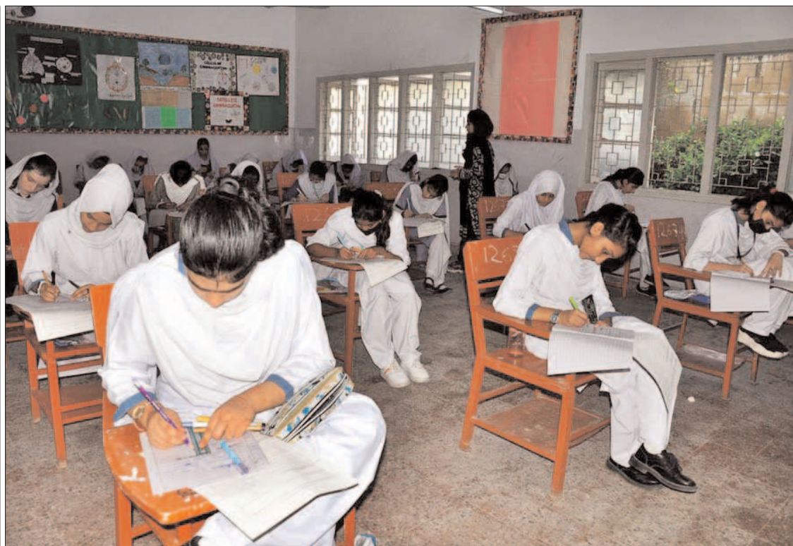
KARACHI: Students solving papers during the ninth class exams.

PCATP firmly reserves the right to take disciplinary and legal action against any members found to be disseminating or promoting malicious content related to this sub-judice case, whether through print or social media channels.