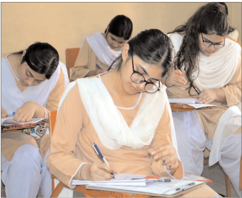
HYDERABAD: Students solving papers during annual SSC examination at a school.

Talking to local journalists the farmers said that torrential rains coupled with heavy hailstorm destroyed the standing crop of wheat in various parts of the Dushkhel, Noorakhel, Bandagai and Shahikhel union councils. They said the district administration should send its teams to assess the damages while the government should declare the area as a calamity hit and announce a special package for the affected farmers.