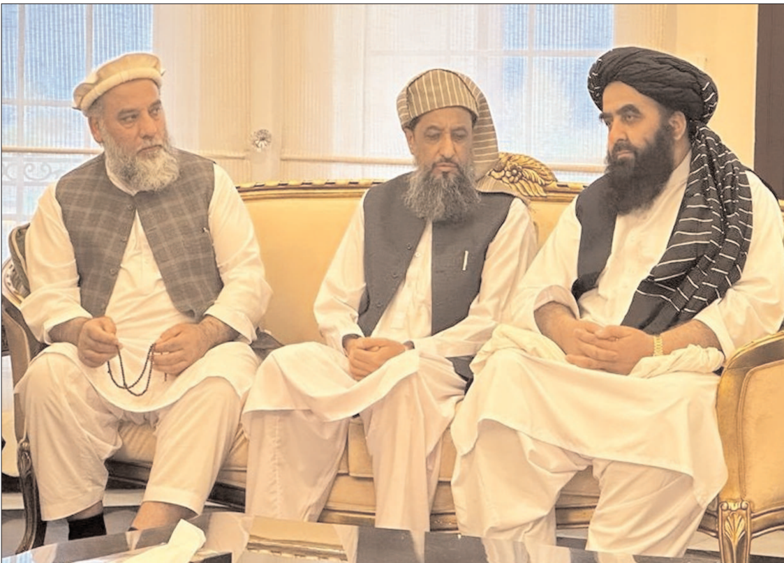
ISLAMABAD: Ameer of Jamiat Ulema-e-Islam Maulana Hamid-Ul-Haq Haqqani meeting with Minister of Foreign Affairs of the Islamic Emirate of Afghanistan Amir Khan Muttaqi.

But most of them occurred in remote areas. This time intense fighting in Khartoum, one of Africa's biggest cities, has made the conflict far more alarming for Sudanese. Since the fighting erupted, the UN refugee agency has registered more than 30,000 people crossing into South Sudan, more than 90 per cent of them South Sudanese. The true number is likely much higher, it says. Aid agencies fear the influx will worsen an already dire humanitarian crisis in South Sudan, which won independence from Khartoum in 2011 after decades of civil war.