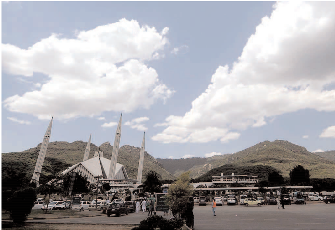
ISLAMABAD: A beautiful view of clouds hovering over Faisal Masjid.