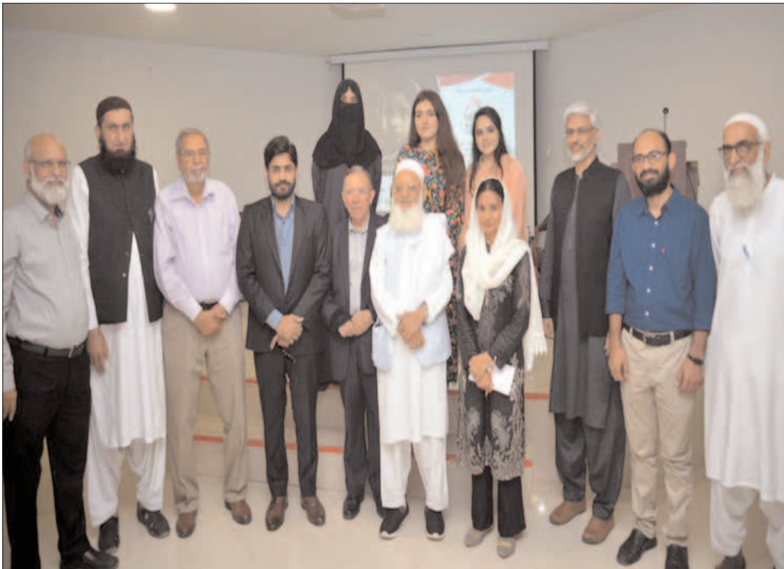
KARACHI: A group photograph during the launching ceremony of "Thalassemia Free Pakistan" at Federation of Pakistan Chambers of commerce and industries (FPCCI) Karachi.