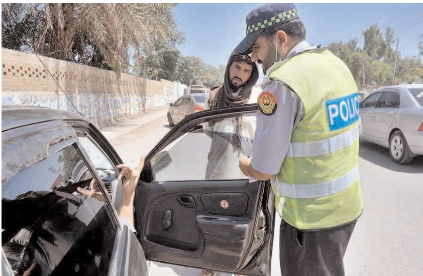
PESHAWAR: Traffic police removing black sheets from vehicle windows during crackdown against black glasses.

Abbottabad districts. During the last 24 hours mainly partly cloudy weather prevailed over most districts of the province. However, rain-wind/thunderstorm occurred in Swat, Chitral, Buner, Lower & Upper Dir, Bajaur, Abbottabad, Mansehra, Kohistan, Nowshera, Peshawar, Kohat, Mohmand and Khyber districts.