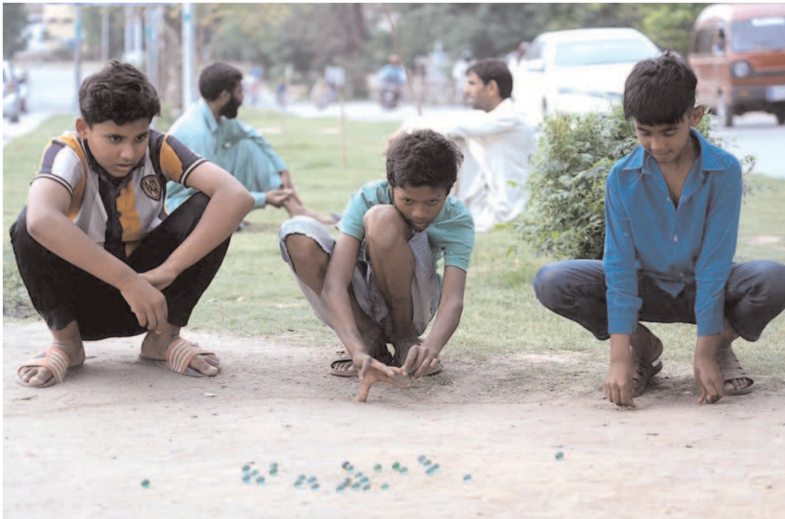
ISLAMABAD: Children playing with glass balls on the green belt near Sitara Market.

Replying to another question, he said that Pakistan Tehreek-e-Insaf leadership now only wished to return to Parliament.