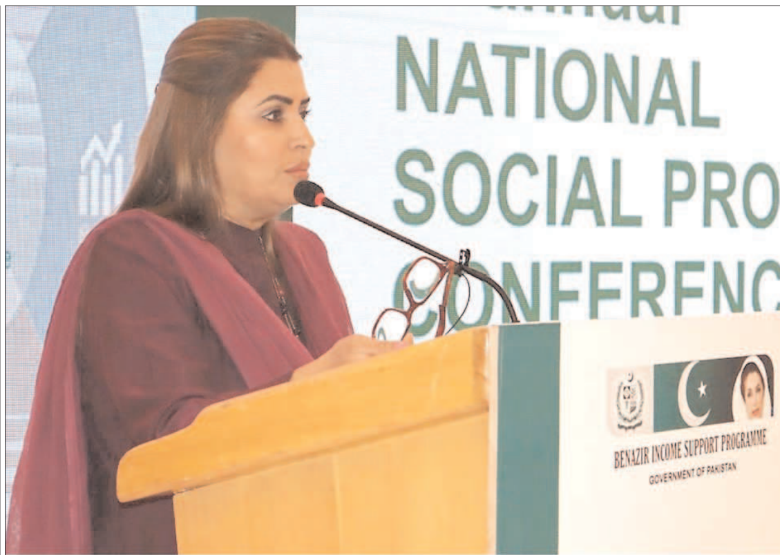
MURREE: Federal Minister for Poverty Alleviation and Social Safety and Chairperson BISP Shazia Marri addressing during a conference.

The JI leader said that the water tap under the ground had also lowered due to the closure of this channel and the residents were forced to fetch drinking water from distant places.