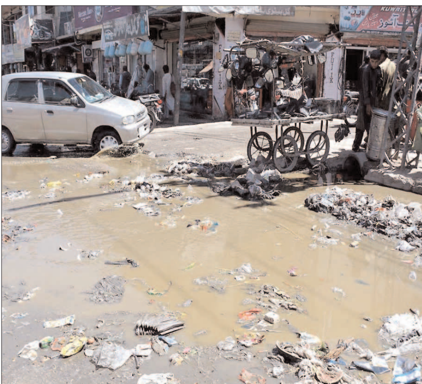
QUETTA: A view of accumulated sewerage water on double road.

Inam Haider said that through proactive approaches for disaster preparedness and response planning, we can ensure that every community in Pakistan is equipped to handle any crisis that may arise. He reaffirmed NDMA's commitment to multi-hazard preparedness nationwide and spirit of cooperation among all stakeholders for a disaster-resilient Pakistan.