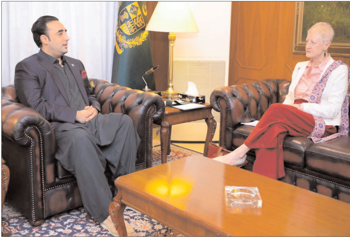
ISLAMABAD: Minister of Foreign Affairs of Pakistan Bilawal Bhutto Zardari meeting with Ambassador and Head of the delegation of the European Union to Pakistan Dr Riina Kionka.

The Parliament has for long abdicated its rights to the judiciary and the executive, he said, "it must stand up to defend its territory and guard its constitutional rights". All institutions functioning under the Constitution must adhere to the concept of trichotomy of power, he stressed. "The present intra-institutional crisis requires an institutional dialogue. The Parliament should take the lead."