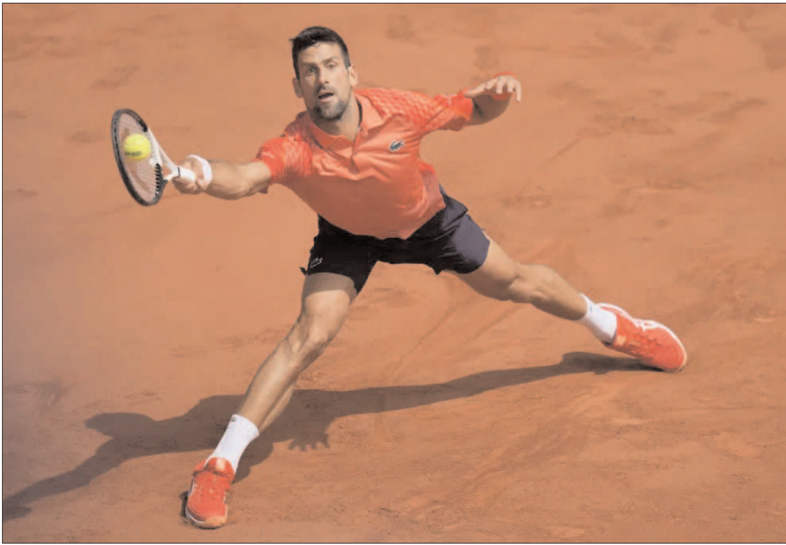
PARIS: Serbia's Novak Djokovic plays a shot against Spain's Carlos Alcaraz during their semifinal match of the French Open tennis tournament of the French Open tennis tournament.