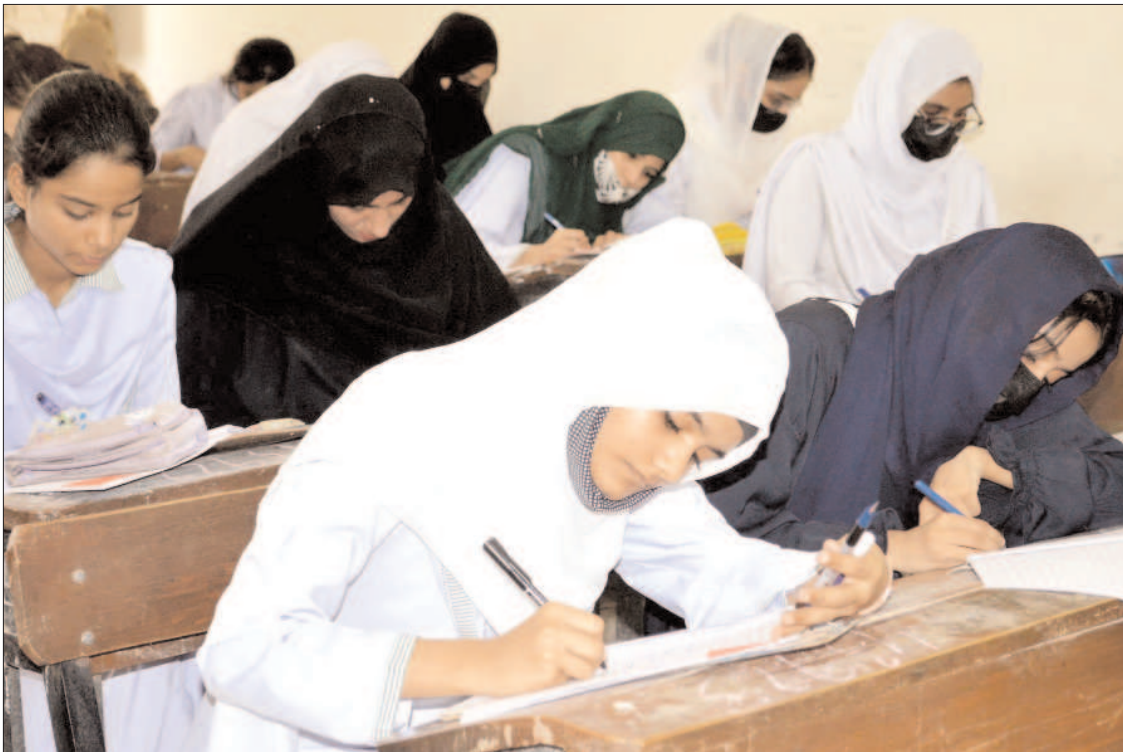
HYDERABAD: Students busy in solving question papers during Higher Secondary School examination.

MULTAN (INP): At least two people died and two others injured in collision between an over speeding car and tractor trolley here on Friday, police said. The accident took place near Chowk Sarwar Shaheed at Multan-Mianwali road where a speeding in attempt to overtake rammed into a tractor trolley. Two people died on the spot in the accident while two others sustained critical wounds. The bodies and injured were shifted to hospital for medico-legal formalities.