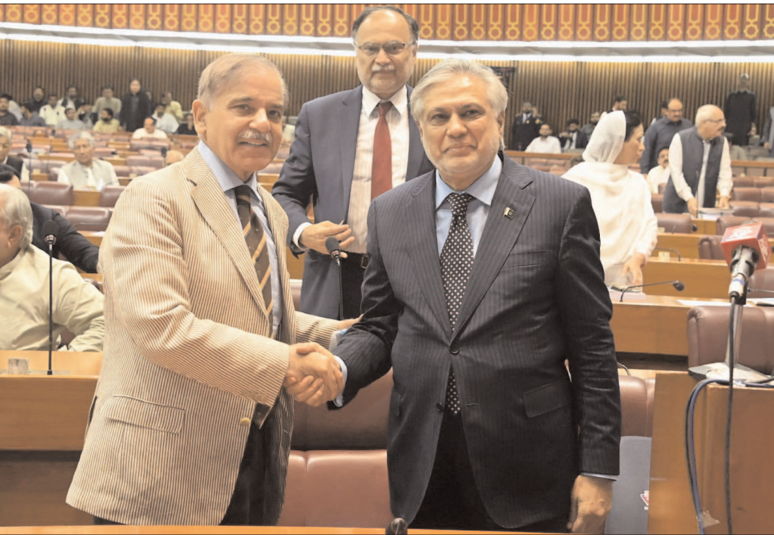
ISLAMABAD: Prime Minister Shehbaz Sharif commending Finance Minister Ishaq Dar for tabling the Finance Bill 2023-24 in National Assembly.

ISLAMABAD: Minister for Information and Broadcasting Marriyum Aurangzeb on Friday said the Federal Government had unveiled the next fiscal year budget which encompassed a complete economic programme and road-map for national progress and prosperity.