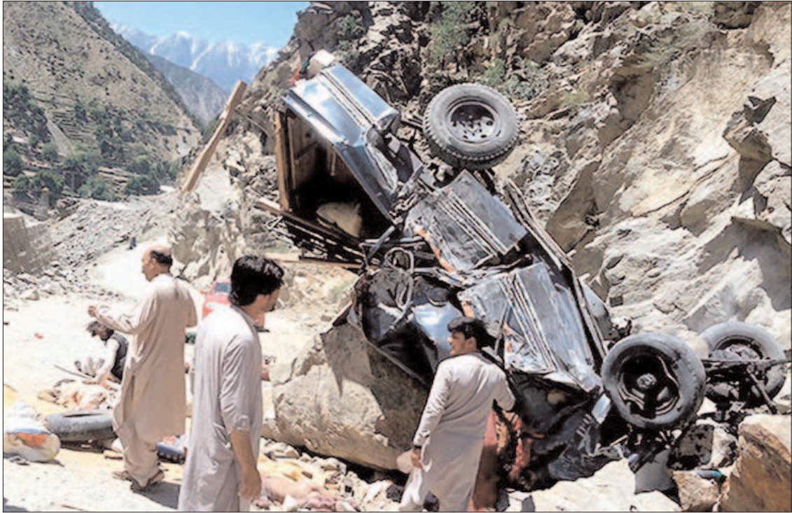
UPPER DIR: Local people gathered around the damaged vehicle after mishap, at least 8 people killed as passenger vehicle falls into ravine.