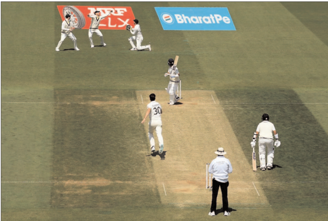
THE OVAL: David Warner and Alex Carey not going for a catch gave Ajinkya Rahane a life, Australia vs India, ICC World Test Championship.

Sri Lanka squad: Dasun Shanaka (capt), Kusal Mendis (wk), Pathum Nissanka, Dimuth Karunaratne, Dhananjaya de Silva, Charith Asalanka, Sadeera Samarawickrama, Chamika Karunaratne, Dushan Hemantha, Wanindu Hasaranga, Lahiru Kumara, Dushmantha Chameera, Kasun Rajitha, Matheesha Pathirana, Maheesh Theekshana.