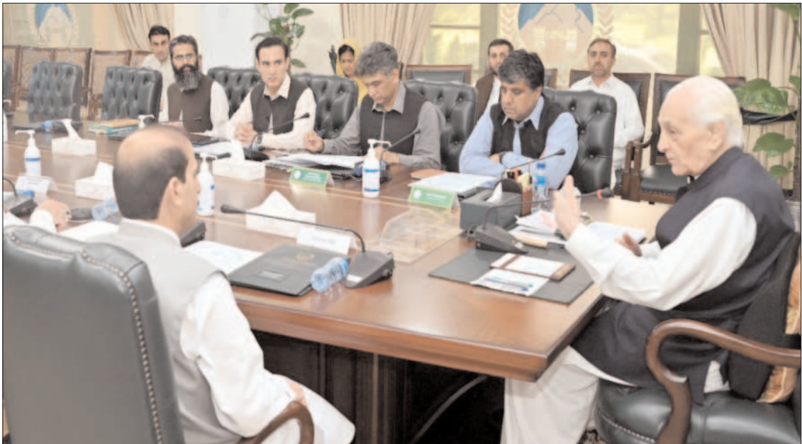
PESHAWAR: KP Caretaker Chief Minister Muhammad Azam Khan chairing a meeting regarding preparations of upcoming budget.