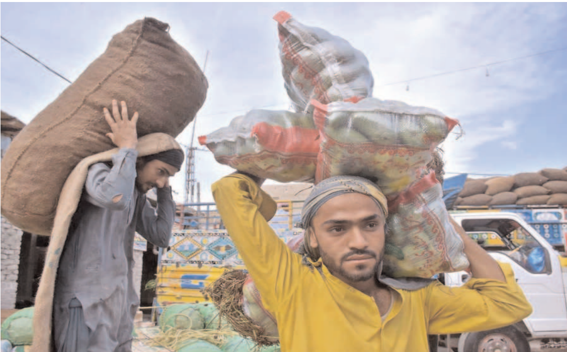
LARKANA: Laborers unloading seasonal vegetable from delivery truck at Vegetable Market.