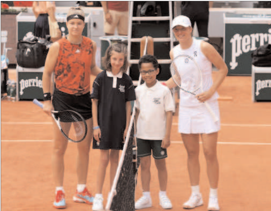
PARIS: Karolina Muchova of Czech Republic and Iga Swiatek of Poland pose for a photograph ahead of the Women's Singles Final match on Day Fourteen of the 2023 French Open at Roland Garros.

BEIJING (AFP): Football superstar Lionel Messi arrived in Beijing by private jet on Saturday and was greeted by hundreds of jubilant fans, with his World-Cup-winning Argentina set to face Australia in a friendly match next week. "Messi! Messi!" chanted several hundred fans who were waiting for him at the airport, many wearing the blue-and-white striped jersey of the Albiceleste's No. 10. Several hundred others waited outside his hotel, not far from the banks of the Liangma River, popular with Beijingers for strolls. This is Messi's 7th trip to China, the last being in 2017, according to local media. World champions Argentina will play a friendly against Australia on June 15 at Beijing's newly-renovated 68,000-capacity Workers' Stadium. By mid-day, the arrival of global sporting superstar Messi was the most talked-about topic on the Weibo social network.