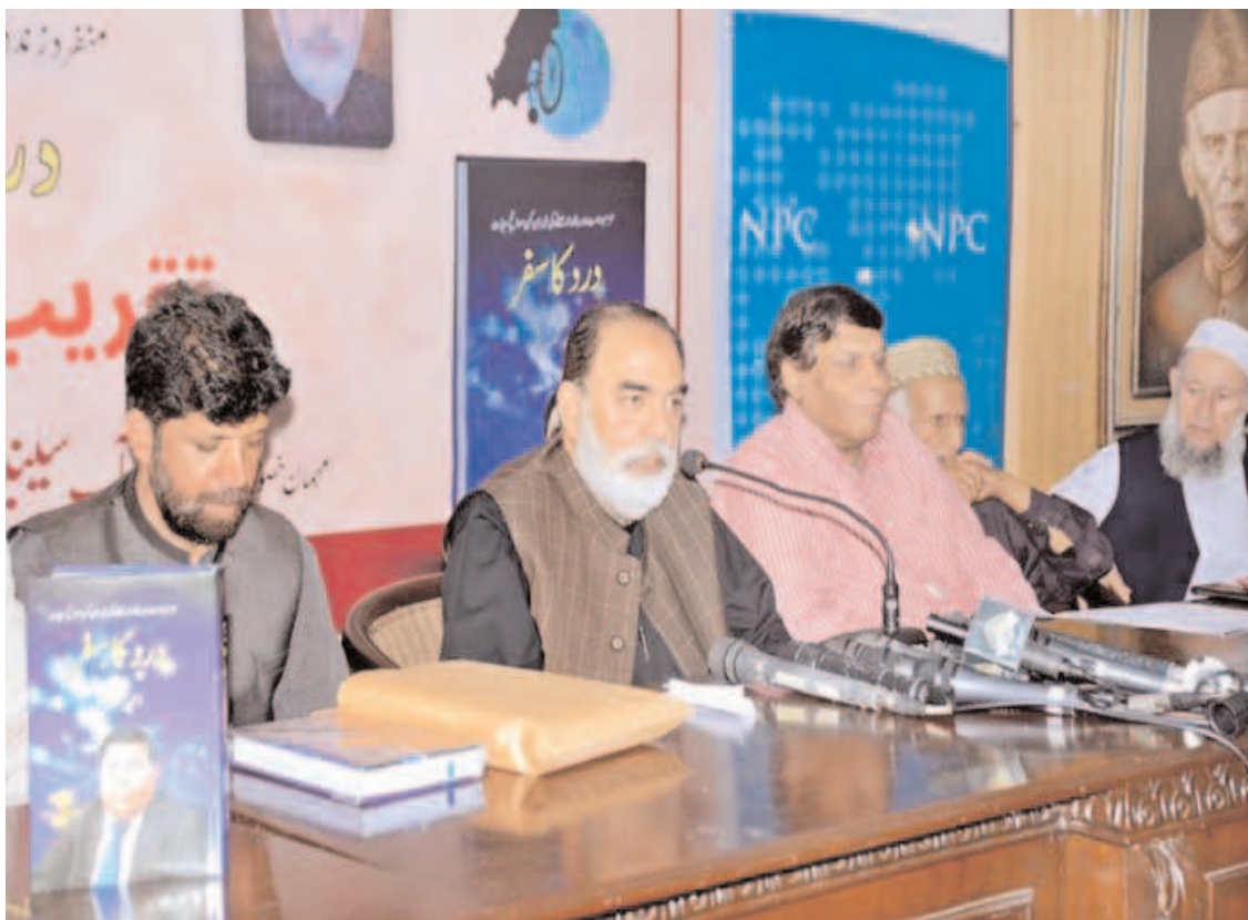
ISLAMABAD: Federal Minister for Religious Affairs and Inter-faith Harmony, Senator Muhammad Talha Mahmood addressing at the launching ceremony of a book at National Press Club.