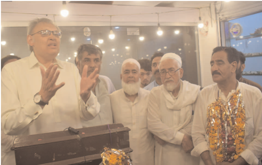
PESHAWAR: Caretaker Minister Adnan Jalil addressing 2-day Pakistan Gems & Mineral Festival.

areas of the province adding their accomplishments are commendable. He said that dream to establish justice and equality could not be materialized until and unless needy children are not given equal chances of education and growth. He also urged provincial government to allocate appropriate funds for ESEF. Later, he distributed prizes and certificates among children that are studying in community schools of ESEF.