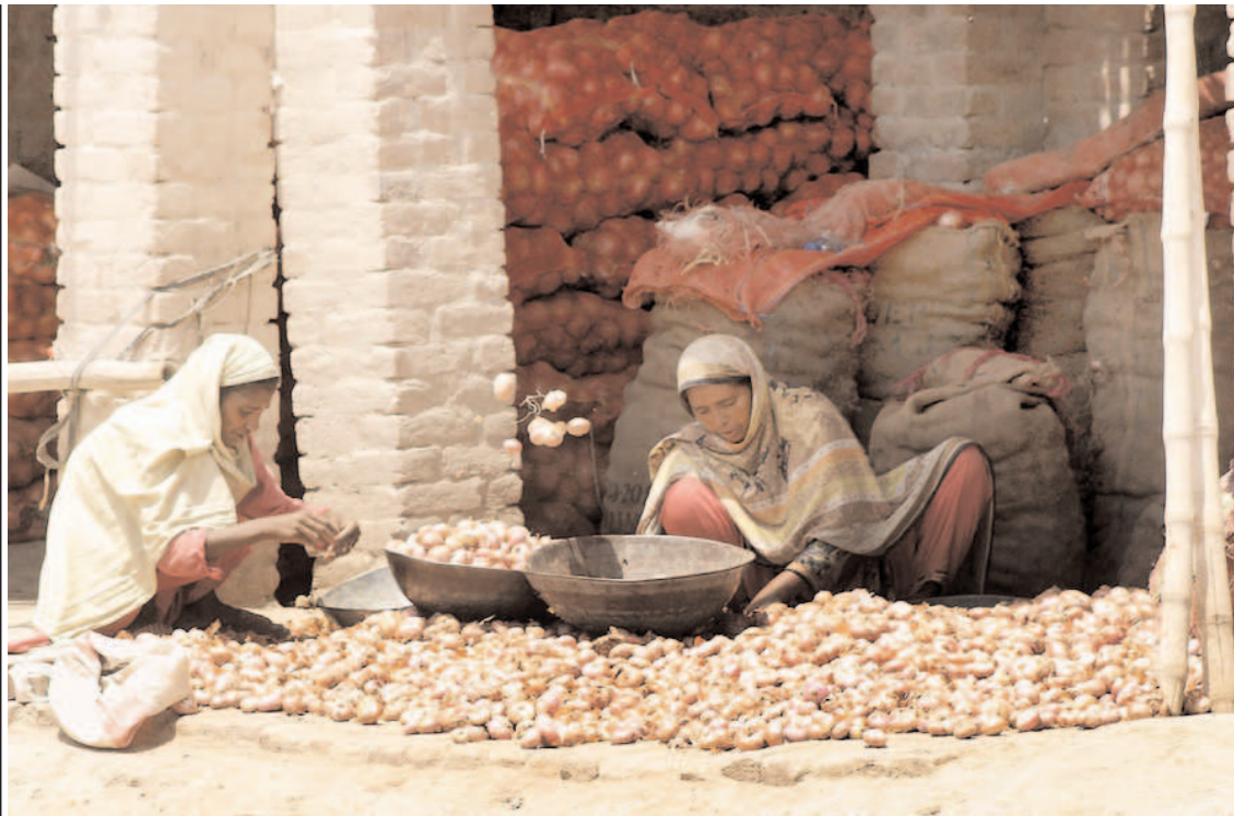
MULTAN: Women sorting good quality onions at vegetable market.

He observed that in view of achieving economic growth through consistency in policies, the government will have to take solid measures to strengthen the trade and industry, especially the SMEs, saving the livelihood of millions of workers associated with the small businesses. He said that the small and medium enterprises are backbone of the economy and their role was crucial for economic development. He said that major issue of the SMEs is limited access to the financing, which should be increased.