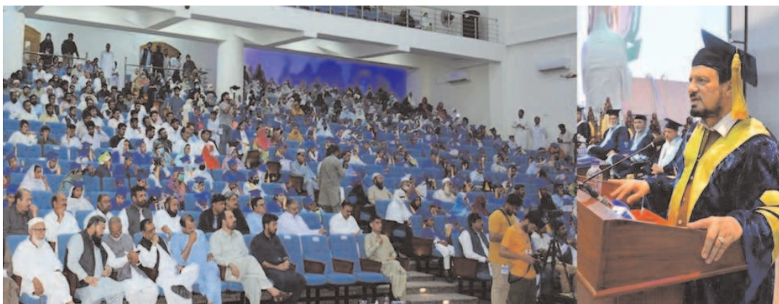
PESHAWAR: Governor Haji Ghulam Ali addressing graduation ceremony of Elementary & Secondary Education Foundation 2023.

He told that the festival would be held on its planned dates. All the required preparations have been nearly finalised. KPCTA will be welcoming all the Tourists to facilitate them in exploring Chitral and Shandor especially the Polo Festival.