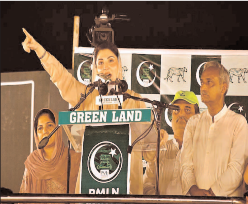
MULTAN: Chief Organizer PML-N Maryam Nawaz addressing the Youth Convention at Shujaabad.

Senior Vice President Maryam Nawaz heaped praise on the PML-N supremo, saying, "Nawaz Sharif never did politics of vandalism. The leader is the one who went to jail holding his daughter's hand". "Nawaz Sharif fought oppression but never encouraged chaos," Maryam Nawaz said, adding that the PML-N supremo will once again rise to power through democratic way. Pakistan Muslim League-Nawaz (PML-N) Senior Vice President Maryam Nawaz further said that the person who build metros, hospitals and schools can never incite people to 'harm the country'. "A person's lust for power had damaged the country and state institutions," he added. "Despite the intention of breaking the PML-N, the party stood with Nawaz Sharif. But the PTI chief's own party has shrunk today," she asserted. Speaking about the budget, Ms Nawaz praised Prime Minister Shehbaz Sharif, saying, "The premier presented the best budget despite the many challenges the country is facing".