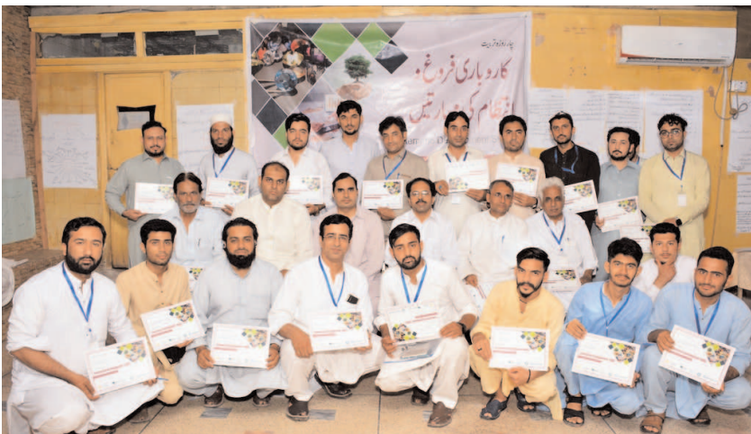
PESHAWAR: A group of participants of four-day training organized by KPEC and ECI.