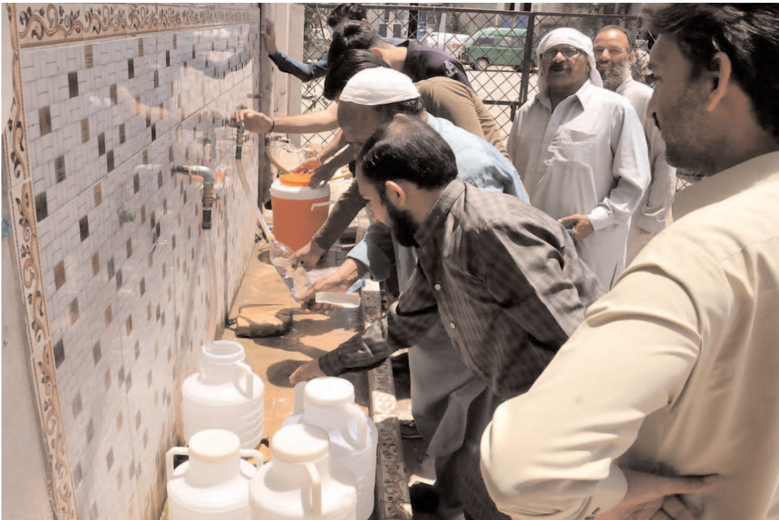
ISLAMABAD: People filling drinking water from filtration plant at Ghori town during hot day in the Federal Capital.

RAWALPINDI (APP): June 20 would be the deadline to submit an application to collect hides of sacrificial animals as Rawalpindi District Administration would not allow anyone to collect hides without permission and a No-objection Certificate (NoC) as per the directives of the Punjab government. Deputy Commissioner (DC) Office Rawalpindi had announced that the applications for collecting hides of sacrificial animals would be received till June 20 and after the deadline, no application would be entertained. According to a district administration spokesman, the administration would not allow anyone to collect hides without prior permission of the authorities concerned as the Punjab government had imposed a ban on the collection of hides without NoC on Eid ul Azha. He said, the charity organizations intending to collect the hides of the sacrificial animals had been directed to submit applications to the office of DC Rawalpindi for permission letter by June 20. The Home Department of the Punjab Government had banned the collection of the hides without the approval of the competent authority. The DC office Rawalpindi would not receive any application for the permission letter after the expiry of the above-mentioned date.