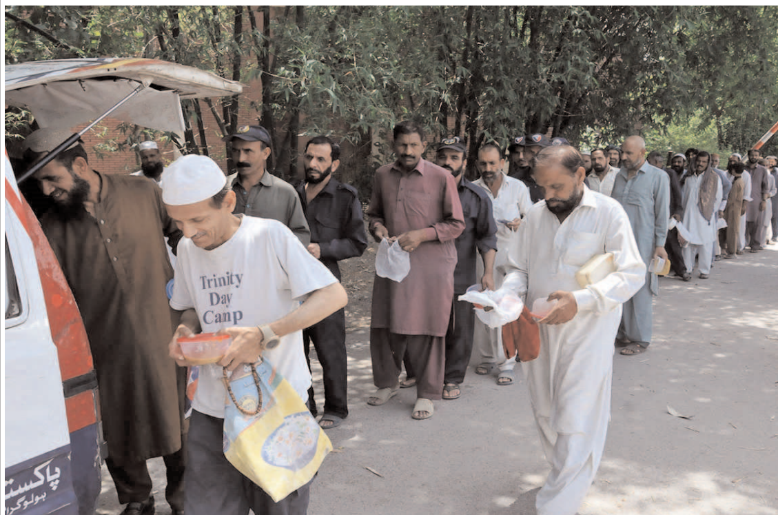
ISLAMABAD: A volunteer distributing free food among deserving people at Mauve Area G-7.

The crackdown would continue until the outstanding revenue amount from the last defaulter is recovered, he added.