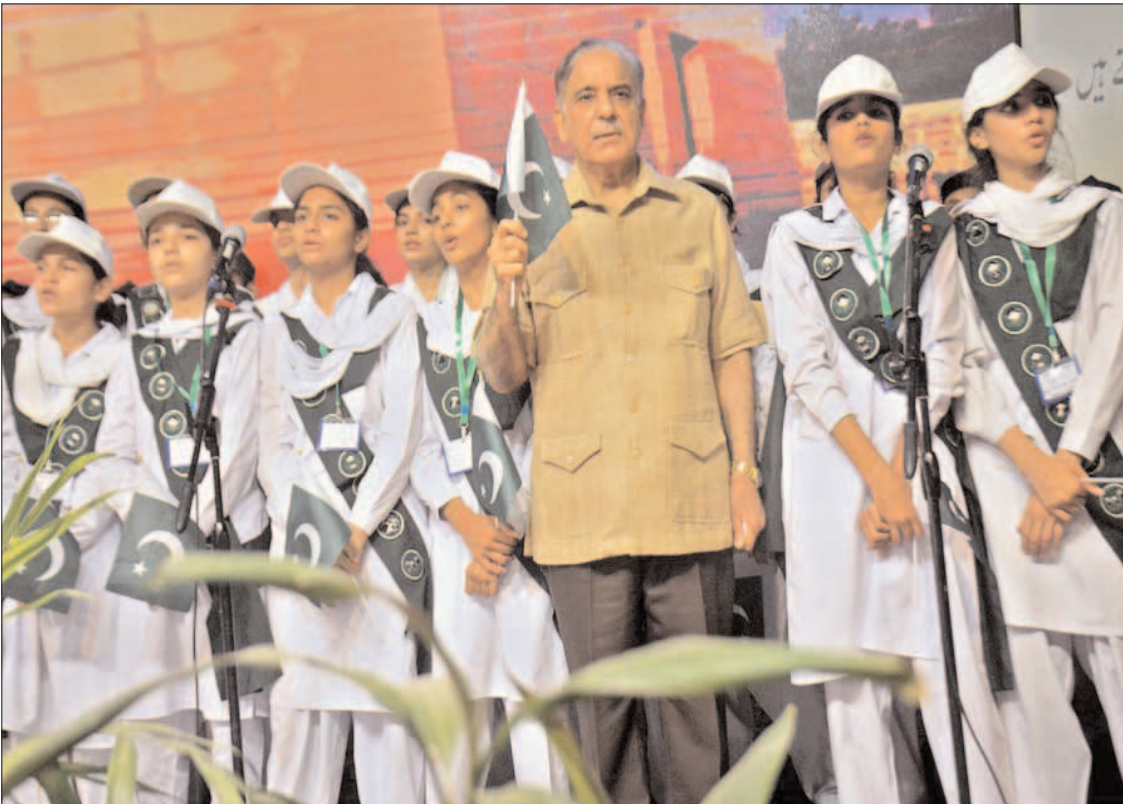
LAHORE: Prime Minister Mian Muhammad Shehbaz Sharif holding Pakistani Flag during National song being play at Sabzazar Sports Complex.

that innocent would be treated fairly and with justice. The PM said in 2017, as servant of Punjab province he started work on a plan for establishing 14 state of the art sports complexes but the fascist government of Imran Niazi stopped the project after the stolen elections of 2018. The proposed sports complexes included facilities of swimming pools, gymnasiums, badminton and squash courts. He recalled that the leadership of Pakistan Muslim League(N) was put in jail for initiating huge public welfare projects including projects of clean drinking water and solid waste management in cities. PM visits Sabzazar Sports Complex in Lahore: Prime Minister Shehbaz Sharif on Sunday here visited Sabzazar Sports Complex and reviewed the facilities provided at the complex managed by Lahore Development Authority (LDA). The PM expressed satisfaction with the standard of sports facilities for the people. He appreciated the administration for making separate arrangements for women's sports. Commissioner Lahore briefed the prime minister on the ongoing sports projects initiated by LDA. Shehbaz Sharif issued special instructions for the early completion of projects. Pakistan Muslim League (Nawaz) Vice President Punjab Rana Mashhood accompanied the prime minister during the visit.