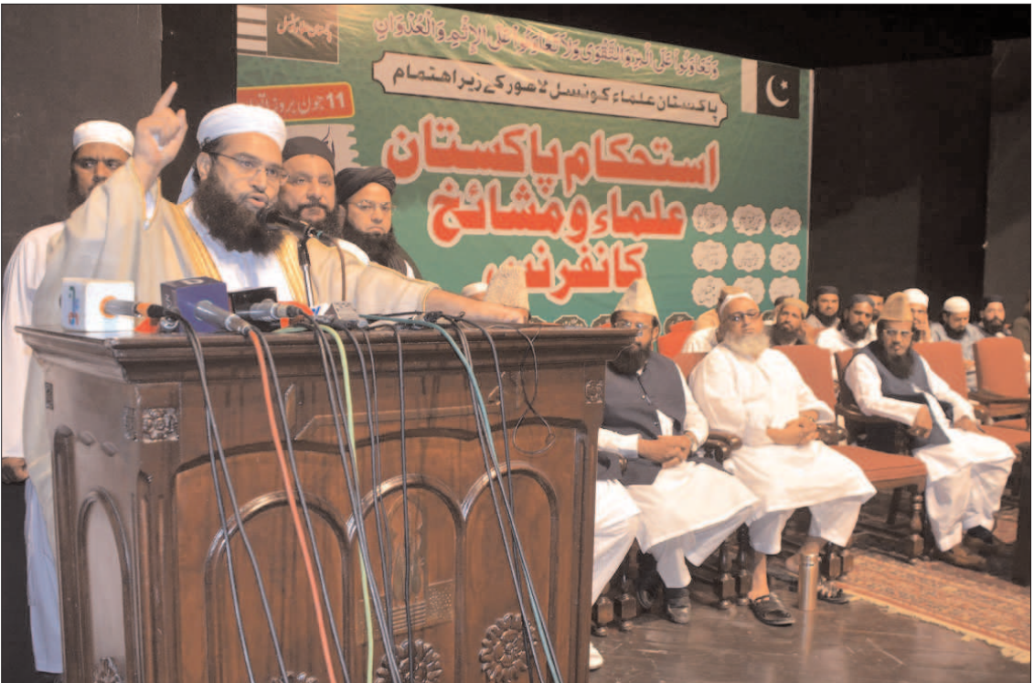
LAHORE: Prime Minister's Special Representative Hafiz Muhammad Tahir Mehmood Ashrafi addressing during Istehkam Pakistan Ullema Mashaikh conference.