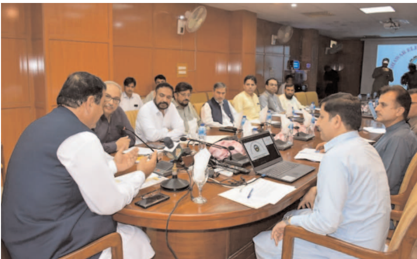
PESHAWAR: Advisor to PM on Political & Public Affairs, National Heritage Engineer Amir Muqam presiding over a meeting at WAPDA House.

He was further grateful to the Prime Minister for extending tax exemption for the erstwhile FATA/PATA for another period of one year. He said that Prime Minister Muhammad Shehbaz Sharif has always stood by the people of Khyber Pakhtunkhwa whether it was storm or flood.