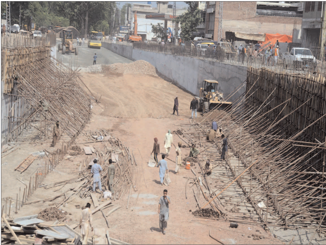
LAHORE: Construction work underway at underpass of Samanabad in Provincial Capital.