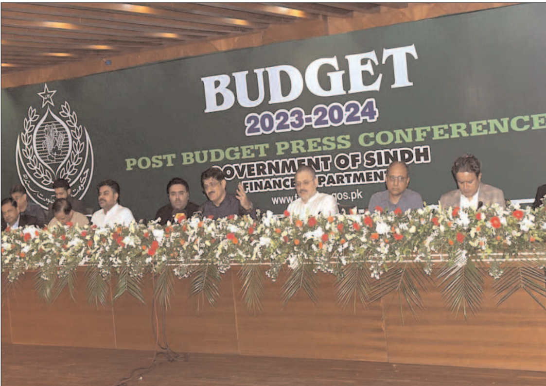
KARACHI: Sindh Chief Minister Syed Murad Ali Shah holding a post-budget press conference at the Sindh Assembly's auditorium.

ISLAMABAD (APP): The Extremely Severe Cyclone Storm (ESCS) "BIPARJOY" may probably approach the southeast Sindh coast and cause widespread wind-dust/thunderstorm rain with some very heavy/extremely heavy falls at few districts of Sindh between June 13-17. About the possible impacts of the cyclone, the Pakistan Meteorological Department (PMD) has revealed on Sunday that "With its probable approach to the southeast Sindh coast, widespread wind-dust/thunderstorm rain with some very heavy/extremely heavy falls accompanied with squally winds of 80-100Km/hour likely in Thatta, Sujawal, Badin, Tharparker and Umerkot districts during June 13-17". "Dust/thunderstorm-rain with few heavy falls and accompanied with squally winds of 60-80 Km/hour is likely in Karachi, Hyderabad, Tando Muhammad Khan, Tando Allayar, Mirpurkhas districts from June 13/14 and June 16", the PMD said. Squally (high intensity) winds may damage loose and vulnerable structures. Storm surge of 3-3.5 meters (8-12 feet) is expected at the land falling point (Keti Bandar and around). The PMD has advised the fishermen not to venture in open sea till the system is over by June 17, as the Arabian Sea conditions may get very rough/high accompanied with high tides along coast. The Very Severe Cyclonic Storm (VSCS) "BIPARJOY" over east