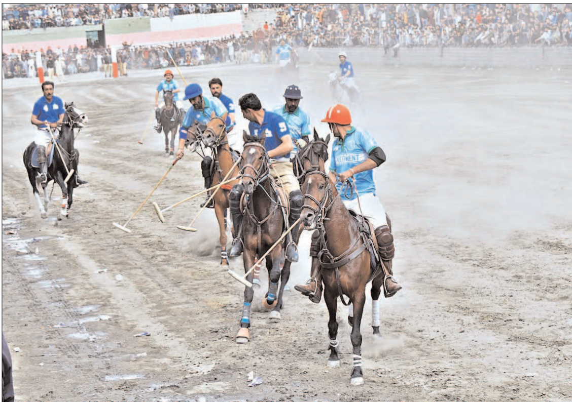
GILGIT: Players from NLI (B) and GBPWD teams in action during the Jashn-e-Baharan freestyle Polo Tournament at Aga Khan Shahi Pologround.

"I'm a little surprised by the gaps, I can only be very satisfied, I'm in good shape. Now I'm going to relax for a few days and fine-tune the preparation for the Tour," 26-year-old Vingegaard said. Ciccone's stage win comes after he had to withdraw from the Giro d'Italia in May because he had Covid-19. "I had 10 days off the bike, my condition wasn't 100%, so started here with the Tour de France in the head but saw this week my condition getting better and better, so I'm really happy to close this week with a victory," Ciccone said.