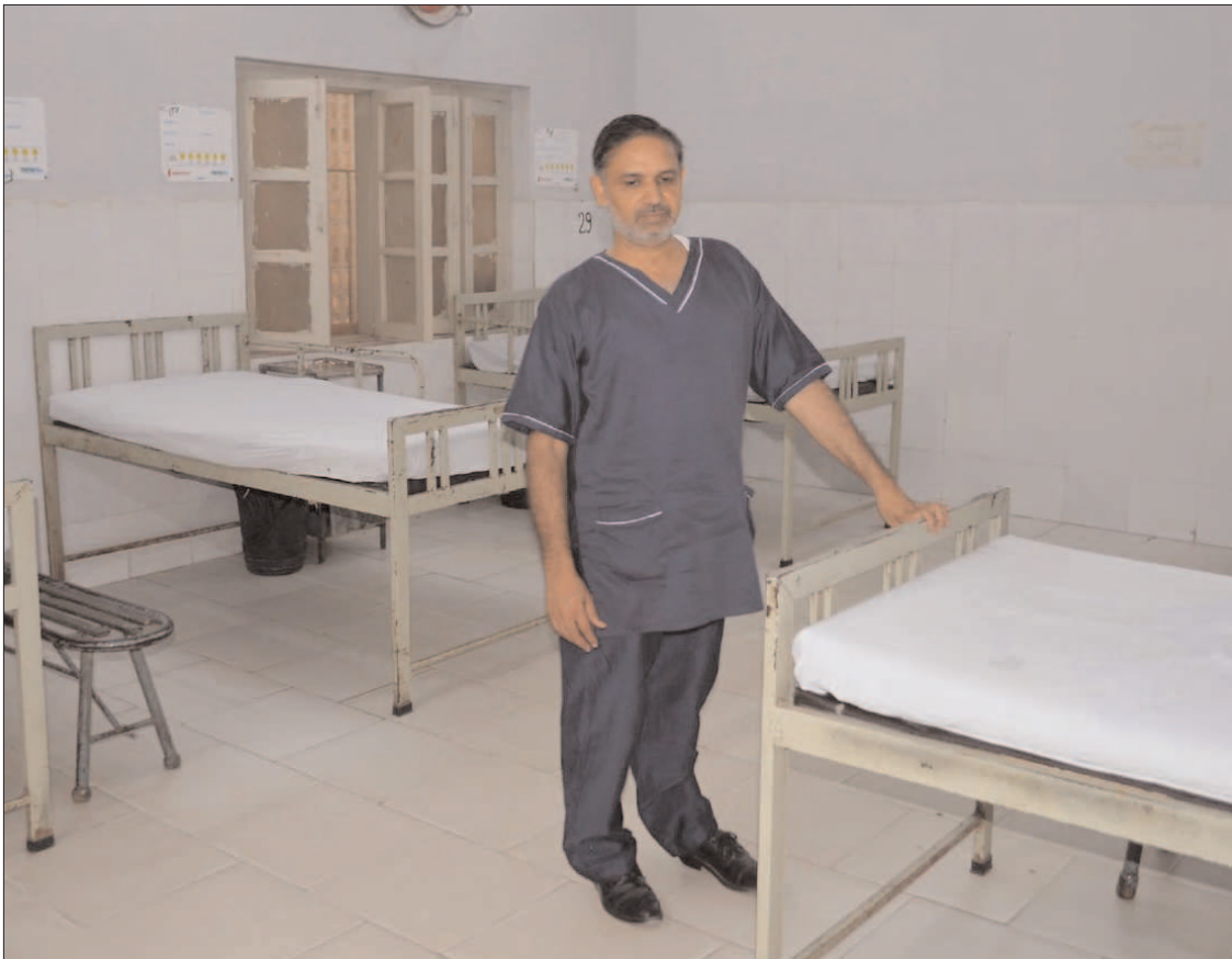
HYDERABAD: A view of Cyclone affectee management room at casualty department of Sindh government hospital.