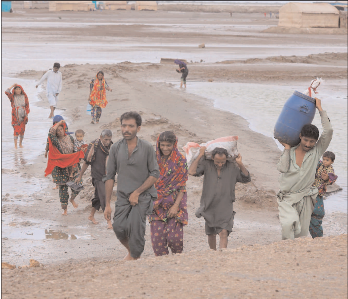
THATTA: People shifting towards safer places from the expected Cyclone hit areas of Ketī Bandar.