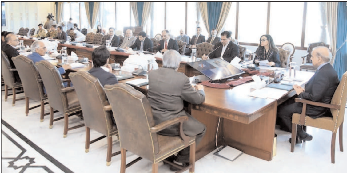
ISLAMABAD: Prime Minister Shehbaz Sharif chairing a meeting regarding preparedness and measures taken for the approaching 'Biparjoy' cyclone.