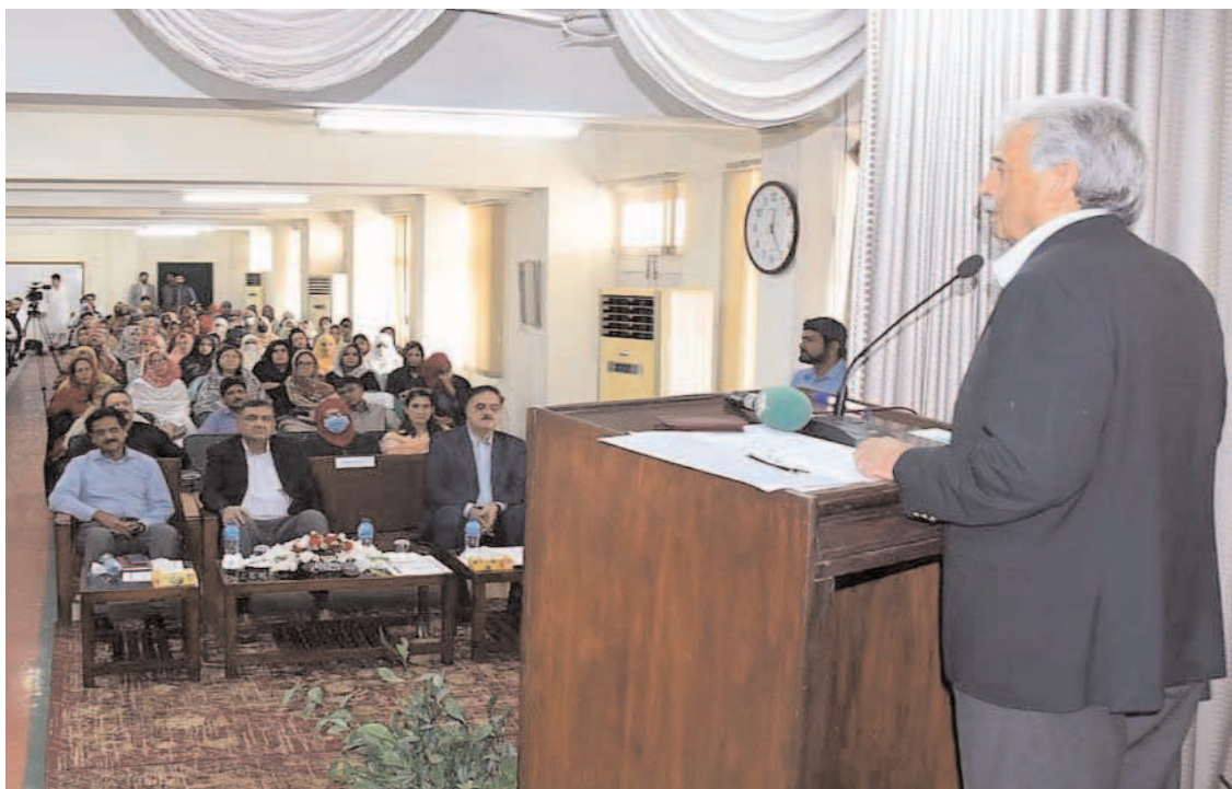
ISLAMABAD: Federal Minister for Education Rana Tanveer Hussain addressing during the launching ceremony of 1st Pre-Service Teachers Training Program for Federal Directorate of Education at Federal Collage of Education H-9.

ISLAMABAD (APP): The Islamabad Electric Supply Company (IESCO) on Tuesday issued a power suspension programme for Wednesday for various areas of its region due to necessary maintenance and routine development work. According to an IESCO Spokesman, the power supply would remain suspended from 09:00 AM to 2:00 PM in F-17/1&2, Tufail Shaheed, Charah, Frash Town and Kirpa feeders in Islamabad Circle; Nogzi, Bagh Sardaran, Social Security, Industrial, Pir Wadhah, Raja abad, Nogazi, Binjal, Dhoke Choudhuria and Shams Colony feeders in Rawalpindi City Circle; River Garden I, II, III and Naval I & II feeders in Rawalpindi Cantt Circle; Domeli, Bhagwal.