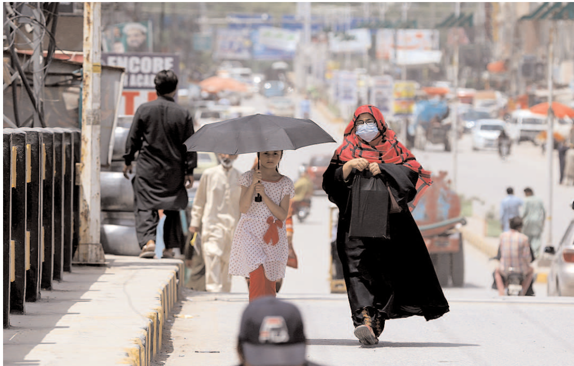
ISLAMABAD: A girl on the way under cover of an umbrella to protect herself from direct sunlight during a hot weather at Ghouri Town.

The MD PBM said that presently, 50 Sweet Homes operating across the country were catering the needs of orphans in terms of their accommodation, education and well-being through adopting a modern welfare approach.