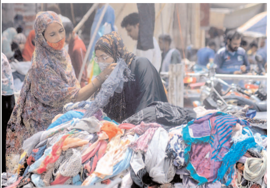
MULTAN: Women selecting and purchasing second-hand clothes displayed by a roadside vendor.

The before time completion of pipeline construction project for injection of gas, which carries significant national importance owing to the prevailing energy crisis, was only made possible through the guidance of the Company's Board of Directors and the current management along with steadfast dedication and hard work of SNGPL's workforce.