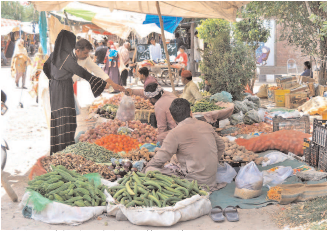
MULTAN: People busy in purchasing vegetables at Friday Bazar.