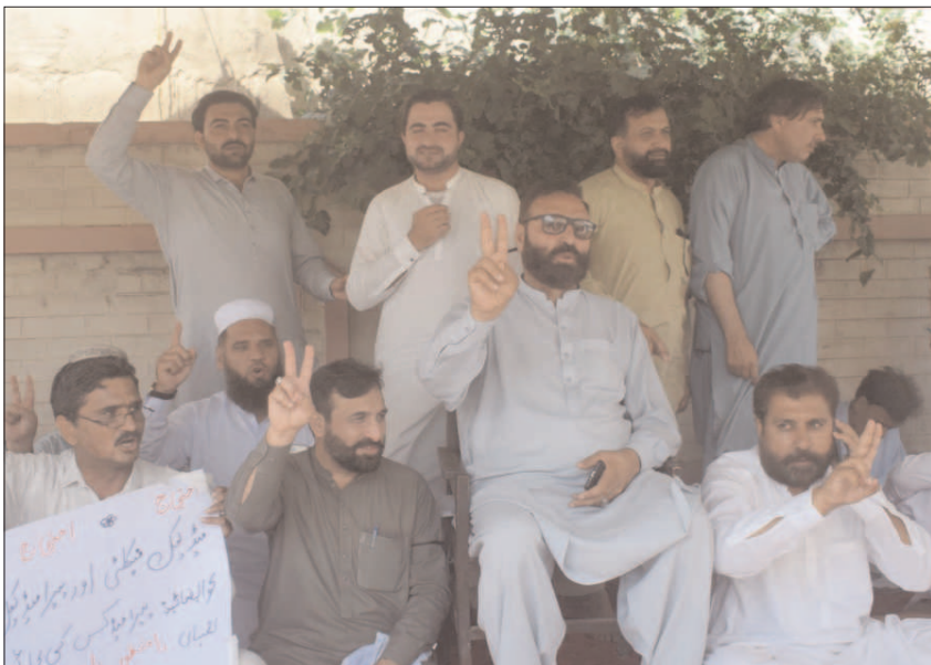
PESHAWAR: KP paramedics holding a protest demo for acceptance of their demands.