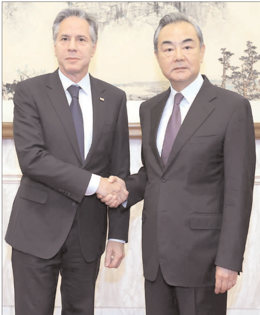
BEIJING: US State Secretary Antony Blinken shaking hands with Chinese Communist Party's central committee member Wang Yi prior to a meeting.