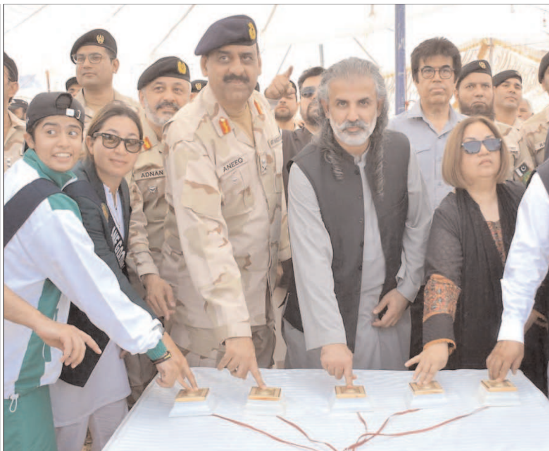
QUETTA: Federal Minister for Narcotics Control Nawabzada Shahzain Bugti pressing button to burn drugs during a ceremony.