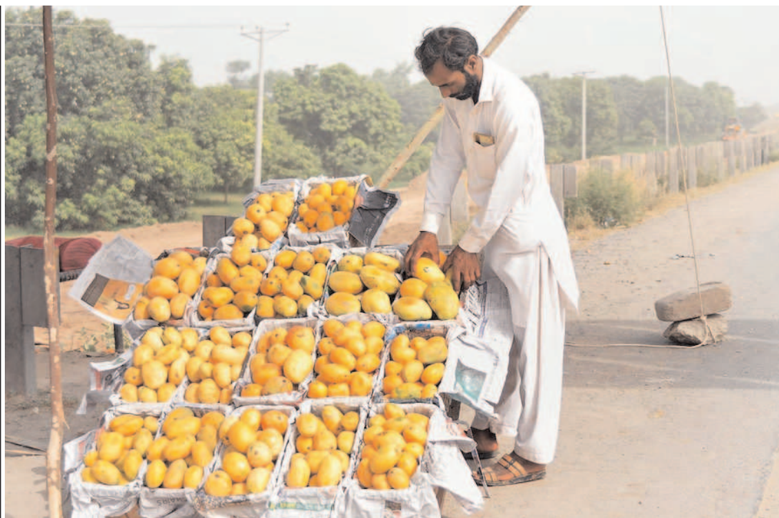
MULTAN: Vendor arranging and displaying fruit mango to attract customers at his roadside setup.

The price of gold in the international market decreased by US$7 to $1951 against its sale at $1958, the association reported.