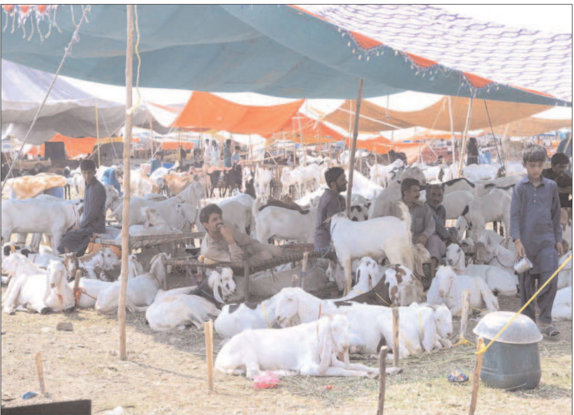
LAHORE: Vendors displaying the sacrificial animals to attract the customers at Johar Town in connection with upcoming Eidul Azha.

Sheikh Rashid also demanded that the coffins of those who lost their lives in boat incident in Greece should be brought home. He said people took to the street in Greece for 300 Pakistanis but here "our rulers are only issuing a statement of mourning."