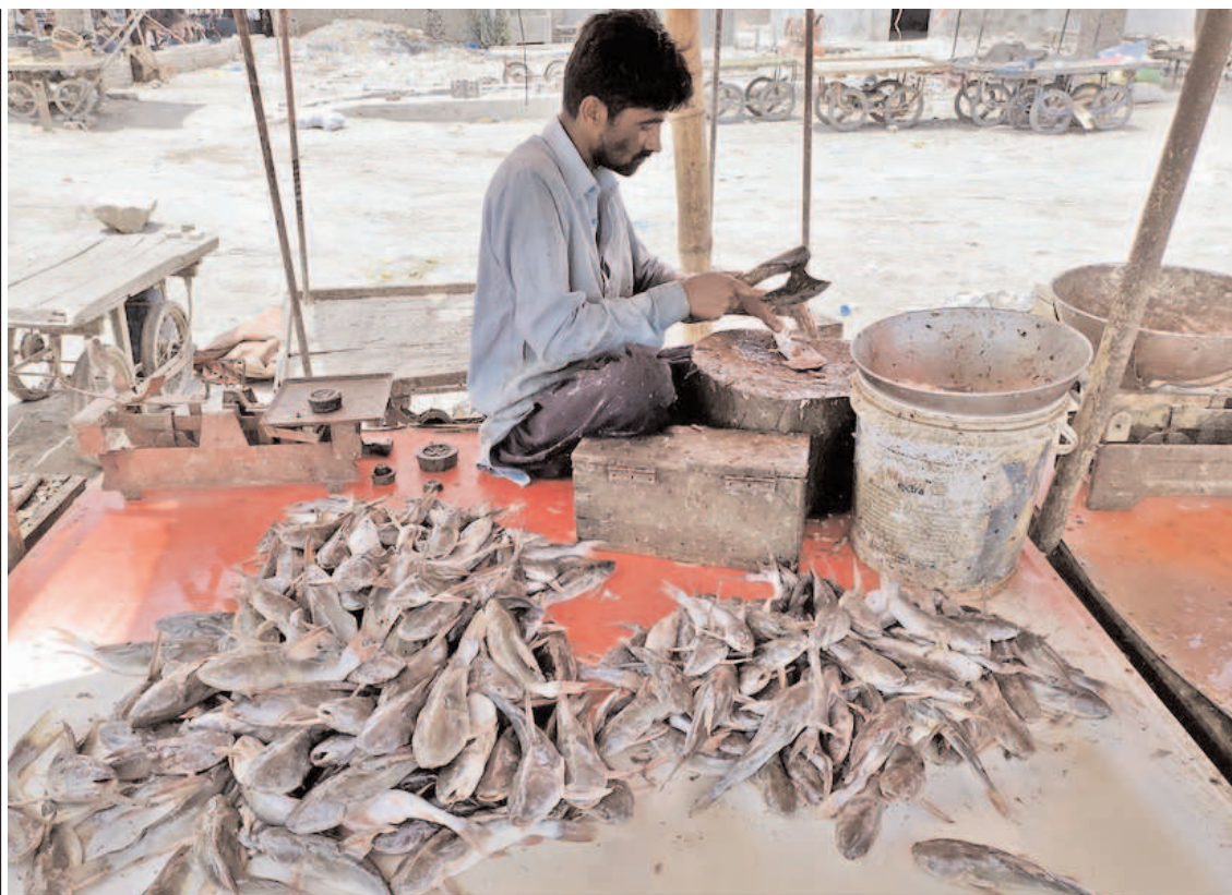
LARKANA: A vendor selling fishes at Old Bus Stand Road.

Talking about the upcoming exhibition in Kabul, the SCCI's acting chief said facilities should be provided for foreign business delegates/traders to ensure their maximum participation in the exhibition.