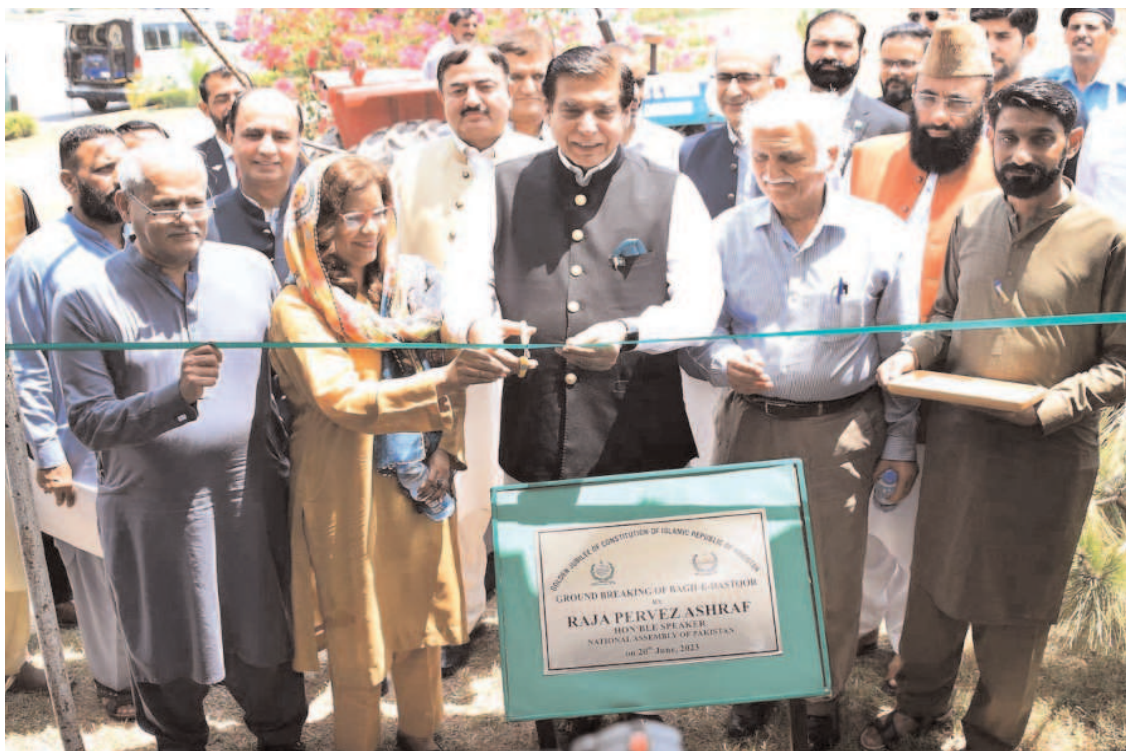
ISLAMABAD: Speaker National Assembly Raja Pervez Ashraf inaugurating the Ground-Breaking Ceremony of Bagh-e-Dastoor at D-Chowk.