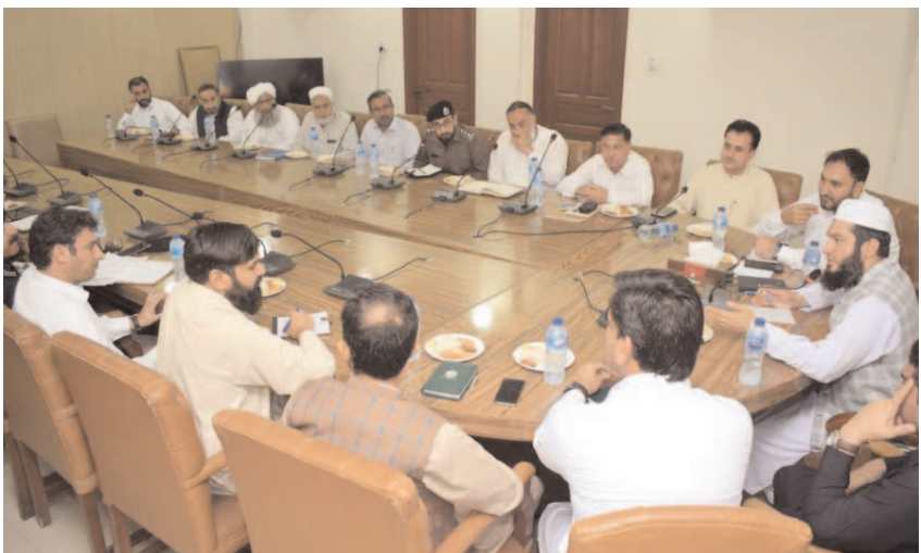
PESHAWAR: Mayor Haji Zubair Ali presiding over a high lever meeting of city district administration.