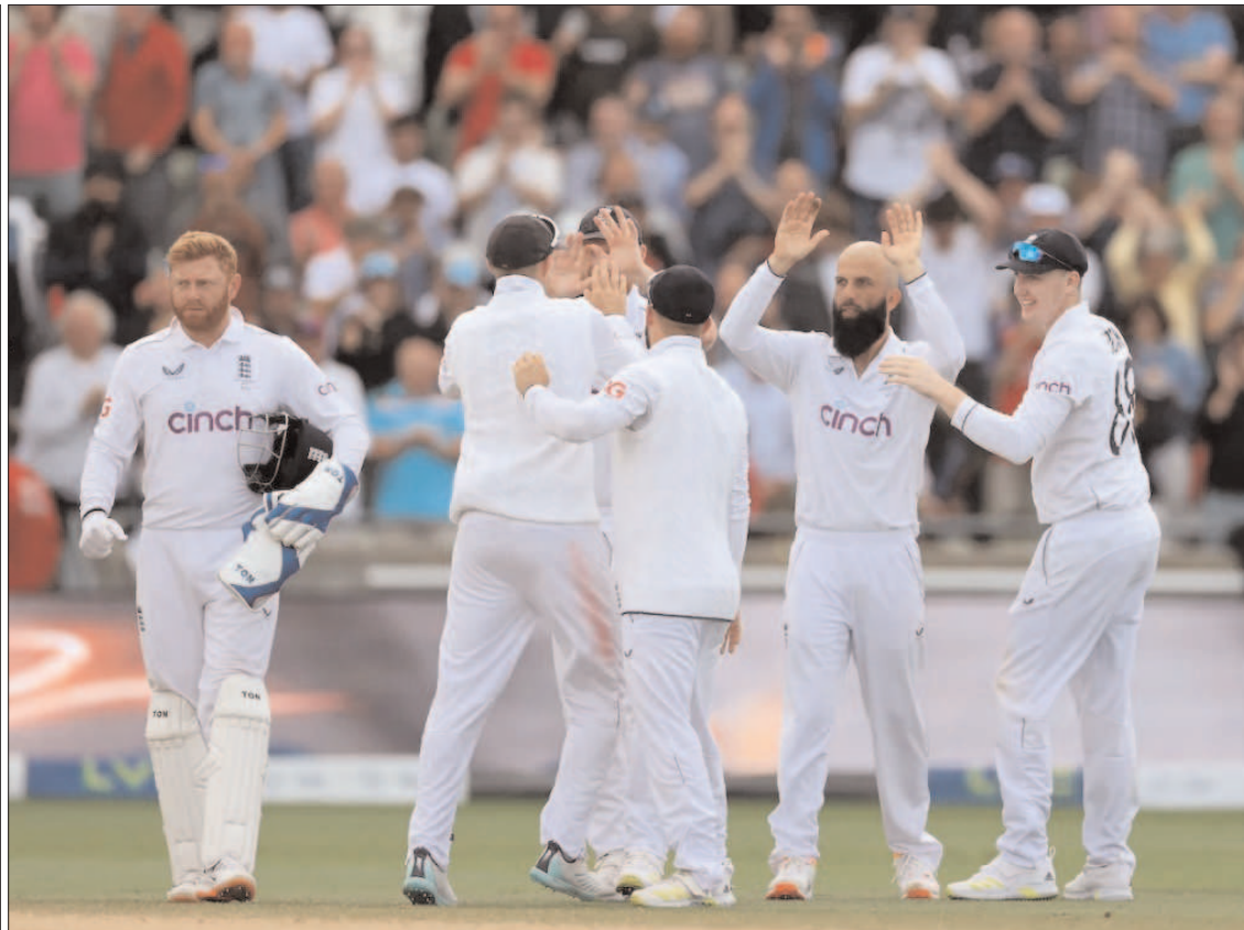
BIRMINGHAM: Joe Root took the catch to hand Moeen Ali a wicket, England vs Australia, 1st Ashes Test 5th day.