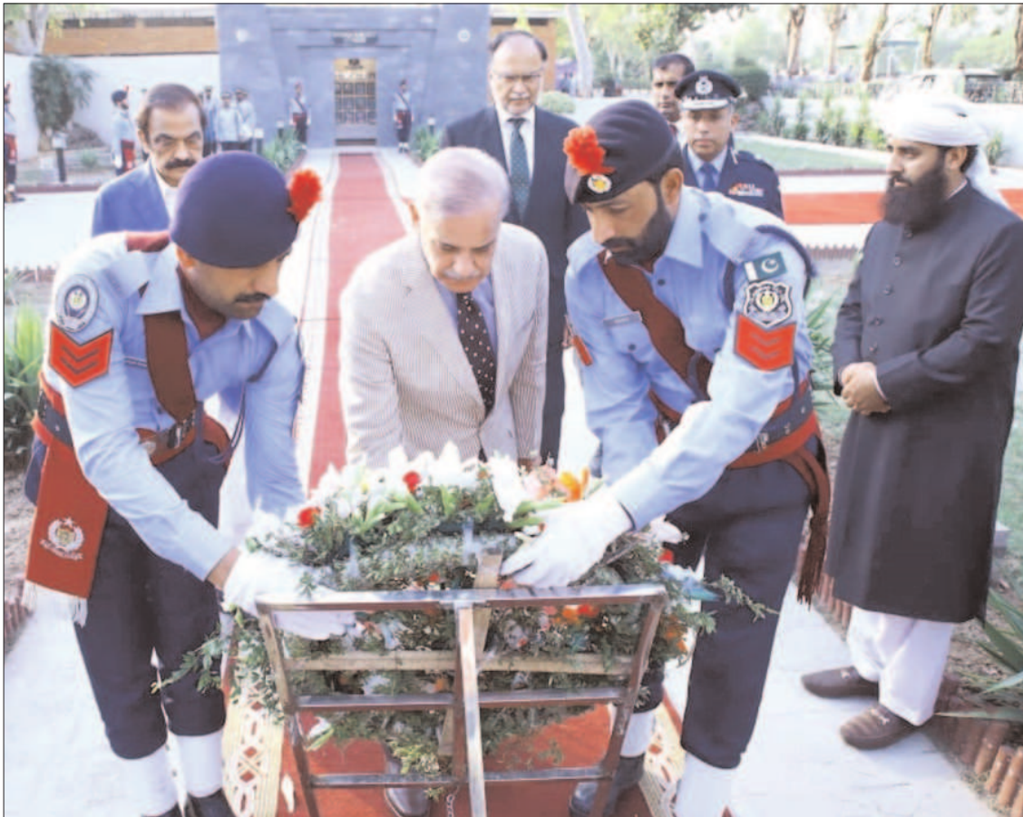
ISLAMABAD: Prime Minister Shehbaz Sharif laying floral wreath at the Yadgar-e-Shuhada in Police Lines Headquarters.