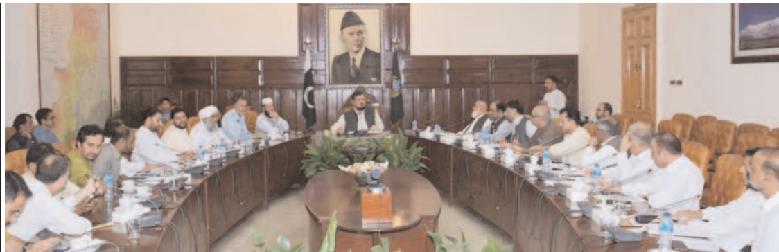
PESHAWAR: Governor Khyber Pakhtunkhwa Haji Ghulam Ali presiding over a meeting with officials of Wapda and Sui Gas at Governor's House.

He said police should allocate free education for the children of martyred journalists in police-run schools and colleges.