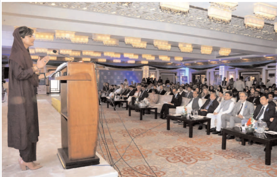
ISLAMABAD: Minister of State for Foreign Affairs, Ms. Hina Rabbani Khar addressing during World Refugee day organized by the office of the United Nations for Refugees at local hotel.

ANF North recovered 48.902 kg drugs in seven operations and arrested eight accused including a woman, two foreigners and also impounded four vehicles. The seized drugs comprised five kg opium, two kg heroin, 38.970 kg hashish, 2.850 kg methamphetamine (Ice) and 82 grams ecstasy tabs (140 tabs). All cases have been registered at respective ANF Police Stations under CNS Act 1997 while further investigations are under process.