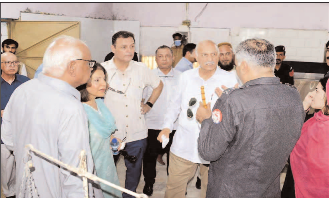
RAWALPINDI: Senator Walid Iqbal, Chairman Senate Standing Committee on Human Rights and members of the committee are being briefed during their visit at Central Jail Adiala, Rawalpindi.

traffic crashes. The statistics showed that 272 RTCs were reported in Lahore which affected 283 persons placing the Provincial Capital at top of the list followed by 80 in Multan with 83 victims and at third Faisalabad with 78 RTCs and 73 victims.