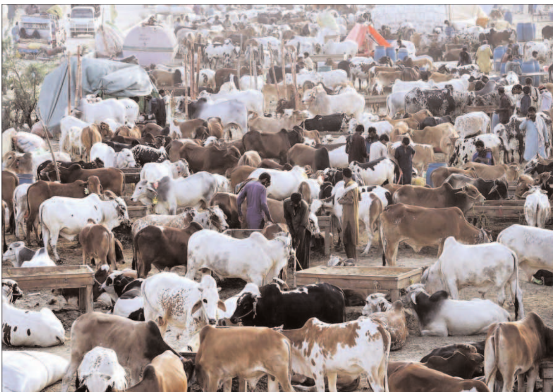
KARACHI: Sacrificial animals brought for sale ahead of Eid-ul-Azha at Super Highway Cattle Market.