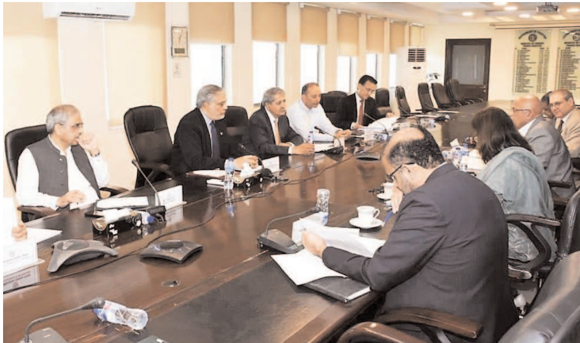
ISLAMABAD: Federal Minister for Finance and Revenue Senator Mohammad Ishaq Dar chairing meeting of Cabinet Committee on Inter-Governmental Commercial Transactions.

respectively. Gold prices decline by Rs.200 to Rs218,500 per tola The per tola price of 24 karat gold decreased by Rs.200 and was sold at Rs.218,500 on Thursday against its sale at Rs. 218,700 the previous day. The price of 10 grams of 24 karat gold also decreased by Rs.172 to Rs.187,328 from Rs. 187,500 whereas the price of 10 grams 22 karat gold went down to Rs.171,718 from Rs. 171,875, All Sindh Sarafa Jewellers Association reported. The price of per tola and ten gram silver remained constant at Rs2,550 and Rs.2,186.21 respectively. The price of gold in the international market declined by $5 to $1929 from $1934, the association reported.