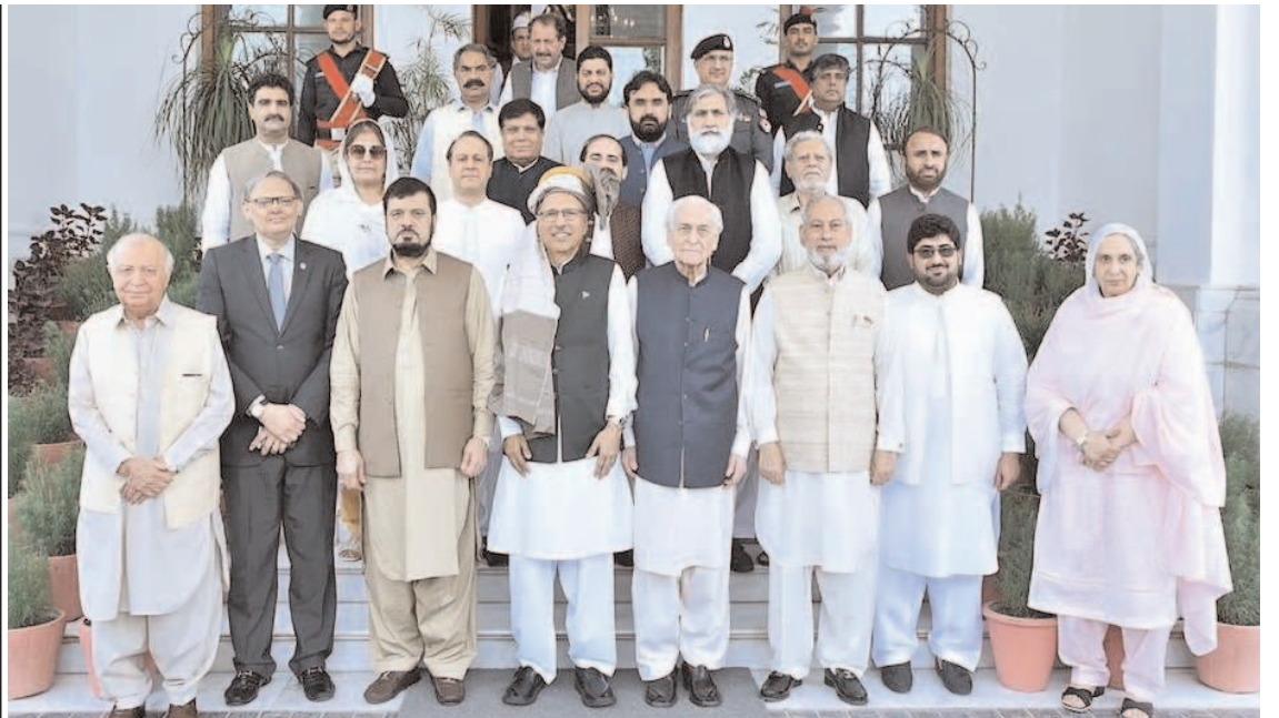
PESHAWAR: President Dr. Arif Alvi in a group photo with Governor Khyber Pakhtunkhwa Haji Ghulam Ali, Caretaker Chief Minister KP, Muhammad Azam Khan and members of provincial cabinet.

He said, 2,083 area In-charges have been appointed for effective supervision of the teams and about 14,926 police personnel have been deployed for effective security of the teams.