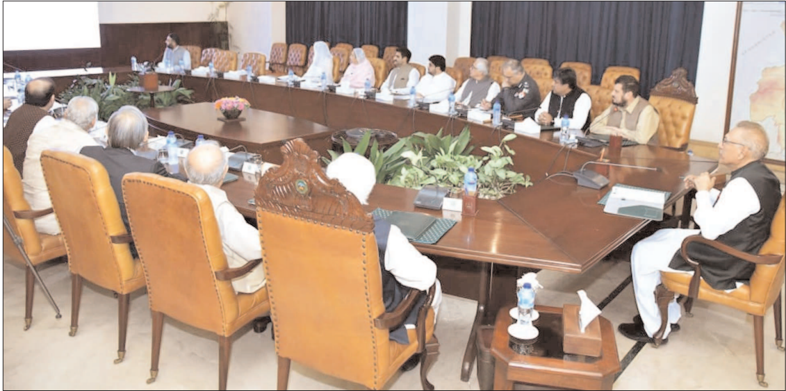
PESHAWAR: President Dr Arif Alvi chairing a meeting on higher education sector of KP, at Governor House.