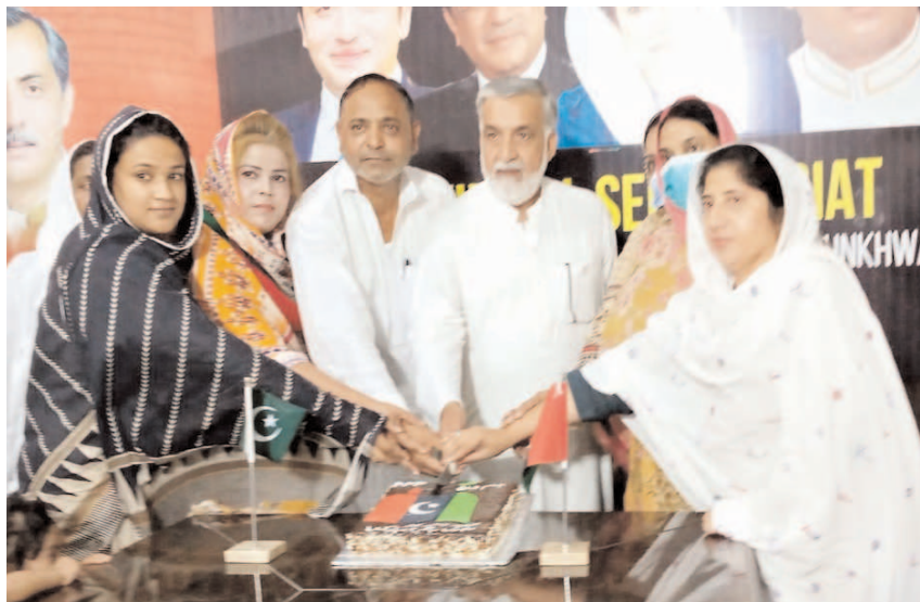
PESHAWAR: Workers of PPP cutting cake on 70th birth anniversary of Shaheed Mohtarma Benazir Bhutto.