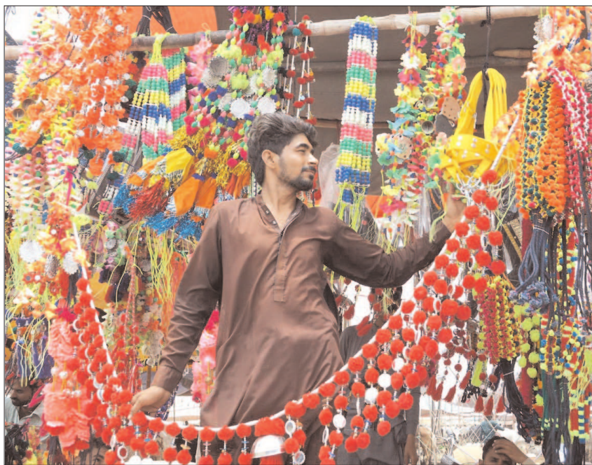
HYDERABAD: Vendors displaying colourful garlands for decorating sacrificial animals to attract customers.