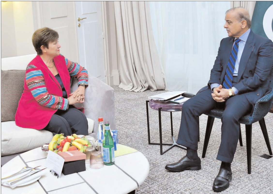
PARIS: Prime Minister Shahbaz Sharif exchanging view with Managing Director, International Monetary Fund Kristalina Georgieva.

Vol. XXXIX No. 156 Regd. No. 241 ZIL HAJJ 04 1444 -- FRIDAY, JUNE 23 2023 PESHAWAR EDITION 08 PAGES PRICE. 30